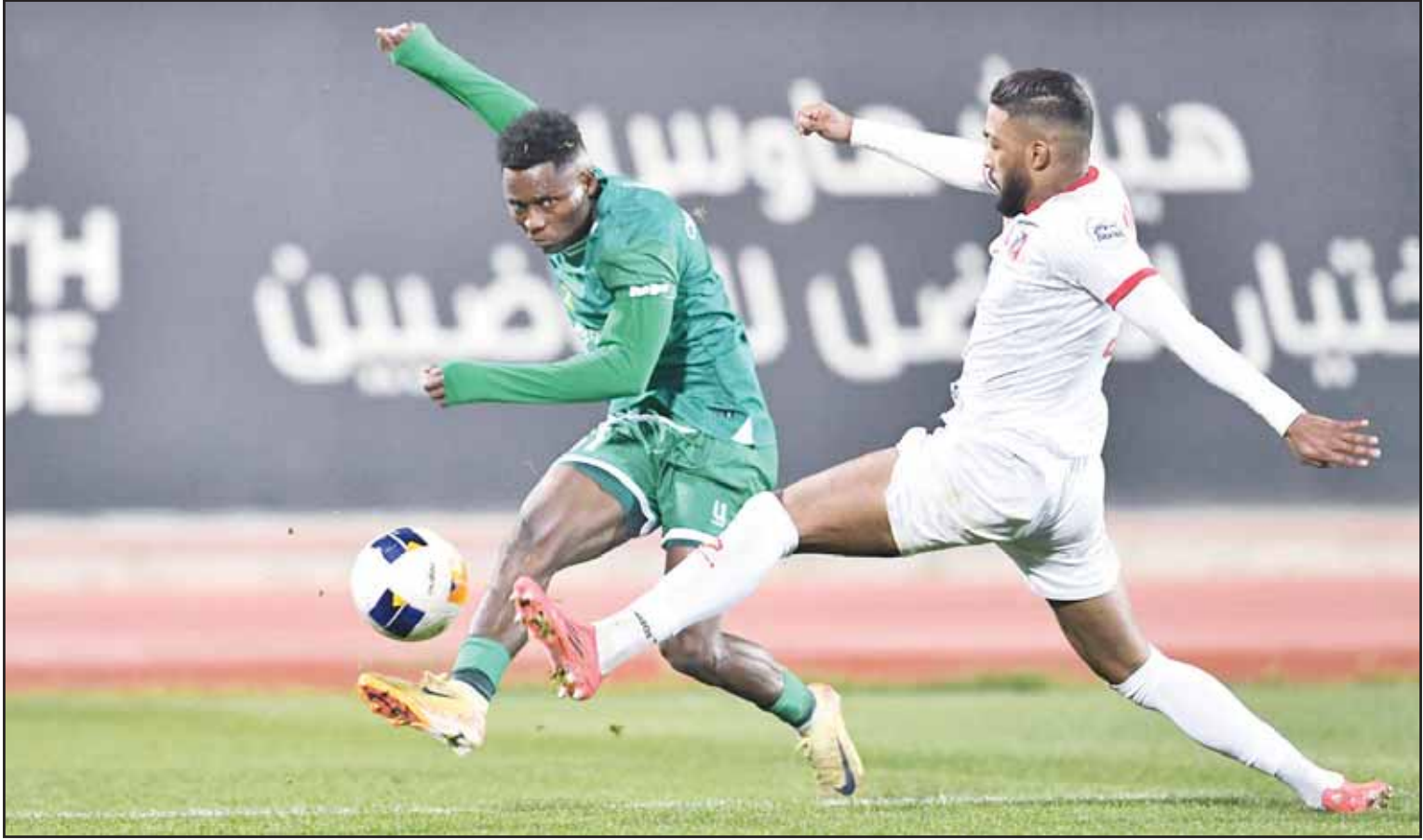
In this file photo Al Arabi player shoots the ball as Kuwaiti player defends during the league game.