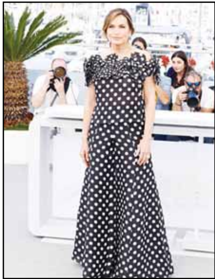
Zhou Ye poses for photographers upon arrival at the premiere of the film 'Nouvelle Vague.'