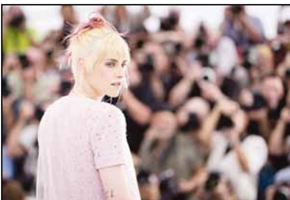
Director Kristen Stewart poses for photographers at the photo call for the film 'The Chronology of Water' at the 78th international film festival, Cannes, southern France, Friday, May 16.

Stewart's first steps as a director came eight years ago with the short "Come Swim," which she also premiered in Cannes,