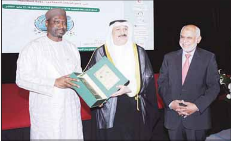
Photos during the 17th International Conference of the Islamic Organization for Medical Sciences (IOMS), with the theme, ‘Genetic Imprinting and Gene Editing in the Age of Artificial Intelligence: An Islamic Perspective’.

for supporting such a significant scientific and religious conference. He emphasized that this support reflects the enlightened vision of the Kuwaiti leadership in promoting the integration of religion and Science to overcome contemporary medical challenges.