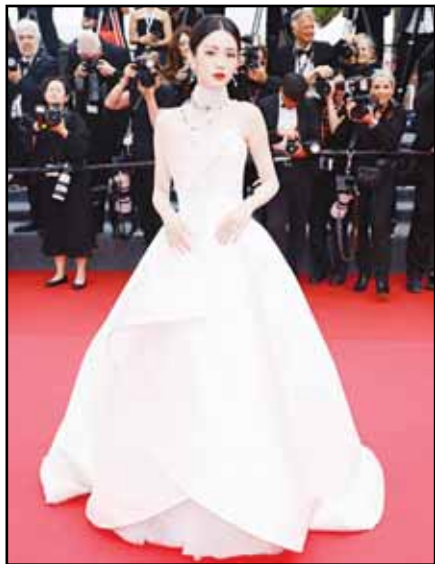
Zhou Ye poses for photographers upon arrival at the premiere of the film 'Nouvelle Vague.'