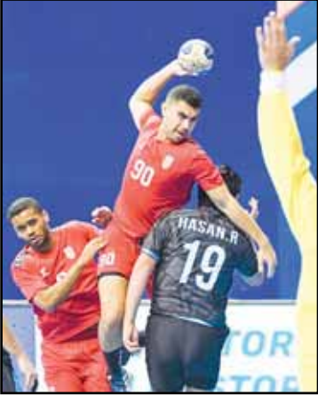
A file photo of players in action.

Meanwhile, the Association has also revised the match schedule for the First Division League. The ninth round kicks off today, with Al-Qurain playing Khaitan at 5:00 pm and Fahaheel facing Al-Sahel at 6:30 pm.