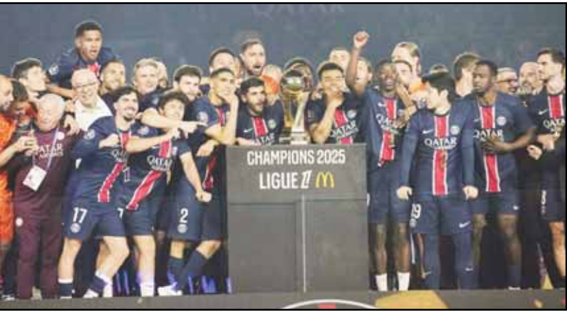
Paris Saint Germain players pose with the trophy as they celebrate PSG’s French League One title after the League One soccer match between Paris Saint-Germain and Auxerre at the Parc des Princes stadium in Paris.

Former Manchester United forward Greenwood’s 20th and 21st goals helped him finish joint top-scorer in the league with PSG’s Ousmane Dembélé. Under the league rules, Dembélé will take the trophy because he scored less penalties than Greenwood.