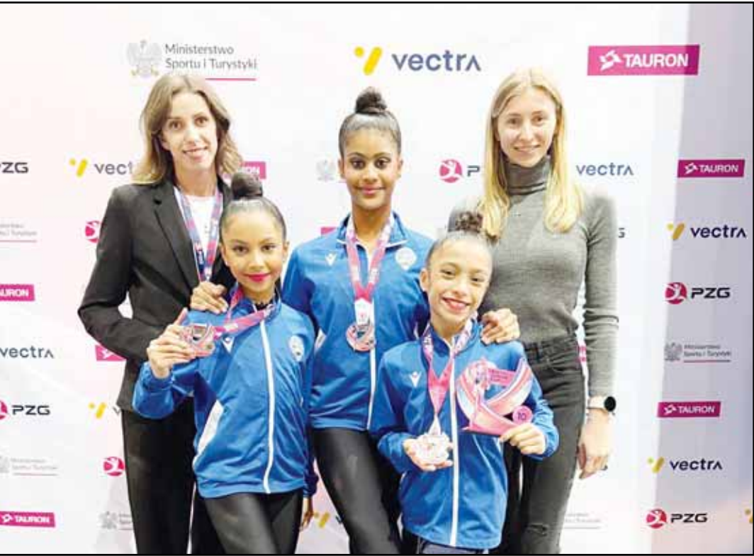
Gymnastics champions celebrate their victories with coaches.

The Federation emphasized the significance of competing in a tournament that featured top-tier athletes from across the globe, including countries such as Belgium, France, Germany, Italy, Japan, Spain, and the host nation, Poland. Other participating countries included the Czech Republic, Finland, Greece, Lithuania, Luxem-