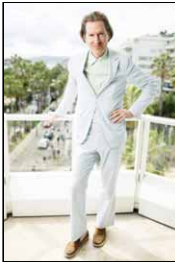
Director Wes Anderson poses for portrait photographs for the film 'The Phoenician Scheme' at the 78th international film festival, Cannes, southern France, Saturday, May 17.

Anderson: If I were to say what is the first idea of the movie, it is that face. It's not an image of the setting, it's an image of Benicio in a close-up as this character. His face is just so expressive and interesting. It's a special advantage he has. He's quite mesmerizing just looking at him on camera, his chemistry with the exposure of film. In "The French Dispatch," there were electric moments on the set. But the electricity was amplified when we went back into the cutting room. The wheels started turning. When we showed "The French Dispatch" however many years ago in Cannes, I did mention to Benicio there,