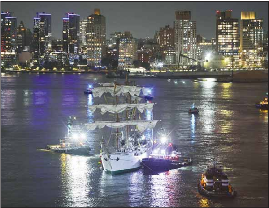
Tug boats assist the Cuauhtémoc, a masted Mexican Navy training ship, toward Pier 35 after it collided with the Brooklyn Bridge on May 17, in New York.