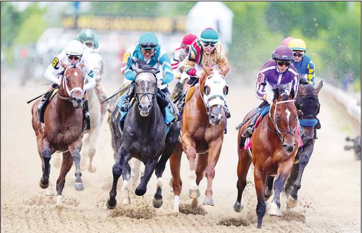
Horses compete during the 150th running of the Preakness Stakes horse race at Pimlico Race Course in Baltimore.