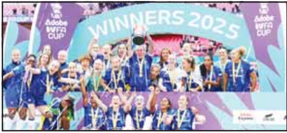
Chelsea's Millie Bright, center, lifts the trophy with teammates following victory in the English Women's FA Cup Final soccer match against Manchester United at Wembley Stadium, London.