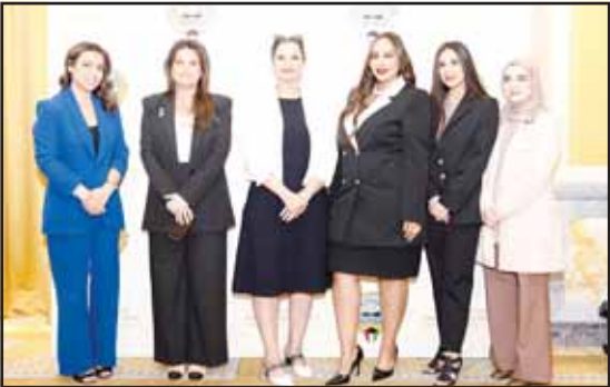
A group photo of female leaders at Burgan Bank who participated in Kuwait Women’s Day forum.