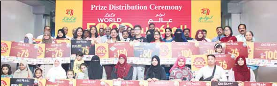
Winners of LuLu World Food Festival.

positions, making Burgan Bank a leading financial institution in the local Kuwaiti market. Our current position aligns with the national vision for boosting female representation in public and private sectors.” It is worth mentioning that Burgan Bank continues to invest in initiatives that support the growth of female employees at all levels. In 2024, employees received an average of 33 hours of training, delivered through both digital and in-person platforms. Programs like Empower Her and Lean-In Circle for Women Empowerment provide dedicated mentorship, professional skills, and networking opportunities to help women work toward their goals. Burgan Bank remains committed to enabling more women to pursue leadership positions and guide younger generations of women professionals to follow their lead.