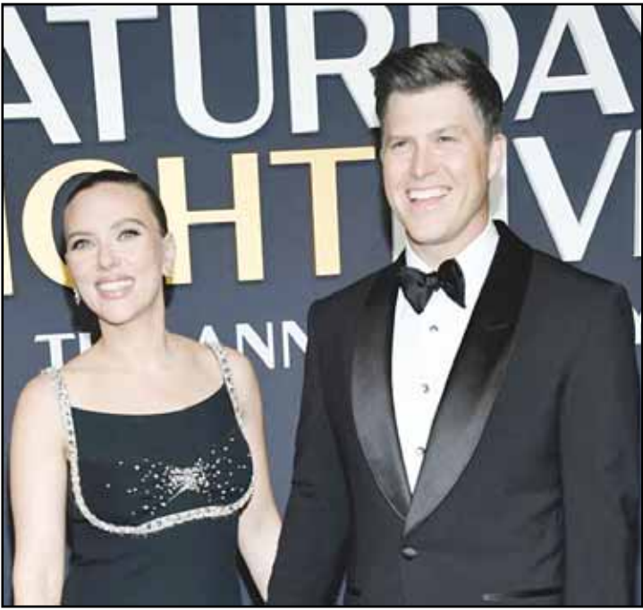
Scarlett Johansson, (left), and Colin Jost attend ‘SNL50: The Anniversary Special’ at Rockefeller Plaza on Sunday, Feb. 16, 2025, in New York.

the-scenes bit where Johansson has torrid sex with Yang after she confesses to Nwodim and Gardner that she has a crush on him, and learns he has only been publicly pretending to be gay “for the clout.” Johansson has her heart broken when she learns Yang also has been hooking up with Nwodim, Gardner and guest star Emily Ratajkowski. In another behind-the-scenes digital short made by the three members of comedy group Please Don’t Destroy, Johansson treats the trio to a first-class flight that becomes a luxe hip-hop video until the men panic when they learn they are landing at the troubled airport of Newark, New Jersey. Musical guest Bad Bunny appears as an air traffic controller, working alone on his first day. As in nearly every episode of this season, James Austin Johnson did his impression of President Donald Trump in the cold open segment, which had him “finding love” with Saudi Arabia’s Crown Prince Mohammed bin Salman. Johnson’s Trump broke the fourth wall and walked into the audience at the end of the bit. “It’s the ‘SNL’ finale, season 50 - worst one yet!” he said. “See you again in the fall if we still have a country. It’s a coin toss.”