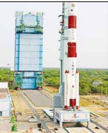
This photo released by Indian Space Research Organization shows the EOS-09 Earth observation satellite on board the PSLV-C61 launch vehicle at Sriharikota space center in southern India, Saturday, May 17.