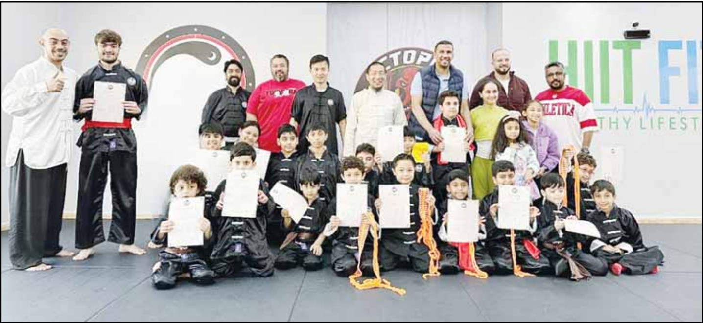
Participants pose for a group photo.