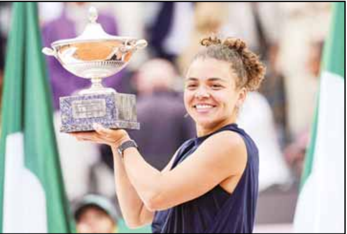
Jasmine Paolini of Italy, poses with the trophy after winning the Italian Open tennis tournament at the Foro Italico in Rome.

Monica Seles in 1990 was the last woman to sweep Rome’s singles and doubles titles in the same year.