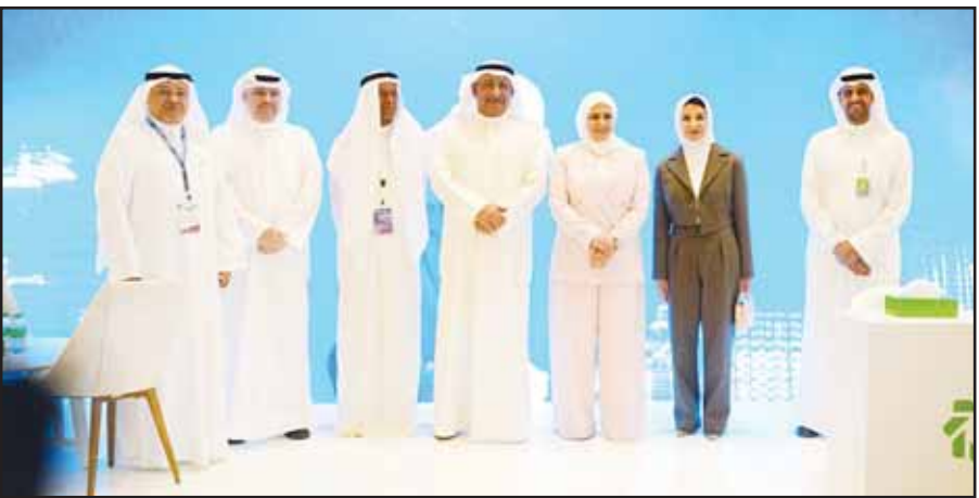
Minister Noura Al-Fassam at the bank’s pavilion.

The conference aims to accelerate the implementation of development projects and Kuwait’s vision by engaging the private sector in execution plans. This aligns with the global trend, where both developed and developing countries adopt the PPP model as a means of concerted efforts for national progress. The model ensures optimal utilization of