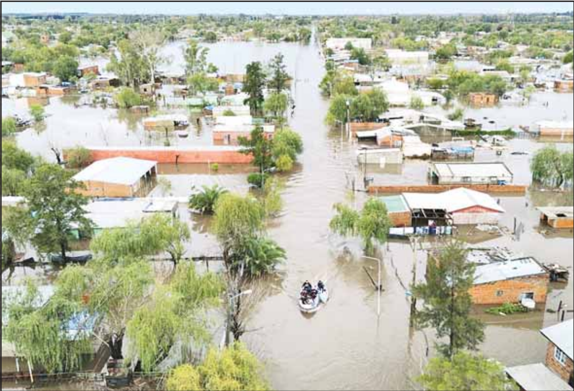
Boats move through flooded streets after heavy rains in Campana, Argentina on May 17.