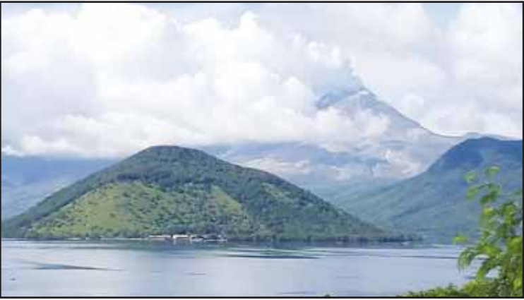
Mount Lewotobi Laki Laki spews volcanic materials in the air in East Flores, Indonesia on March 21.

JAKARTA: One person died, at least 19 others went missing, and four sus-