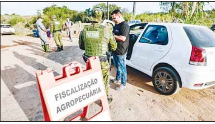
Health and safety agents setting up disinfection barriers to contain the first confirmed case of bird flu in commercial poultry, in the municipality of Montenegro, Rio Grande do Sul state, Brazil, Saturday, May 17.