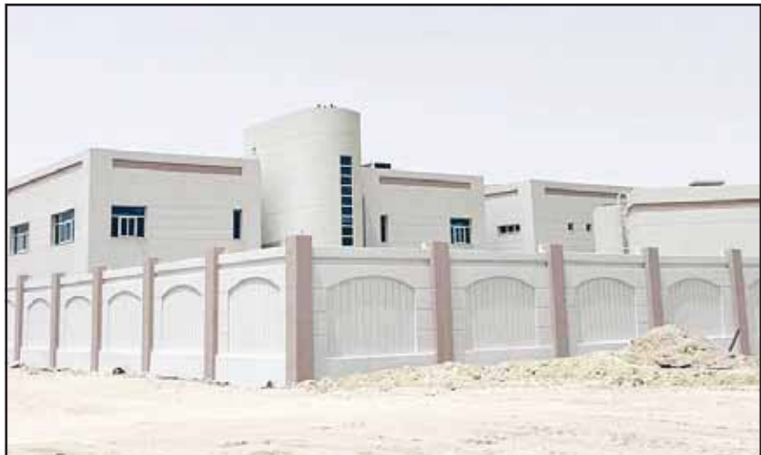
A housing complex in Al-Mutla'a nears completion

Competition to streamline prices of housing units