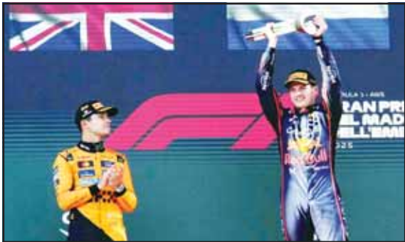
Red Bull driver Max Verstappen of the Netherlands celebrates on the podium after winning the Italian Emilia-Romagna Formula One Grand Prix, as McLaren driver Lando Norris of Britain looks on, at the Enzo and Dino Ferrari racetrack in Imola, Italy.

IMOLA, Italy, May 18, Max Verstappen gave his Formula 1 title defense a big boost with victory at the Emilia-Romagna Grand Prix on Sunday after a daring overtake on standings leader Oscar Piastri at the start.