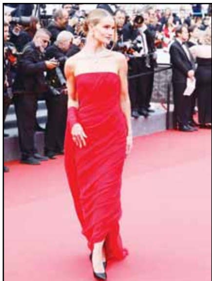
Rosie Huntington-Whiteley poses for photographers upon arrival at the premiere of the film 'Nouvelle Vague' at Cannes, May 17.