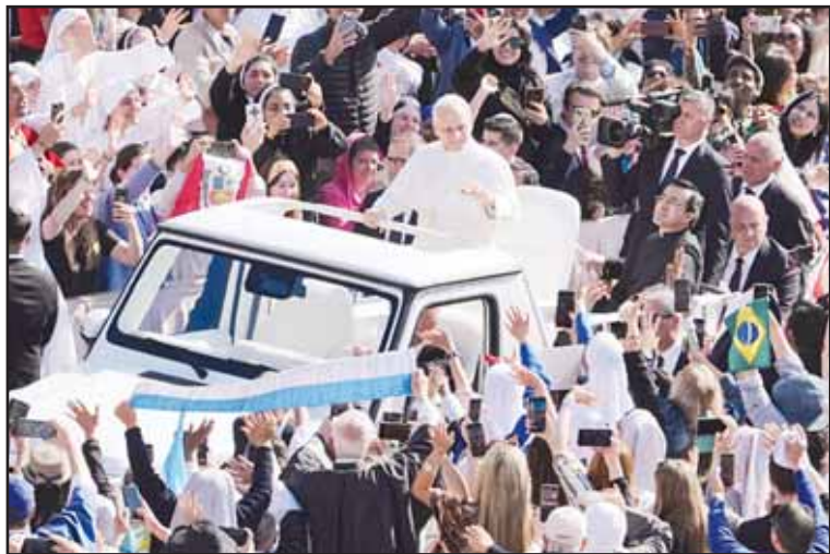
Pope Leo XIV, on his popemobile, tours St. Peter's Square at the Vatican prior to the inaugural Mass of his pontificate on May 18.

AP wasn’t able to confirm that number. Madrid city council officials, meanwhile, said that the Spanish capital’s social service teams had helped 94 individuals in April with ties to the city, 12 of whom were rehabilitated into municipal shelters, addiction treatment centers or independent living.