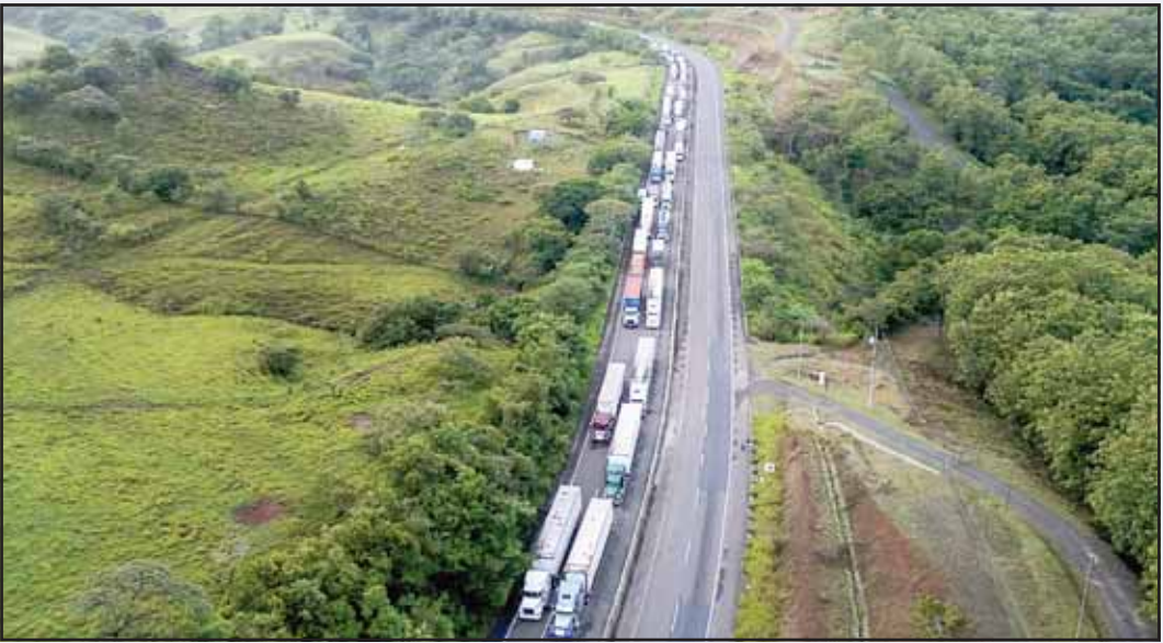
Vehicles back up on the Pan-American Highway, blocked by anti-government protesters opposing social security reforms and a Panama-U.S. memorandum concerning the Panama Canal, in El Piro, Panama on May 14.

Also: NEW DELHI: At least two people died and a few others were trapped under the debris of an under-construction house which collapsed in Delhi’s Paharganj area on Saturday, according to Delhi Police. While two dead bodies had been recovered, efforts were on to bring out those still trapped under the rubble, said the local police. The Delhi Fire Service rushed four fire brigades to the site of the incident to carry out relief and rescue work. Further details were awaited.