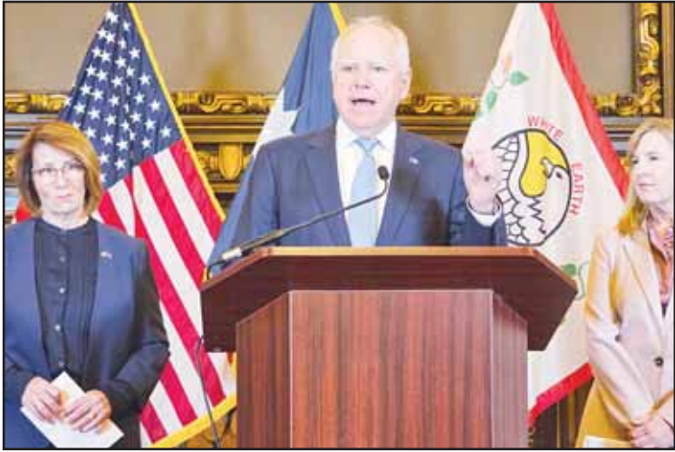
Minnesota Governor Tim Walz and leaders of the Minnesota Legislature announce a budget deal during a news conference at the state Capitol on Thursday, May 15, 2025, in St. Paul, Minn.

Pete Buttigieg, the former transportation secretary, wasn’t nearly as blunt but still stopped short of defending Biden’s decision to run. He re-