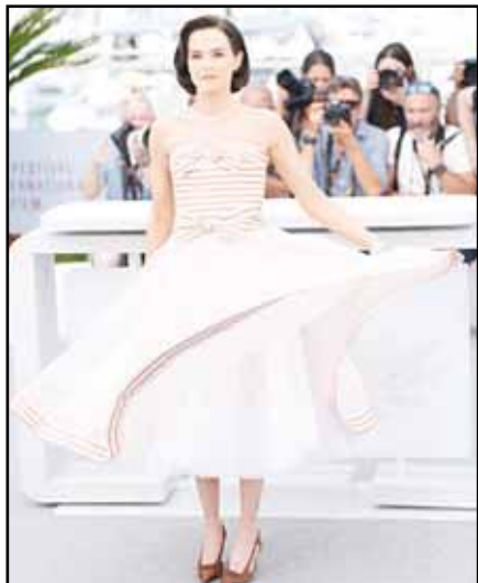
Zoey Deutch poses for photographers at the photo call for the film 'Nouvelle Vague.'