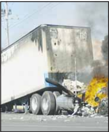
A truck burns on a street in Culiacan, Sinaloa state on Jan 5, 2023.