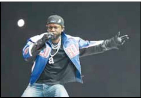
Kendrick Lamar performs during halftime of the NFL Super Bowl 59 football game between the Kansas City Chiefs and the Philadelphia Eagles, Feb. 9, 2025, in New Orleans.

Kevin Hart is expected to bring the funny as host of the awards show, celebrating its 25th anniversary.