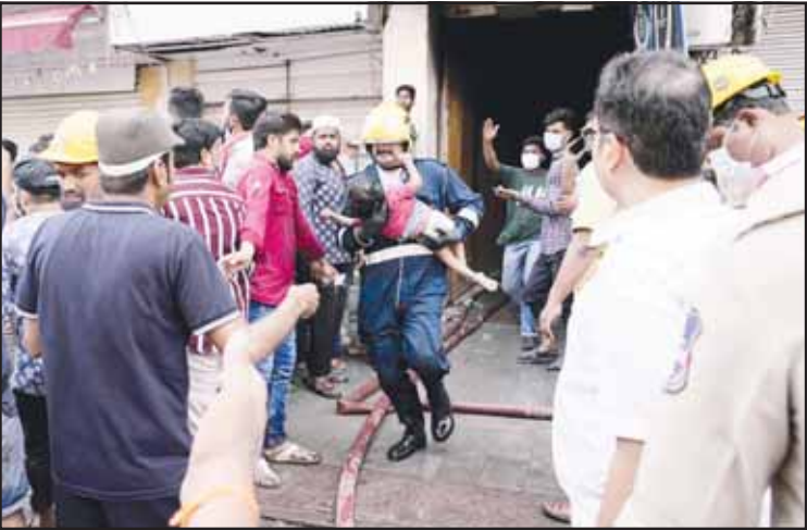
A young child, who was injured when a building caught fire near the Charminar area in Hyderabad, is carried by a rescuer on an ambulance, India on May 18.

NEW DELHI, May 18, (Agencies): At least 17 people were killed and many others injured Sunday after a massive fire broke out in a building in the southern Indian city of Hyderabad, officials said. The fire broke out in the morning inside a residential building in Gulzar House near the iconic Charminar area of the city. “The fire broke out around 6:00 am and by 6:16 am, the fire department was present at the spot. They tried to save people trapped inside, but the fire had engulfed the entire building,” local government minister Ponnampal Prabhakar told media. Officials said most of the victims were killed in their sleep and the efforts to douse the fire are underway. Preliminary investigations carried out by the police suggest that a short circuit might have caused the fire.