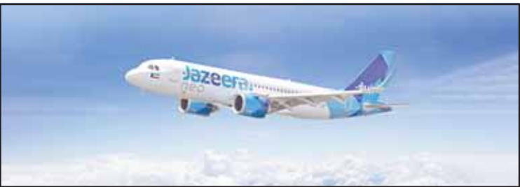
Jazeera Airways plane soars in the skies.

KUWAIT CITY, May 18: Jazeera Airways, Kuwait’s leading low-cost airline is inviting travelers to experience a summer like never before with an exclusive limited-time sale featuring one-way fares starting from just KD 19 to Bahrain, Iran, Jordan, UAE, KSA (Jeddah and Taif) and Qatar. Flights to India, Pakistan, Nepal and Sri Lanka, will start from KD 25 and Egypt (Cairo, Sharm El-Sheikh and Sphinx) from KD 30, while Lebanon, Oman, Kazakhstan, Kyrgyzstan, Georgia and Armenia will be from KD 29. One-way fares to European destinations such as Hungary and Czech Republic will start from as low as KD 32. The sale, open for booking from May 19th to 22nd, is valid for travel until August 31st, offering travelers the perfect chance to reconnect with loved ones or explore new destinations – without straining their budgets – with direct flights from Kuwait, passengers can avoid lengthy layovers and maximize their time at their destination. Featuring over 700,000