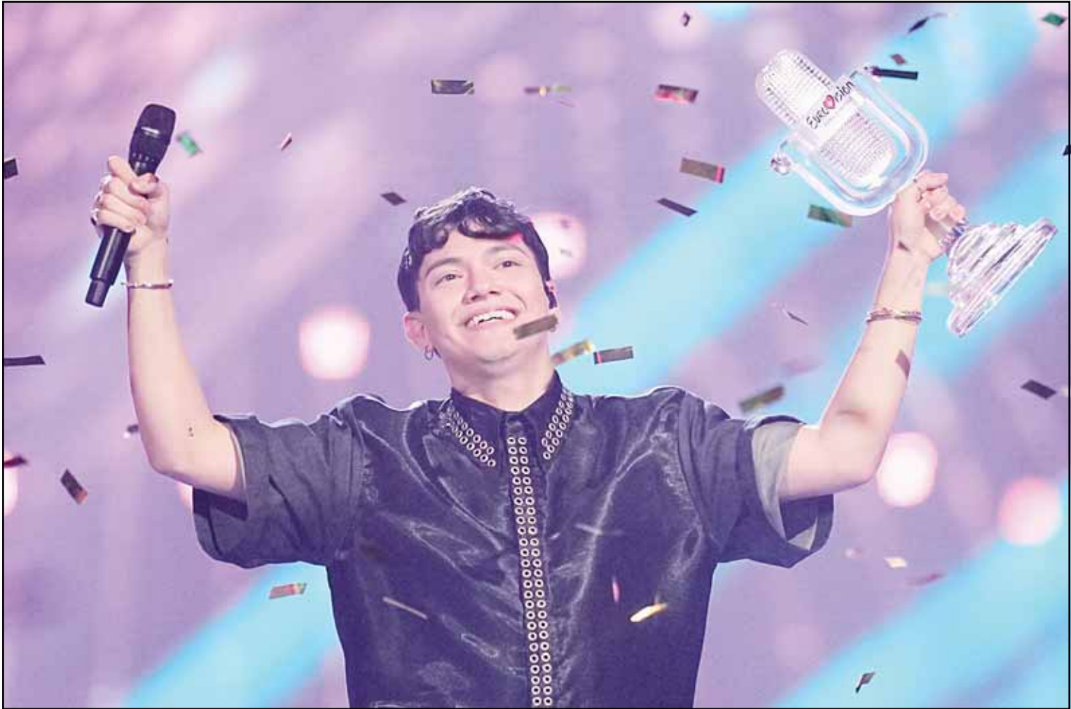
Winner of the Eurovision Song Contest JJ from Austria holds up the trophy onstage, he won with the song ‘Wasted Love’ during the Grand Final of the 69th Eurovision Song Contest, in Basel, Switzerland, early Sunday, May 18.