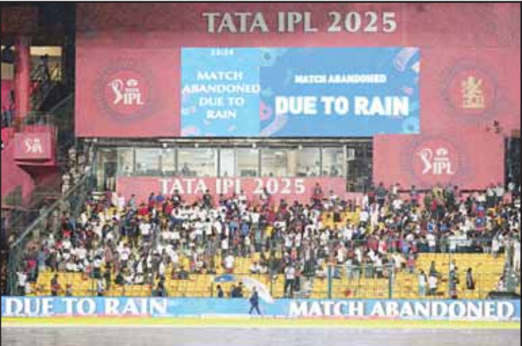
A digital display announces that the Indian Premier League cricket match between Kolkata Knight Riders and Royal Challengers Bengaluru is abandoned due to the rain, at Chinnaswamy Stadium in Bengaluru, India.

Monday. Fans arrived in great numbers wearing a white jersey to honor the ace batter, who played 123 tests for India and finished just short of 10,000 test runs. Kohli has 505 runs in this IPL, for fourth highest. However, he never stood a chance of batting at home thanks to incessant rain in Bengaluru since Friday evening. The Royal Challengers have two remaining round-robin games against Sunrisers Hyderabad on May 23 and Lucknow Super Giants on May 27. Kolkata's last game is against already-eliminated Hyderabad on May 25. Sunday's doubleheader features Rajasthan Royals hosting Punjab Kings in Jaipur, and Delhi Capitals taking on Gujarat Titans in New Delhi. Rajasthan is out of knockouts contention, while the other three sides are still alive.