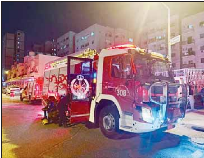
Left: Fire brigade at the site and damage caused by the fire.

Authorities disclosed that around 300 of the 3,374 cases recorded in 2024 involved individuals caught bringing banned substances into the country upon arrival. Some of these cases were dismissed due to lack of evidence or the defendants’ good faith, while others were referred to court for further legal action.