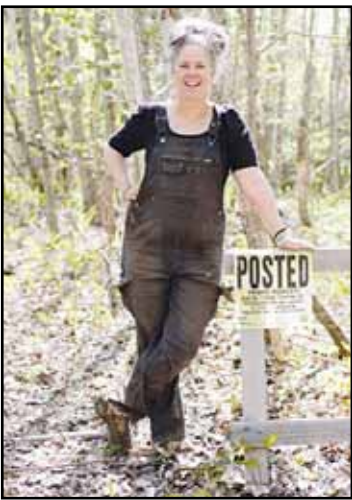
Heather Donahue, the star of the 1999 low-budget hit movie The Blair Witch Project, poses next to a ‘posted’ sign in on a rural road, Tuesday, May 13, in Freedom, Maine.

Donahue said she came to the Pine Tree State eight years ago, overcame her addiction and bought land in Freedom in 2020. Recently, she has worked as a life coach and shared her passions for gardening and medicinal plants with anyone who will listen.