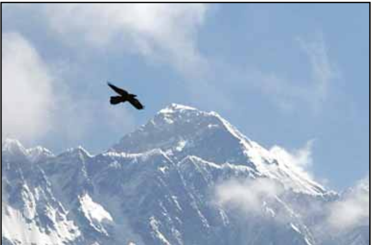
A bird flies in the backdrop of Mount Everest, as seen from Namche Bajar, Solukhumbu district, Nepal on May 27, 2019.