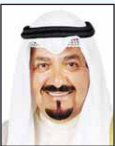
HH the PM