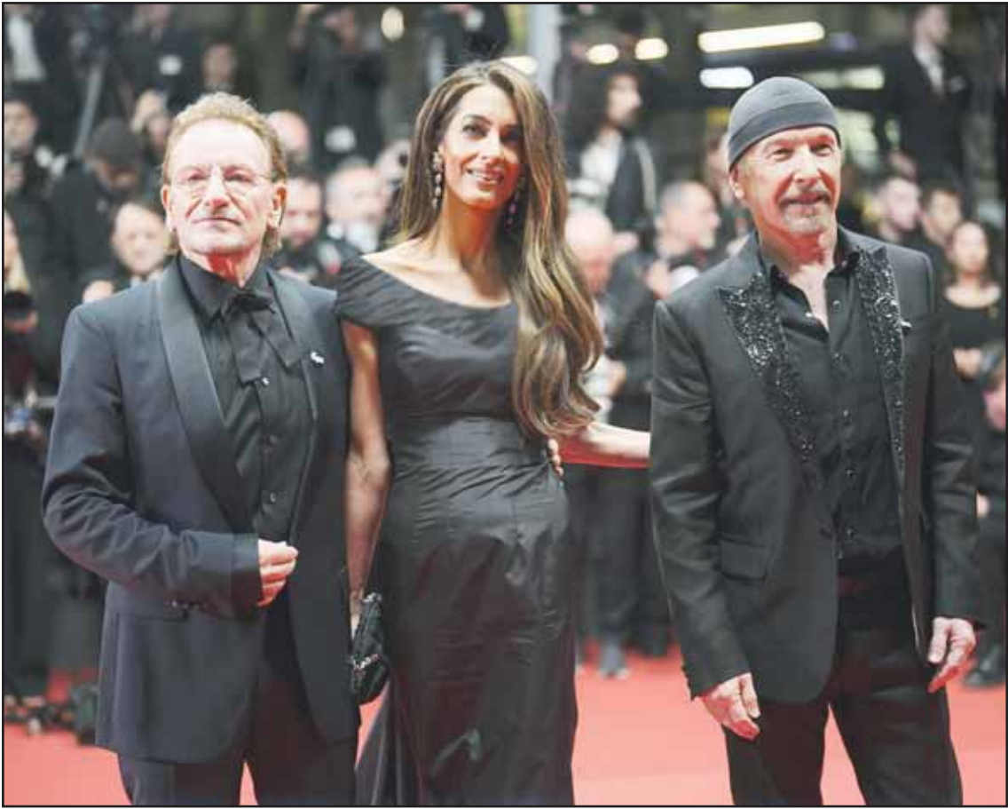
Bono, (from left), Amal Clooney and The Edge pose for photographers upon arrival at the premiere of the film 'Bono: Stories of Surrender' at the 78th international film festival, Cannes, southern France, Friday, May 16.

those animal spirits that can be drummed up. This is me speaking about surrender, "Stories of Surrender," at a time when the world has never been closer to a world war in my lifetime. At first I think it looks absurd, a bit ridiculous - now that has never stopped me in the past - but I think it's OK to look ridiculous for these ideas. Like surrender, nonviolence, peace.