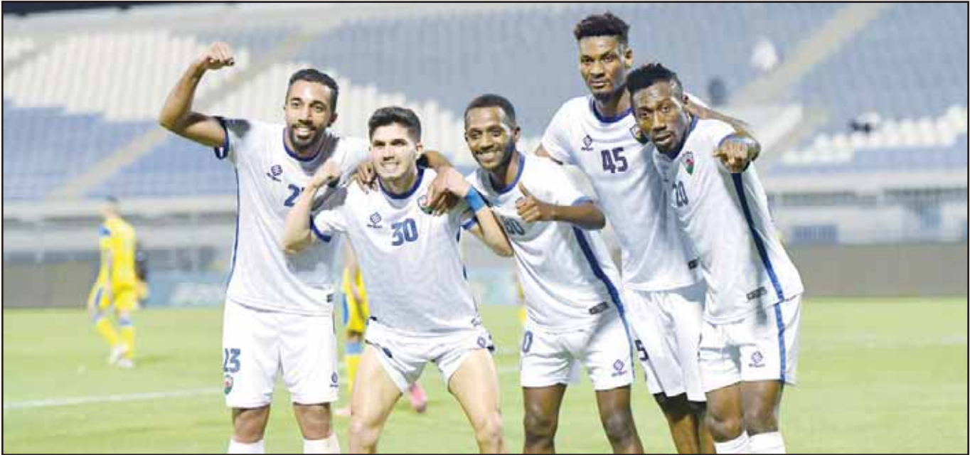
Al-Jahra players celebrate.

KUWAIT CITY, May 17: Al-Jahra will officially be crowned champions of the Zain First Division League tonight when they face Sulaibikhat at 7:10 PM in the 20th and final round of the season. Simultaneously, Burgan will take on Al-Sahel in a decisive match at Al-Shabab Stadium. Al-Jahra secured the league title and promotion to the Zain Premier League after defeating Al-Sahel 2-0 last in Round 19, raising its tally to 25 points and making tonight’s match a celebratory outing. The battle for second place – and a potential promotion opportunity –