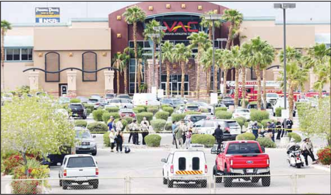
Las Vegas Metro Police officers are shown in front of a Las Vegas Athletic Club after a shooting on May 16, in Las Vegas.