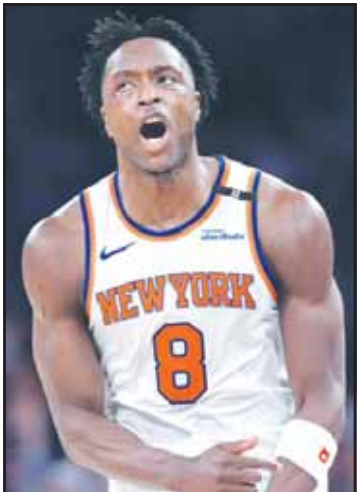
New York Knicks’ OG Anunoby (8) celebrates after making a three-point shot during the second half of Game 6 in the Eastern Conference semifinals of the NBA basketball playoffs against the Boston Celtics in New York.

NEW YORK, May 17, Jalen Brunson and the New York Knicks viewed reaching the Eastern Conference finals as just another step in a season that’s not over. It’s not time to celebrate. Try telling that to the thousands of fans dancing and chanting inside and on the streets all around Madison Square Garden. The Knicks reached the conference finals for the first time in 25 years and ended the one-year NBA title reign of the Boston Celtics with astonishing