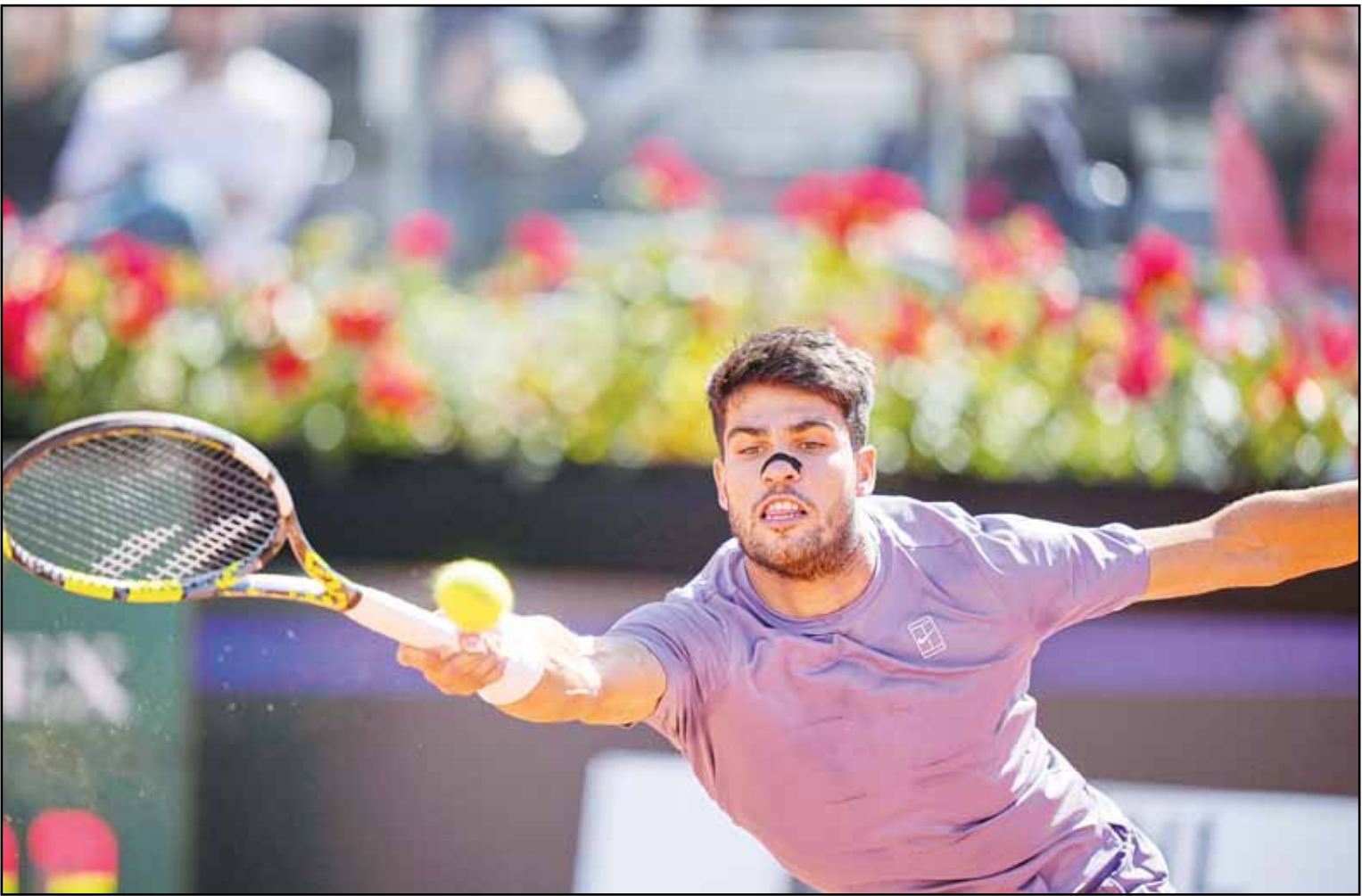
Spain’s Carlos Alcaraz returns the ball to Italy’s Lorenzo Musetti during their semifinal tennis match at the Italian Open, at the Foro Italico in Rome.