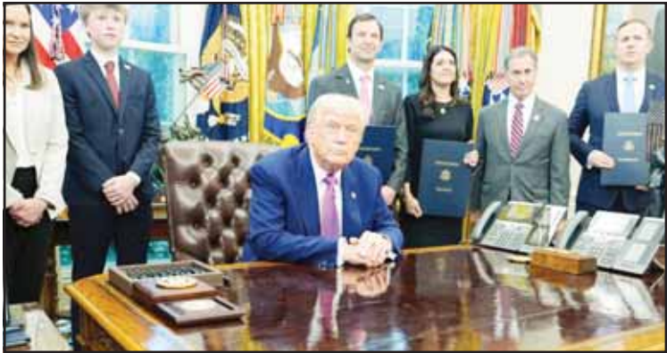
US President Donald Trump speaks with reporters in the Oval Office of the White House in Washington.

expect federal deficits to widen, reaching nearly 9% of (the U.S. economy) by 2035, up from 6.4% in 2024, driven mainly by increased interest payments on debt, rising entitlement spending, and relatively low revenue generation." Extending President Donald Trump's 2017 tax cuts, a priority of the Republican-controlled Congress, Moody's said, would add $4 trillion over the next decade to the federal primary deficit (which does not include interest payments). A gridlocked political system has been unable to tackle America's huge deficits. Republicans reject tax increases, and Democrats are reluctant to cut spending. On Friday, House Republicans failed to push a big package of tax breaks and spending cuts through the