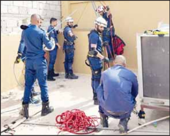
KFF personnel during the maid’s rescue bid.

The campaign resulted in the issuance of 474 traffic citations, and the arrest of five individuals for violating residency and labor laws, seven individuals wanted for criminal cases, two individuals for lacking a driving license, two reported as absconding. Two vehicles wanted by the judiciary, and a motorcycle were impounded. In addition, two individuals were arrested for failing to comply with Criminal Court’s rulings, and one person was referred to the traffic police.