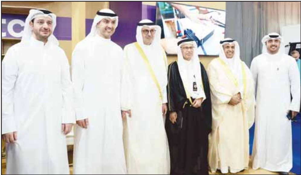
Dr. Subaih Al-Mukhaizeem at the stc pavilion.

KUWAIT CITY, May 17: Kuwait Telecommunications Company - stc, a world-class digital leader providing innovative services and platforms to customers, enabling the digital transformation in Kuwait, participated as a Diamond Sponsor in the Kuwait Sustainable Energy Week ('KSEW') conference and exhibition organized by the Ministry of Electricity, Water, and Renewable Energy in collaboration with the Regional Center for Renewable Energy and Energy Efficiency ('RCREEE'). The conference and exhibition were held under the patronage of His Excellency Dr. Subaih Abdulaziz Al-Mukhaizeem, Minister of Electricity, Water, and Renewable Energy at the Kuwait International Fairgrounds in Mishref. stc's sponsorship and participation align with the Company's comprehensive sustainability and corporate social responsibility frameworks, which aim to support national energy goals through innovative technologies that contribute to environmental stewardship.