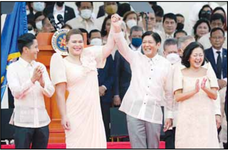
US President Ferdinand Marcos Jr. (center right), and Philippine Vice President Sara Duterte, daughter of former Philippine president Rodrigo Duterte, greet during the inauguration ceremony at National Museum on June 30, 2022 in Manila, Philippines.