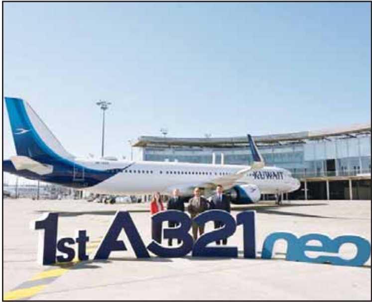
Kuwait Airways marked the delivery of its first new A321neo aircraft from Airbus.

that Kuwait Airways received the new aircraft from Airbus, reflecting the depth of the partnership and cooperation between the two countries. Al-Shaheen made this statement to KUNA after participating in the ceremony marking Kuwait Airways' receipt of its first new A321neo aircraft from Airbus in Toulouse, France. He asserted "we are proud of this occa-