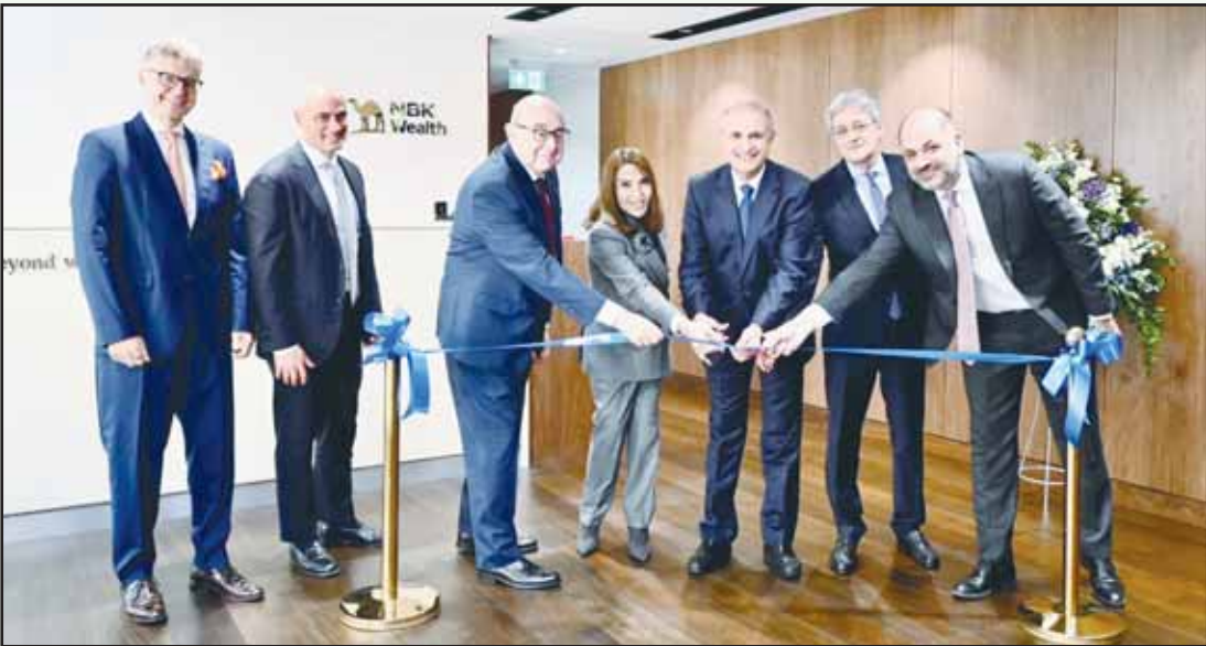
NBK Wealth opens upgraded London office for elite clients.

NBK's London building, offers enhanced client meeting spaces and upgraded technological infrastructure. This investment in a modern and accessible environment will further enable the NBK Wealth team in London to deliver tailored financial solutions and personalized support to meet the evolving needs of its valued clientele. NBK Wealth remains dedicated to fostering strong relationships with its clients. In addition to its selective range of banking products, the London office offers residential and commercial real estate finance to our esteemed clients who are seeking property investments in the UK guiding them through the financing process. Knowing the importance of preservation of family wealth and planning, our dedicated team of Trust professionals in London can assist clients with their succession planning requirements to ensure a secure and seamless transition of wealth to future generations. NBK Wealth remains steadfast in its dedication to fostering strong relationships with its clients in Kuwait and KSA. This investment in a dedicated and upgraded space within the London office will further strengthen NBK Wealth's ability to deliver tailored wealth management solutions. All existing contact details, including phone numbers and email addresses, will remain the same, ensuring a smooth transition for clients. NBK Wealth is one of the pillars of NBK Group and a pioneer wealth management group in the