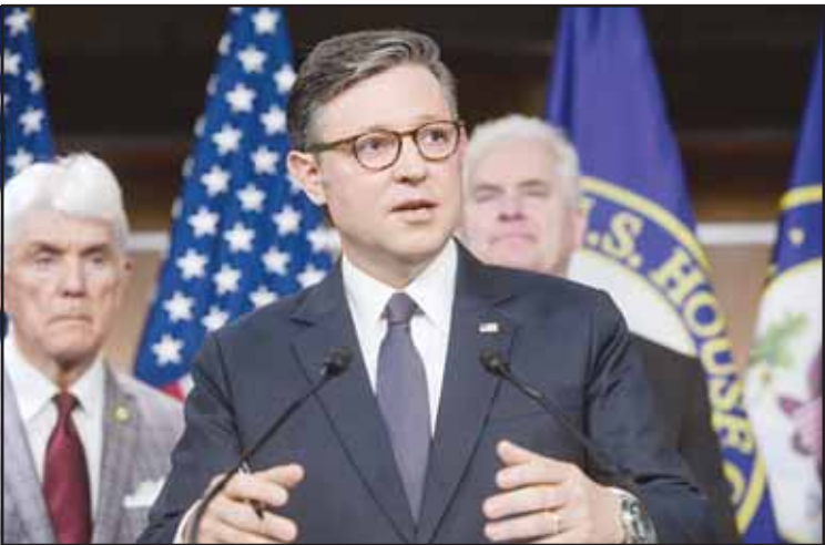
US Speaker of the House Mike Johnson, R-La., speaks during a news conference at the Capitol on May 6, in Washington.

lawmakers from high-tax states including New York are demanding a deeper tax deduction, known as SALT, for their constituents. Four Republican conservatives initially voted against the package - Roy and Reps. Ralph Norman of South Carolina, Josh Brecheen of Oklahoma, Rep. Andrew Clyde of Georgia. Then one, Rep. Lloyd Smucker of Pennsylvania, switched his vote to no in a procedural step so it could be reconsidered later, saying afterward he was confident they’d “get this done.” Norman insisted he was not defying the president - “this isn’t a ‘grandstand,’” he said - as he and the others push from Trump’s priorities.