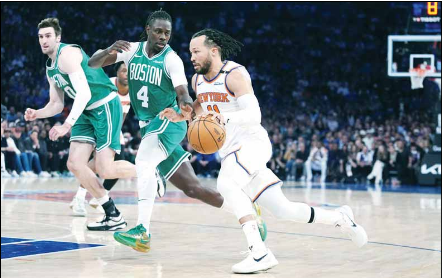
Boston Celtics’ Jrue Holiday (4) defends New York Knicks’ Jalen Brunson (11) during the first half of Game 6 in the Eastern Conference semifinals of the NBA basketball playoffs in New York.

“We didn’t have the same team this year that we had last year,” Celtics guard Derrick White said. “Every year, it’s a different team. We had a goal at the beginning of the year, and we fell short.” New York blew it open with a 13-3