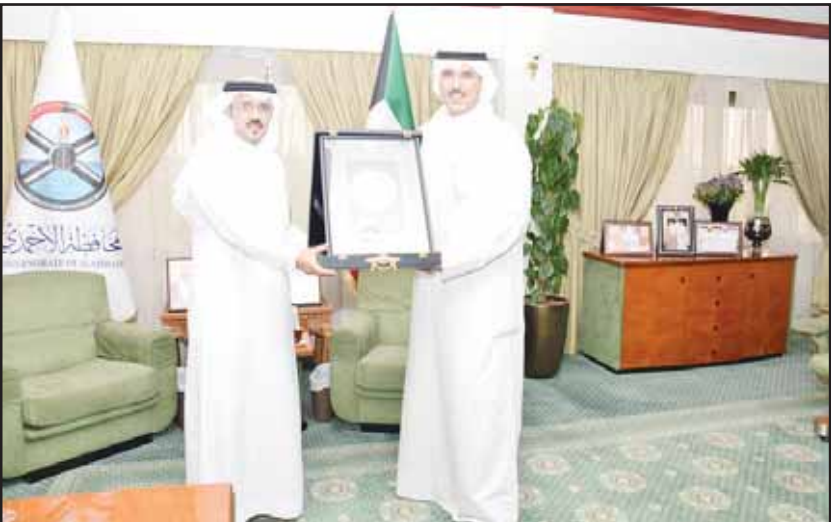
Ahmadi Governor presents a commemorative gift to the Governor of Rijal Almaa.

Promo period from 1st May to 31st May 2025 Terms & conditions apply*