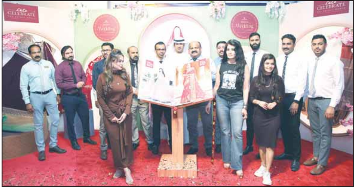
Lulu officials and guests who attended the launch ceremony.