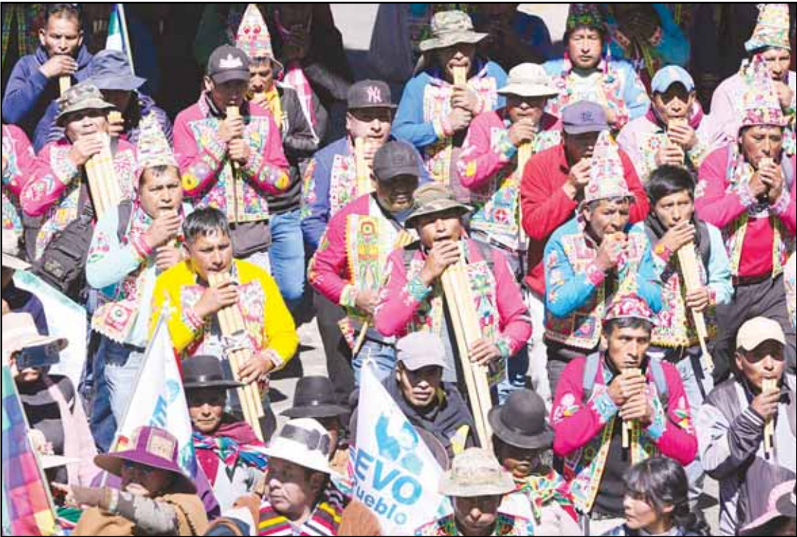
Quechua musicians play flutes in support of former president Evo Morales during a march to the Electoral Tribunal offices in El Alto, Bolivia on May 16.

caused by Yoon’s botched martial law bid, his impeachment, and his permanent removal from office. Yoon asked the public to join forces with Kim Moon-soo, presidential candidate of the People Power Party, and cast their ballots in the June 3 election to safeguard freedom, sovereignty, and prosperity.