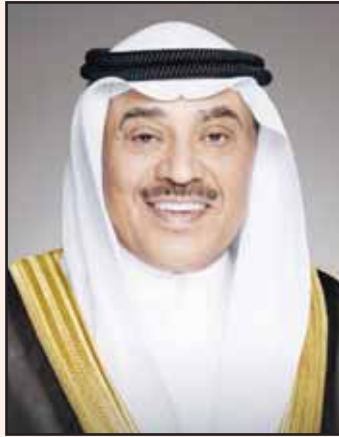
His Highness the Crown Prince

KUWAIT CITY, May 17, (KUNA): His Highness the Amir Sheikh Meshal Al-Ahmad Al-Jaber Al-Sabah, marking Kuwait Woman Day on Friday, expressed pride of the noticeable contributions by the women in building and developing the dear homeland.