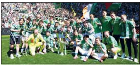
Celtic players celebrate with the Scottish Premiership trophy, after a Scottish Premiership soccer match against St Mirren at Celtic Park, in Glasgow, Scotland.