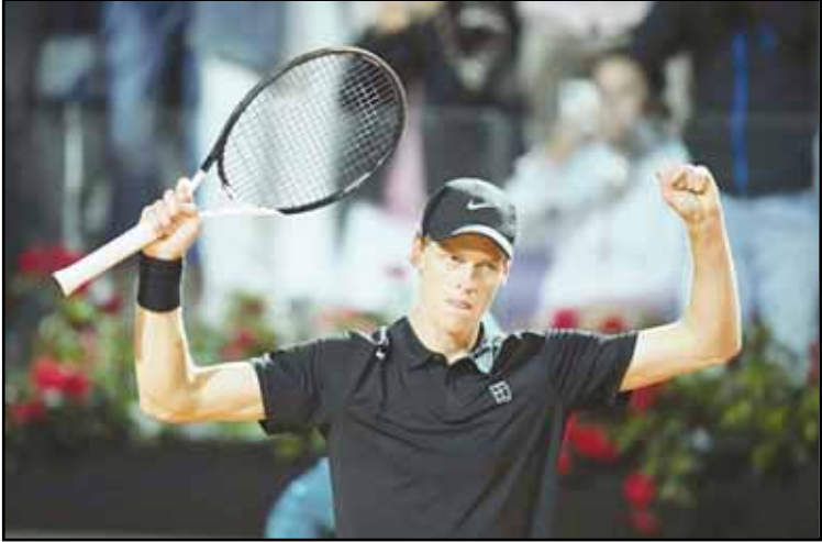
Italy’s Jannik Sinner celebrates after winning the semifinal tennis match against Tommy Paul, of the United States, at the Italian Open in Rome.