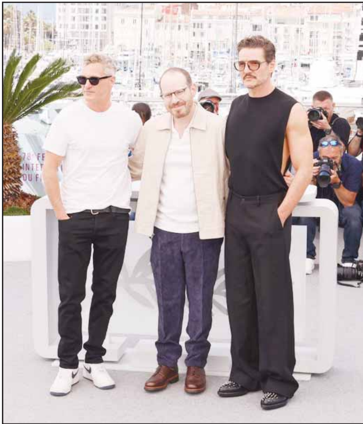
Joaquin Phoenix, (from left), director Ari Aster and Pedro Pascal pose for photographers at the photo call for the film 'Eddington' at the 78th international film festival, Cannes, southern France, Saturday, May 17.

For now, though, we can say we'll always have when Sacha Baron Cohen, for "The Dictator," rode a camel down the Croisette. Ah, the memories.