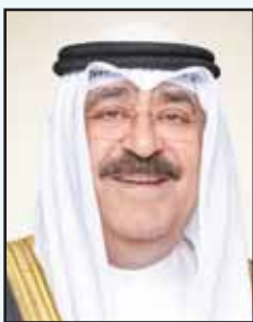
HH the Amir