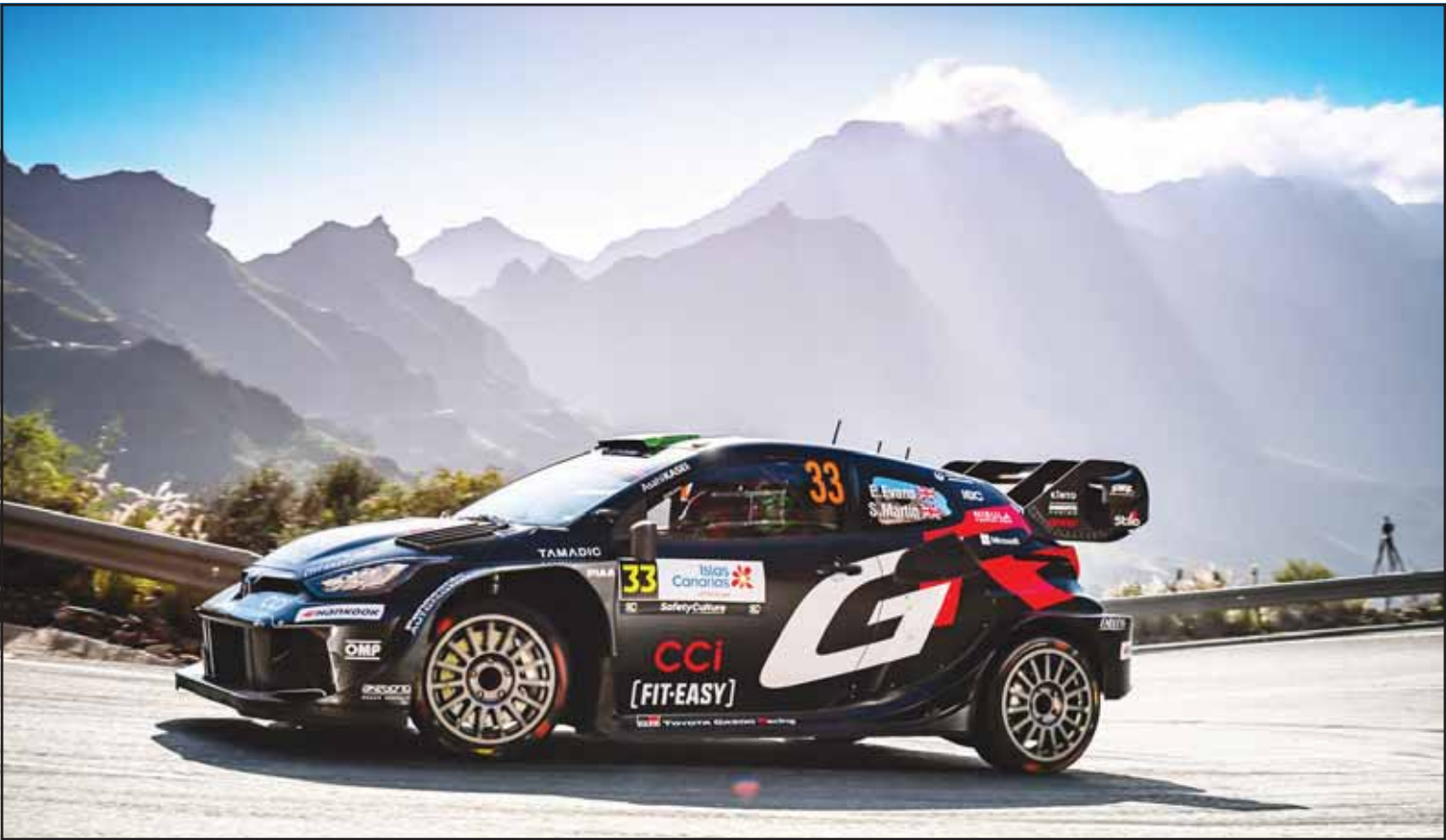
Drivers in action during Rally Islas Canarias.

experience gained under the extreme conditions of various motorsports events, TGR aims to forge new technologies and solutions that bring the freedom, adventure, and joy of driving to everyone. Race Notes: ■ No: 69 GR YARIS Rally1 (Kalle Rovanperä and Jonne Halttunen) ■ Position: 1st ■ Time: 2 hours, 54 minutes, and 39.8 seconds ■ No: 17 GR YARIS Rally1 (Sébastien Ogier and Vincent Landais)