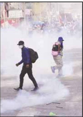
Supporters of former president Evo Morales run from tear gas launched by police during clashes near the offices of the Electoral Tribunal in La Paz, Bolivia on May 16.

LA PAZ, BOLIVIA, May 17, Hundreds of supporters of ex-President Evo Morales marched toward Bolivia’s top electoral court on Friday to push for their leftist leader’s candidacy in presidential elections later this year, a rally that descended into street clashes as police tried to clear out a group of demonstrators. The confrontations come in response to a ruling by Bolivia’s Constitutional Court that blocks Morales, the nation’s first Indigenous president who governed from 2006 until his ouster in 2019, from running again in Aug 17 elections. The turmoil escalates political tensions as Bolivia undergoes its worst economic crisis in four decades. As the march arrived in Bolivia’s capital of La Paz, protesters seeking to register Morales’ candidacy surged toward the Supreme Electoral Tribunal, chanting, “Comrades, what do we want? For Evo to come back!” Security forces barricading a road to the court held them back. Police reported that the clashes between rock-throwing protesters and tear gas-lobbing police forces injured two officers, a journalist and a local merchant. “They’re using firecrackers and rocks that are hurting our forces,” said