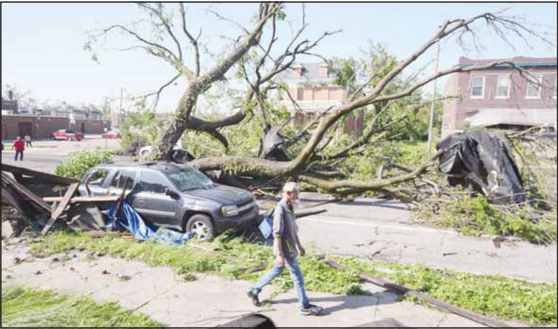
A person walks past a large tree blocking a road after a severe storm moved through on May 16 in St. Louis.