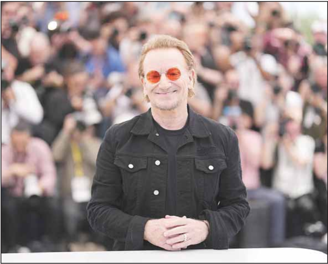
Bono poses for photographers at the photo call for the film 'Bono: Stories of Surrender' at the 78th international film festival, Cannes, southern France, Saturday, May 17.

Nationalism is not what we need. We grew up in a very charged atmosphere in Ireland. It makes you suspicious of nationalism and