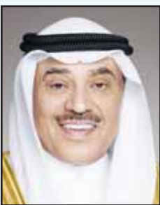
HH the Crown Prince