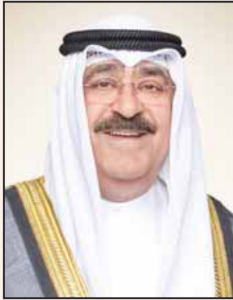
His Highness the Amir