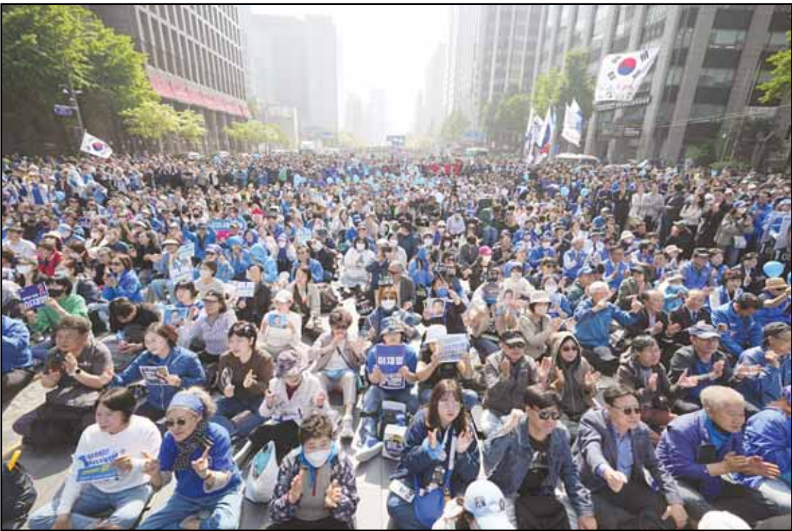
Supporters of Lee Jae-myung, presidential candidate of the Democratic Party, cheer during a campaign event in Seoul, South Korea on May 12.