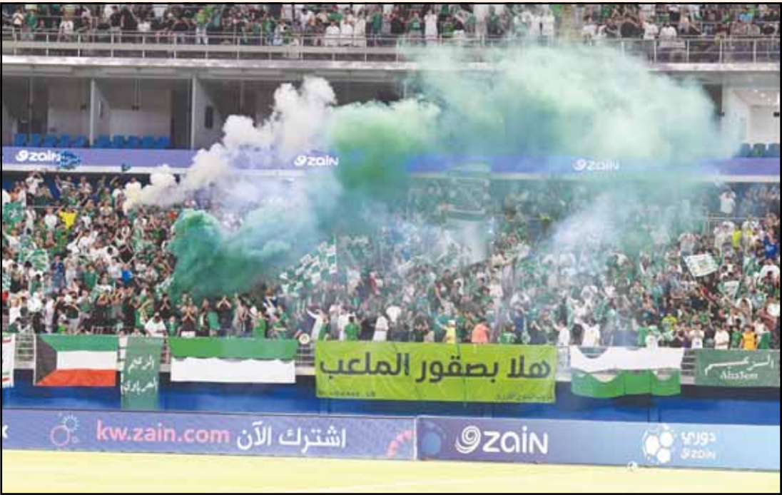
Smoke rose from the crowd during the Zain Premier League match between Al-Arabi and Kuwait Club.