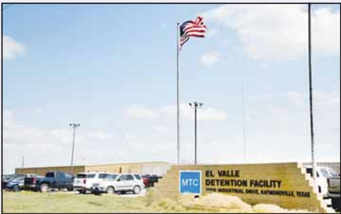
The El Valle Detention Center in Raymondville, Texas is pictured on May 1. (AP)

WASHINGTON, May 17, (AP): The Supreme Court on Friday barred the Trump administration from quickly resuming deportations of Venezuelans under an 18th-century wartime law enacted when the nation was just a few years old. Over two dissenting votes, the justices acted on an emergency appeal from lawyers for Venezuelan men who have been accused of being gang members, a designation that the administration says makes them eligible for rapid removal from the United States under the Alien Enemies Act of 1798. The court indefinitely extended the prohibition on deportations from a north Texas detention facility under the alien enemies law. The case will now go back to the 5th US Circuit Court of Appeals, which declined to intervene in April. President Donald Trump quickly voiced his displeasure. “THE SUPREME COURT WON’T ALLOW US TO GET CRIMINALS OUT OF OUR COUNTRY!” he posted on his Truth Social platform. The high court action is the latest in a string of judicial setbacks for the Trump administration’s effort to speed deportations of people in the country illegally. The president and his supporters have complained about having to provide due process for people they contend didn’t fol-