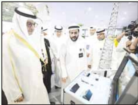
Minister Al-Mukhaizeem explores Zain's sustainable solutions at the company's booth.