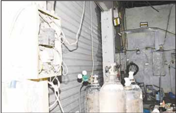
Top and above: KFF fined many shops violating safety rules.