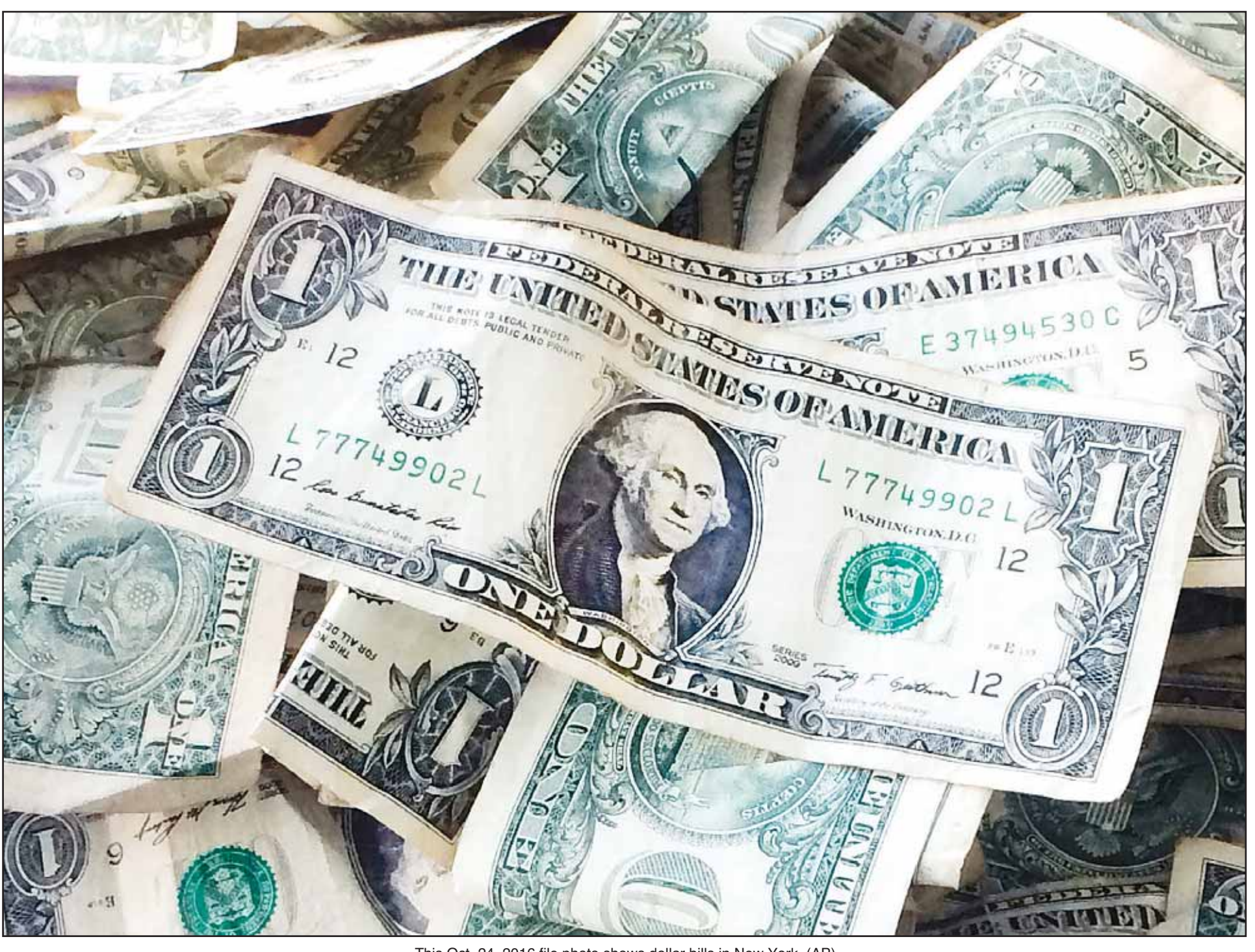
This Oct. 24, 2016 file photo shows dollar bills in New York.

The Conversation is an independent and nonprofit source of news, analysis and commentary from academic experts.