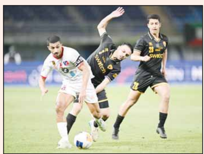
A file photo of players fighting for the ball during Zain Premier League match.

KUWAIT CITY, May 8: Kuwait Club and Al-Arabi will wrap up their preparations for the decisive clash scheduled for Sunday in the fifth and final round of the Zain Premier League championship group.