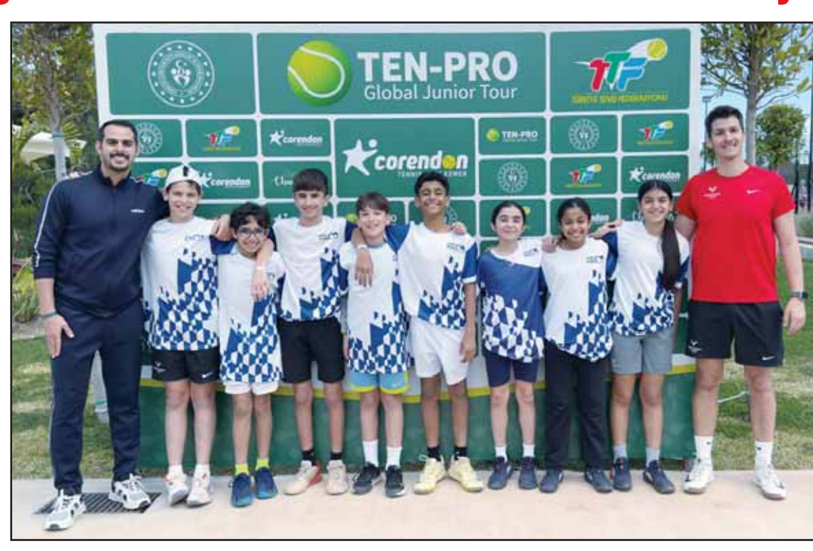
Players pose with officials during the trip.

It should be noted that NBK is committed to making various initiatives and programs that prioritize youth well-being, education, health, women empowerment, and environmental sustainability, as it strives to play a key role in making positive change and securing a brighter future for the upcom-