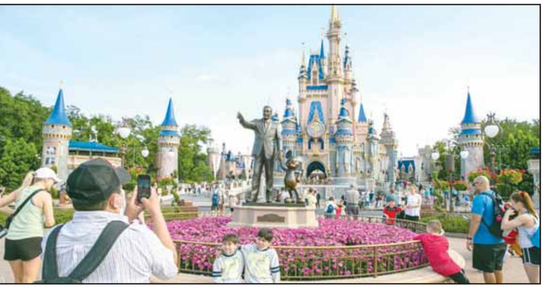
People visit the Magic Kingdom Park at Walt Disney World Resort in Lake Buena Vista, Fla., April 18, 2022.