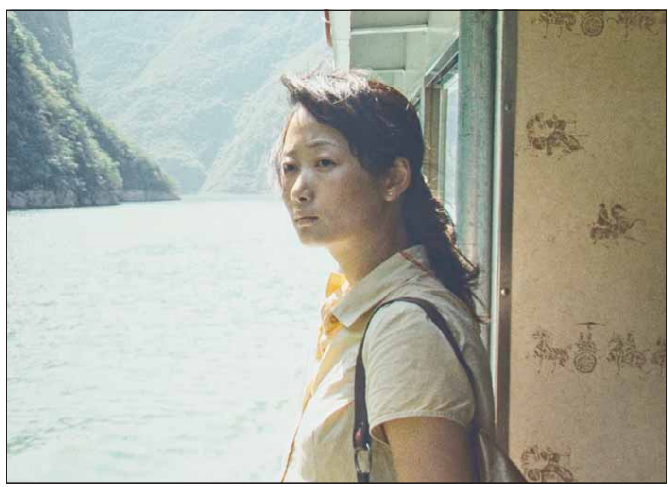
This image released by Sideshow and Janus Films shows Zhao Tao in a scene from 'Caught By the Tides.' (AP)

Film chronicles 21 years of change in China