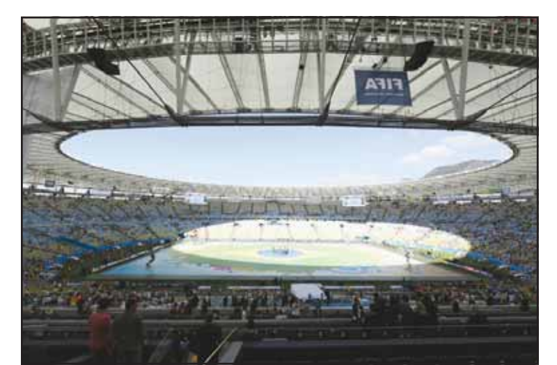
In this file photo, a general view of the closing ceremony before the World Cup final soccer match between Germany and Argentina at the Maracana Stadium in Rio de Janeiro.

Brazil will host the women's tournament for the first time. Brazil is a five-time World Cup champion in men's football but has never won the women's global title.