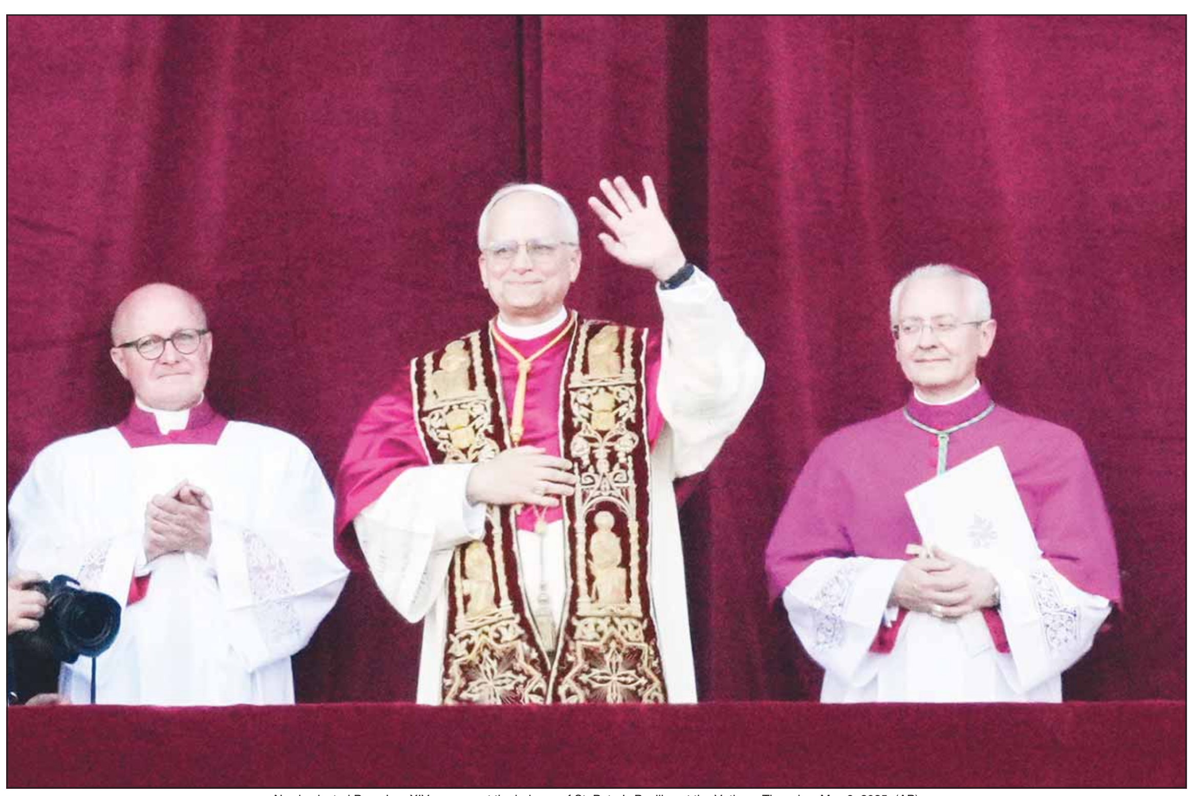
Newly elected Pope Leo XIV appears at the balcony of St. Peter's Basilica at the Vatican, Thursday, May 8, 2025.