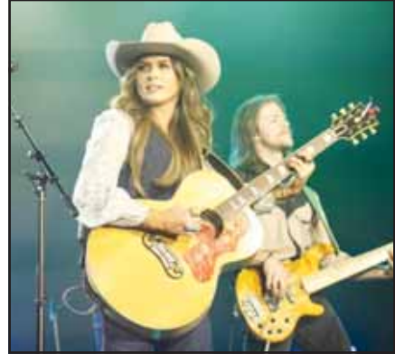
Ella Langley performs during Amazon Music Country Heat at Country Radio Seminar in Nashville, Tenn., on Feb. 28, 2024.

Here's what you need to know before the main ACMs attraction begins.