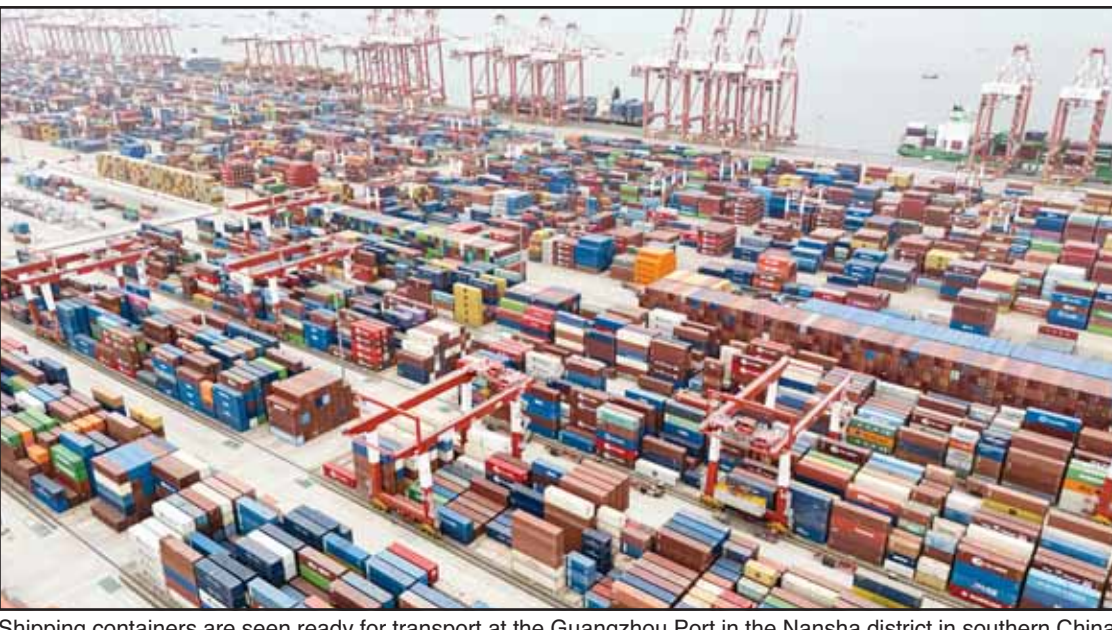
Shipping containers are seen ready for transport at the Guangzhou Port in the Nansha district in southern China's Guangdong province, April 17, 2025.

"While we had known consumer goods accounted for the bulk of March's rise, we can now see pharmaceutical products were $20 billion higher - almost all of which were imported from Ireland," analysts at Oxford Economics wrote in a Tuesday research note. "Uncertainty remains high, and broader signs of front-loading may be visible in coming months."