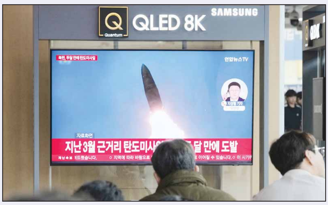
A TV screen shows a file image of North Korea's missile launch during a news program at Seoul Railway Station in Seoul, South Korea on May 8.

SEOUL, South Korea, May 8, (Agencies): North Korea on Thursday fired various types of short-range ballistic missiles into its eastern sea, South Korea's military said, adding to a run in military displays that raised animosities in the region. South Korean military officials were analyzing whether the tests were linked to the North's weapons exports to Russia during its war in Ukraine.