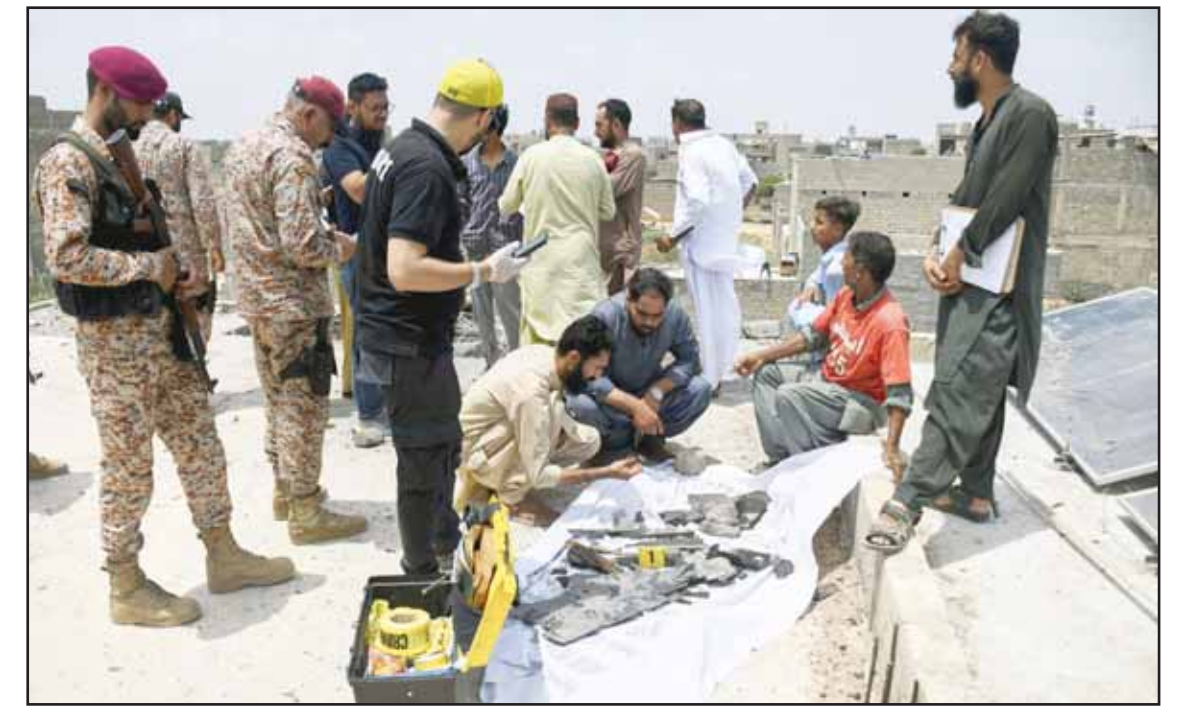
Paramilitary soldiers stand guard as investigators collect pieces of a suspected Indian drone at the site of a drone crash in Karachi, Pakistan on May 8.

a former ally, are out to oust him and called it "an attempt to undermine Colombia's sovereignty, its democracy and the freedom of Colombians.