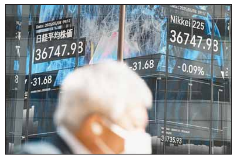
A person walks in front of an electronic stock board showing Japan's Nikkei index at a securities firm Thursday, May 8, 2025, in Tokyo.

TOKYO, May 8, Asian shares rose moderately Thursday after a lackluster finish on Wall Street, with most shares ticking higher after the Federal Reserve left