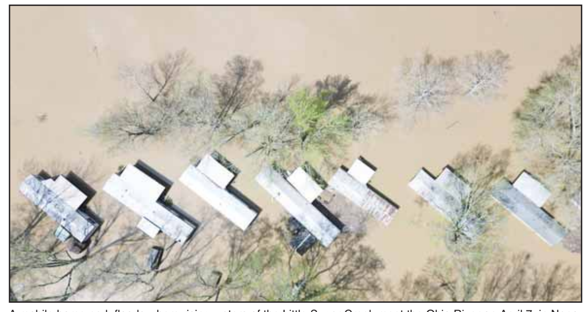
A mobile home park floods where rising waters of the Little Sugar Creek meet the Ohio River on April 7, in Napoleon, Ky.

As the scrutineer reads out each name, he pierces each ballot with a needle through the word "Eligo." All the ballots are then bound together with thread, and the bundle is put aside and burned in the chapel stove along with a chemi-