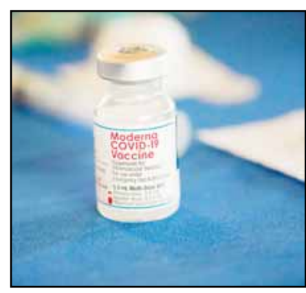
A vial of Moderna COVID-19 vaccine rests on a table at an inoculation station in Jackson, Miss., on July 19, 2022.

Also last week, Novavax said the FDA was asking the company to run a new clinical trial of its protein-based COVID-19 vaccine after the agency grants full approval, sowing uncertainty about other vaccine updates.