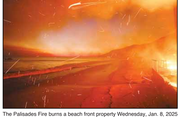
in Malibu, Calif.

of efforts to prevent cisplatin-induced hearing loss in children. Investigators from CHLA led the pivotal phase 3 Children's Oncology Group trial of sodium thiosulfate (STS), and in 2022, the Food and Drug Administration approved STS as the first treatment to reduce the risk of hearing loss in children given cisplatin. But patients' treatment regimens are already highly complex, and some may not need STS to prevent hearing loss. For those who are not eligible for STS, it's critical for clinicians to understand each patient's risk and what options they have to protect that child's hearing.