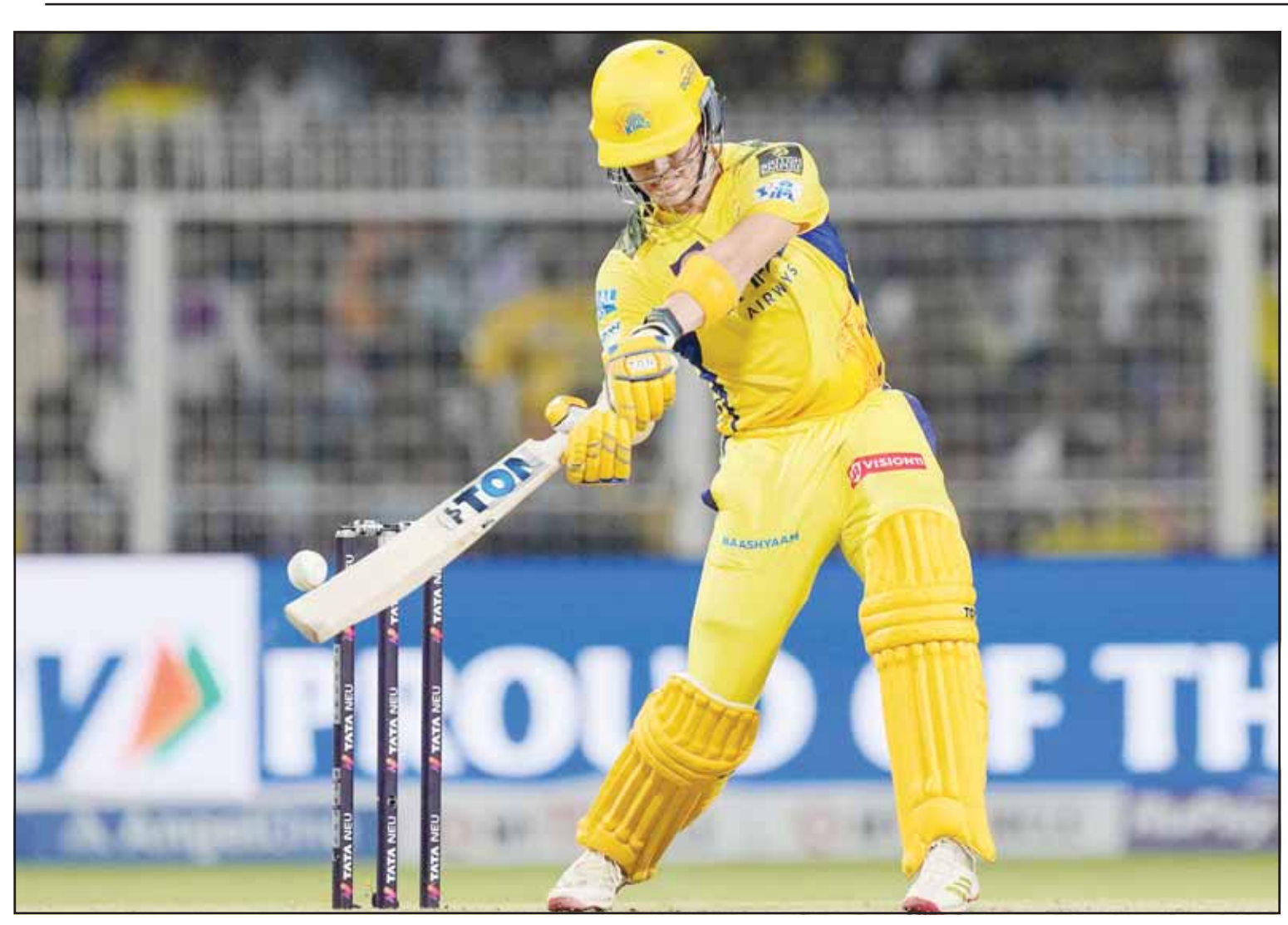
Chennai Super Kings' Dewald Brevis plays a shot during the Indian Premier League cricket match between Kolkata Knight Riders and Chennai Super Kings at Eden Gardens in Kolkata, India.