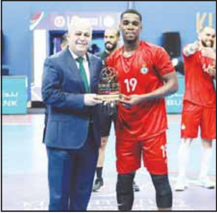
Moroccan Ambassador presents the Best Player award.