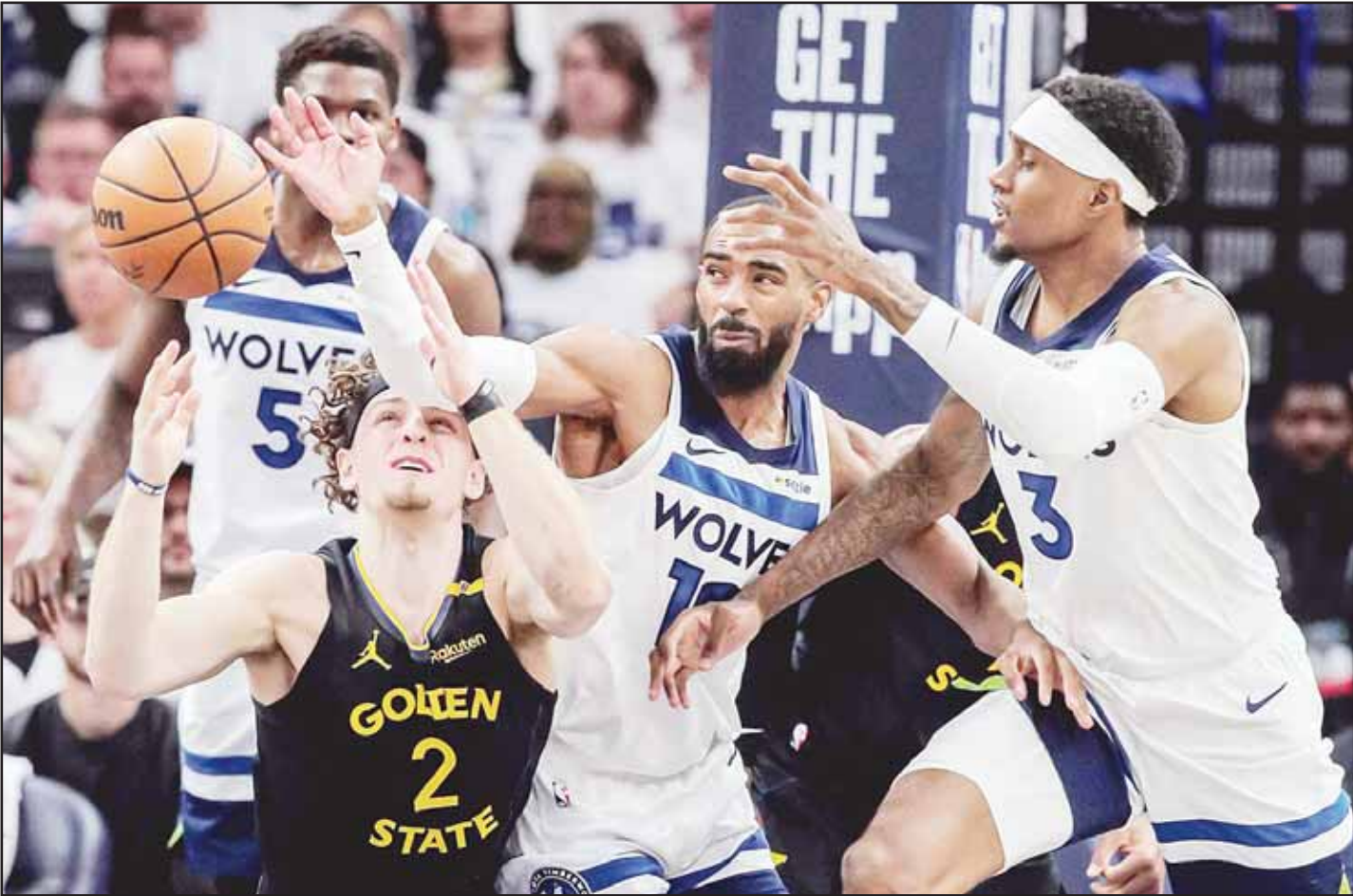
Brandin Podziemski (2) grabs for a loose ball against Mike Conly (10) and Jaden McDaniels (3) in the first half as the Golden State Warriors played the Minnesota Timberwolves in Game 1 of the Second Round of the NBA Playoffs at Target Center in Minneapolis, Minn.

disabilities and their non-disabled peers. These activities were part of the Unified Champions Schools program, which promotes educational integration through sports, laying the foundation for inclusive and holistic school communities.