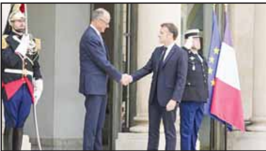
French President Emmanuel Macron, right, welcomes German Chancellor Friedrich Merz on May 7, at the Elysee Palace in Paris.