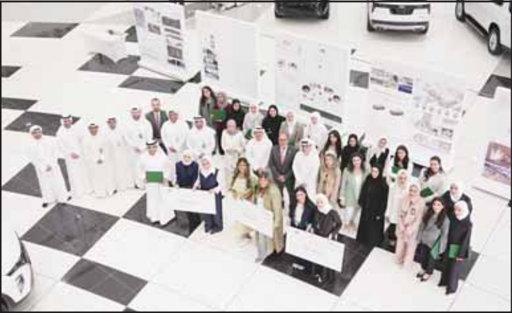
Group photo after the award ceremony.