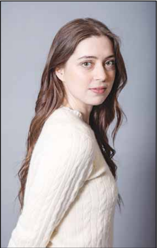
Lizzy McAlpine poses for a portrait on Friday, April 11, 2025, in New York.