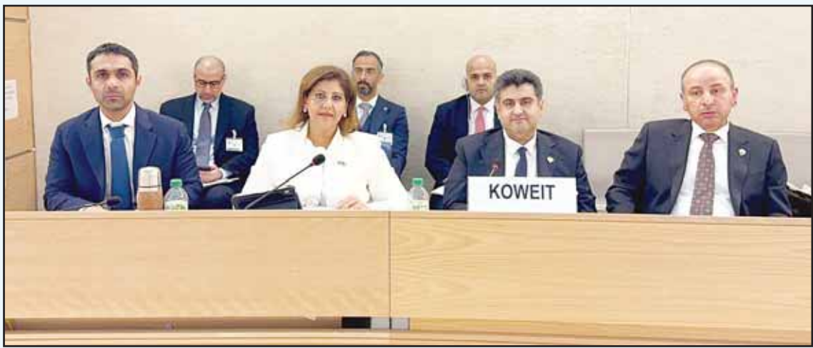
Kuwait delegation headed by Minister of Justice Counselor Nasser Al-Sumait, during the presentation of the fourth national report before the United Nations Human Rights Council.