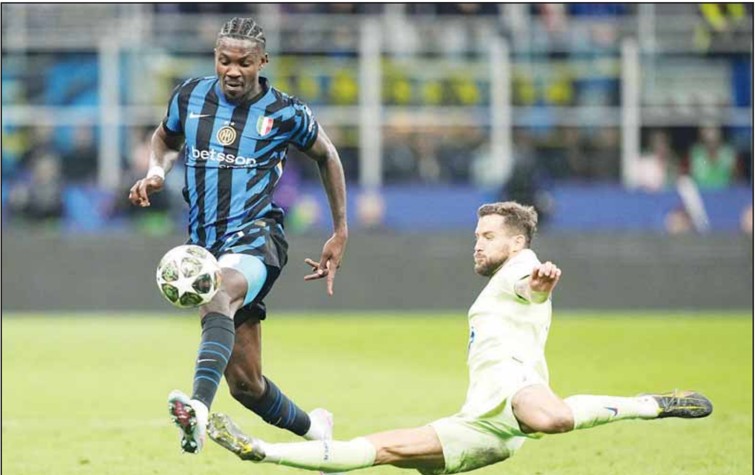
Barcelona's Inigo Martinez tackles Inter Milan's Marcus Thuram during the Champions League semifinal second leg soccer match between Inter Milan and Barcelona at San Siro stadium in Milan, Italy.

But Barcelona had been in that position before, having gone 2-0 down early last week in the first leg before securing a thrilling 3-3 draw.