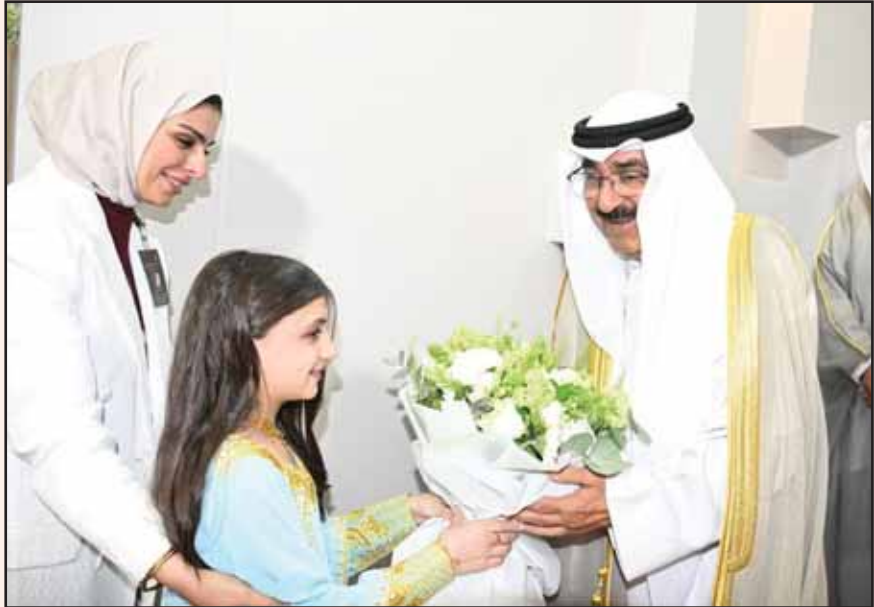
His Highness the Amir during the ceremony honoring outstanding students of PAAET.