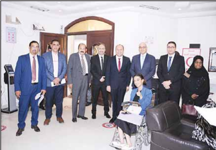
Top and above: The National Identification Card Committee issues ID cards to Egyptian citizens.

By Bassam Al-Qassas Al-Seyassah/Arab Times Staff