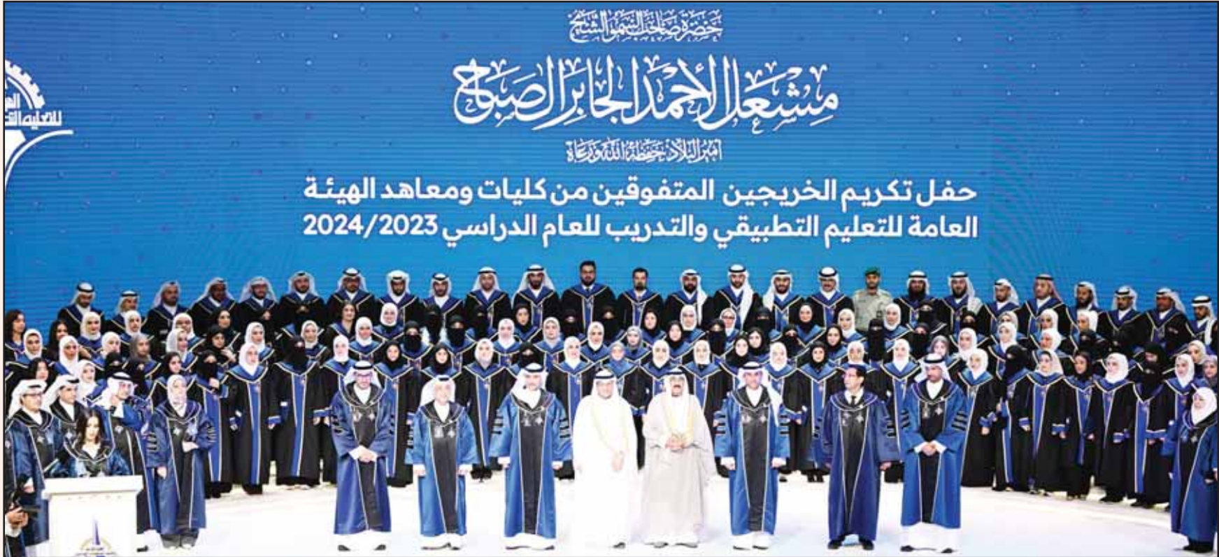
His Highness the Amir attends the graduation ceremony and honoring of outstanding students of the Public Authority for Applied Education and Training (PAAET).