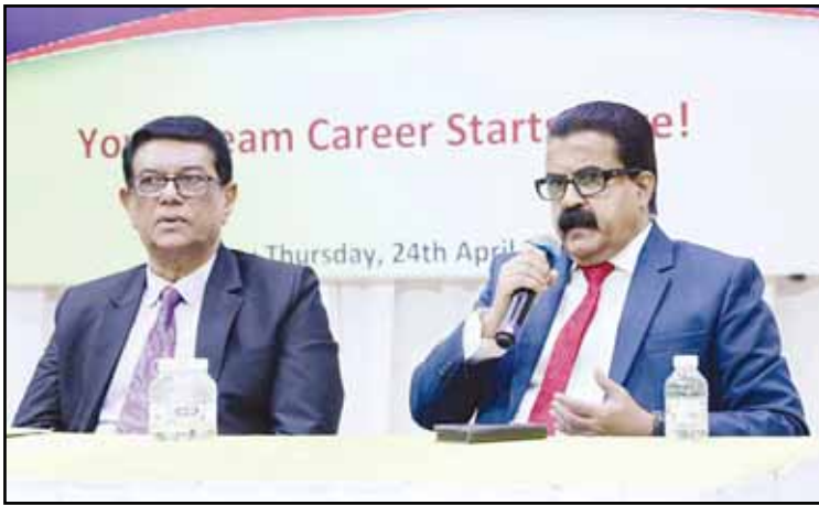
ICSK and Vedhik IAS Academy experts during the Global Competitive Exam orientation program for students.