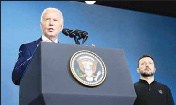
US President Joe Biden, left, joined by President of Ukraine Volodymyr Zelenskyy, speaks during an event on the Ukraine Compact on the sidelines of the NATO Summit in Washington on July 11, 2024.

The term appeasement refers to former British Prime Minister Neville Chamberlain's efforts in the 1930s to