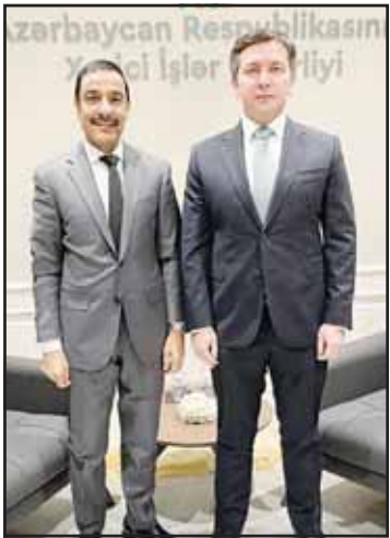
Kuwaiti Ambassador to Azerbaijan Mohammad Al-Mutairi with Azerbaijan Assistant Minister of Foreign Affairs Yalchin Rafiyev.

ANKARA, May 7, (KUNA): Kuwaiti Ambassador to Azerbaijan Mohammad Al-Mutairi met with Azerbaijan Assistant Minister of Foreign Affairs Yalchin Rafiyev, discuss with him ties and ways to bolster cooperation. A statement by the Kuwaiti embassy in Baku, obtained by KUNA, said that the meeting also touched on the recent visit by Azerbaijan Foreign Minister to Kuwait Jeyhun Bayramov last week where he attended the high joint committee meeting between the two countries. Bayramov also met with His Highness the Crown Prince Sheikh Sabah Khaled Al-Hamad Al-Sabah and Minister of Foreign Affairs Abdullah Al-Yahya, added the statement. The Azerbaijani official said that he was looking forward to the upcoming meeting of the committee in 2027 in Baku.