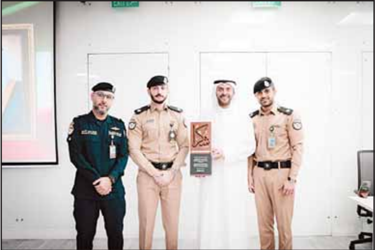
Gulf Bank honors representatives of the General Traffic Department.

"We believe the private sector has a crucial role in supporting the Ministry's efforts to reduce accidents and save lives," stated a Gulf Bank official,