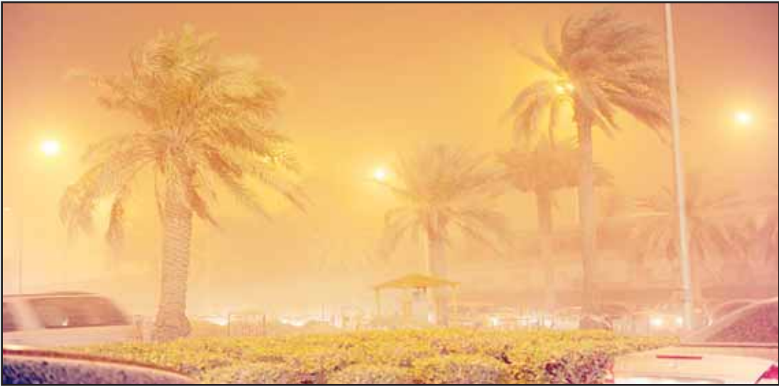
Rising dust in high winds decreased visibility to a few meters in many areas.