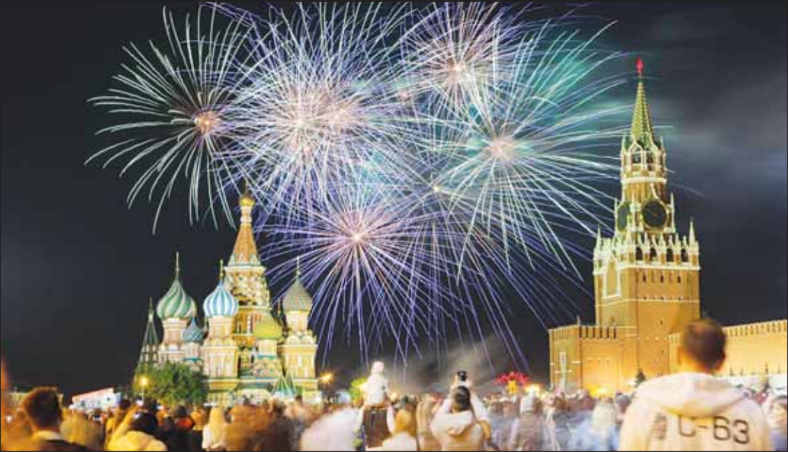
Fireworks explode over the Kremlin during a Victory Day celebration to mark the end of World War II in Moscow on May 9, 2018.