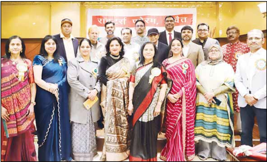
A group photo from the event.