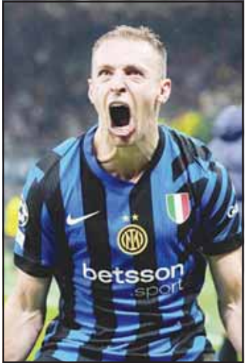
Inter Milan's Davide Frattesi celebrates after scoring his side's fourth goal during the Champions League semifinal second leg soccer match between Inter Milan and Barcelona at San Siro stadium in Milan, Italy.

In the end, it took extra time, two astonishing comebacks, and 13 goals to separate Barcelona and Inter and see the Italian club, which was a mere seconds away from elimination, prevail 7-6 on aggregate after winning another rollercoaster encounter 4-3.