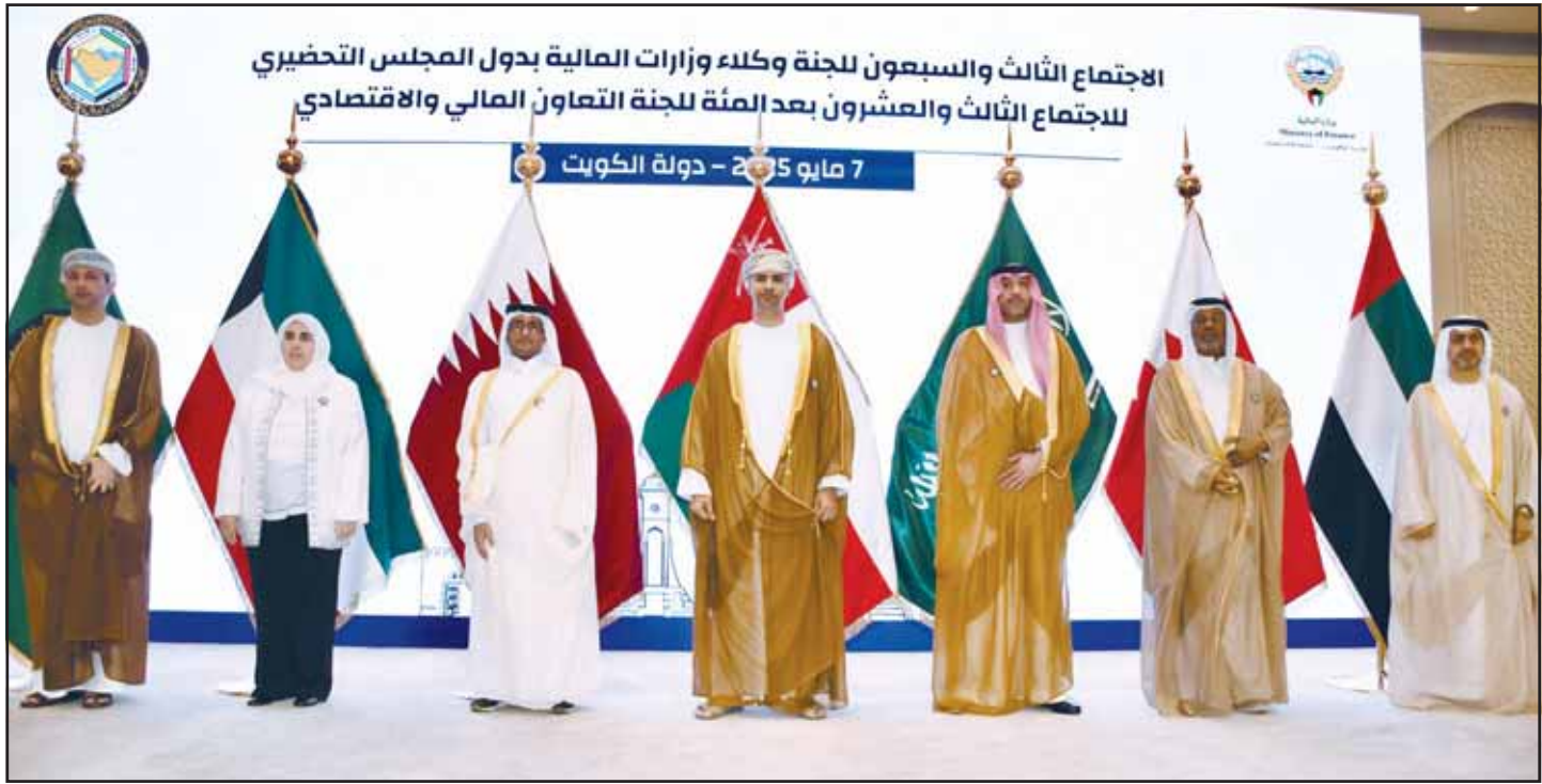
Finance Undersecretaries from the GCC who took part in the meeting.