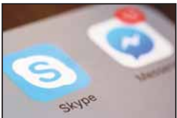
This photo shows the icon for Microsoft's Skype app on a smartphone in New York, April 9, 2016. (AP)

LONDON, May 7, (AP): Skype is dead. What now? Microsoft's shutdown of Skype on May 5 sent millions of users scrambling to find an alternative to the pioneering internet phone service. Skype, which Microsoft bought in 2011, was beloved by a dwindling group of users who appreciated how it let them make cheap long-distance calls as well as communicate with other users through chat messages, voice or video calls. Some liked its simplicity and ease of use - an advantage, for example, when setting up a communications app for an elderly parent living far away. Or they just used it out of habit. Skype was founded in 2003 and was among the first in a wave of communication services that used voice over internet protocol technology (VoIP), which converts audio into a digital signal.