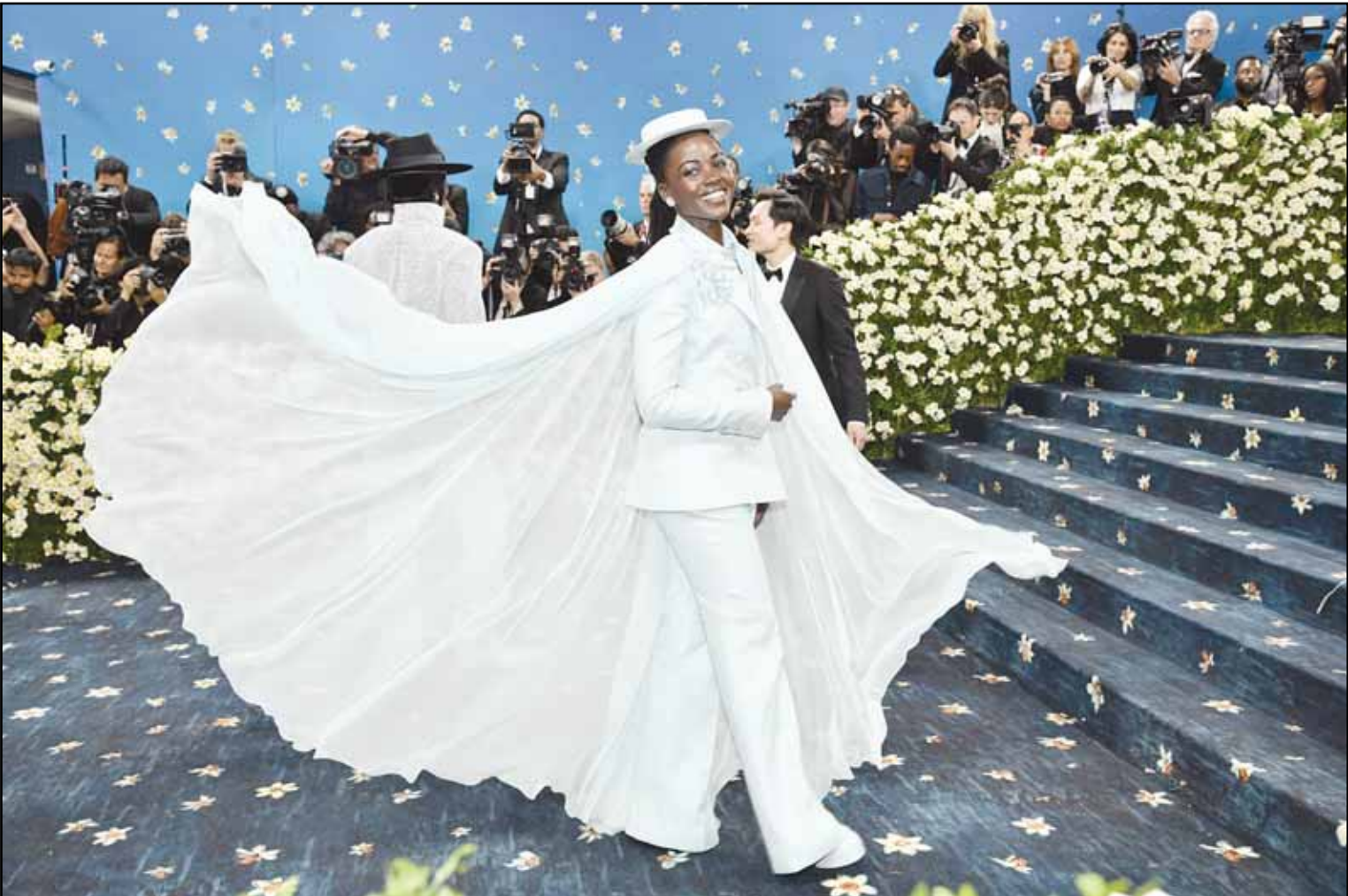
Lupita Nyong'o attends The Metropolitan Museum of Art's Costume Institute benefit gala celebrating the opening of the 'Superfine: Tailoring Black Style' exhibition on Monday, May 5, in New York.