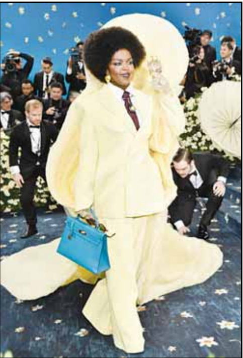
Laurny Hill attends The Metropolitan Museum of Art's Costume Institute benefit gala on May 5, in New York.

Coattails of varying lengths were a huge trend amid the sea of hats and head pieces anticipated ahead of the gala that brought together A-listers from the worlds of sports, entertainment, music, art, literature, politics and more to raise money for the Costume Institute.