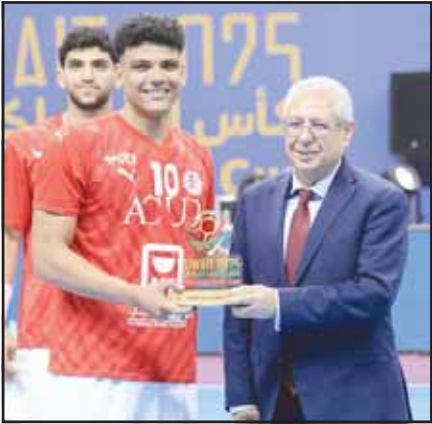
Ambassador of Egypt presents the Best Player award.

The second round of the group stage also saw Qatar defeat Tunisia 31-30 and Morocco triumph over the UAE 33-25. These results secured Qatar's qualification to the semi-finals, topping Group B with 4 points. Tunisia followed in second place on goal difference over Saudi Arabia. In Group A, Egypt topped the table on goal difference over Bahrain, with both teams on two points, while Iraq withdrew from the competition without earning any points.