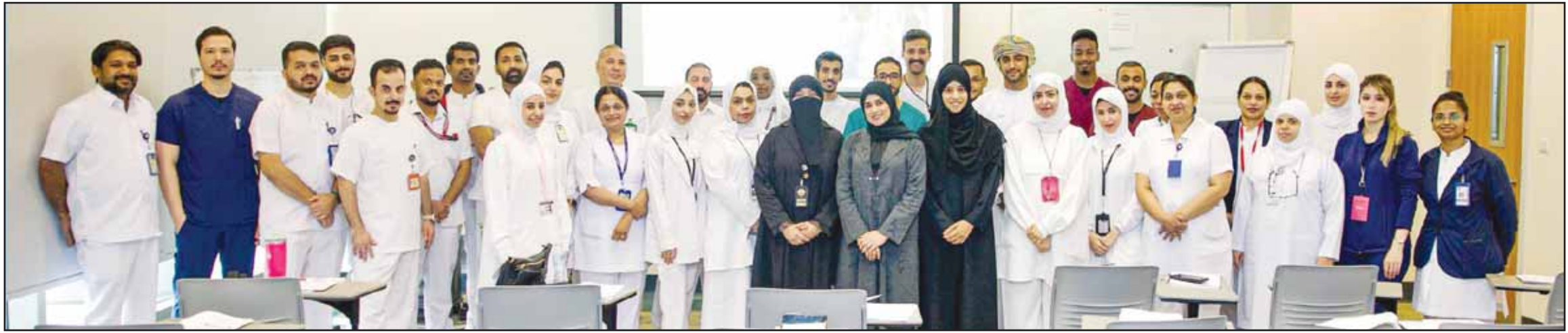
30 nurses undergo specialized emergency care training to strengthen health services.

By Marwa Al Bahrawi Al-Seyassah/Arab Times Staff