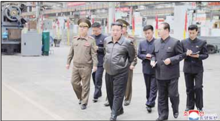
In this undated photo provided on May 7, by the North Korean government, North Korean leader Kim Jong Un, right, visits a machinery factory in North Korea.

After denying its war involvement for months, North Korea last month confirmed for the first time that it had sent combat troops to help Russia in recapturing parts of the Kursk region,