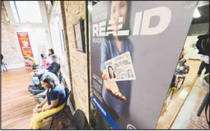
People wait inside a branch of the Louisiana Office of Motor Vehicles in Kenner, La on May 6.

REAL ID is a federally compliant state-issued license or identification card that Homeland Security says is a more secure form of identification. It was a