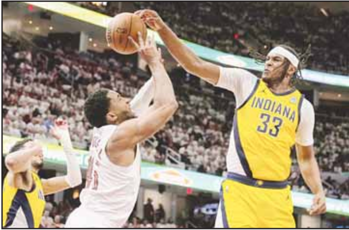
Indiana Pacers' Myles Turner (33) blocks a shot by Cleveland Cavaliers guard Donovan Mitchell, center, in the second half during Game 2 in the Eastern Conference semifinals of the NBA basketball playoffs in Cleveland.

Anthony Edwards had 23 points and 14 rebounds after a particularly rough start, finishing 9 for 22 from the floor. Reid had 19 points and Julius Randle added 16 points for the Wolves, who finished 5 for 29 from behind the arc and trailed by 23 points late in the third.