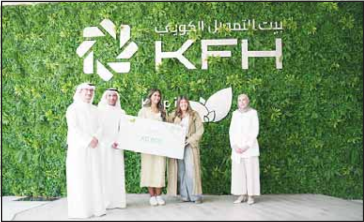
The committee selected three winning teams for the best design award.