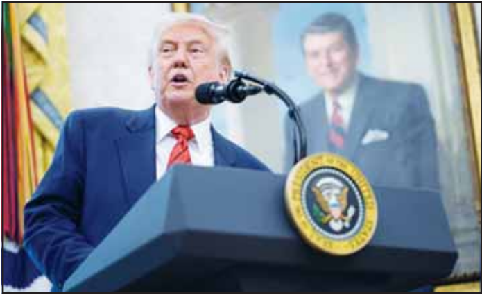
US President Donald Trump speaks before Steve Witkoff is sworn as special envoy during a ceremony in the Oval Office of the White House on May 6 in Washington.

The US military for years has unilaterally referred to the Persian Gulf as the Arabian Gulf in statements and images it releases.