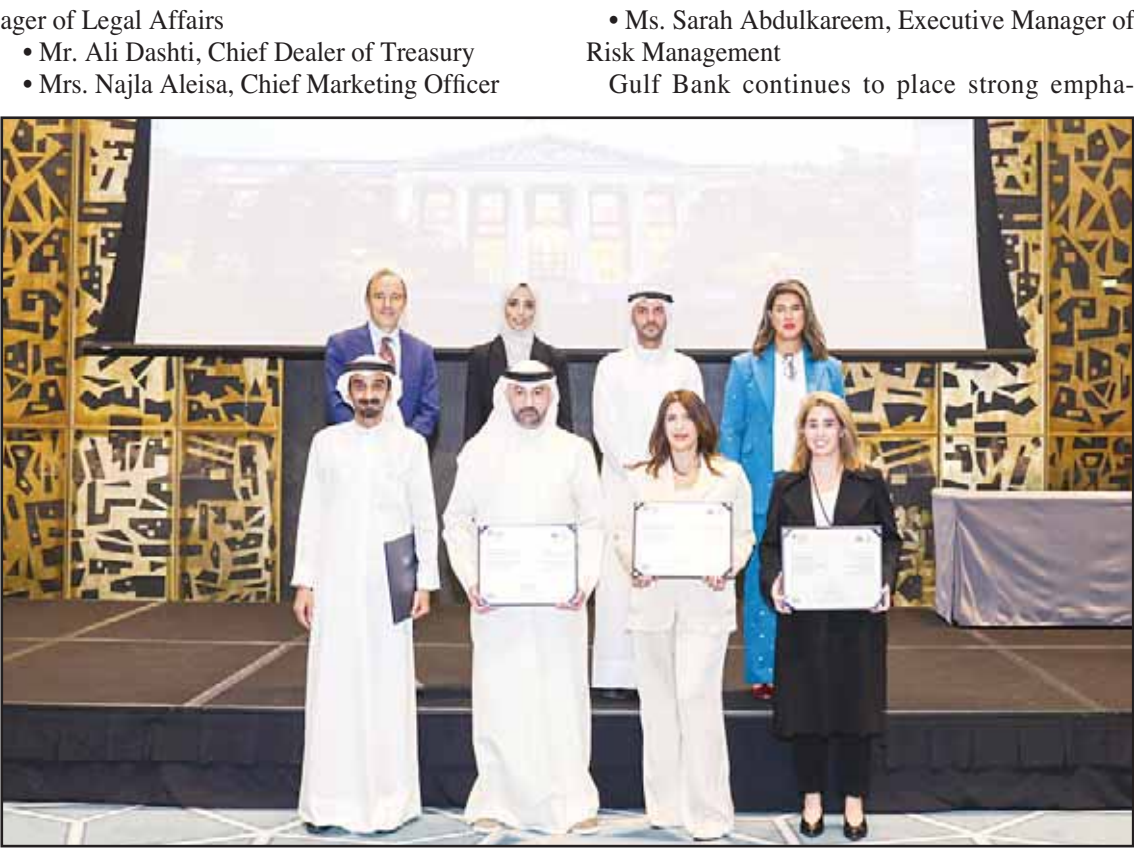
Kuwaiti executives enhance skills in financial sustainability at Gulf Bank.