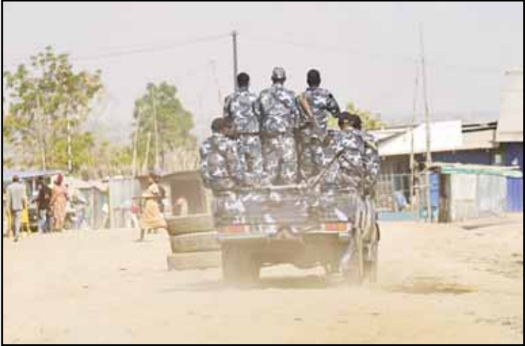
South Sudan soldiers patrol the street in Juba, South Sudan on Feb 13.