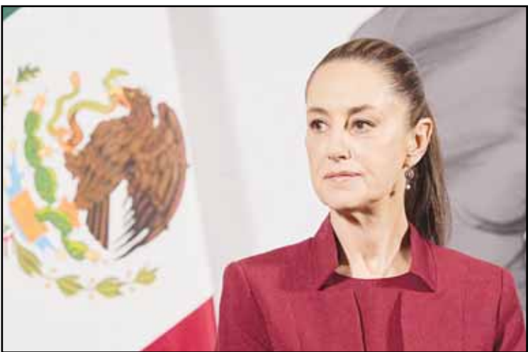
Mexican President Claudia Sheinbaum attends her morning press conference at the National Palace in Mexico City, April 2.