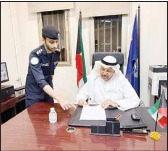
Sheikh Athbi Nasser Al-Athbi Al-Sabah checks the records.

It explained that certain measures are being taken in accordance with established procedures for oversight, inspection and monitoring of cooperative activities; and are being conducted with full transparency.