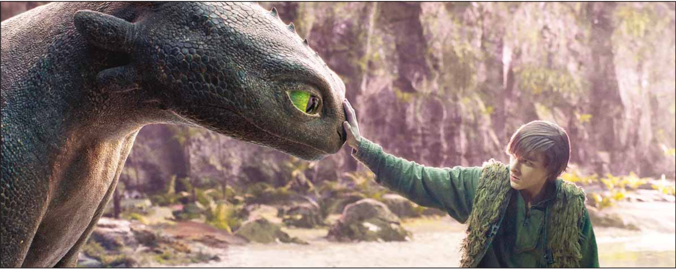
This image released by Universal Pictures shows Mason Thames in a scene from 'How to Train Your Dragon.' (AP)