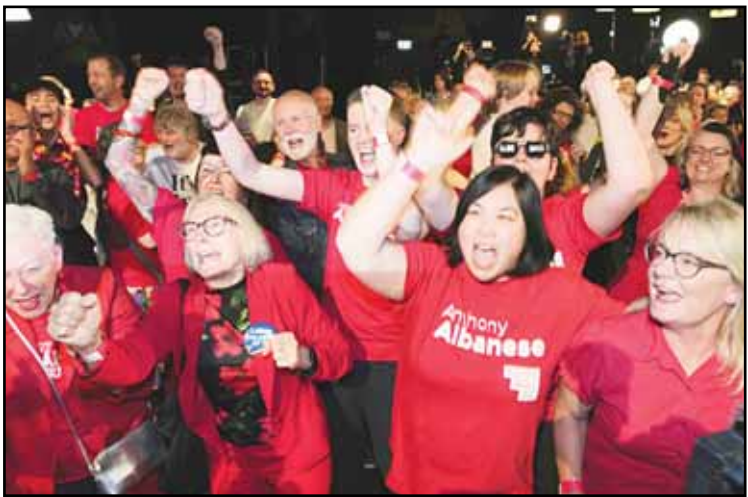
Labor Party supporters react as results are shown on a screen at their party headquarters in Sydney on May 3.

they feared late last year they would become the first government to be tossed out after a single three-year term since the turmoil of the Great Depression in 1931. Like the center-left Canadian government, the Australian government had linked their political opponents to Trump's administration and its Elon Musk-led Department of Government Efficiency. Australia was hit during the five-week election campaign with 10% tariffs on exports to the United States despite trading with its bilateral free trade partner at a deficit for decades.