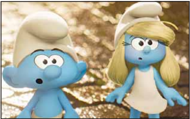
This image released by Paramount Animation shows No Name, voiced by James Corden, (left), and Smurfette, voiced by Rihanna in a scene from 'Smurfs.'