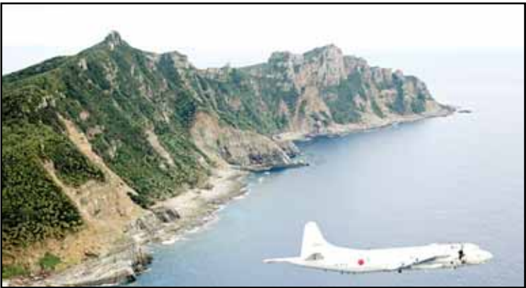
Japan Maritime Self-Defense Force P-3C Orion surveillance plane flies over the disputed islands, called the Senkaku in Japan and Diaoyu in China, in the East China Sea, on Oct 13, 2011.

China since a Chinese reconnaissance aircraft violated the Japanese airspace off the southern prefecture of Nagasaki in August. Chinese aircraft have also violated the Japanese airspace around