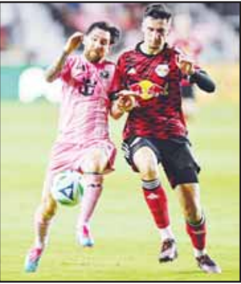
Inter Miami forward Lionel Messi (10) battles New York Red Bulls defender Noah Eile during the second half of a MLS soccer match in Fort Lauderdale, Fla. (AP)