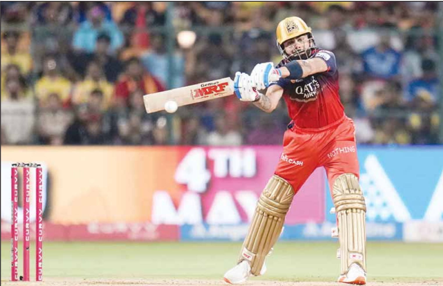
Royal Challengers Bengaluru's Virat Kohli plays a shot during the Indian Premier League cricket match between Royal Challengers Bengaluru and Chennai Super Kings at Chinnaswamy Stadium in Bengaluru, India.