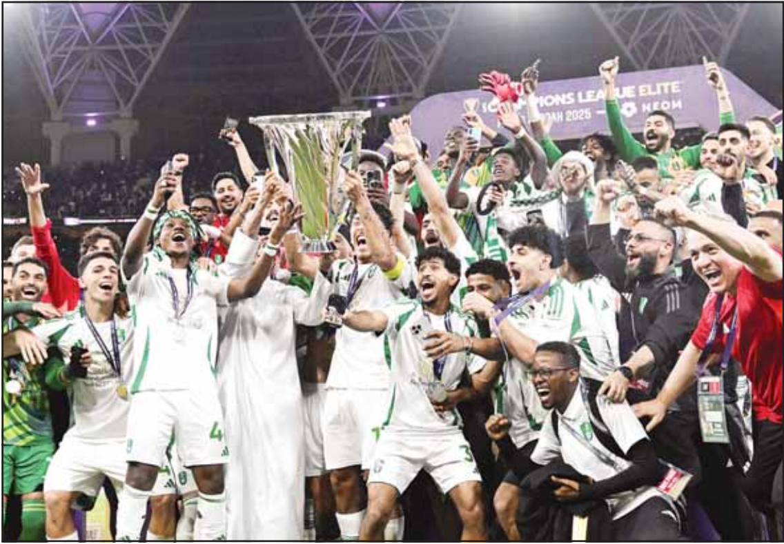
Al-Ahli’s Roberto Firmino holds up the trophy as celebrate with his teammates at the end of the AFC Champions League Elite final soccer match between Kawasaki Frontale and Al-Ahli at Alinma Stadium in Jeddah, Saudi Arabia.

Firmino, signed from Liverpool in 2023, is a past UEFA Champions