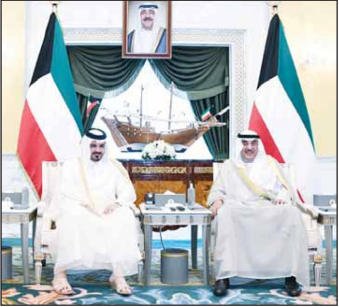
His Highness the Crown Prince Sheikh Sabah Khaled Al-Hamad Al-Sabah receives the Qatari President of the Olympic Committee, Sheikh Joaan bin Hamad Al-Thani.