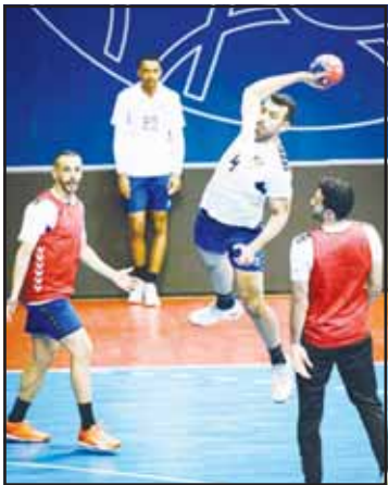
Kuwaiti players gearing up for the championship.