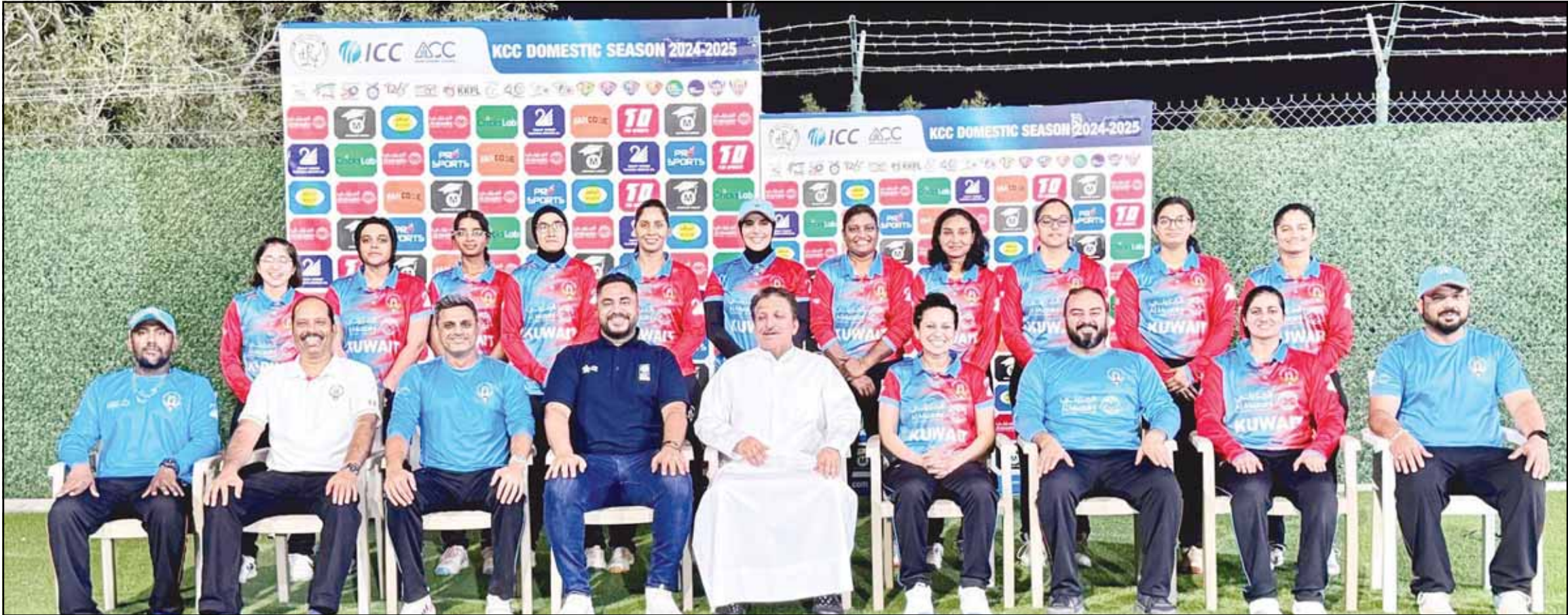
Kuwait cricket women team.