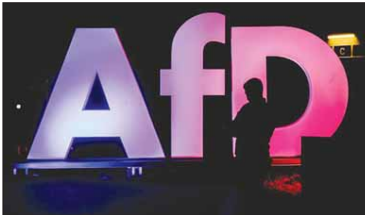
A man stands in front of the logo at the AfD party headquarters in Berlin, Germany on Feb 23, 2025, after the German national election.

Germany's Federal Office for the Protection of the Constitution described the party, known as AfD, as a threat to the country's democratic or-