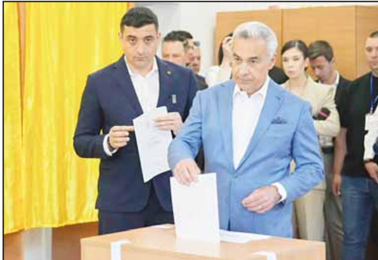
Calin Georgescu, winner of the first round of last year's annulled election, (right), and presidential candidate George Simion cast their votes in the first round of the presidential election redo in Mogosoaia, Romania on May 4.

Like many countries in the EU, anti-establishment sentiment is running high in Romania, fueled by high inflation and cost of living, a large budget deficit and a sluggish economy. Observers say the malaise has bolstered support for nationalist and far-right figures like Georgescu, who is under investigation and barred from the rerun.