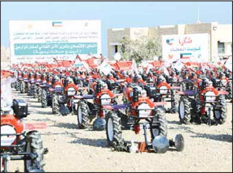
100 Yemeni farmers benefit from Kuwaiti-funded manual tillers distribution.