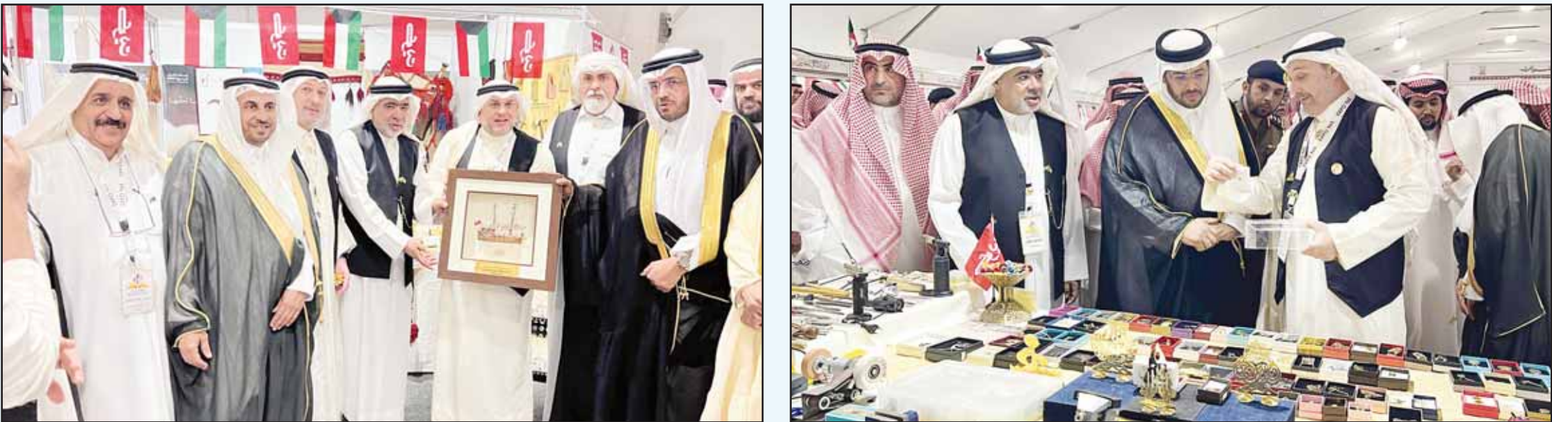
Members of the Kuwaiti ‘965 Expo’ showcase their personal collection at the festival.

RIYADH, May 4, (KUNA): Kuwaiti collectors took part in the Saudi International Handicraft Festival in Al-Zulfi city, Riyadh Province. Members of the Kuwaiti “965 Expo” took part in the event that began earlier this month and continues until May 9, showing during the event their personal collections of antiquities and handicrafts. The Kuwaiti pavilion also showcased several old occupations such as peril diving, ship building, Sadu weaving and others.