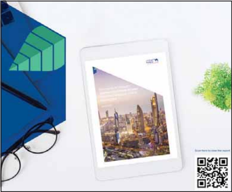
Climate risk strategy boosts NBK's business resilience.