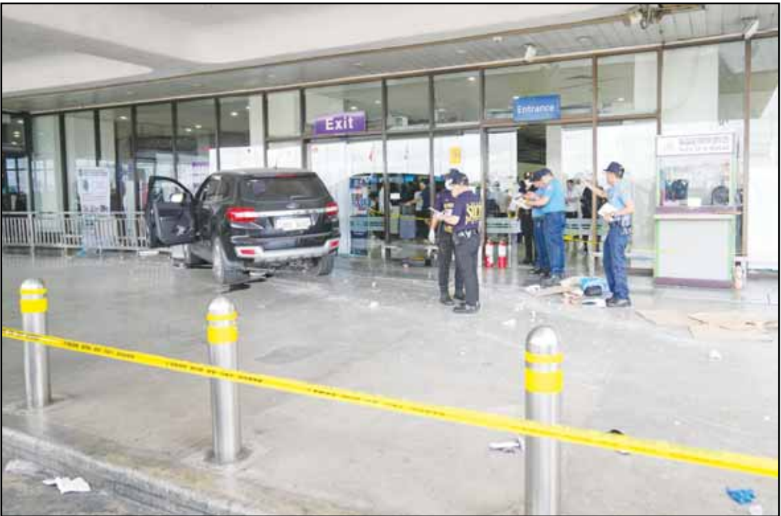
First responders work the scene after a vehicle drove into a departures entrance at Manila's International Airport, in Manila, Philippines on May 4.