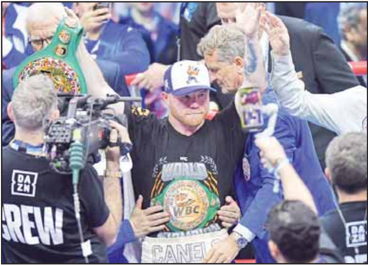
Canelo Alvarez, center, celebrates after winning against William Scull during super middleweight World Boxing Championship at ANB Arena in Riyadh, Saudi Arabia.

with Scull throwing many more punches but not landing enough. Alvarez, by contrast, stayed patient and was landing body shots. In the end, Alvarez threw almost half as many punches as Scull (152-293) but landed one more (56-55), predominantly power shots to the body. “It's OK, we won. We're here with the title as the champion,” Alvarez said, adding that neither the timing of the bout nor the quality of the contest was a problem because he'd plenty of time to prepare. “I'm a champion. I'm a professional, so that's all, no excuse or anything.” As for the Sept. 12 showdown against Crawford, who will be stepping up a weight to take on Alvarez? “I feel great. Crawford is one of the best out there and, you know, I like to share the ring with that kind of fighter,” he said. “It's my pleasure.” Crawford was in the crowd watching in the Saudi capital. “I'm feeling great. I'm feeling blessed. Things happen for a reason, and there's a reason why I'm here,” he said. “In September I'm showing the world what greatness look like.”