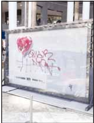
A slab of wall art, The ‘Battle to Survive a Broken Heart,’ created by the artist Banksy, sits on display inside the Brookfield Place atrium, April 29, 2025, in New York. The nearly four-ton piece will be auctioned off on May 21.