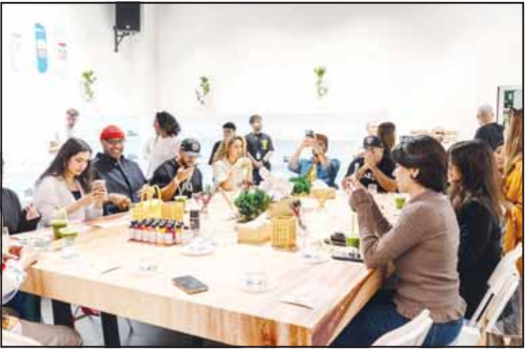
Part of the event attended by a group of influencers.