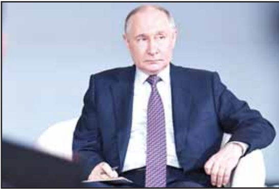
Russian President Vladimir Putin attends the educational marathon at the Victory Museum on Poklonnaya Gora in Moscow, Russia on April 30.

Meanwhile, 11 people were wounded in a Russian drone attack overnight on the Ukrainian capital, Kyiv, Ukraine's State Emergency Service said Sunday. Two children were