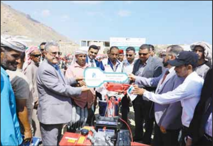
Yemeni officials launch distribution of manual tillers to small farmers on Socotra with Kuwaiti funding.

KPC issued a tender for consulting services in the field of communication and media. The tender opening date is May 4, 2025 and the closing date is June 3, 2025. A tender for cleaning the KPC tower and common areas in the Oil Sector Complex (Tender No. 9) was awarded to Al-Ruwad Environmental Services Company, with the lowest bid meeting the technical specifications and conditions. The tender was valued at KD 1,118,653.500. Meanwhile, Kuwait Oil Tanker Company (KOTC) announced the extension of the deadline for submitting bids for the tender to provide marine services with specialized labor for its Maritime Agency Branch until May 27, instead of April 6. The company added that the deadline for submitting bids for the tender to supply 320,000 12-kg steel LPG cylinders with valves for the Shuaiba and Umm Al-Aish LPG filling stations is extended until May 27, instead of April 29. Similarly, the tender for the supply of 40,000 25 kg LPG cylinders with valves and 5,000 5 kg LPG cylinders with valves for the Shuaiba and Umm Al-Aish LPG filling stations is extended until May 27, instead of April 29.