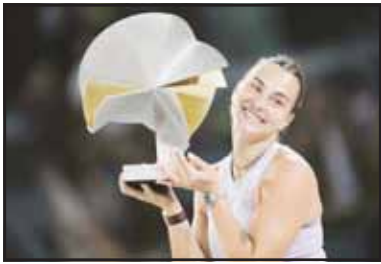
Aryna Sabalenka of Belarus holds a trophy after winning the Madrid Open tennis final in Madrid, Spain. Sabalenka beat Coco Gauff 6-3, 7-6 to win her record-tying third Madrid Open and 20th career title.