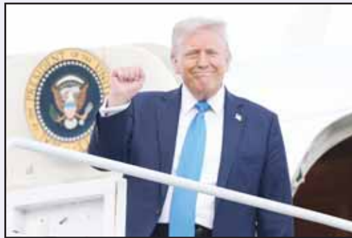
US President Donald Trump arrives at Tuscaloosa National Airport on May 1, in Tuscaloosa, Ala.

"Something could happen with Greenland," Trump said. "I'll be honest, we need that for national and in-