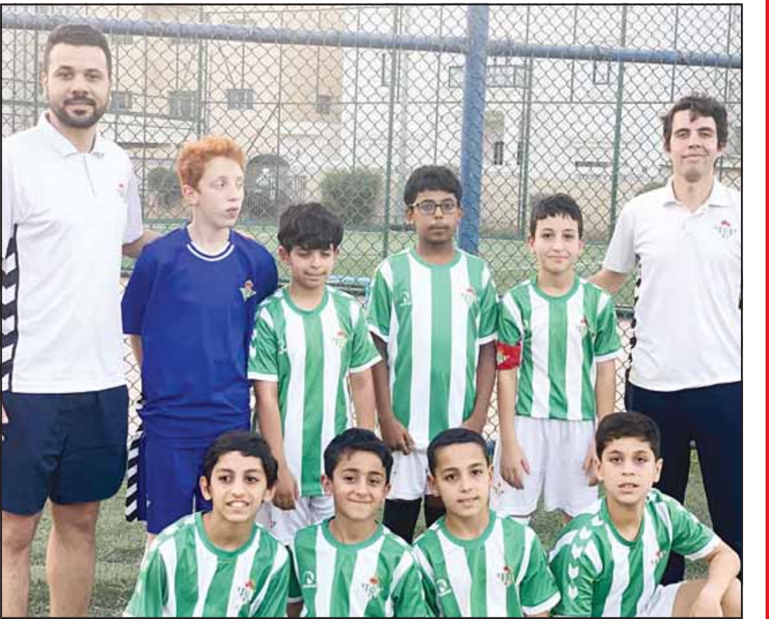
Top and above players preparing for the friendly matches.

Academy and Real Betis for the 2013 and 2014 age groups, offering an enjoyable experience for all in attendance.