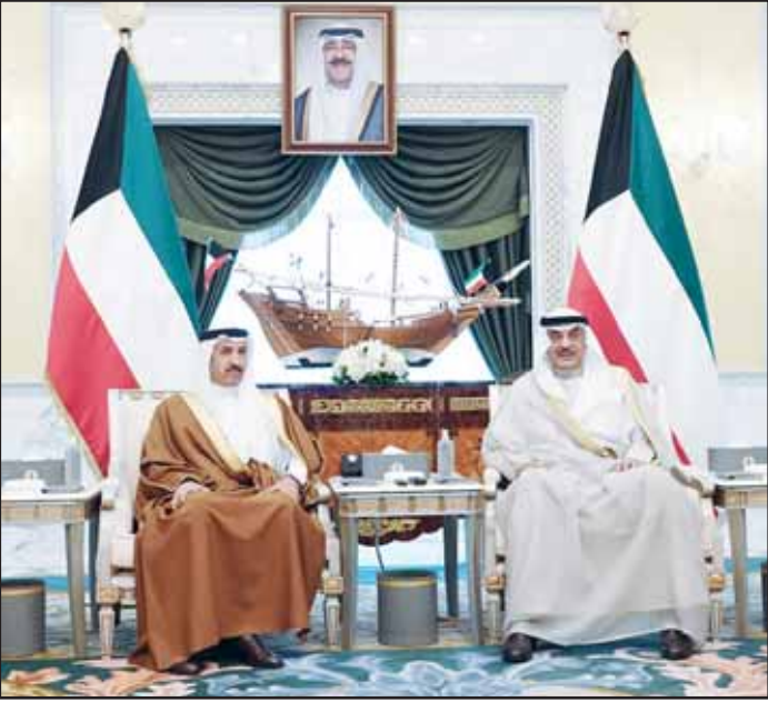
His Highness the Crown Prince Sheikh Sabah Khaled Al-Hamad Al-Sabah receives the Bahraini Minister of Telecommunication and Transportation Sheikh Dr. Abdullah bin Ahmad Al-Khalifa.