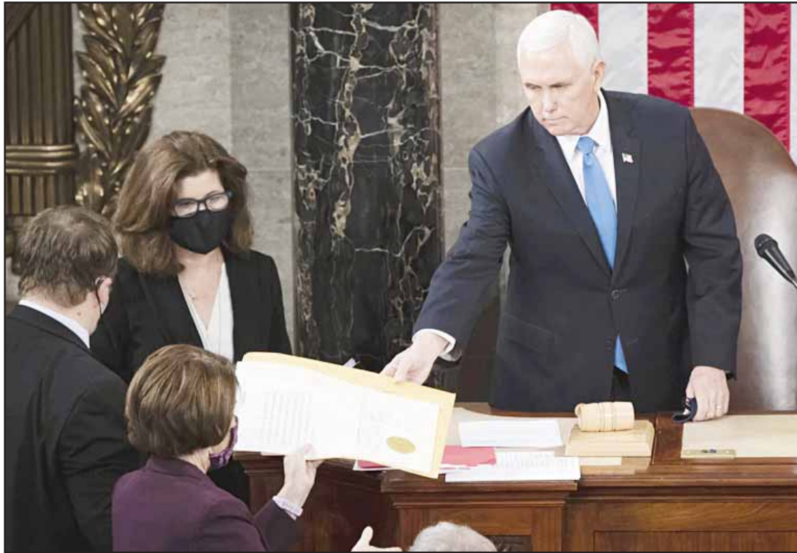
US Vice President Mike Pence hands the electoral certificate from the state of Arizona to Sen Amy Klobuchar, D-Minn, as he presides over a joint session of Congress as it convenes to count the Electoral College votes cast in November's election, at the Capitol in Washington on Jan 6, 2021.

BOSTON, May 4, Former US Vice President Mike Pence on Sunday will receive the John F. Kennedy Profile in Courage Award for his refusal to go along with President Donald Trump's efforts to remain in office after losing the 2020 election.