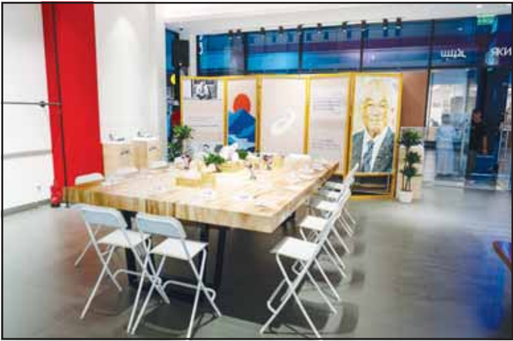
SNKR Store during the event.