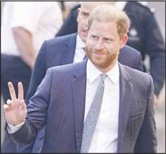
Prince Harry gestures as he arrives at the High Court in London, England, April 8, 2025.

He said that is not as good as police protection, which is provided for life to "people who leave public office," such as former prime ministers. "I can never leave the royal family," he said. "I was born into those risks, and they've only increased over time." He claimed that "some people want history to repeat itself," an apparent reference to the death of his mother Princess Diana. She was killed in a car crash in Paris in 1997 while being pursued by paparazzi.