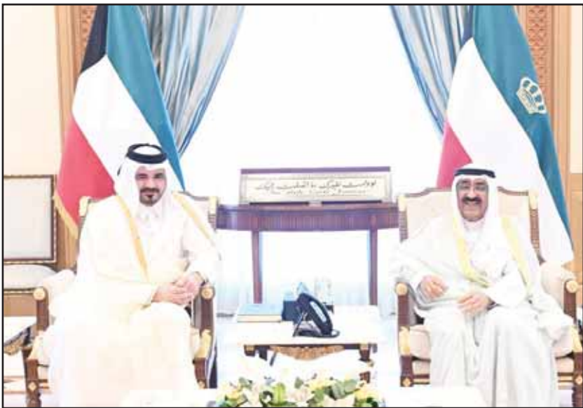
His Highness the Amir Sheikh Meshal Al-Ahmad Al-Jaber Al-Sabah receives (left) President of the Qatar Olympic Committee, Sheikh Joaan bin Hamad Al-Thani and (right) Bahraini Minister of Telecommunication and Transportation Sheikh Dr. Abdullah bin Ahmad Al-Khalifa at Seif Palace. – See Page 2

Also on Sunday, His Highness the Crown Prince Sheikh Sabah Khaled Al-Hamad Al-Sabah received at Seif Palace on Sunday the Acting Prime Minister Sheikh Fahad Yousuf Saud Al-Sabah.