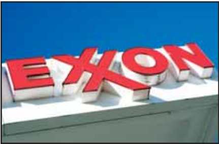
This is the sign on a Exxon gas station in Pittsburgh on Wednesday, Oct. 9, 2024. (AP)

WASHINGTON, May 4, (AP): Exxon Mobil's first quarter profit slumped to the lowest level in years, stung by weaker crude prices and higher costs. The oil and gas giant earned $7.71 billion, or $1.76 per share, for the three months ended March 31. It earned $8.22 billion, or $2.06 per share, in the year-ago period. The results topped Wall Street expectations, but Exxon does not adjust its reported results based on one-time events such as asset sales. Analysts polled by Zacks Investment Research expected earnings of $1.74 per share. Revenue totaled $83.13 billion, which fell short of the $84.15 billion that analysts were calling for. Chevron also reported its lowest first-quarter profits in years, with per-share adjusted profit falling to $2.18 per share on revenue of $47.61 billion. Similar to Exxon, Chevron does not adjust its reported results based on one-time events such as asset sales. Analysts predicted earnings of $2.15 per share on revenue of $48.66 billion. The last time first-quarter profits were this low for Exxon was in 2022 and for Chevron, in 2021. This week, a barrel of U.S. benchmark crude fell below $60, a level at which many producers can no longer turn a profit. "In this uncertain market, our shareholders