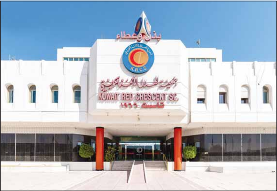
The Kuwait Red Crescent Society building.

— Compiled by Mahmoud Attiyeh / Simi K. Kutty