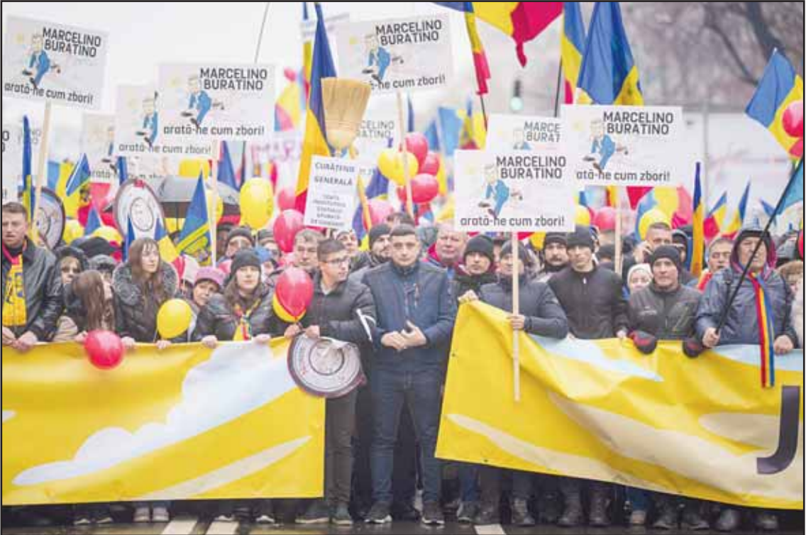
George Simion, (center), presidential candidate for the Alliance for the Union of Romanians (AUR) stands during a protest calling for the resignation of the country’s Prime Minister Marcel Ciolacu in Bucharest, Romania on March 1.