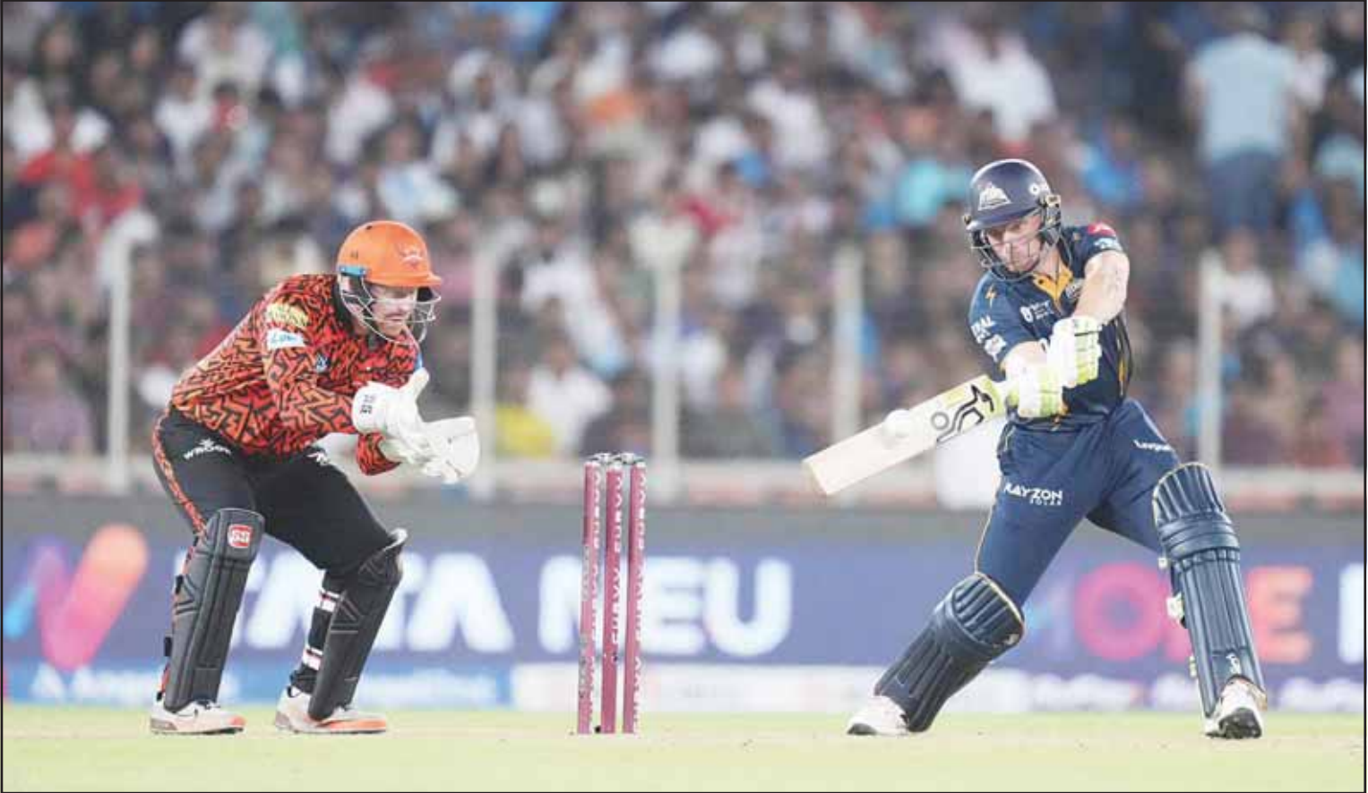
Gujarat Titans' Jos Buttler plays a shot during the Indian Premier League cricket match between Gujarat Titans and Sunrisers Hyderabad at Narendra Modi Stadium in Ahmedabad, India.