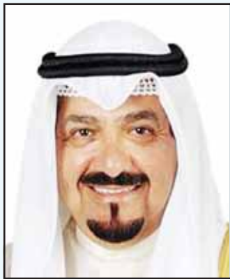
HH the Prime Minister

its friendly people further progress and prosperity. His Highness the Crown Prince Sheikh Sabah Khaled Al-Hamad Al-Sabah also sent Saturday a congratulatory cable to Polish President Andrzej Duda on the occasion of his country's National Day,