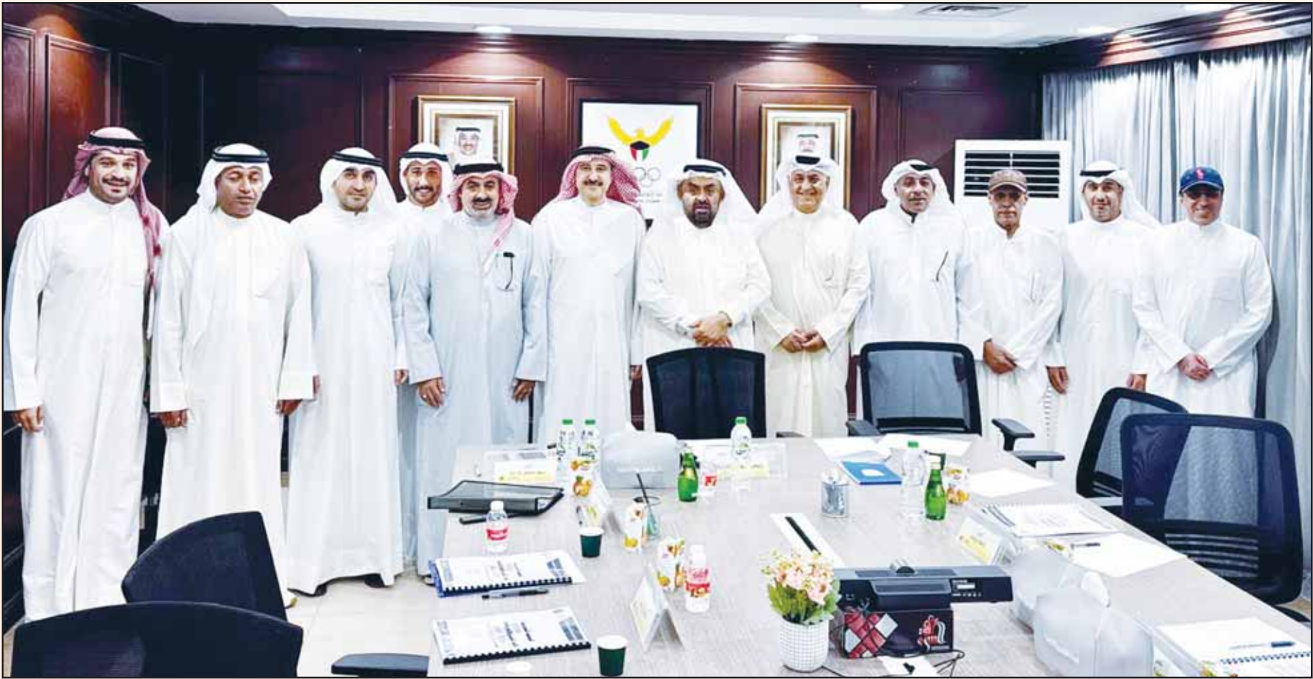
Sheikh Khaled Al-Badr Al-Sabah with board members after the Kuwait Aquatics Federation General Assembly.

In addition, he commended the full cooperation and coordination between KAF and the parents/guardians of both male and female players.