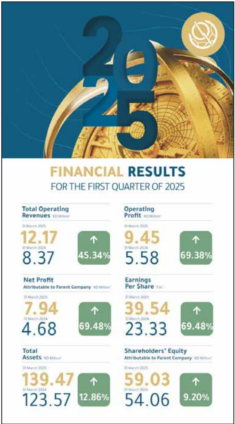
Boursa Kuwait Q1 results.

"The Kuwaiti capital market also continues to consolidate its position as a preferred investment destination, with institutional investors accounting for 66% of total market participants – a key factor in reinforcing the market's