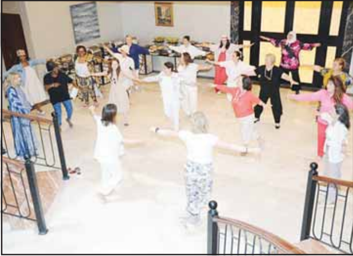
IWG members socialize and participate in fun activities.