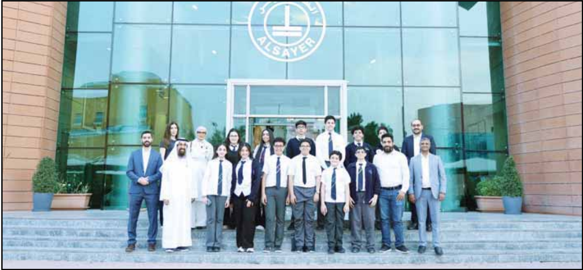
KNRC teams represent Kuwait at global robotics competition.