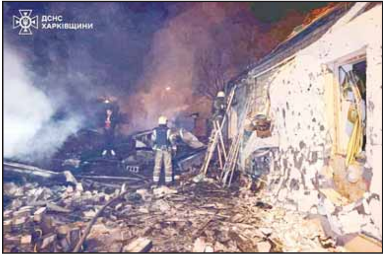
In this photo provided by the Ukrainian Emergency Service, emergency services personnel work to extinguish a fire following a Russian attack in Kharkiv, Ukraine on May 3.