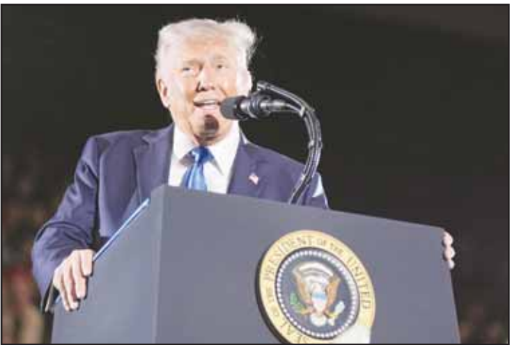
US President Donald Trump gives a commencement address at the University of Alabama on May 1, in Tuscaloosa, Ala.

“big, beautiful bill” of tax cuts and spending reductions. His goal is to repel when he calls a “foreign invasion,” though migrant arrivals to the US are at all-time lows. House Speaker Mike Johnson welcomed the proposal as “a bold blueprint that reflects the values of hardworking Americans and the commitment to American strength and prosperity.” Budgets do not become law, but serve as a touchstone for the coming fiscal year debates. Often considered a statement of values, this first budget since Trump’s return to the White House carries the added weight of defining the Republican president’s second-term pursuits, alongside his party in Congress. It comes as Trump has unilaterally imposed what could be hundreds of billions of dollars in tax increases in the form of tariffs, setting off a trade war that has consumers, CEOs and foreign leaders worried about a possible economic downturn. Trump, in an interview with NBC News’ “Meet the Press” taped Friday, pushed back against recession talk. Asked by Meet the Press host Kristen Welker about Wall Street analysts who have expressed concerns that the chances of a recession are increasing, Trump insisted the economy will do “fantastically.” “Well, you know, you say, some