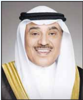
HH the Crown Prince

KUWAIT CITY, May 3, (KUNA): His Highness the Amir Sheikh Meshal Al-Ahmad Al-Jaber Al-Sabah sent Saturday a congratulatory cable to Polish President Andrzej Duda on the occasion of his country's National Day, wishing him good health and Poland and