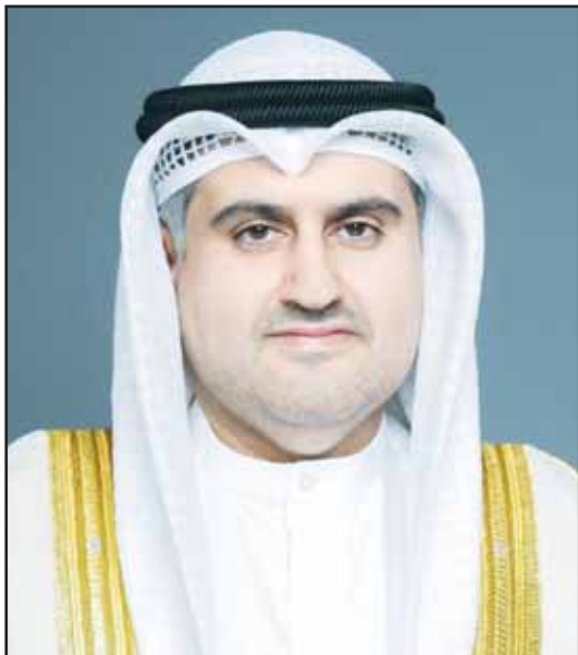
Minister of Justice Nasser Al-Sumait

Scan QR code to visit the website: aljarallah.com