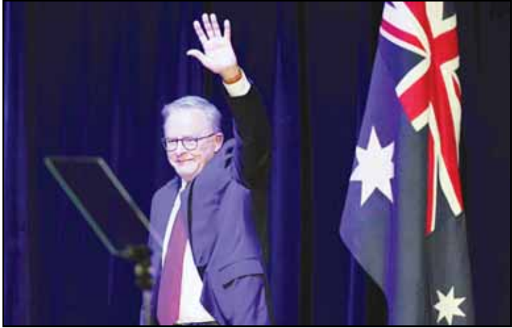
Australian Prime Minister Anthony Albanese waves as he prepares to address the party faithful after winning a second term following the general election in Sydney on May 3.

The ruling center-left Labor Party has branded the opposition leader “DOGE-y Dutton” and accused his party of mimicking US President Donald Trump and his