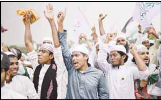
Thousands of activists of Islamist group Hefazat-e-Islam denounce proposed recommendations for equal rights for Muslim women, at a protest rally in Dhaka, Bangladesh on May 3.

DHAKA, Bangladesh, May 3, Thousands of supporters of an Islamist group rallied in Bangladesh’s capital on Saturday to denounce proposed recommendations for ensuring equal rights, including ones related to property, for mainly Muslim women. Leaders of the Hefazat-e-Islam group said the proposed legal reforms are contradictory to the Sharia law. More than 20,000 followers of the group rallied near the Dhaka University, some carrying banners and placards reading “Say no to Western laws on our women, rise up Bangladesh.” The group threatened to organize rallies on May 23 across the country if the government didn’t meet their demands.