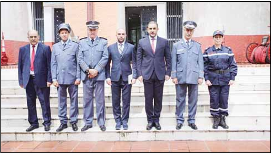
KFF delegation with Algerian officials.

This participation confirms KFF’s commitment to expanding international cooperation and developing its capabilities through partnerships with counterparts in sisterly countries.