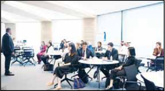
Workshop on the sidelines of the conference.