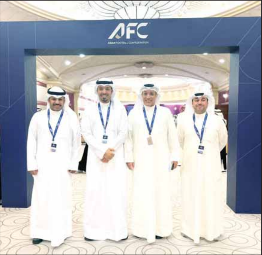
The Kuwait Football Association officials.

Champions, which took place in Jeddah, Saudi Arabia. The AFC delegation is also scheduled to attend the AFC Elite Cup final, followed by meetings of the AFC committees to discuss the competition system for the upcoming 2025-2026 season.