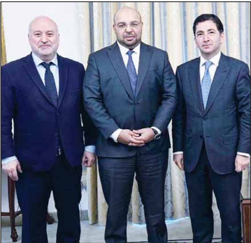
Kuwait's Ambassador to Austria Talal Al-Fassam with Arab President of the Austrian Economic Chamber and Secretary General of the Chamber.

the need for coordination with the sub-committee prior to implementation. Key requirements include compliance with the condition of the General Traffic Department at the Interior Ministry that the station maintains a minimum distance of 10 meters from the curbstone, ensuring there is no obstruction to visibility or traffic signs. It is also necessary to fully abide by security and safety protocols and to obtain the permits from the General Traffic Department. Furthermore, the competent departments are authorized to adjust the dimensions and area of the site within the designated boundaries if conflicts arise with existing infrastructure services or for regulatory reasons.