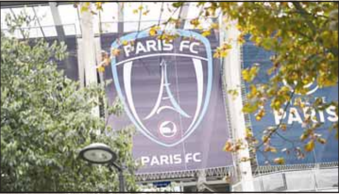
In this file photo, the Paris FC soccer club banner is seen outside the Charlety stadium in Paris, France.

PARIS, May 3, For the first time in 35 years, two Paris-based soccer clubs will be playing in France’s top division. Paris FC, which was recently bought by France’s richest family, secured promotion to the topflight and will join Qatar-funded Paris Saint-Germain next season in the elite as the City of Light’s soccer scene undergoes a major facelift. Paris FC’s promotion to Ligue 1 puts an end to the French anomaly of having only one major football team in the capital. The Associated Press takes a look at the reasons behind the lack of top clubs in Paris. When fans visit some European cities, they are spoiled for choice about which match to watch. While there are seven London clubs in the Premier League this season, there is only one top side in Paris: PSG. It’s a rarity in European soccer, where big cities such as Madrid