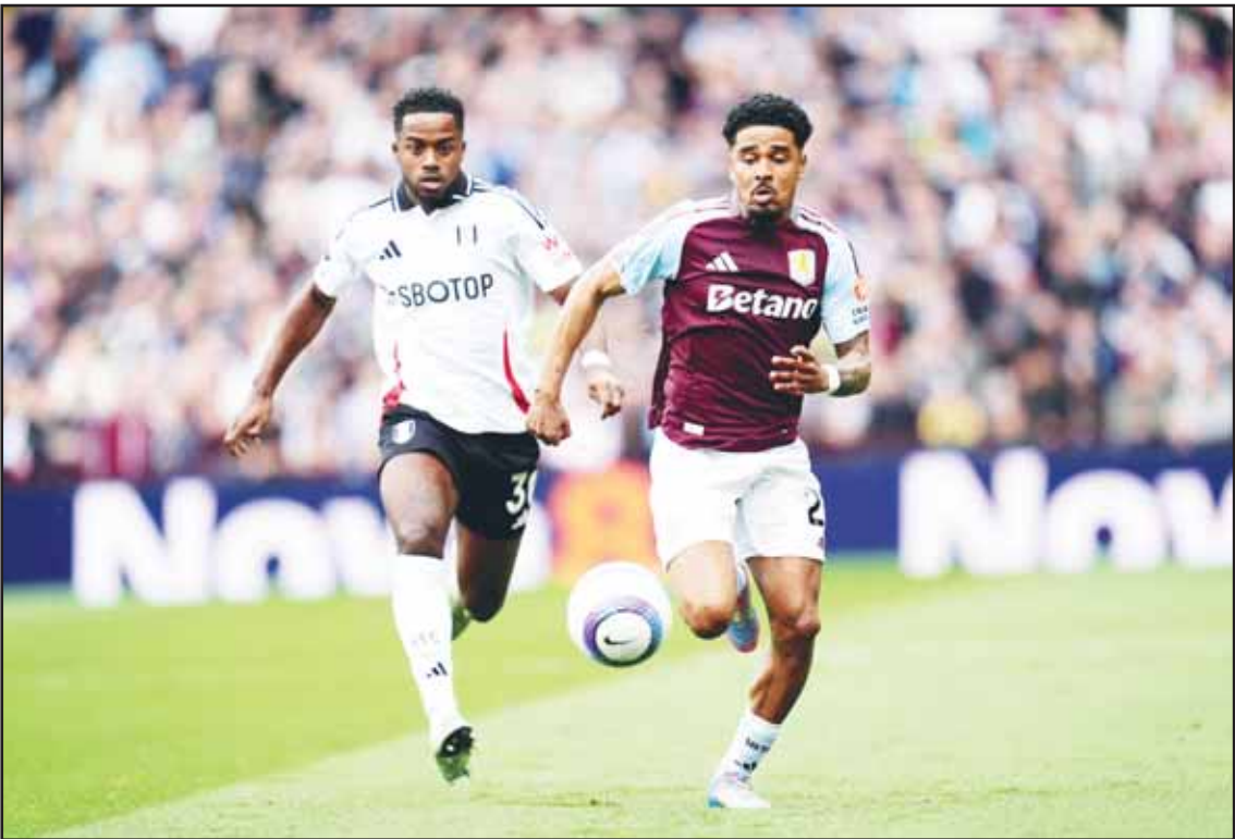
Fulham's Ryan Sessegnon, left, and Aston Villa's Ian Maatsen battle for the ball during the English Premier League soccer match between Aston Villa and Fulham at Villa Park, Birmingham, England.

take one of the Champions League places. Slightly against the run of play, De Bruyne side-footed home a cut back from Jeremy Doku 10 minutes before halftime in his second-to-last appearance at Etihad Stadium. Wolves will be aggrieved at not taking something from the game but were undone by poor finishing and the City goalposts. In the 22nd, Jean-Ricner Bellegarde opted to pass when it looked easier to shoot but Marshall Munetsi at full stretch could not get on the end of his inviting cross. Five minutes later, Rayan Ait-Nouri hit the post then saw his rebound cleared off the line by Josko Gvardiol. The woodwork saved City again in the second half when a Matheus Cunha strike crashed off the post. City coach Pep Guardiola, meanwhile, scotched rumors he's about to leave the club. He recently signed a contract extension until June 2027. Guardiola said he will take a break from management when he leaves City but he told Sky Sports he did not know when that would be. "I didn't say I'm leaving now, or the end of season, or the end of contract, I said when I finish my time here, be it one, two, three, four, five years," the Catalan said. "What I am saying is when I am finished here I will take a break." Some Manchester City fans protested the club's season ticket pricing and policies before the game, taking their seats only after the match kicked off.