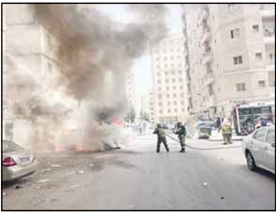
KFF personnel trying to extinguish the fire.

The collaborative effort between the government and responsible media outlets reflects a commitment to reinforce stability, respect freedom of expression, and uphold the rule of law. It is part of a wider campaign against all forms of corruption, aimed at rebuilding trust in State institutions and promoting national reform.