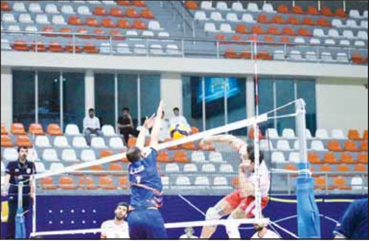
Players challenging for the ball.