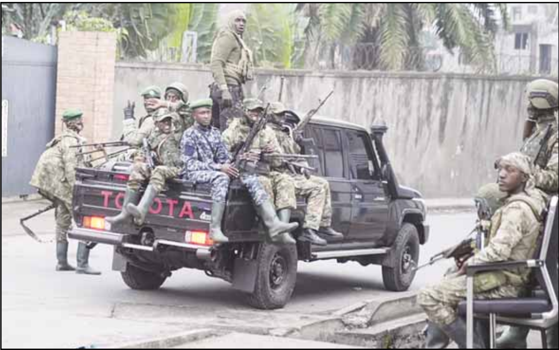
M23 rebels patrol the streets of Goma, Democratic Republic of the Congo on Jan 29.