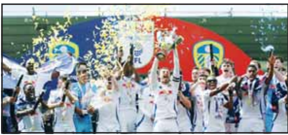
Leeds United players celebrate with the trophy after being crowned champions following the English Football League Championship soccer match against Plymouth Argyle, at Home Park, in Plymouth, England.