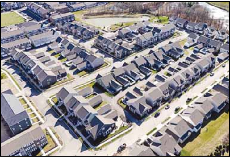
A housing development in Cranberry Township, Pa., is shown on March 29, 2024.

LOS ANGELES, May 3, Homeownership is receding further out of reach for most Americans as elevated mortgage rates and rising prices stretch the limits of what buyers can afford. A homebuyer now needs to earn at least $114,000 a year to afford a $431,250 home -- the national median listing price in April, according to data released Thursday by Realtor.com The analysis assumes that a homebuyer will make a 20% down payment, finance the rest of the purchase with a 30-year fixed-rate mortgage, and that the buyer's housing costs won't exceed 30% of their gross monthly income - an often-used barometer of housing affordability. Based off the latest U.S. median home listing price, homebuyers need to earn $47,000 more a year to afford a home than they would have just six years ago.