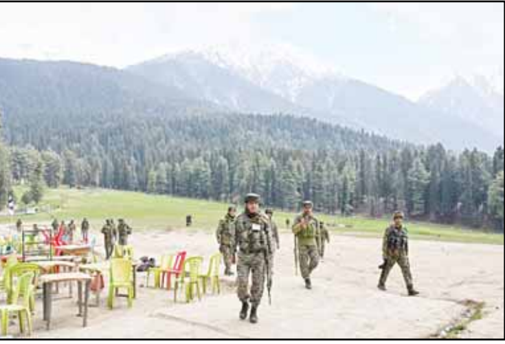
Indian security officers inspect the site a day after where militants indiscriminately opened fire at tourists in Pahalgam, Indian-controlled Kashmir on April 23. (AP)

ISLAMABAD, May 3, (AP): Pakistan test-fired a ballistic missile Saturday as tensions with India spiked over last month’s deadly attack on tourists in the disputed Kashmir region. The surface-to-surface missile has a range of 450 kilometers (about 280 miles), the Pakistani military said. There was no immediate comment about the launch from India, which blames Pakistan for the April 22 gun massacre in the resort town of Pahalgam, a charge Pakistan denies. Pakistan’s military said the launch of the Abdali Weapon System was aimed at ensuring the “operational readiness of troops and validating key technical parameters,” including the missile’s advanced navigation system and enhanced maneuverability features. Pakistan’s President Asif Ali Zardari and Prime Minister Shehbaz Sharif congratulated those behind the successful test. Missiles are not fired toward the border area with India; they are normally fired into the Arabian Sea or the deserts of southwest Balochistan province. Islamabad-based security analyst Syed Muhammad Ali said Saturday’s missile was named after a prominent Muslim conqueror of India, underlining its symbolic significance. “The timing of this launch is critical in the current geopolitical context,” Ali told The Associated Press. He said the test was intended as a strategic signal to India after it had threatened to suspend a crucial water-sharing treaty.