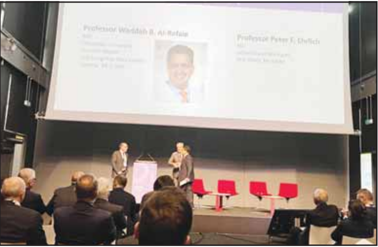
The 31st Annual Meeting of the European Surgical Association held in the Swiss city of Geneva.