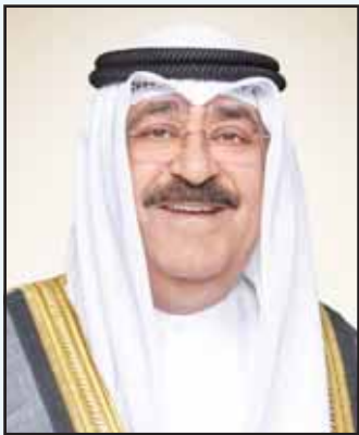
HH the Amir

KUWAIT CITY, May 3, (KUNA): His Highness the Amir Sheikh Meshal Al-Ahmad Al-Jaber Al-Sabah sent Saturday a congratulatory cable to Polish President Andrzej Duda on the occasion of his country's National Day, wishing him good health and Poland and