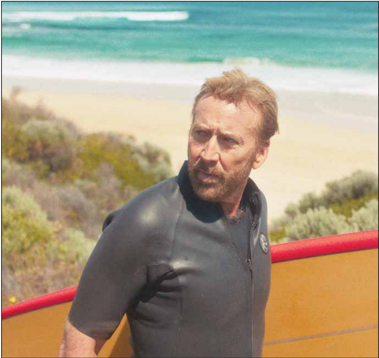
This image released by Roadside Attractions shows Nicolas Cage in a scene from ‘The Surfer.’ (AP)