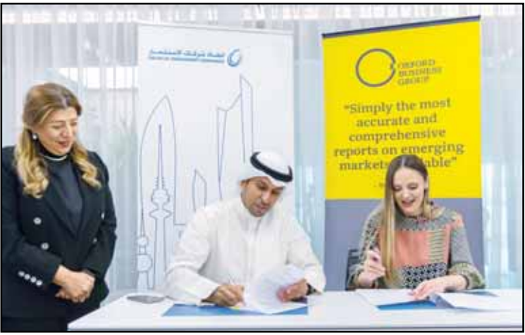
Union of Investment Companies signs MoU with Oxford Business Group.

KUWAIT CITY, May 3: The Union of Investment Companies (UIC) has signed a Memorandum of Understanding (MoU) with Oxford Business Group (OBG), marking the start of a strategic collaboration to support the development of The Report: Kuwait 2025. Under the terms of the agreement, UIC will serve as the publication’s principal financial partner, contributing to the production of a comprehensive analysis of Kuwait’s investment landscape.