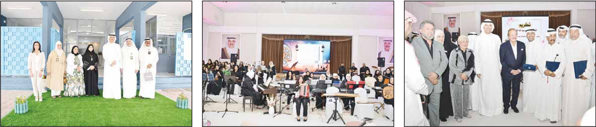
Some photos from the event.