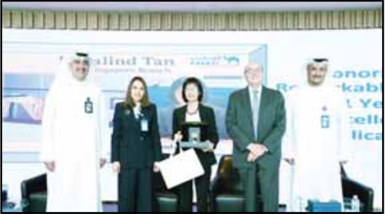
Executive Management during a special tribute to the Head of Human Resources in Singapore.

HR leaders from 13 countries unite at NBK event