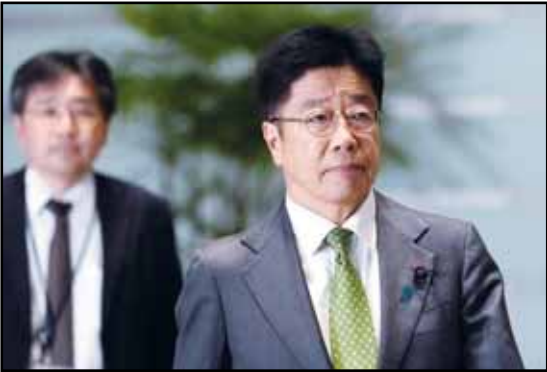
Finance Minister Katsumobu Kato arrives at the prime minister's office Monday, Nov. 11, 2024, in Tokyo.

TOKYO, May 3, Japan's massive holdings of U.S. Treasuries can be "a card on the table" in negotiations over tariffs with the Trump administration, Finance Minister Katsumobu Kato said Friday. "It does exist as a card, but I think whether we choose to use it or not would be a separate decision," Kato said during a news show on national broadcaster TV Tokyo. Kato did not elaborate and he did not say Japan would step up sales of its holdings of U.S. government bonds as part of its talks over President Donald Trump's tariffs on exports from Japan. Earlier, Japanese officials including Kato had ruled out such an option. Japan is the largest foreign holder of U.S. government debt, at $1.13 trillion as of late February. China, also at odds with the Trump administration over trade and tariffs, is the second largest foreign investor in Treasuries. Kato stressed that various factors would be on the negotiating table with Trump, implying that a promise not to sell Treasuries could help coax Washington into an agreement favorable for Japan. Trump has disrupted decades of American trade policies, including with key security allies like Japan, by imposing big import taxes, or tariffs, on a wide range of products. A team of Japanese officials was in Washington this week