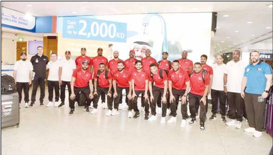
The UAE team arrives for the championship.

According to the tournament format, the three group winners and the best second-placed team will advance to the semi-finals.