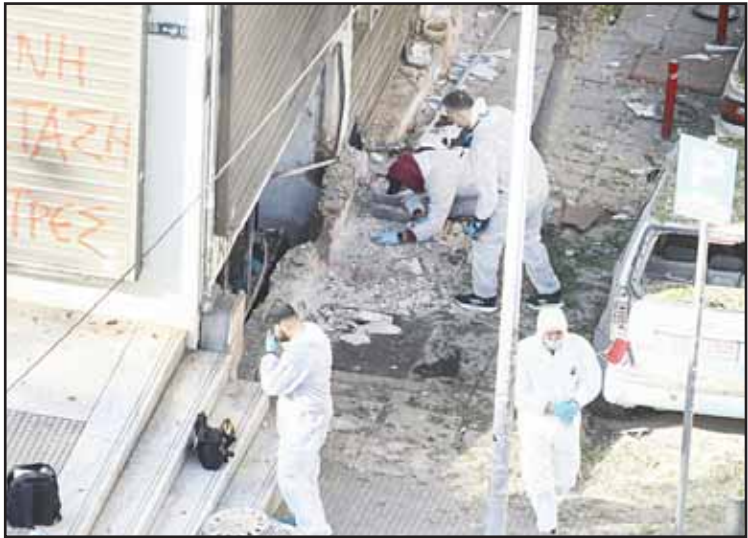
Greek police forensic experts search the spot where a 38-year-old woman was killed early Saturday when a bomb she was carrying exploded in her hands, local police said, in Thessaloniki, northern Greece on May 3.

THESSALONIKI, Greece, May 3, A woman was killed early Saturday in the northern Greek city of Thessaloniki when a bomb she was carrying exploded in her hands, police said. The 38-year-old woman apparently was carrying the bomb to place outside a nearby bank around 5 a.m., police said. Several storefronts and vehicles were damaged by the explosion. Police said the woman, whom they did not publicly identify, had a criminal record related to drugs and prostitution and had been involved in at least one robbery and thefts in the past. The Greek police’s division for organized crime was investigating the incident, while authorities were also investigating whether the woman might have had ties to extreme leftist groups.