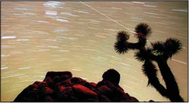
A meteor streaks through the sky in Southern California's Mojave Desert, Nov. 17, 1998. Stars moving through the sky as the Earth rotates are seen as a series of short lines across the frame.

every year including the Eta Aquarids. When this meteor shower lights up the night sky, "you'll know that Earth is crossing the path of the most famous