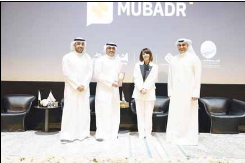
The company was honored by the organizers in appreciation of STC’s clear efforts.