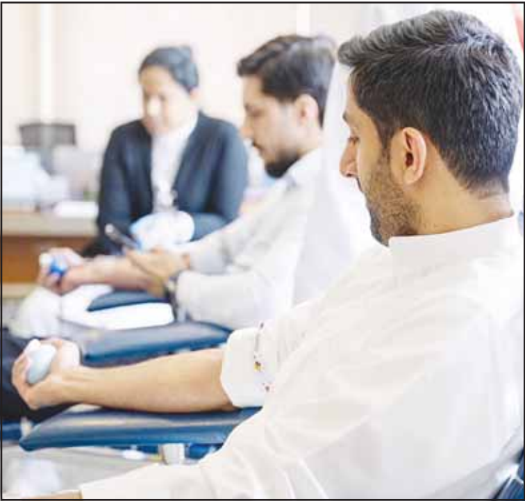
NIC employees volunteer to donate blood during the blood donation campaign.

awareness on the importance of blood donation and reinforcing the company’s partnership with national institutions, including Kuwait Central Blood Bank. NIC further emphasized its dedication to instilling a spirit of volunteerism among its staff by encouraging participation in various humanitarian and charitable events, including blood donation drives and other initiatives, particularly during the holy month of Ramadan. In conclusion, NIC extends its sincere gratitude to all employees who participated in the campaign and generously donated blood, praising their noble contributions and the values they represent. The company also expressed heartfelt thanks to Kuwait Central Blood Bank team for their continuous efforts and steadfast support in making the campaign a success. In support of Kuwait Vision 2035, NIC remains committed to driving progress in sustainability across environmental, social, and governance (ESG) dimensions through strategically selected initiatives both within and beyond the company.