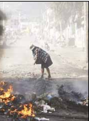
A woman sweeps debris next to a blazing barricade set up by demonstrators during a protest against insecurity in Port-au-Prince, Haiti on April 2.

SAN JUAN, Puerto Rico, May 3, The US on Friday officially designated a powerful gang coalition in Haiti as a foreign terrorist organization, raising concerns the move could deepen the country’s humanitarian crisis at a critical time. The Viv Ansanm coalition, which means “Living Together,” joins a list of eight Latin American criminal organizations under that category. Gran Grif, the biggest gang to operate in Haiti’s central Artibonite region, also was added to the list, as reported by The Associated Press on Tuesday. “The age of impunity for those supporting violence in Haiti is over,” US Secretary of State Marco Rubio said in a statement Friday. The US Department of State warned that “persons, including American citizens, that engage in certain transactions or activities with these entities, or these individuals may expose themselves to sanctions risk.” But it’s nearly impossible for aid groups and others to avoid dealing with gangs in Haiti. The Viv Ansanm coalition controls at least 85% of the capital, Port-au-Prince. This forces nonprofits and other groups