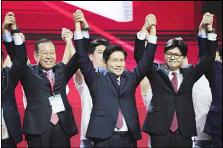
South Korea’s former Labor Minister Kim Moon Soo, (center), celebrates after winning the nomination as the presidential election candidate during the People Power Party’s convention in Goyang, South Korea on May 3. (AP)

SEOUL, South Korea, May 3, (AP): Former Labor Minister and staunch conservative Kim Moon Soo won the presidential nomination of South Korea’s main conservative party, facing an uphill battle against liberal front-runner Lee Jae-myung for the June 3 election. Observers say Kim will likely try to align with other conservative forces, such as former Prime Minister Han Duck-soo, to prevent a split in conservative votes and boost prospects for a conservative win against Lee. In a party primary that ended Saturday, Kim won 56.5% of the votes cast, beating his sole competitor, Han Dong-hun, the party said in a televised announcement. Other contenders have been eliminated in earlier rounds. “I’ll form a strong alliance with anyone to prevent a rule by Lee Jae-myung and his Democratic Party forces. I’ll push for that in a procedure and method that our people and party members accept, and I’ll ultimately win,” Kim said in his victory speech. The June 3 election is meant to find a successor to conservative President Yoon Suk Yeol, a People Power Party member who was impeached by the opposition-controlled National Assembly in mid-December and dis-