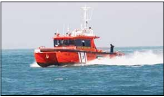
The KFF boat off to the rescue.

They affirmed the importance of coordination and collaboration among all relevant government agencies throughout the process.