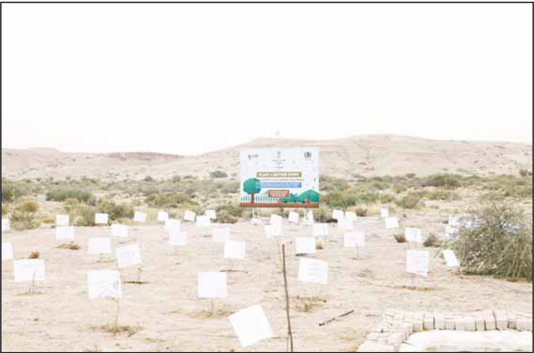
Photos during the tree plantation drive under ‘Plant for Mother’ campaign.

Diplomats, community unite to plant roots of love and sustainability