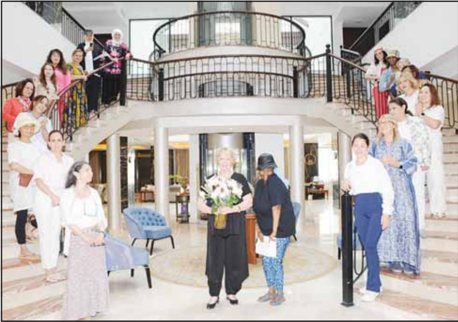
International Women's Group members enjoy a fun-filled summer gathering at a beach-side venue.

KUWAIT CITY, May 3: As part of its ongoing commitment to social responsibility and in alignment with its Corporate Social Responsibility (CSR) initiatives, the National Investments Company (NIC) has organized a blood donation campaign in collaboration with Kuwait Central Blood Bank. The campaign, held at the company’s headquarters, reflects NIC’s firm belief in the importance of blood donation as a vital contribution, which plays a critical role in saving the lives. This humanitarian and awareness-driven campaign is part of NIC’s broader efforts to support Kuwait Central Blood Bank’s reserves and raise awareness about the importance of regular blood donation. The initiative saw wide participation and enthusiastic engagement from the company’s employees, showcasing their commitment to making a meaningful impact on society. Commenting on the campaign, the National Investments Company affirmed that this initiative reflects its deep commitment and responsibility towards the community. It embodies NIC’s humanitarian role and promotes a culture of social engagement, while also enhancing employee awareness on the importance of blood donation and reinforcing the company’s partnership with national institutions, including Kuwait Central Blood Bank. NIC further emphasized its dedication to instilling a spirit of volunteerism among its staff by encouraging participation in various humanitarian and charitable events, includ-