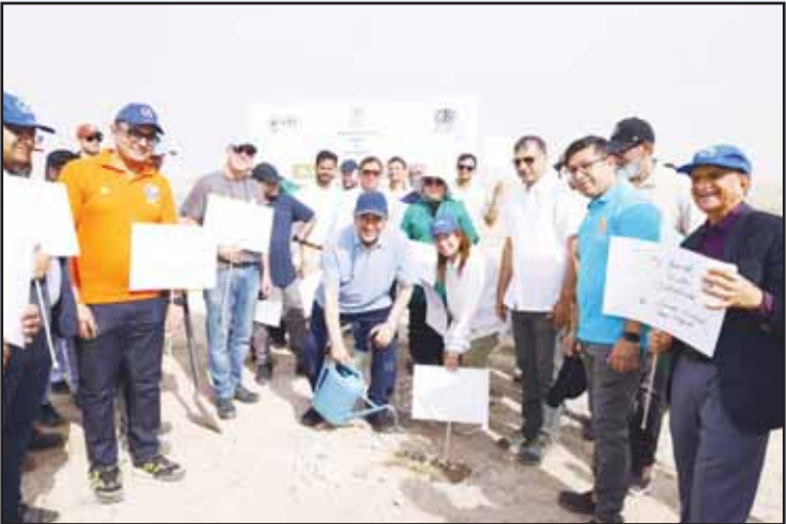
Participants plant local saplings (Rhanterium epapposum, Calligonum comosum, Acacia gerrardii ) and put a placard with the name of their mother on it.