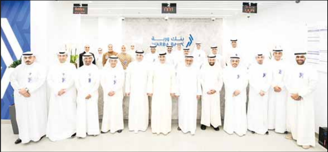
Board of Directors and Staff of the Shamiya branch.