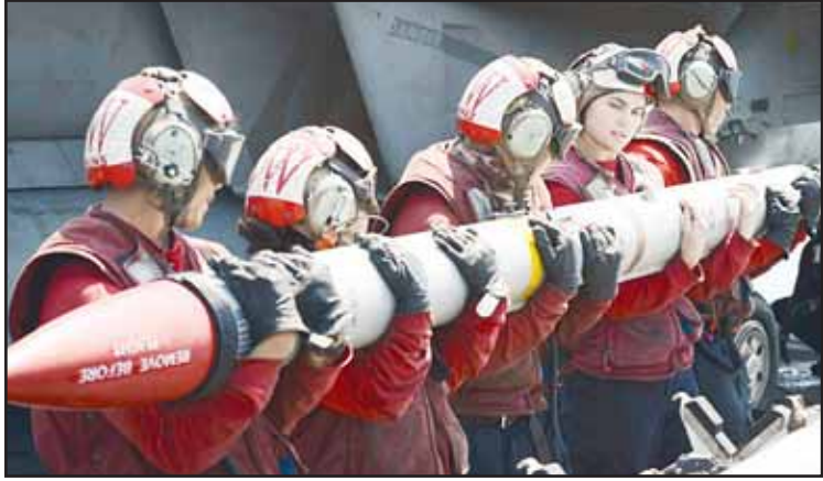
In this handout photo from the US Navy, sailors load an AIM-120C missile into an F/A-18E Super Hornet aboard the aircraft carrier USS Nimitz in the Arabian Gulf on Aug 8, 2017.

DUBAI, United Arab Emirates, May 3, The United States has given initial approval to sell $3.5 billion worth of air-to-air missiles for Saudi Arabia’s fighter jets, the latest proposed arms deal for the region ahead of President Donald Trump’s planned trip to the region later this month. The sale, announced early Saturday, likely will be one of several heralded by Trump on his visit to the kingdom. Saudi Arabia has already said it wants to invest $600 billion in the United States over the next four years, likely as a way to woo Trump to again pick the kingdom for his first formal trip as president. Trump traveled to Italy briefly for Pope Francis’ funeral. Trump’s 2017 trip to Saudi Arabia upended a tradition of modern U.S. presidents typically first heading to Canada, Mexico or the United Kingdom for their first trip abroad. It also underscored his administration’s close ties to the rulers of the oil-rich Gulf states as his eponymous real estate