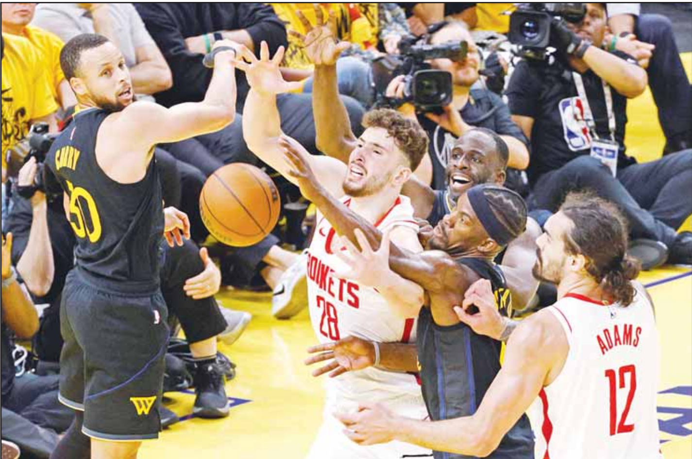
Houston Rockets center Alperen Sengun (28) and Golden State Warriors forward Jimmy Butler III (10) go for the loose ball in the fourth quarter of Game 6 of an NBA basketball first-round playoff series in San Francisco.