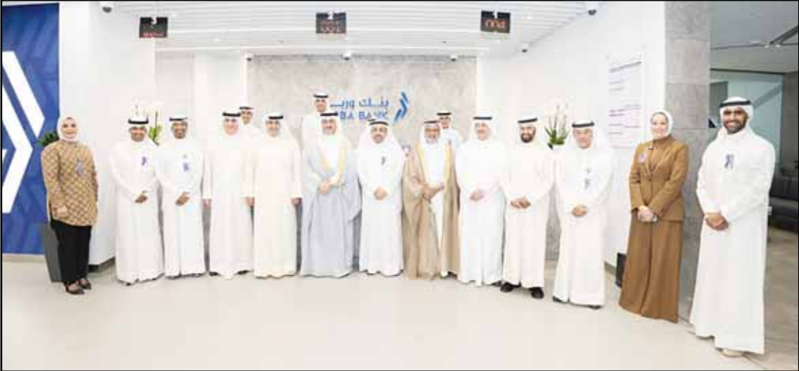
His Excellency the Capital Governor, Sheikh Abdullah Salem Al-Ali Al-Sabah