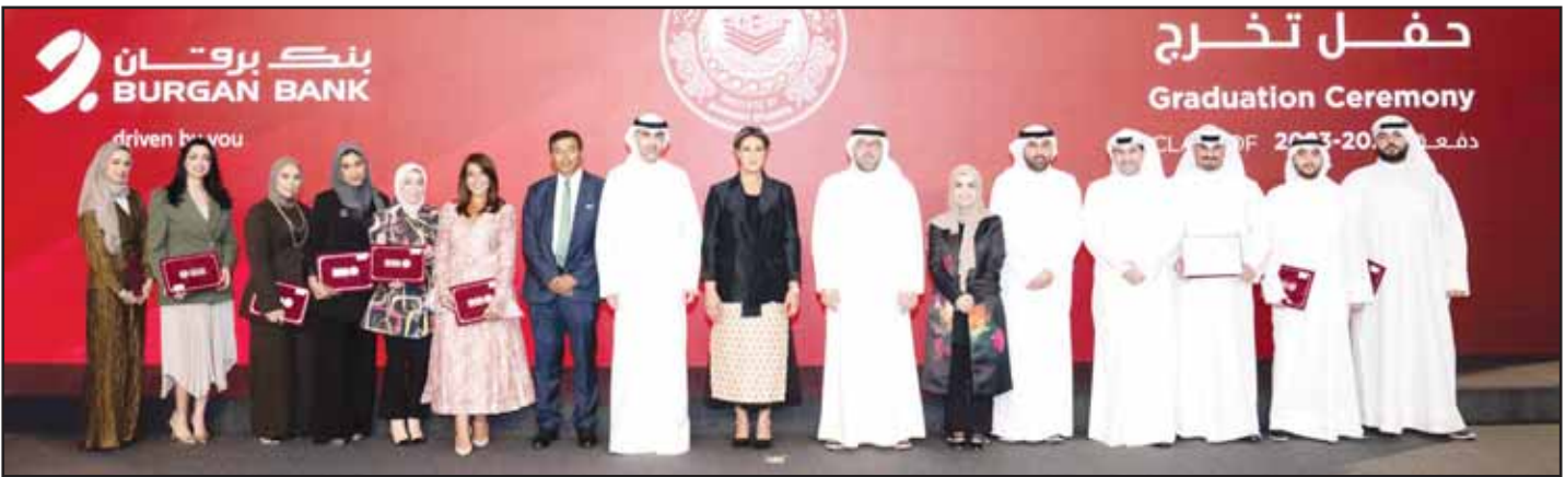
A group photo of the graduates.

In line with the bank's human capital strategy and ESG commitment