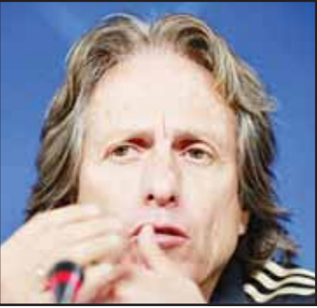
In this file photo, Benfica's coach Jorge Jesus gestures as he talks during a news conference at Benfica's Luz stadium in Lisbon.