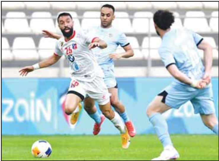
A Kuwait Club player runs with the ball while being harassed by an Al-Salmiya player during the Zain Premier League match.

With just two rounds remaining, Kuwait Club sits on 54 points – two ahead of second-placed Al-Arabi. The decisive final rounds are fast approaching: Kuwait Club will meet Al-Qadsiya, while Al-Arabi faces Al-Tadamon in the fourth round this Tuesday. The much-anticipated clash between Kuwait Club (“the Whites”) and Al-Arabi (“the Greens”) will take