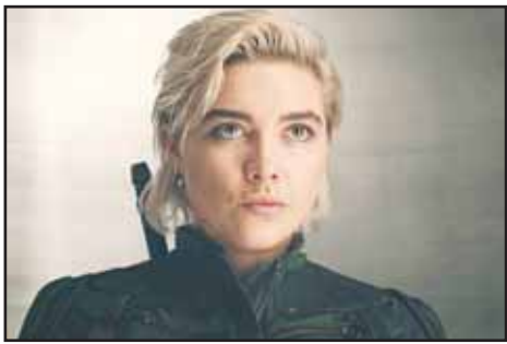
This image released by Marvel Studios shows Florence Pugh in a scene from ‘Thunderbolts.’

Shadows and death drape “Thunderbolts.” When Yelena is dispatched on what she says will be her last job, she’s surprised to encounter others like her - include the disgraced John Walker (Wyatt Russell) and the fight-mimicking Taskmaster (Olga Kurylenko) - sent to the same location. After some initial tussling, they realize they - like the protagonists of “Toy Story 3” - are standing inside of an incinerator. Adding to the confusion of their predicament is a guy with no apparent powers who simply introduces himself as “Bob” (Lewis Pullman,