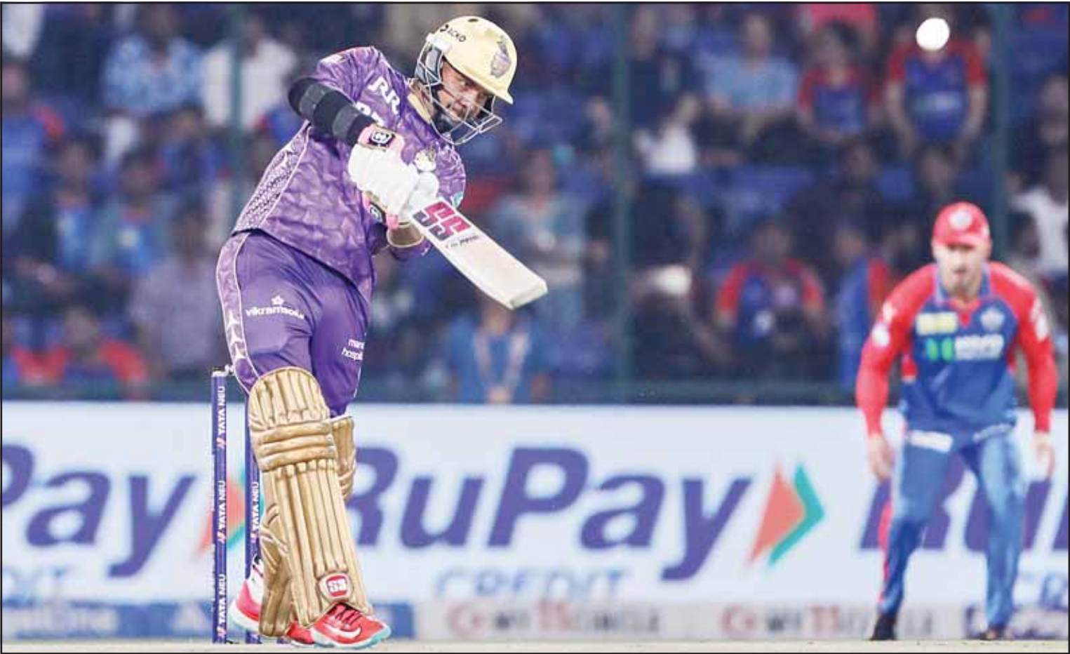
Kolkata Knight Riders' Sunil Narine plays a shot during the Indian Premier League cricket match between Delhi Capitals and Kolkata Knight Riders at Arun Jaitley Stadium in New Delhi, India.