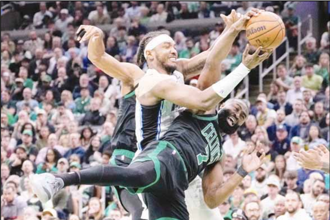
Boston Celtics guard Jaylen Brown (7) battles for a loose ball against Orlando Magic center Wendell Carter Jr. (34) during the first half in game 5 of a first-round NBA playoff basketball series in Boston.