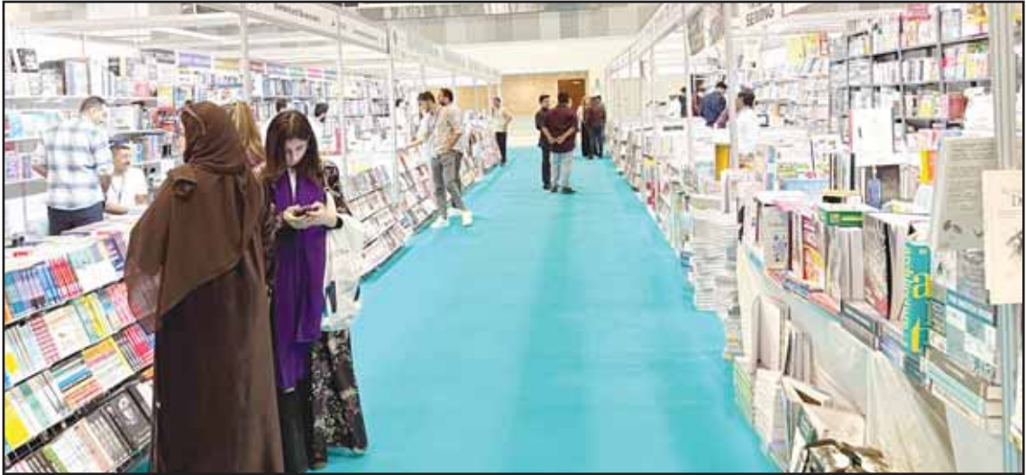
Part of the exhibition.