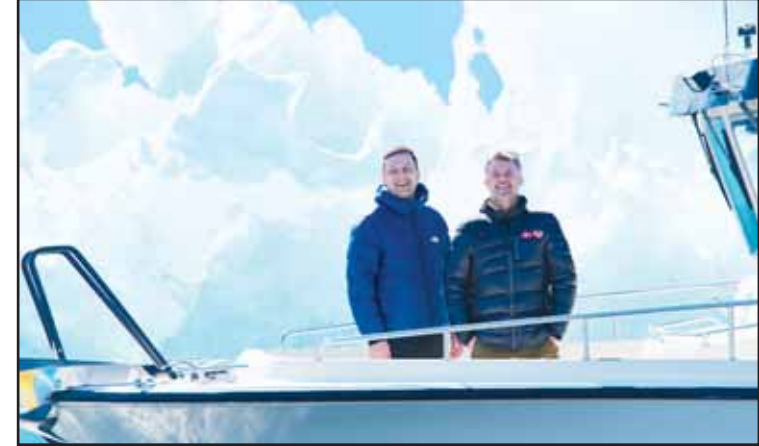
Denmark’s King Frederik, (right), and Greenland’s head of government Jens-Frederik Nielsen in front of an iceberg during a boat trip in Nuuk fjord, in Greenland, Tuesday April 29. (AP)

NUUK, Greenland, April 30, (AP): King Frederik X of Denmark arrived in Greenland on Tuesday, kicking off a visit to the semiautonomous territory that US President Donald Trump wants to annex because of its strategic Arctic location. Frederik’s trip to the island’s capital city of Nuuk follows the new Greenlandic prime minister’s visit to Copenhagen earlier this week. Prime Minister Jens-Frederik Nielsen accompanied the monarch to Nuuk. The king wore a jacket with emblems of the Danish and Greenlandic flags as he disembarked from the plane to applause. Danish broadcaster TV2 asked Frederik about his mission during his trip. He said he wasn’t on a mission, and he was happy to be there. Nielsen also told reporters that the Danish royal house’s love for Greenland can’t be questioned. He added that the monarch is well-liked on the island. The flight was originally scheduled for Monday, but was delayed because of poor weather conditions.