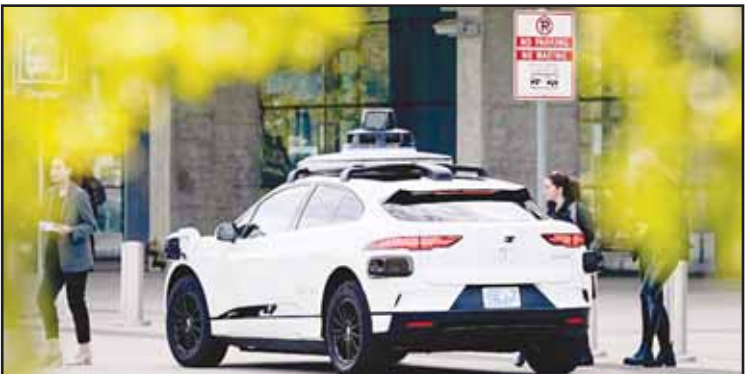
A Waymo self-driving vehicle sits curbside on Dec. 16, 2022, at the Sky Harbor International Airport Sky Train facility in Phoenix.