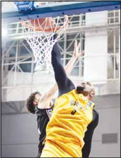
Al-Qadsia player dunks over an opponent.