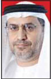
Dr. Al Neyadi

Al-Neyadi pointed out that organizing this event is a manifestation of the leading position of Kuwait in the Gulf and Arab cultural arenas, and its active role in supporting creativity and cultural movement in the region. He affirmed the depth of fraternal relations between the UAE and Kuwait; citing the significant momentum in the form of mutual visits between the