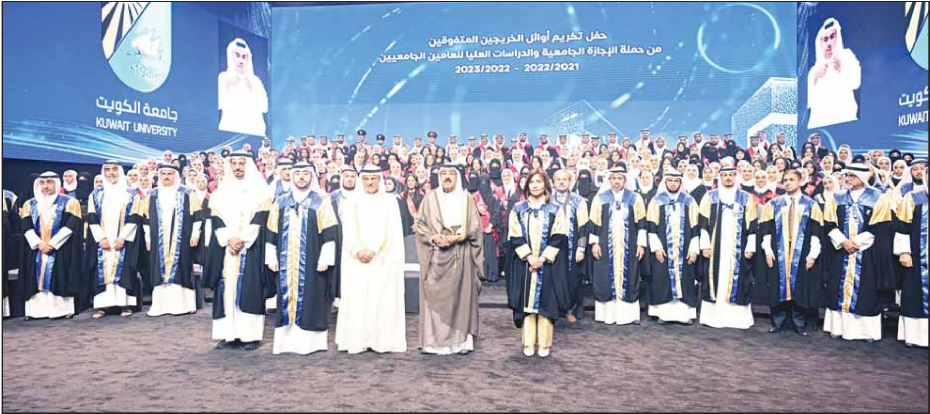
His Highness the Amir Sheikh Meshal Al-Ahmad Al-Jaber Al-Sabah graces the Kuwait University honoring ceremony for outstanding graduates of the 2021/2022 and 2022/2023 academic years, held Wednesday at Al-Dana Theater in Sabah Al-Salem University City.