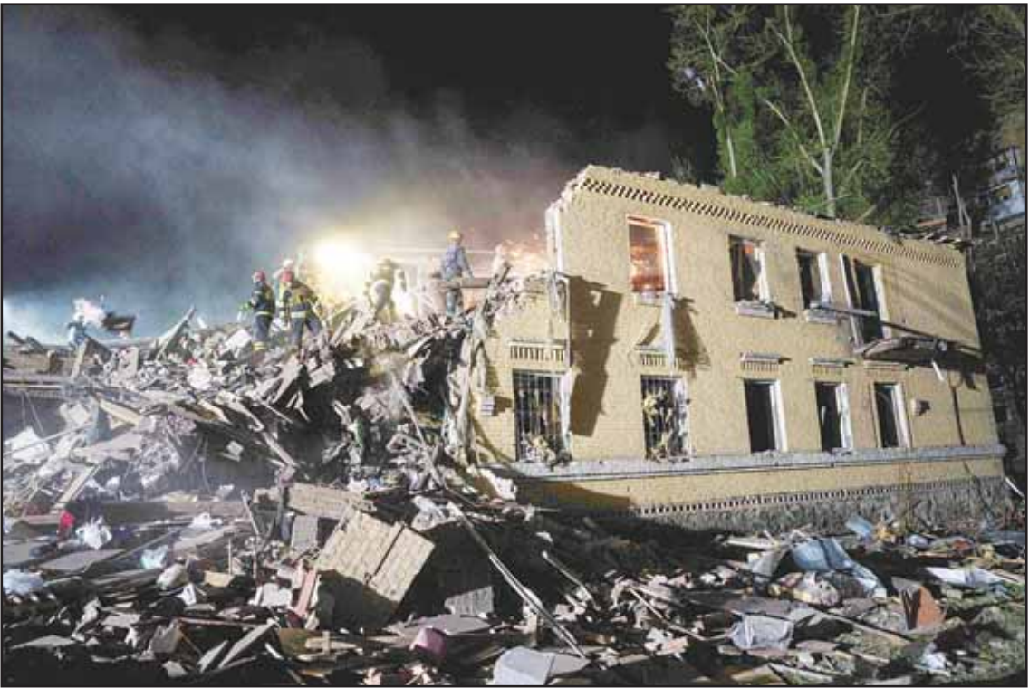
Rescue workers clear the rubble of a house destroyed by a Russian airstrike in Kyiv, Ukraine, on April 24.