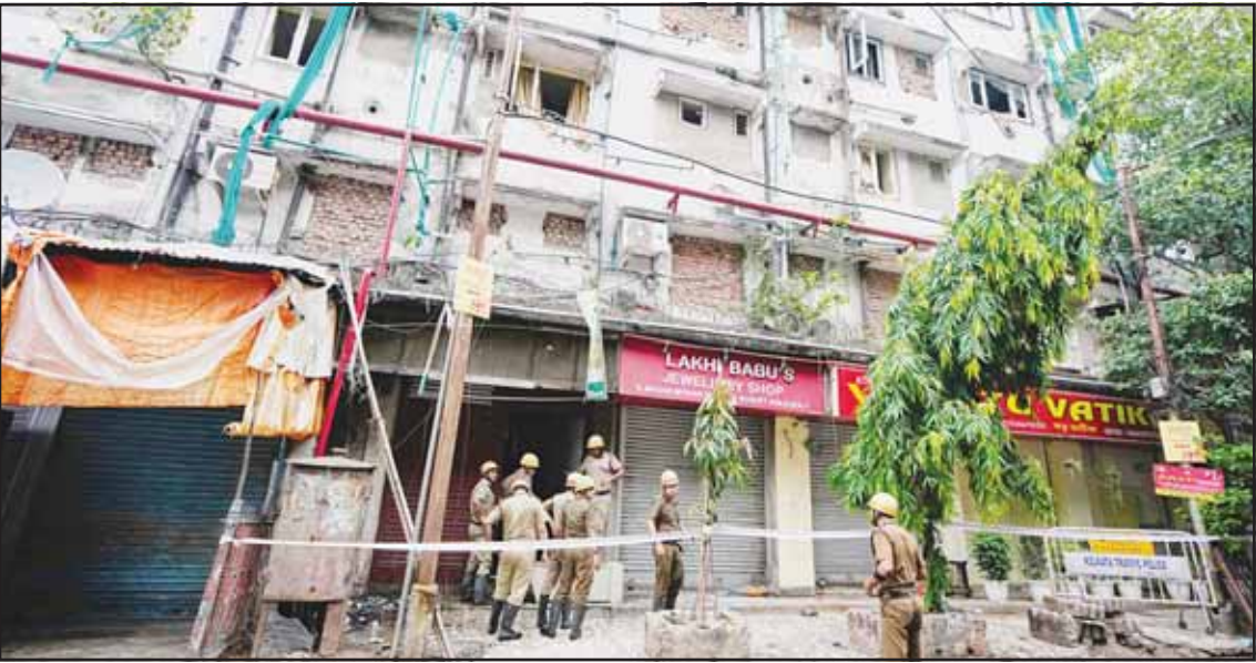
Firefighters inspect a hotel building which caught fire on Tuesday resulting in several deaths, in Kolkata, India on April 30.