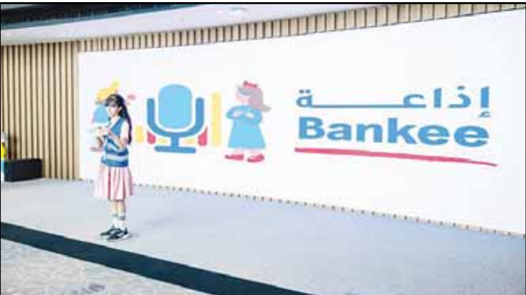
Some more photos of the students participating in 'Bankee' program.

KUWAIT CITY, April 30: National Bank of Kuwait hosted several schools participating in Bankee to explore and simulate the practical application of the program that comes in collaboration with the Ministry of Education, Kuwait Anti-Corruption Authority (Nazaha), and Creative Confidence. NBK’s executive management attended the event as part of its commitment to track the progress of Bankee and the extent to which schools are benefiting from the program, as well as measure its effect upon the students and teachers. The event consisted of four main pavilions simulating classrooms and student-interaction methods, in addition to a corner specifically designed for the store where students are taught the fundamentals of spending, as well as a corner for interactive activities about earning and spending money, and finally a corner for donations to endorse the culture of aiding others and paying back to society. The schools that participated in the event were Al-Fadhl Ibn Al-Abbas Elementary School for boys, Lulwa Mulla Saleh Al-Rabi’a Elementary School for girls, Um Al-Munthir Elementary School for girls, and Al-Sulaibikhat Elementary School for girls. Bankee is the largest and first program in Kuwait,