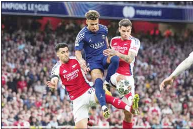
PSG's Desire Doue vies for the ball with Arsenal's Mikel Merino and Jakub Kiwior, right, during the Champions League semifinal first leg soccer match between Arsenal and Paris Saint-Germain at Arsenal Stadium in London, England.

Arsenal goalkeeper David Raya said. "It's only halftime, we take positives." Kvaratskhelia caused Arsenal problems throughout and had a penalty appeal turned down in the 17th minute and a shot saved by David Raya in the 26th. Raya made a better save in the 31st to deny Desire Doue as PSG continually was the more threatening team. At the other end, Gianluigi Donnarumma denied Arsenal an equalizer on the stroke of halftime with a one-handed save to keep out a shot from Gabriel Martinelli. With former Arsenal manager Arsene Wenger looking on in the stands, the Gunners improved in the second half. Mikel Merino thought he had equalized shortly after the break when he headed in a free kick from Declan Rice, but it was disallowed for offside after a lengthy VAR check. Donnarumma, who played a key part in the wins over Liverpool and Aston Villa, then had to make another low one-handed finger-tip save to steer Leandro