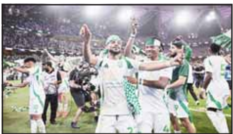
Al Ahli players celebrate after they defeated Al Hilal in a AFC Champions League Elite semifinal soccer match at Alinma Stadium in Jeddah, Saudi Arabia.