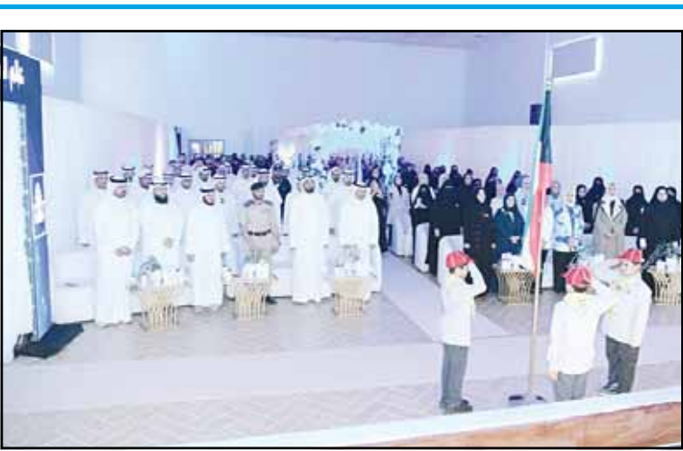
Young students salute the Kuwait national flag.

transformer station in Wafra to support the electricity grid and ensure the continuous availability of electricity without challenges or obstacles. Evaluation in final stages: The Public Authority for Disabled Affairs (PADA) is nearing the final stages of its annual evaluation process for employees in all sectors and job titles, reports Al-Anba daily quoting sources. Sources confirmed that the evaluation was conducted in line with the mechanism approved by the Civil Service Commission (CSC); which specified the criteria such as adherence to attendance, number of days absent, work productivity, and tenure of at least two years at the authority or at any other government institution. Sources said the evaluations are expected to be finalized by next week. "Once completed, the names of eligible employees will be reviewed and approved by the Personnel Affairs Committee. Disbursements for those who qualify will be issued in the second half of May. The authority will open a 60-day window to receive and review grievances related to the annual evaluation," sources explained.