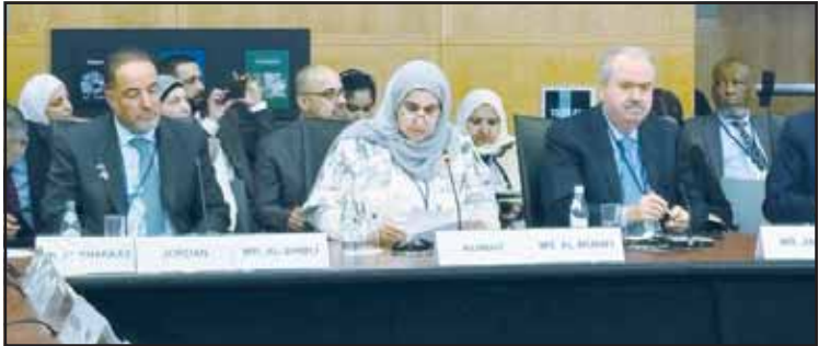
Photo during the meeting.

According to the latest statistics from the Public Authority for Civil Information (PACI) on the number of nationals working in Kuwait Oil Company (KOC) as at the end December 2024 reached 9,585 -- 7,437 males and 1,700 females; while the number of non-Kuwaitis reached 1,448 and the total number of employees reached 10,585 by the beginning of 2025.