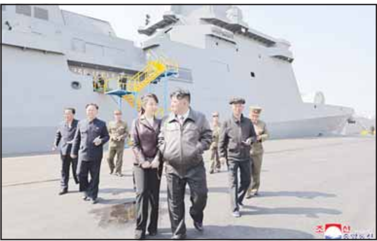
In this photo provided by the North Korean government, North Korean leader Kim Jong Un, (front right), and his daughter visit to observe the test-firings, conducted on April 28 and April 29 of missiles from a newly-launched destroyer 'Choe Hyon' at an undisclosed place in North Korea.