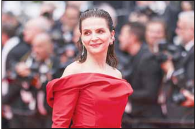
Juliette Binoche appears at the premiere of the film 'The Second Act' during the 77th international film festival, Cannes, southern France, on May 14, 2024.