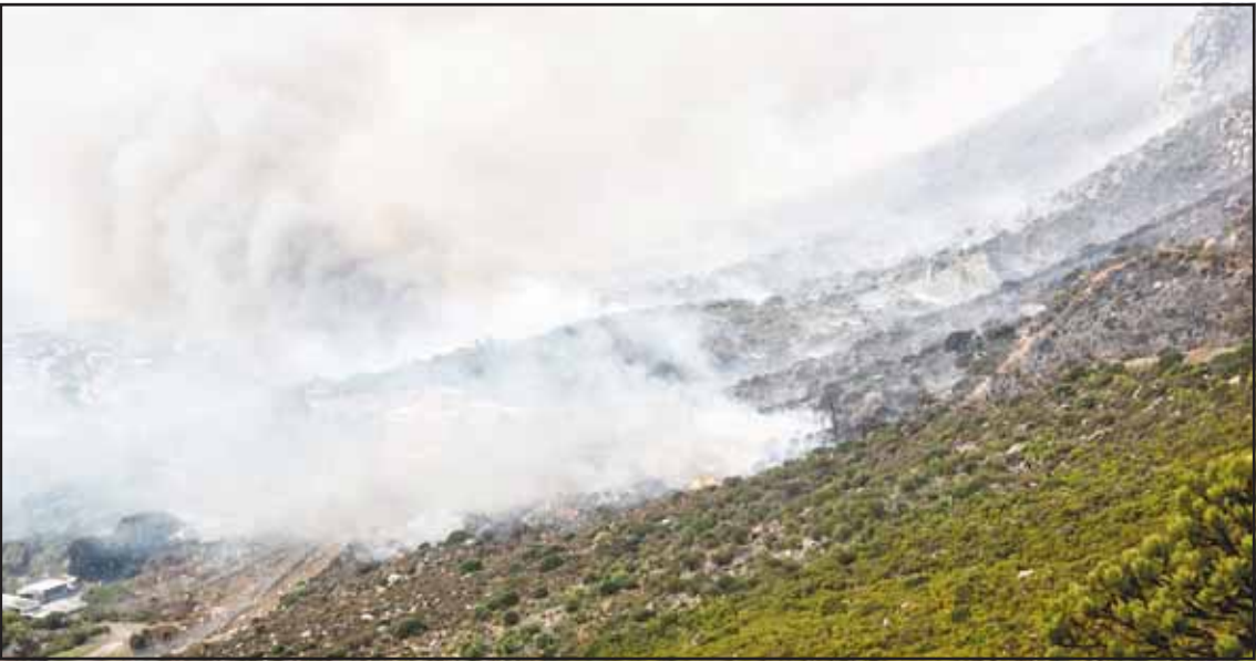
Wildfires burn on the slopes of Table Mountain in Cape Town, South Africa on April 28. (AP)

Photos and videos carried in Indian media showed people trying to escape through the windows and narrow ledges of the building. Kolkata's The Telegraph newspaper reported that at least one person died when he jumped off the terrace trying to escape. Prime Minister Narendra Modi posted on X that he was "anguished" by the loss of lives in the fire. (AP)