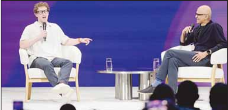
Meta Founder and CEO Mark Zuckerberg, left, speaks with Microsoft Chairman and CEO Satya Nadella at LlamaCon 2025, an AI developer conference, in Menlo Park, Calif., Tuesday, April 29, 2025.