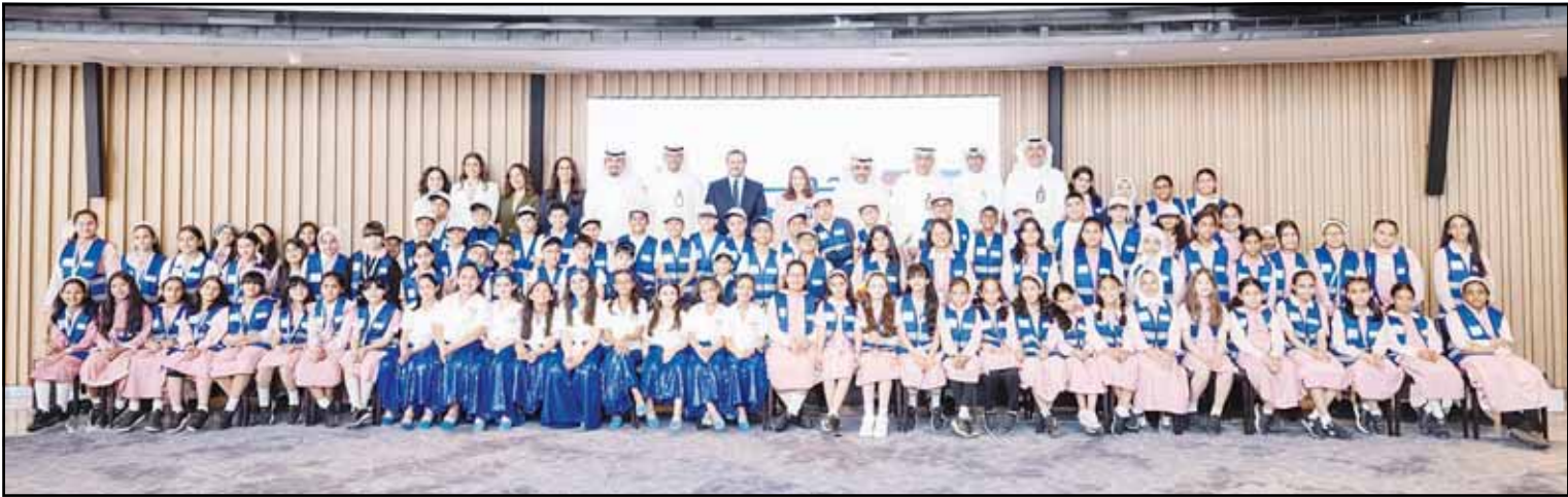
The bank's executive management in a group photo with school students participating in 'Bankee' program.