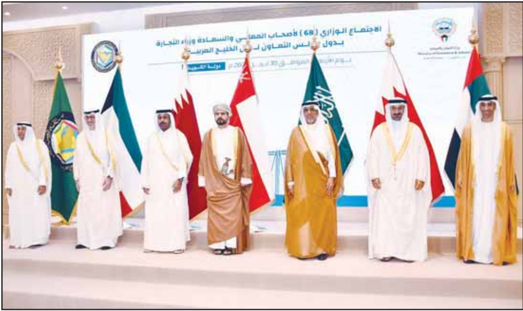
GCC Commerce and Industry Ministers pose for a group photo during key meetings in Kuwait focused on advancing regional economic integration.

KUWAIT CITY, April 30, (KUNA): Kuwaiti Minister of Commerce and Industry Khalifa Al-Ajil affirmed on Wednesday, Kuwait's keenness to strengthen GCC economic and industrial integration, highlighting the importance of coordinating trade and industrial policies and unifying Gulf positions in light of the rapidly changing global economic landscape.