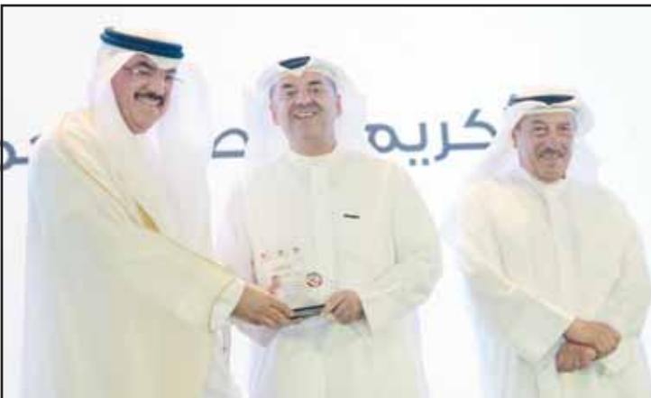
Minister of Education Sayed Jalal Al-Tabtabaei honoring Waleed Al-Khashti for Zain’s support of the conference.

He added: “Our participation comes as part of our solid strategy to support national and regional initiatives focused on youth, education, and public health. At Zain, we believe that investing in awareness and knowledge is the true investment in our nations’ future.