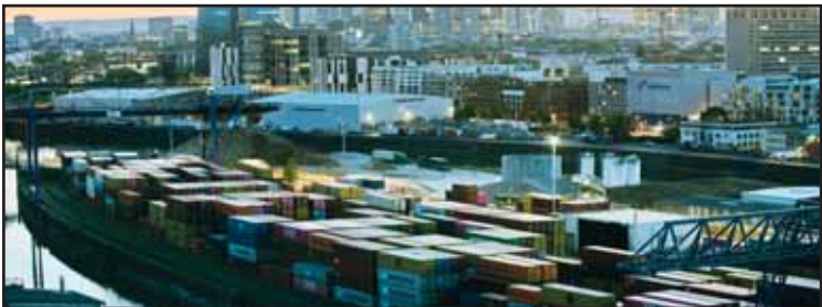
Containers are piled up in a cargo terminal in Frankfurt, Germany, Monday, April 28, 2025. (AP)

FRANKFURT, Germany, April 30, (AP): Europe’s economy grew more strongly in the first three months of the year, only to see hopes for an ongoing recovery quickly squelched by U.S. President Donald Trump’s trade war. Gross domestic product in the 20 eurozone countries grew 0.4% in the first quarter, improving on 0.2% growth in the last part of 2024, according to official figures released Wednesday by European Union statistics agency Eurostat. But on April 2, just two days after the end of the quarter, Trump announced an onslaught of new tariffs on almost every U.S. trading partner and hit goods imported from the EU with a 20% tariff rate. That has led to widespread downgrading of Europe’s growth outlook for the year since its economy is heavily dependent on exports and the U.S. is its largest single export destination. Although Trump has announced a