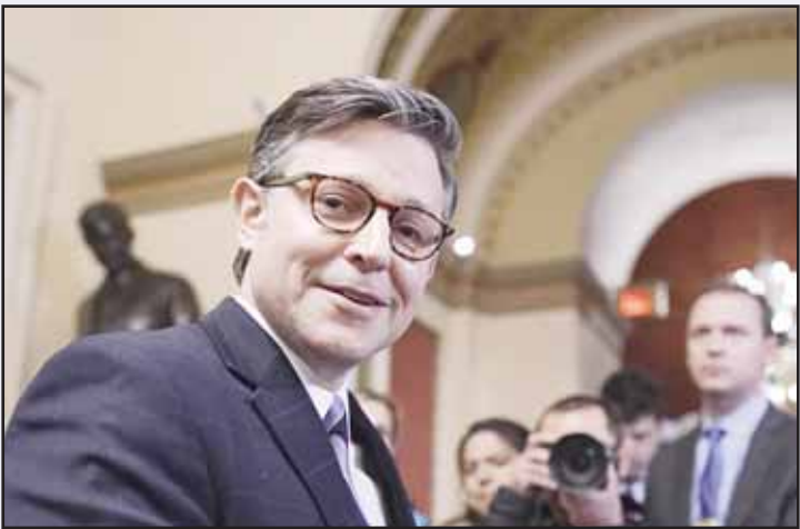
US Speaker of the House Mike Johnson, R-La., talks to reporters just after House Republicans narrowly approved their budget framework, at the Capitol in Washington, on April 10.

at the cornerstone of the GOP’s domestic agenda. As Trump rounds his 100th day in office, the GOP’s stiff immigration provisions come as Americans are showing unease with the president’s approach, with just half saying he’s focused on the right priorities. The White House is battling high-profile court cases after it mistakenly deported a Maryland man to El Salvador and, over the weekend, Trump’s team rounded up countless immigrants, including foreign-born parents who were deported with their American-born toddlers and small children in tow. Democrats are fighting back in the House and Senate, and the halls of public opinion, but as the minority party in Congress, they have little ability to stop the forward march of the package. Instead, they used Tuesday’s hearings to try to shame Republicans into rethinking their approach. “Do a little soul searching before you vote for this,” said Rep. Bennie Thompson of Mississippi, the top Democrat on the Homeland Security Committee, at one point during the debate. Central to the Homeland Committee’s section of the legislation is $46.5 billion to revive construction of Trump’s wall along the US-Mexico