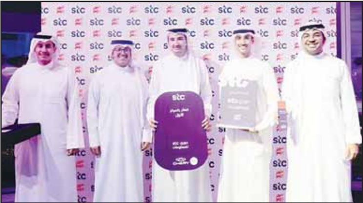
Group photo of the winners.