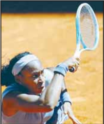
United States' Coco Gauff returns the ball against Belinda Bencic of Switzerland during the Madrid Open tennis tournament in Madrid, Spain.

MADRID, April 30, Iga Swiatek survived "one of the weirdest matches" after losing the first six games and recovering to defeat Madison Keys 0-6, 6-3, 6-2 and stay on track to defend her title at the Madrid Open on Wednesday. Coco Gauff also advanced to the semifinals, beating teenager Mirra Andreeva in straight sets. Swiatek was overpowered by Keys early in their quarterfinal but eventually found a way to rally past the fifth-ranked American on center court. "It was one of the weirdest matches I played," the second-ranked Swiatek said. "Maddie was playing just perfectly at the beginning and I wasn't really proactive with anything. I let Maddie do more mistakes by just putting the ball