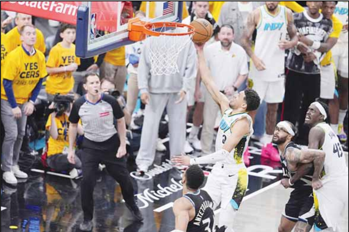
Indiana Pacers guard Tyrese Haliburton (0) shoots the game winning basket over Milwaukee Bucks forward Giannis Antetokounmpo, left, and guard Gary Trent Jr., right, during overtime in Game 5 of an NBA basketball first-round playoff series in Indianapolis.