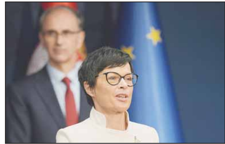
Commissioner for enlargement of the European Commission Marta Kos speaks during a press conference after talks with Serbia’s Prime Minister Djuro Macut in Belgrade, Serbia on April 29. (AP)

BELGRADE, Serbia, April 30, (AP): The European Union’s enlargement commissioner on Tuesday urged Serbia’s new government to push forward democratic reforms needed for membership in the bloc, saying that the Balkan nation’s protesting citizens have been seeking similar changes. Marta Kos spoke after meeting Serbia’s new Prime Minister Djuro Macut, a political novice who took office earlier this month facing monthslong anti-corruption demonstrations triggered by a train station concrete canopy collapse that killed 16 people in November. Many in Serbia blamed the crash in the northern city of Novi Sad on alleged rampant corruption in the government’s infrastructure deals with China, which, along with Russia, is a close ally of Belgrade despite its formal intention to join the EU. The student-led protests have been demanding justice for the victims and the rule of law in the country firmly led by ruling populists. Kos said that the EU has a “once in a generation opportunity to complete the unification of Europe” and wants to embrace Serbia and other candidate countries in the Western Balkans. But she said