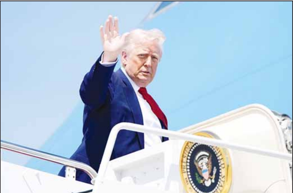
US President Donald Trump waves as he boards Air Force One, Tuesday, April 29, 2025, at Joint Base Andrews, Md.

Automakers and independent analyses have indicated that the tariffs could raise prices, reduce sales and make U.S. production less competitive worldwide. Trump portrayed the changes as a bridge toward automakers moving more production into the United States. “We just wanted to help them during this little transition, short term,” Trump told reporters. “We didn’t want to penalize them.” Treasury Secretary Scott Bessent, who spoke earlier at a White House briefing on Tuesday, said the goal was to enable automakers to create more domestic manufacturing jobs. “President Trump has had meetings with both domestic and foreign auto producers, and he’s committed to bringing back auto production to the U.S.,” Bessent said. “So we want to give the automakers a path to do that, quickly, efficiently and create as many jobs as possible.” Trump signed one order on Tuesday that amended his previous 25% auto tariffs, making it easier for vehicles that are assembled in the U.S. with foreign parts to not face prohibitively high import taxes. The amended order provides a rebate for one year of 3.75% relative to the sales prices of a domestically assembled vehicles. That figure was reached by putting the 25% import tax on parts that make up 15% of a vehicle’s sales price. For the second year, the rebate would equal 2.5% of a vehicle’s sales price, as it