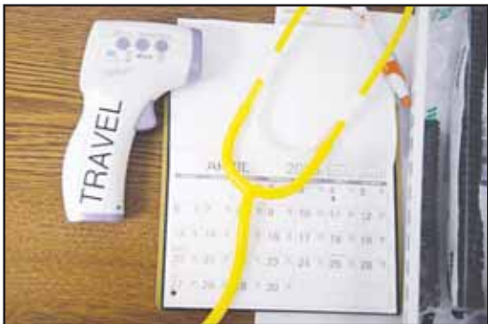
A no-contact thermometer, stethoscope and a calendar are seen at the Andrews County Health Department measles clinic, Tuesday, April 8, in Andrews, Texas. (AP)

NEW YORK, April 30, (AP): With one-fifth of states seeing active measles outbreaks, the US is nearing 900 cases, according to figures posted Friday by the U.S. Centers for Disease Control and Prevention. The CDC’s confirmed measles cases count is 884, triple the amount seen in all of 2024. The now three-month-long outbreak in Texas accounts for the vast majority of cases, with 663 confirmed as of Tuesday. The outbreak has also spread to New Mexico and Oklahoma. Two unvaccinated elementary school-aged children died from measles-related illnesses in the epicenter in West Texas, and an adult in New Mexico who was not vaccinated died of a measles-related illness. Other states with active outbreaks - defined as three or more cases - include Indiana, Kansas, Michigan, Montana, Ohio, Pennsylvania and Tennessee. North America has two other ongoing outbreaks. One in Ontario, Canada, has resulted in 1,020 cases from mid-October through Wednesday. And as of Tuesday, the Mexican state of Chihuahua state had 761 measles cases and one death, according to data from the state health ministry. The World Health Organization has said cases in Mexico are linked to the Texas outbreak. Measles is caused by a highly contagious virus that’s airborne and spreads easily when an infected person breathes,