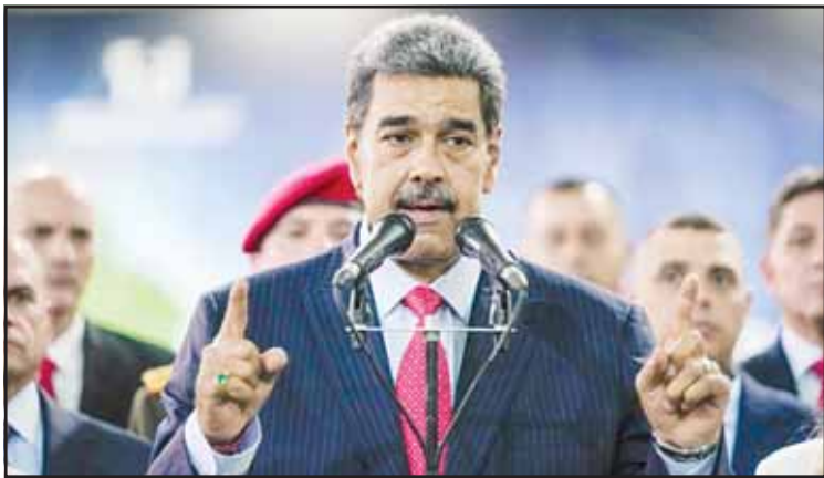
Venezuelan President Nicolas Maduro speaks at the Supreme Court in Caracas on Venezuela, July 31, 2024, three days after his disputed reelection. (AP)

MEXICO CITY, April 30, (AP): A global human rights watchdog on Wednesday urged the United States and other governments to bolster their support for people seeking democratic change in Venezuela and to hold President Nicolás Maduro accountable for the crackdown on dissent he intensified after the country's presidential election last year. Human Rights Watch specifically called on the US to consider imposing additional sanctions on Venezuelan government officials and members of state security forces. HRW also called for sanctions on ruling party-loyal armed groups linked to the widespread rights violations that followed the July 28 vote that Maduro claims to have won despite credible evidence to the contrary. At the same time, the organization recommended the US rescind an executive order President Donald Trump signed in February imposing sanctions