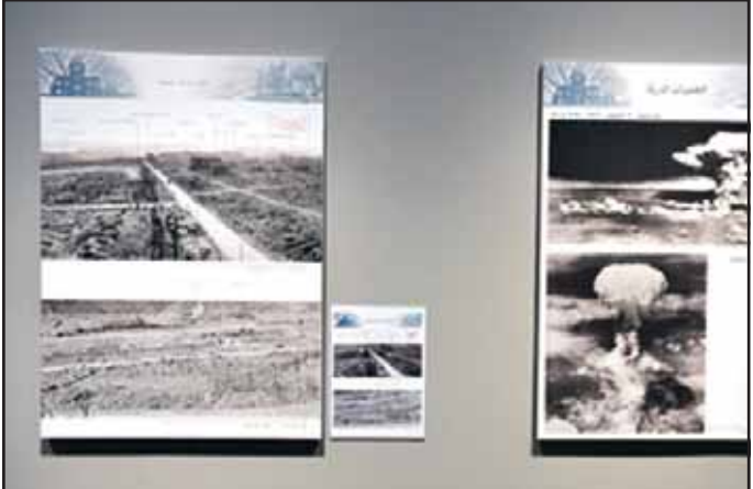
Photos show destruction caused by the A-Bomb.