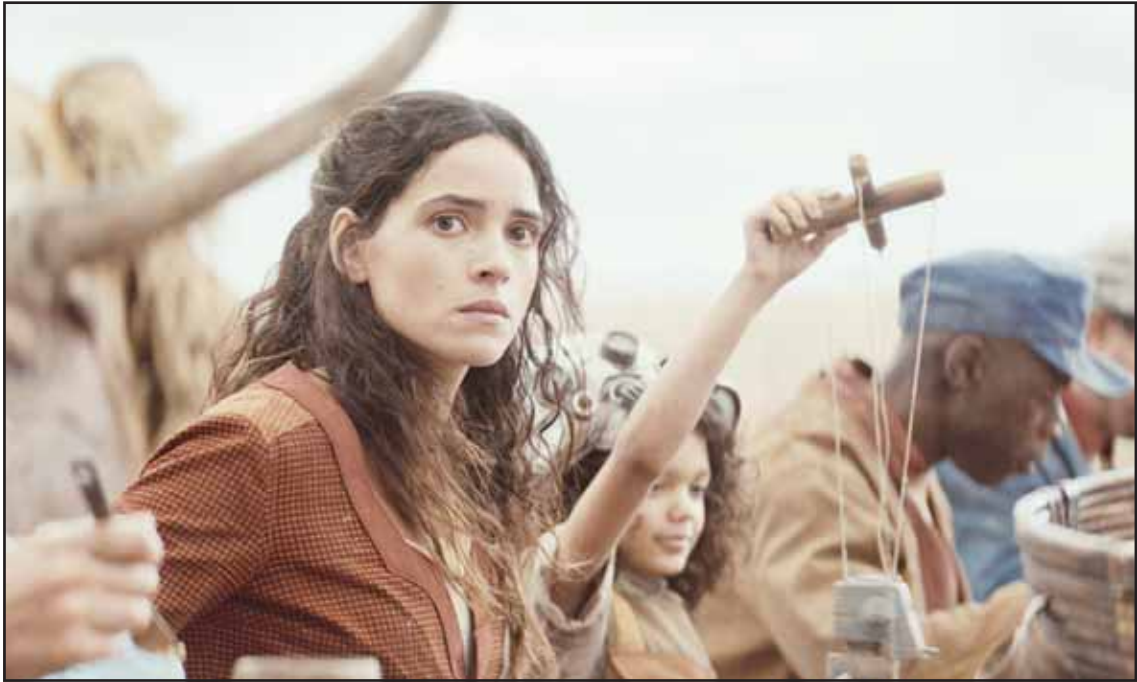
This image released by Disney+ shows Adria Arjona, as Bix Caleen, in a scene from 'Andor.'