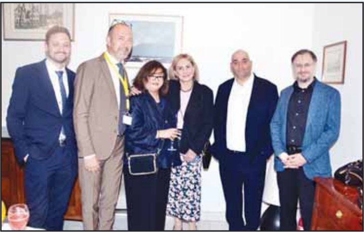
Some photos during the event.

Over 40 Belgian firms explore investment opportunities in Kuwait