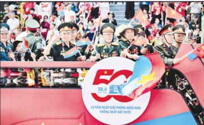
Vietnamese veteran soldiers take part in a parade during the 50th anniversary celebration of the end of the Vietnam War on April 30, in Ho Chi Minh City, Vietnam.

HO CHI MINH CITY, Vietnam, April 30, Vietnam on Wednesday celebrated the 50th anniversary of the end of the war with the United States and the formation of its modern nation with a military parade and a focus on a peaceful future. The fall of Saigon on April 30, 1975 marked the end of a Vietnam divided into the communist North and US-allied South, and the country's top official told crowds the past decades had led to ever increasing unity. "All the Vietnamese are the descendants of Vietnam. They have the rights to live and work, to have freedom to pursue happiness and love in this country," said To Lam, the Vietnam Communist Party's general secretary. "In a spirit of closing the past, respecting differences, aiming for the future, the whole party, the people and the army vow to make Vietnam become a country of peace, unity, prosperity and development," he added. Thousands camped overnight on the streets of the former South Vietnamese capital, which was renamed Ho Chi Minh City after it fell to North Vietnamese and Viet Cong troops, to get the best vantage point for the