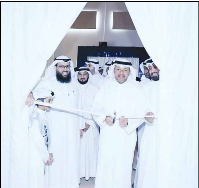
Farwaniya Governor Sheikh Athbi Nasser Al-Athbi Al-Sabah inaugurates the exhibition.