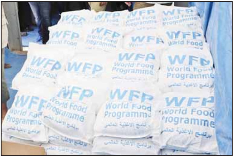
Food parcels provided by the World Food Program, part of the humanitarian aid shipments into Syria, are stacked at the Reyhanli border crossing with Syria, near Hatay, southern Turkey on May 24, 2017. (AP)

UNITED NATIONS, April 30, (AP): Several UN agencies that provide aid to children, refugees and other vulnerable people around the world are slashing jobs or cutting costs in other ways, with officials pointing to funding reductions mainly from the United States and warning that vital relief programs will be severely affected as a result. The UN World Food Program is expected to cut up to 30% of its staff. The head of the UN High Commissioner for Refugees said it would downsize its headquarters and regional offices to reduce costs by 30% and cut senior-level positions by 50%. That’s according to internal memos obtained by The AP and verified by two UN officials who spoke on condition of anonymity to discuss the internal personnel decisions. Other agencies like UNICEF, the UN children’s agency, and OCHA, the UN humanitarian agency, have also announced or plan to make cuts. One WFP official called the cuts “the most massive” seen by the agency in the past 25 years, and that as a result, operations will disappear or be downsized. The UN agency cuts underscore the impact of President Donald Trump’s decision to pull the U.S. back from its position as the world’s single largest aid donor. Trump has given billionaire