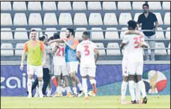
Kuwait Club players celebrate their victory over Kazma.