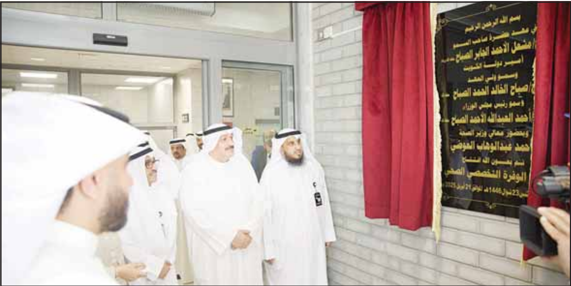
Cutting the ribbon for the opening of Al Wafra Specialized Center.

KUWAIT CITY, April 22, (KUNA): The board of directors of Public Authority for Sport (PAS) held on Monday a meeting led by Minister of Information and Minister of State for Youth Affairs Abdulrahman Al-Mutairi to discuss some topics on developing sports action. Five sports academic have been approved to work in the sports field, the authority said in a news statement after the meeting. The move came after a deep study that aims to enhance the private sector's role in developing sports sector, and contributes to providing Kuwait's teams with outstanding players in all games, it added. The board approved amending the bylaw regulating supporting athletes' treatment abroad in a manner that ensures proper cure, according to the actual condition of injury, it noted.