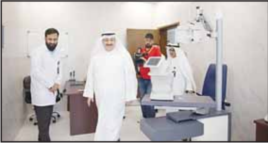
Minister of Health Dr. Ahmed Al-Awadhi inspects the center's facilities.