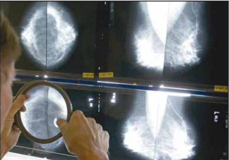
A radiologist uses a magnifying glass to check mammograms for breast cancer in Los Angeles, May 6, 2010.