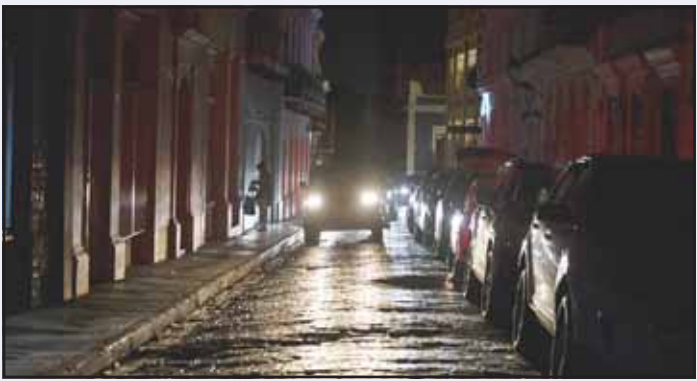
Headlights illuminate cobblestone streets in Old San Juan, Puerto Rico, during an island-wide blackout on April 16. (AP)

SAN JUAN, Puerto Rico, April 22, (AP): Puerto Rico's governor on Monday urged people to moderate their energy consumption as she warned that the island has no additional power generation capability to fall back on days after a massive blackout hit the US territory. Gov. Jenniffer González said officials are waiting for an explanation from Luma Energy, a private company that oversees transmission and distribution of power in Puerto Rico, about what caused the island-wide outage on April 16. It affected 1.4 million customers and left more than 400,000 others without water. The governor announced that two subcommittees have been created: one to help the island's so-called energy czar to audit Luma's contract and another to identify potential companies to replace Luma if its contract is terminated. "There have been multiple incidents," she said when asked whether the blackout was reason enough to cancel Luma's contract, something she pledged to do while campaign-