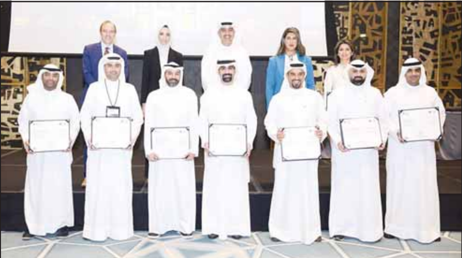
NBK celebrates the graduates of the 'Executive Leadership Development' Program in collaboration with Harvard Business School.