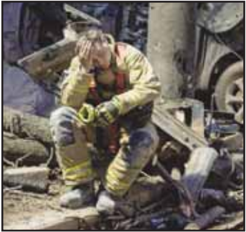
A rescue worker rests near university building destroyed by a Russian missile strike on Sumy, Ukraine on April 13.

This came after Secretary of State Marco Rubio suggested last week the US might soon back away from