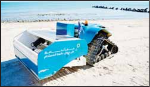
BeBot embodies the use of technology in serving sustainability goals.

KUWAIT CITY, April 22: For the second time, Zain organized a beach cleanup awareness initiative using the smart robot BeBot, in collaboration with the Environment Public Authority. The initiative aimed to invest in advanced technological solutions to build a more sustainable future and to harness innovation in contributing to the protection of Kuwait's environment. BeBot is the first robot of its kind in Kuwait. It performs sand raking and filtering, detects and collects buried waste, gathers seaweed, levels beach surfaces, and lifts loads. It is also capable of navigating rough terrains. The initiative successfully collected 13 bags of waste in a short time at the Sharq beach. The waste included over 300 grams of plastic water