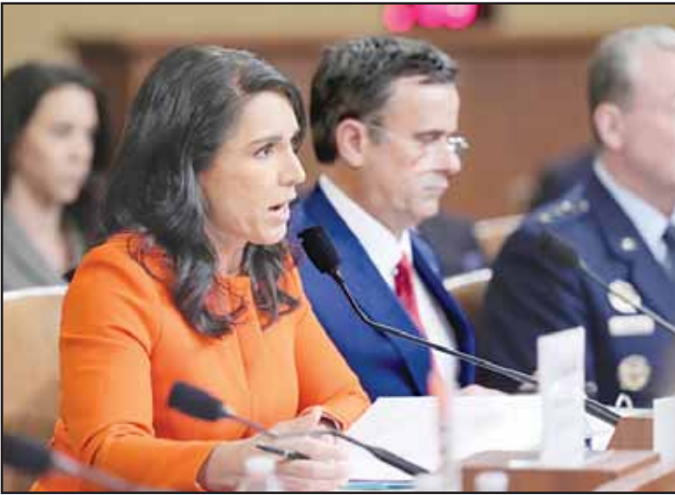
Director of National Intelligence Tulsi Gabbard, (left), joined by CIA Director John Ratcliffe, testifies as the House Intelligence Committee holds a hearing on worldwide threats, at the Capitol, in Washington, March 26.

strated in a recent incursion linked to hackers in China. The campaign known as Salt Typhoon sought to crack the phones of officials, including Trump, before the 2024 election.