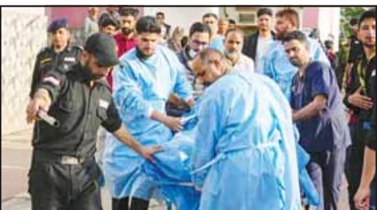
Paramedics carry a wounded tourist on a stretcher at a hospital in Anantnag after assailants indiscriminately fired at tourists visiting Pahalgam, Indian controlled Kashmir, on April 22.

SRINAGAR, India, April 22, Many people are feared to have died after gunmen indiscriminately fired at tourists in Indian-controlled Kashmir on Tuesday, officials said. Police have described the incident as a "terror attack" and blamed militants fighting against Indian rule. "This attack is much larger than anything we've seen directed at civilians in recent years," Omar Abdullah, the region's top elected official, wrote on social media. "The death toll is still being ascertained so I don't want to get into those details," he said. Initial reports said shots were fired at mostly Indian tourists visiting Baisaran meadow, some 5 kilometers (3 miles) from the disputed region's resort town of Pahalgam. Police and officials said tourists with gunshot wounds were evacuated to local hospitals. The scene of the attack was cordoned off as police launched an operation to track down the attackers. India's home minister, Amit Shah, is heading to Srinagar, the main city in Indian-controlled Kashmir, where he said he would review the situation. Prime Minister Narendra Modi, who is on an official visit in Saudi Arabia, has been briefed