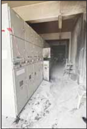
Electrical transformer extinguished.

The Municipality has affirmed the continuation of these inspection campaigns to enhance public cleanliness and eliminate all related violations in the area.