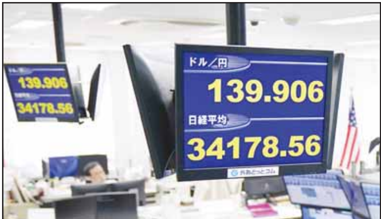
An employee of a foreign exchange dealing company works under an electronic board showing the exchange rate of U.S. dollar and Japanese yen, top, and the stock index of Japan's Nikkei 225, in Tokyo Tuesday, April 22, 2025.