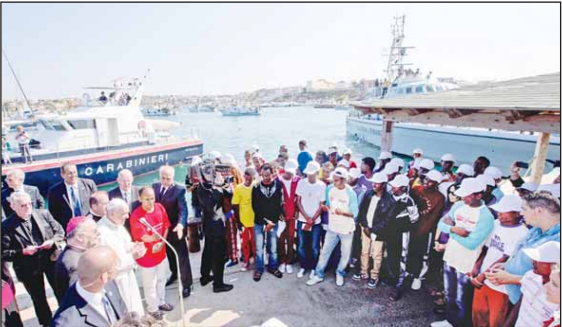
Pope Francis, (left), speaks to migrants, wearing white caps, during his visit to the island of Lampedusa, Sicily, in southern Italy, July 8, 2013.