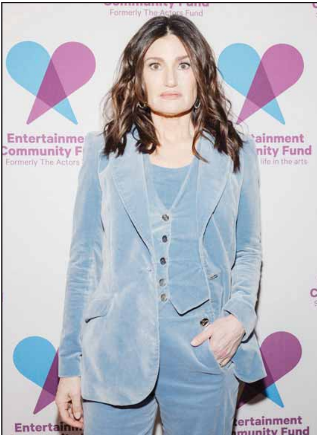
Idina Menzel attends The Entertainment Community Fund Gala at the Marriott Marquis on Monday, April 21, in New York.

Being an Asian in America is what she calls “our shared humanity,” in which “East can meet West and possibly make the world a little better.”