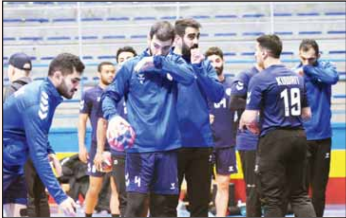
The handball team intensifies training for the Arab Cup.

The teams will be split into three groups, with matches played in a single round-robin format. The top two teams from each group will qualify for the quarterfinals.