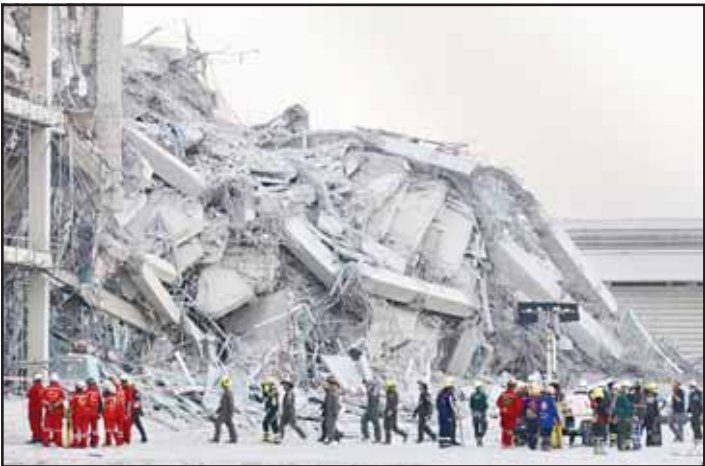
Rescuers work at the site of a high-rise building under construction that collapsed after an earthquake, in Bangkok on March 28. (AP)

BANGKOK, April 22, (AP): A Thai-Chinese company denied Monday allegations its steel rods did not pass safety standard tests after nationwide criticism prompted an investigation into the collapse of a high-rise building under construction after an earthquake last month in Bangkok. Authorities are probing Xin Ke Yuan Steel and another Chinese contractor involved in the construction to find out why the building crumbled following a quake centered in Myanmar, more than 800 miles (1,200 kilometers) away. It was the only building that completely collapsed that day. The 7.7 magnitude quake on March 28 killed more than 3,700 in Myanmar, while in Thailand, 47 were killed, mostly at the collapse site, and 47 others went missing. The collapse sparked questions about the enforcement of construction safety and the state-run Chinese contractor, China Railway No. 10 Engineering Group, leading to the arrest Saturday of its Chinese executive in Thailand, identified as Zhang, on suspicion of operating the business through the use of nominees. Foreigners can operate a business in Thailand, but it must be a joint venture with a Thai partner, and they