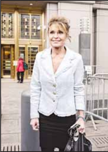
Former Alaska Gov. Sarah Palin leaves Manhattan federal court, after testifying in her defamation trial against the New York Times, Monday, April 21, in New York.