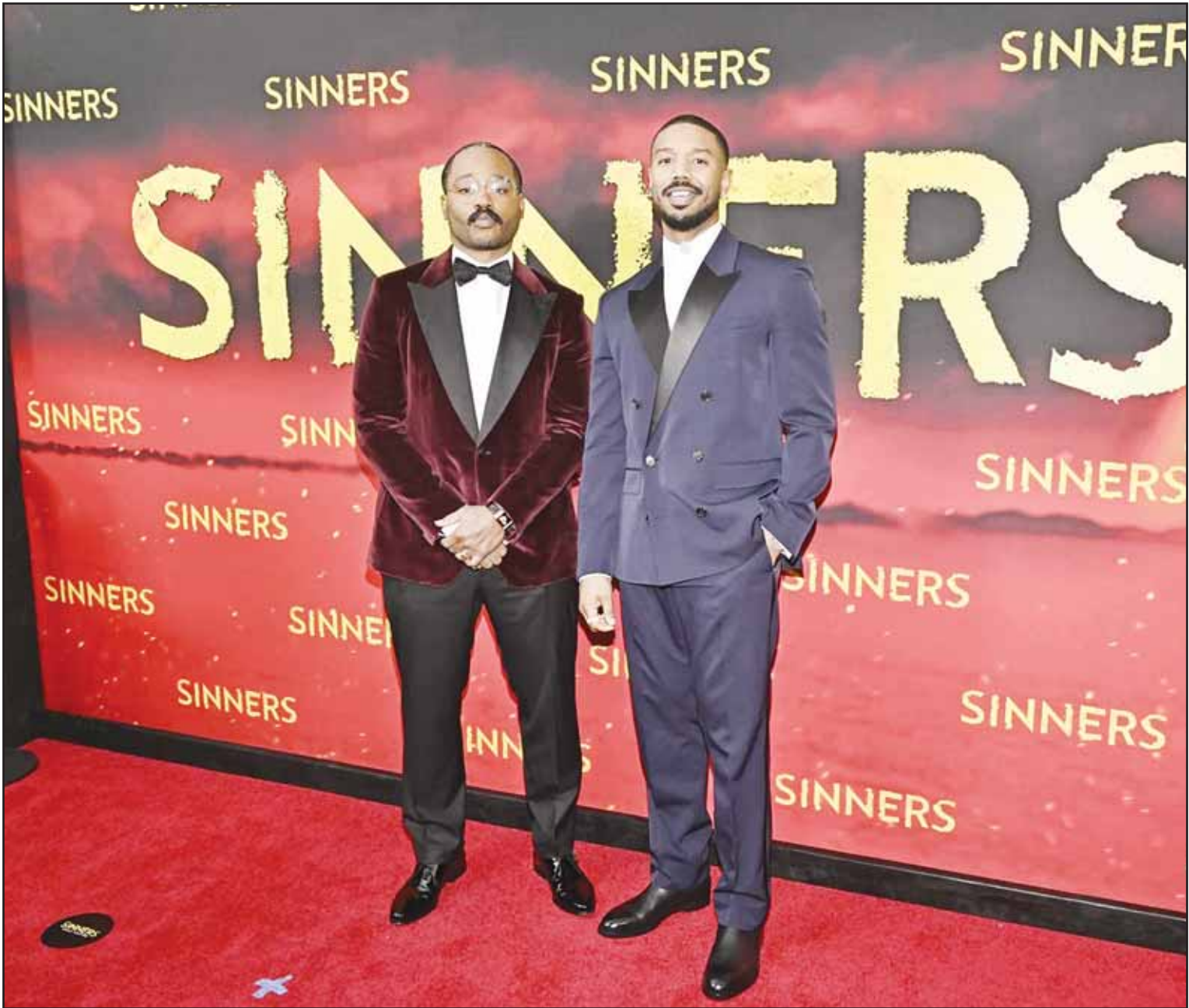
Director Ryan Coogler (left) and actor Michael B. Jordan attend the premiere of ‘Sinners’ at AMC Lincoln Square on April 3, in New York.