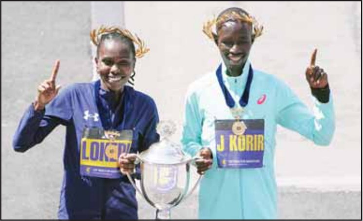
Boston Marathon winner John Korir, of Kenya, right, and women's division winner Sharon Lokedi, of Kenya, celebrate after the race in Boston.