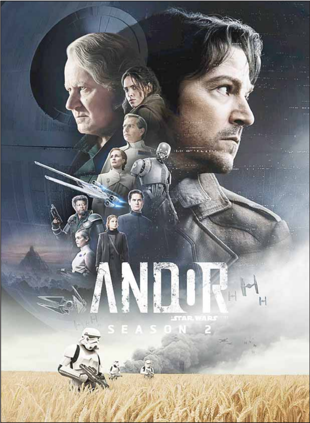
This photo shows promotional art for the series 'Andor.'

Her character's arc in particular brings real-world elements including addiction and even darker forms of trauma unlike anything "Star Wars" has shown before.