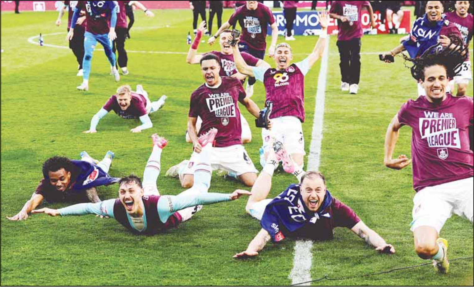
Burnley players celebrate their promotion to the English Premier League after the Championship soccer match against Sheffield United at Turf Moor, Burnley, England.

Although Ange Postecoglou has guided the team to a Europa League