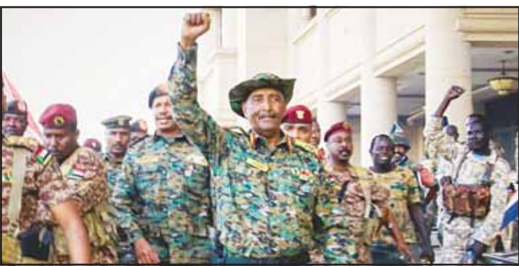
Sudan's military chief Gen Abdel-Fattah Burhan (center), is greeted by troops as he arrives at the Republican Palace, recently recaptured from the Rapid Support Forces paramilitary group, in Khartoum, Sudan on March 26.

CAIRO, April 22, A paramilitary group in Sudan attacked a city in the western Darfur region, killing more than 30 people, an activist group said, in the latest deadly offensive on an area that is home to hundreds of thousands of displaced people. The Rapid Support Forces, or RSF, and allied militias launched an offensive on el-Fasher, the provincial capital of North Darfur province, on Sunday, the Resistance Committees in the city said. Dozens of other people were wounded in the attack, said the group, which tracks the war. The RSF renewed its attack on Monday, shelling residential buildings and open markets in the city, the activist group said. There was no immediate comment from the RSF. El-Fasher, more than 800 kilometers (500 miles) southwest of the capital, Khartoum, is under the control of the