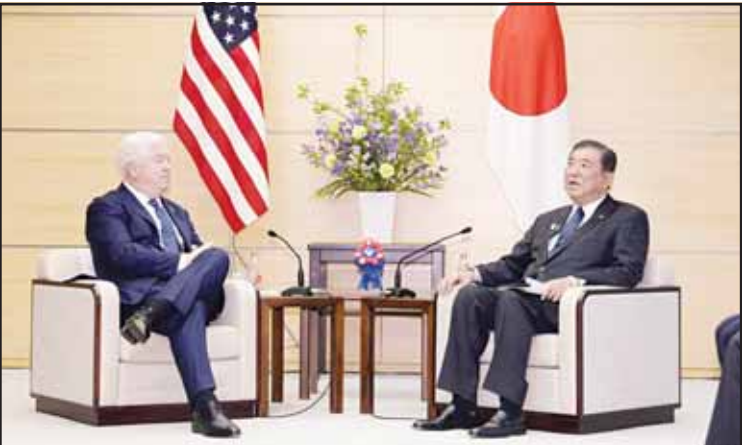
Japan's Prime Minister Shigeru Ishiba, right, meets with new US Ambassador to Japan George Glass at Ishiba's office in Tokyo on April 22.