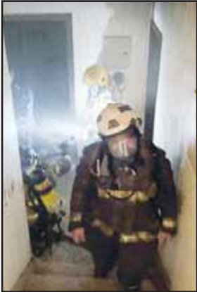
House in Andalous.

Firefighters from Mangaf and Bairaqa fire stations successfully extinguished a fire that broke out in an electrical transformer in Egaila on Monday morning.