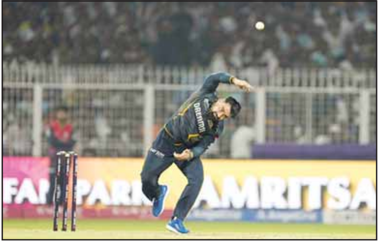
Gujarat Titans' Rashid Khan bowls a delivery during the Indian Premier League cricket match between Kolkata Knight Riders and Gujarat Titans at Eden Gardens in Kolkata, India.

“I thought 199 was chaseable, we came back into the game really well with the ball,” Rahane said. “You expect good opening starts but that’s what we’re struggling with.”