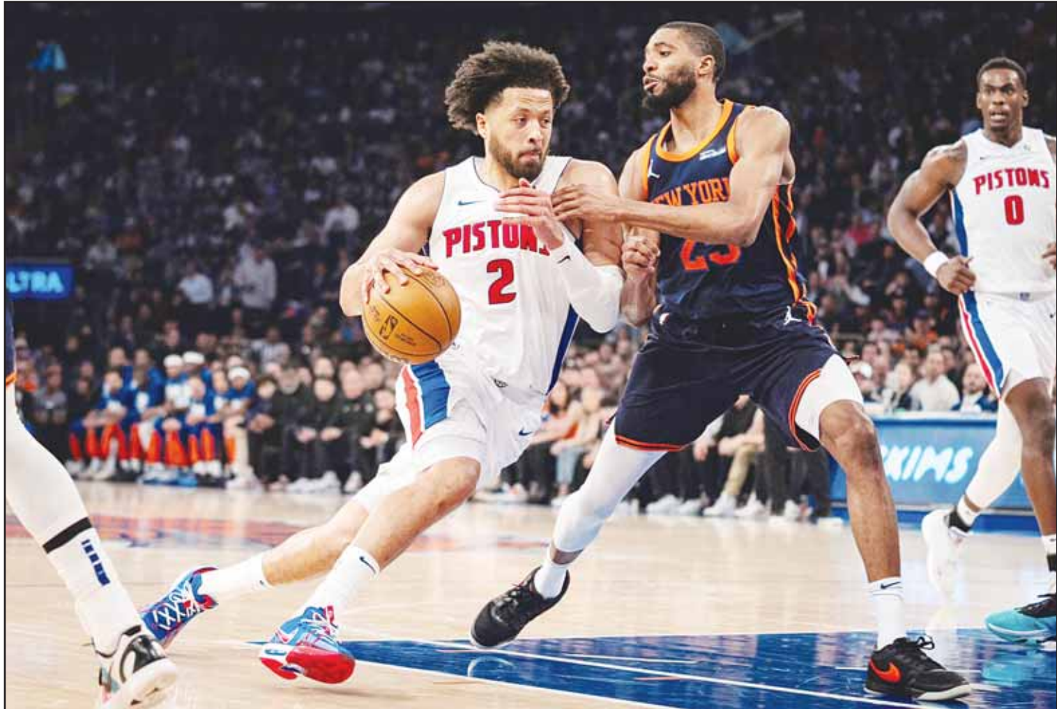
Detroit Pistons guard Cade Cunningham (2), guarded by New York Knicks forward Mikal Bridges (25), drives toward the basket during the first quarter of Game 2 of an NBA basketball first-round playoff series in New York.

NEW YORK, April 22, Cade Cunningham wasn't thinking about himself after the first postseason victory of his career. His focus was on all the Detroit fans who stuck by the Pistons during 17 years since the last one.