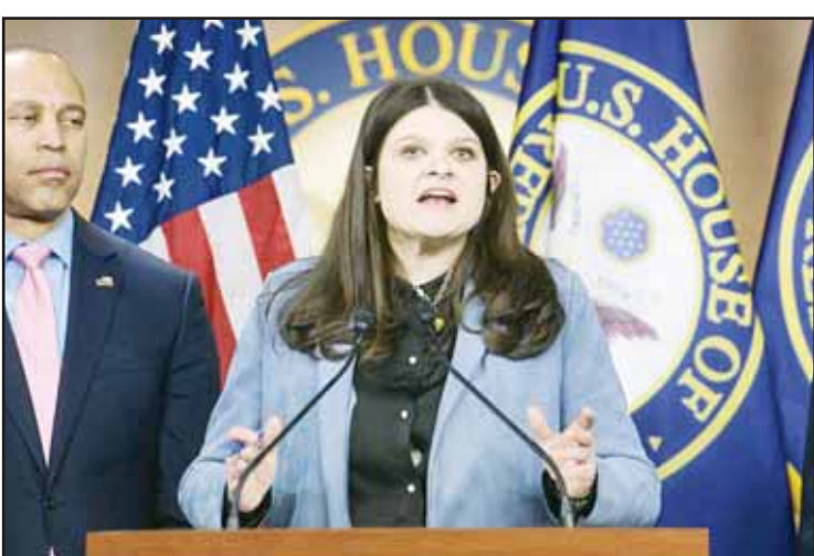
US Rep Haley Stevens, D-Mich, joined by House Minority Leader Hakeem Jeffries, D-NY, speaks during a press conference on Capitol Hill on Feb 6, in Washington.

Stevens will seek to defend her tenure in Congress in the Democratic