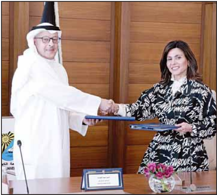
Photo during the signing of memorandum of understanding.