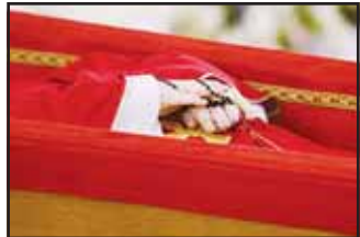
Pope Francis's body is laid out in state inside his private chapel at the Vatican, Monday, April 21, 2025.