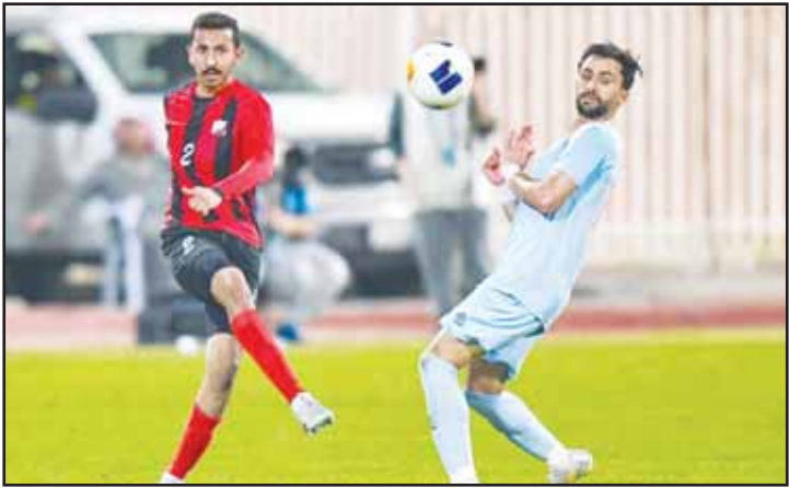
Players in action.

also defeated Al-Jazeera SC 2-1 in the preliminary round of the Crown Prince Cup. Historically, Kuwait Club has had the upper hand in recent meetings, winning both league matches last season (3-1 and 3-2). Their last Cup encounter dates back to the 2016-2017 semi-finals, when Kuwait Club won 5-0. Kazma looks to rebound from a challenging season. Knocked out of the Amir Cup by Al-Jahra and currently battling in the relegation round, Kazma is aiming to restore pride and push for a Cup run. It reached the quarterfinals by defeating Al-Yarmouk 3-1 in the preliminaries. Khaitan, on the other hand, is proving resilient. It edged out Al-Sulaibikhat on penalties (0-0, 4-1) in the preliminary round and advanced to the Amir Cup quarterfinals after a 2-1 win over Al-Shabab. The two sides have already exchanged wins in the league this season - Kazma 2-0, Khaitan 1-0 - and are set for another showdown. Notably, their last Crown Prince Cup clash came in the 2021-2022 preliminary round, where Khaitan triumphed 4-3 on penalties after a 1-1 draw.