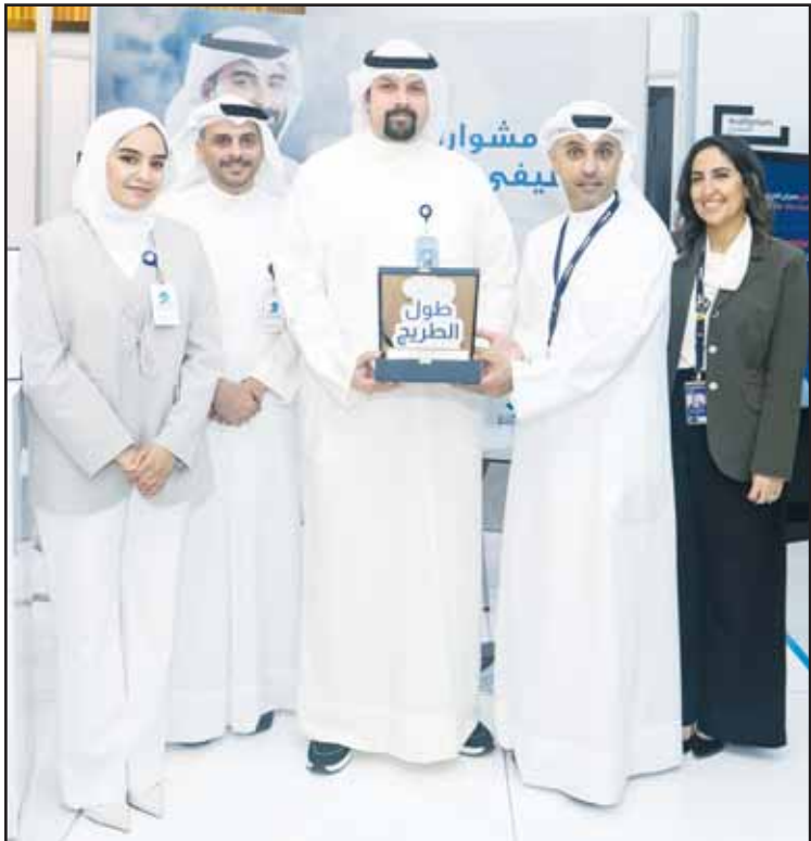
Burgan’s team receiving an honorary shield from ktech.

efforts to foster an environment of technology-focused banking innovation that responds to the market’s evolving needs and growing aspirations is Burgan Lab, the Bank’s dedicated innovation and digital transformation central hub. In addition to the advanced tools and cutting-edge technologies that it hosts, Burgan Lab also underscores the importance of collaboration, creativity, and excellence as essential features of the Burgan innovation-driven culture. Alongside Burgan Lab, the Bank offers its employees various learning and development opportunities all year round, catering to their individual learning preferences and different aspirations for personal and professional growth. These efforts are among numerous factors that earned Burgan Bank the Great Place to Work® certification, further cementing it as a top employer of choice and a dedicated contributor to the success of Kuwait’s 2035 Vision.