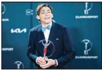
Mondo Duplantis celebrates the Laureus World Sportsman of the Year award, during the 2025 Laureus World Sports Awards in Madrid, Spain.