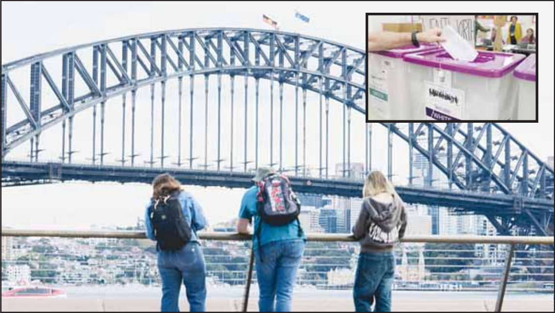
People view the Sydney Harbour Bridge as the flags fly at half mast following the death of Pope Francis, in Sydney, Australia on April 22. Inset: A ballot is dropped into a box as early voting begins in Sydney on Tuesday for a national election to be held on May 3.

lect Pacific islands, as well as related money laundering, people trafficking and recruitment services discovered in Europe, North America and South America. In Africa, Nigeria has become a hot spot, with police raids in late 2024 and early 2025 leading to many arrests, including people from East and Southeast Asia suspected of cryptocurrency and romance scams. Zambia and Angola have also busted Asian-linked cyberfraud operations.