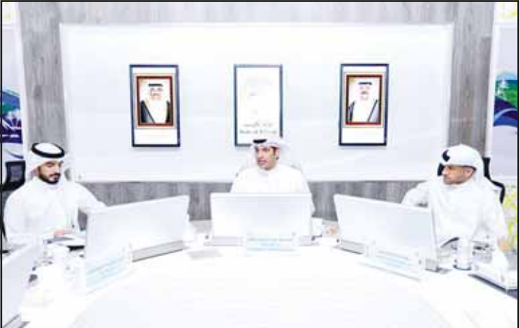
The Minister of Information and Culture and Minister of State for Youth Affairs chaired the 24th meeting of the General Sports Authority.

KUWAIT CITY, April 22, (KUNA): The board of directors of Public Authority for Sport (PAS) held on Monday a meeting led by Minister of Information and Minister of State for Youth Affairs Abdulrahman Al-Mutairi to discuss some topics on developing sports action. Five sports academic have been approved to work in the sports field, the authority said in a news statement after the meeting. The move came after a deep study that aims to enhance the private sector's role in developing sports sector, and contributes to providing Kuwait's teams with outstanding players in all games, it added. The board approved amending the bylaw regulating supporting athletes' treatment abroad in a manner that ensures proper cure, according to the actual condition of injury, it noted.