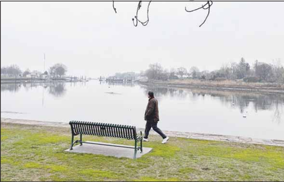
A man takes an early morning walk along Long Island Sound in Westchester County, N.Y. on Tuesday, April 15. (AP)

NEW YORK, April 22, (AP): Starting with brushing his teeth before 4 a.m., influencer Ashton Hall says he also swims, meditates, journals, rubs his face with banana peel, lifts weights, submerges his face in ice water and accomplishes much more every day before breakfast around 9:30. A video of his morning routine has racked up millions of views on social media, while sparking reactions that range from disbelief to awe. It also jumpstarted the conversation online about how best to start the day, even if a six-hour regimen is ambitious to say the least. Don’t worry, said Kamalyn Kaur, a psychotherapist in Cheshire, England. You don’t need to start your day with dozens of activities to improve it. But she said it is a good idea to reevaluate how you get going because setting up a relaxed, structured morning will pay dividends for your energy and mood. “It just sets the tone for the rest of your day,” said Kaur, an anxiety expert who advises new clients to start by reevaluating how they spend the morning. “If you set yourself up and you start your day properly, you start off feeling good, you feel organized.” As a professor of workplace psychology at The University of Oklahoma, Shawn McClean has spent years