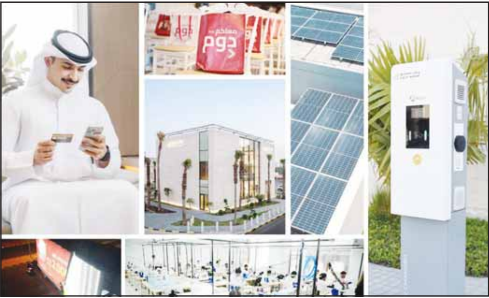
Part of Gulf Bank's diverse initiatives to consolidate environmental sustainability.