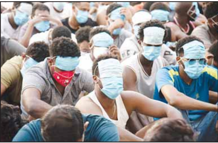
People from China, Vietnam and Ethiopia, believed to have been trafficked and forced to work in scam centers, sit with their faces masked while in detention after being released from the centers in Myawaddy district in eastern Myanmar on Feb 26. (AP)

BANGKOK, April 22, (AP): Transnational organized crime groups in East and Southeast Asia are spreading their lucrative scam operations across the globe in response to increased crackdowns by authorities, according to a UN report issued on Monday. For several years, scam compounds have proliferated in Southeast Asia, especially in border areas of Cambodia, Laos and Myanmar, as well as in the Philippines, shifting operations from site to site to stay a step ahead of the police. More recently, scam centers that have bilked victims out of billions of dollars through false romantic ploys, bogus investment pitches and illegal gambling schemes are now being reported operating as far afield as Africa and Latin America. Asian crime syndicates have been expanding operations deeper into remote areas with lax law enforcement that are vulnerable to the influx, according to the report issued by the U.N. Office on Drugs and Crime or UNODC. The report is titled "Inflection Point: Global Implications of Scam Centers, Underground Banking and Illicit Online Marketplaces in Southeast Asia." "This reflects both a natural expansion as the industry grows and seeks new ways and places to do business, but also a hedging against future risks should disruption continue and intensify in Southeast Asia,"