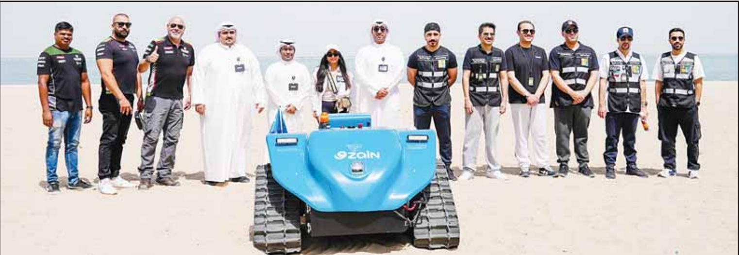
Zain and EPA teams during the initiative.

Part of Gulf Bank's diverse initiatives to consolidate environmental sustainability.