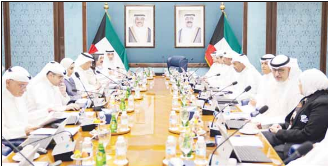
Acting Prime Minister Sheikh Fahad Yousef Saud Al-Sabah presides over the weekly Cabinet meeting on Tuesday.

KUWAIT CITY, April 22, (KUNA): Kuwait's Cabinet on Tuesday looked forward to forthcoming talks between Gulf Cooperation Council (GCC) member states and central Asian nation, slated for May 5 in the Uzbek city of Samarkand. The gathering will see Highness the Crown Prince Sheikh Sabah Khaled Al-Hamad Al-Sabah representing His Highness the Amir Sheikh Meshal Al-Ahmad Al-Jaber Al-Sabah in the second such summit bringing together the two regions, the Cabinet was informed amid its weekly session presided over by Acting Prime Minister Sheikh Fahad Yousef Saud Al-Sabah. Public Works' Minister Dr. Noura Al-Mashaan delivered a visual presentation over the progress in road maintenance work carried out on highways and areas nationwide, assuring the Cabinet that the project is set to meet its deadline without any delays. The Cabinet then went on to discuss a number of issues on the