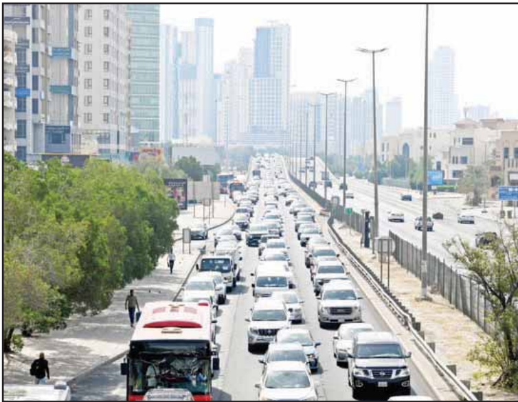
Combo photos show Kuwait's streets on Tuesday take a turn for the better as drivers comply with the newly implemented Traffic Law on day one.