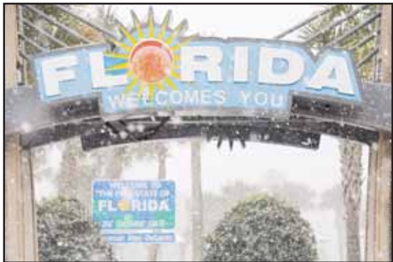
Heavy snow falls onto the Florida Welcome Center on Jan 21, in Pensacola, Fla.

On May 7, the US will start enforcing a law passed 20 years ago that sets national standards for state driver’s licenses to be accepted as proof of identity for adults entering certain federal facilities or traveling on domestic com-