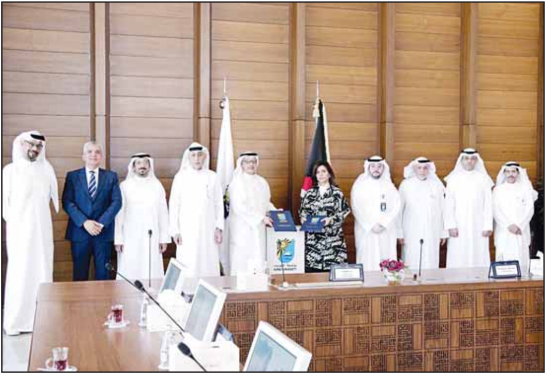
Group photo during the signing ceremony.