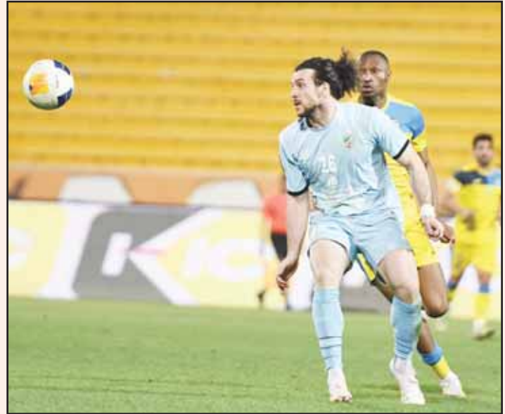
Players in action during league match.

Josh Giddey had 25 points and 10 rebounds for Chicago. Coby White scored 17, though he shot 5 of 20. Nikola Vucevic finished with 16 points and 12 rebounds.