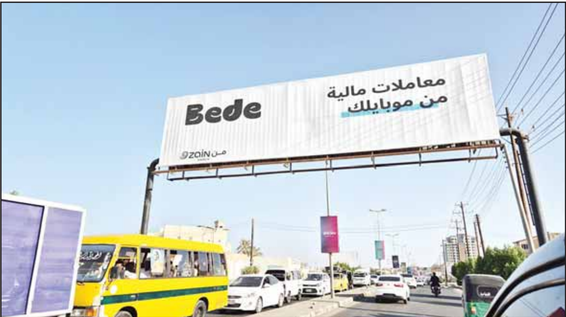
BEDE in Sudan

PORT SUDAN/KUWAIT CITY, April 17: Zain Fintech, the financial services arm of Zain Group, a leading provider of innovative technologies and digital lifestyle communications operating in eight markets across the Middle East and Africa, has launched the ‘Bede’ Digital Wallet in Sudan.