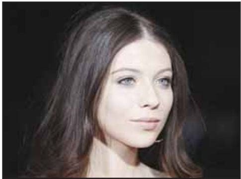
Michelle Trachtenberg appears at the premiere of ‘Defiance’ during AFI Fest 2008 in Los Angeles, Nov. 9, 2008.

Sarah Michelle Gellar, Taylor Momsen and Blake Lively were among the celebrities who