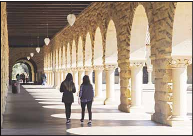
Students walk on the Stanford University campus, March 14, 2019, in Santa Clara, Calif.