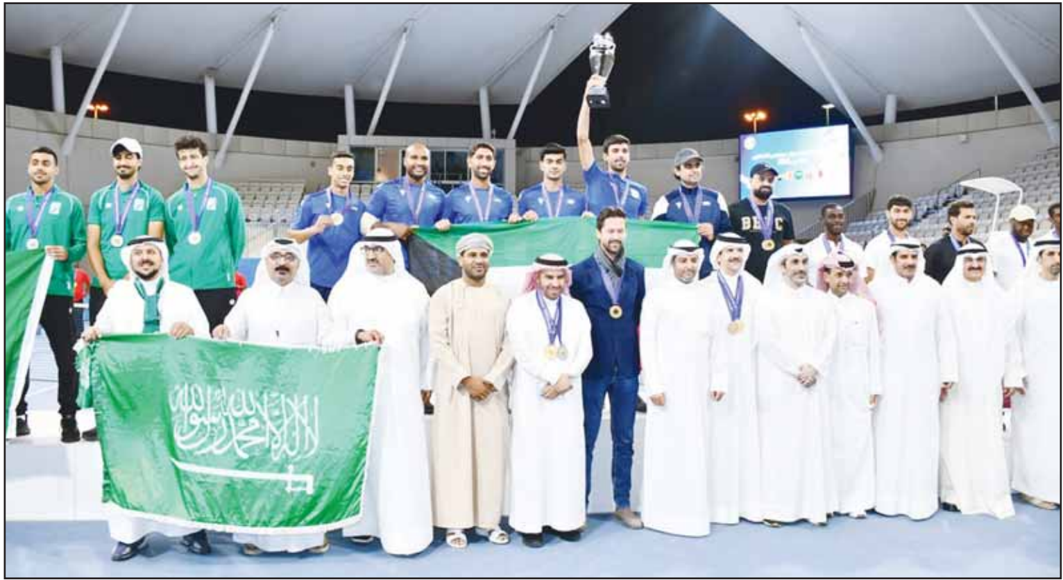
Kuwait team with other teams on the podium during the awarding ceremony.