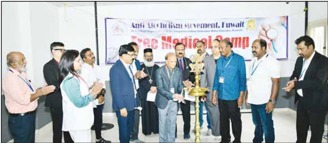
13th AAM Medical Camp provides free healthcare services to expatriates.