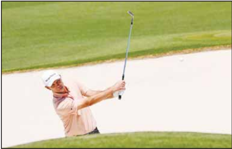
Justin Rose hits from the bunker on the second hole during the final round at the Masters golf tournament in Augusta, Ga.

HILTON HEAD ISLAND, S.C., April 17, The farther Justin Rose drove from Augusta National only made him realize how close he came to winning the Masters. His phone kept buzzing on the way to Hilton Head Island, one text after another, all of them with the same message that applauded his remarkable rally and offered commiseration and condolences for his runner-up finish to Rory McIlroy. Rose started the final round seven shots out of the lead, too far back to think about winning. He made a 20-foot birdie putt on the 18th for a 66. He was in a sudden-death playoff. He lost on a great shot by McIlroy, who hit gap wedge to 3 feet for birdie. It was a lot to process. “A lot of outpouring from people with a lot of positive comments coming at me, so trying to absorb that, trying to absorb the week,” Rose said Wednesday at the RBC Heritage. “But at the same time, looking at my phone and just wishing there was a different message there.” This is a path he knows well. Rose had a two-shot lead with six holes to play in the 2017 Masters when Sergio Garcia - like McIlroy, a good friend - made a most improbable rally to force a playoff and beat Rose on the first extra hole. Rose was classy in defeat that day in 2017. He lovingly patted Garcia’s cheek, they embraced, and then Rose tapped Garcia on the heart. He knew