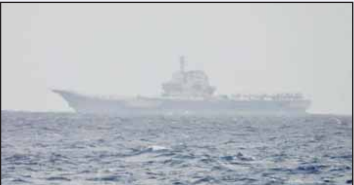
This image released by the Taiwan Ministry of National Defense shows China’s Shandong aircraft carrier sailing near Taiwan on Monday, March 31.

Koo said no service members were found to have a Chinese passport or resident identity card, which would denote Chinese citizenship