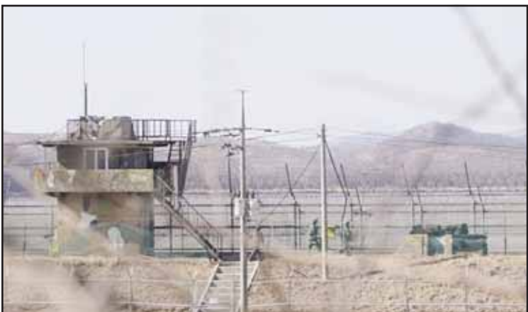
South Korean army soldiers patrol along the barbed-wire fence in Paju, South Korea, near the border with North Korea, on Feb 18.

“The recent military move of the US and the ROK is an open threat to the security of our state and a grave provocation that raises the military tension in the region to an extreme dangerous level,” an unidentified spokesperson for North Korea’s Defense Ministry said in a statement carried in state media.