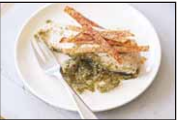
Salmon poached in green salsa and topped with baked chips are displayed for a photo in Concord, N.H.

watch TV, people tend to eat until there's a commercial or the show is over," Heinberg said, adding that people are less inclined to pay attention to the body's own signals that it's full. "When we do things while we're eating, we're eating less mindfully. And that often causes us to eat more."