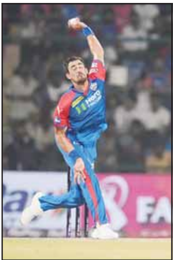
Delhi Capitals’ Mitchell Starc bowls a delivery during the Indian Premier League cricket match between Delhi Capitals and Rajasthan Royals at Arun Jaitley Stadium in New Delhi, India.

Starc forced the game into the super over with a brilliant eight-run 20th over as Rajasthan finished at 188-4 in reply to Delhi’s 188-5. Two run-outs in Starc’s super over limited Rajasthan to 11-2 before Lokesh Rahul and Tristan Stubbs smashed Sandeep Sharma’s first four balls for 13 runs and took Delhi on top of the points table with five wins from six games. Rajasthan has plenty to catch-up as they dropped to No. 8 with just two wins from seven games. Rajasthan seemed to have controlled the chase until Starc nailed a perfect yorker to half century-maker Nitish Rana (51) in the 18th over and had the left-hander plumb leg before wicket.