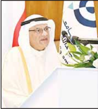
Minister of Higher Education and Scientific Research Dr. Nader Al-Jalal during his speech.

He said "the State of Kuwait, under the leadership of His Highness the Amir Sheikh Meshal Al-Ahmad Al-Jaber Al-Sabah and His Highness the Crown Prince Sheikh Sabah Al-Khaled, believes that education is the foundation of human development and that innovation is the gateway to progress. The rapid global transformation driven by artificial intelligence (AI) requires us to reshape higher education and transform it into a dynamic and smart environment