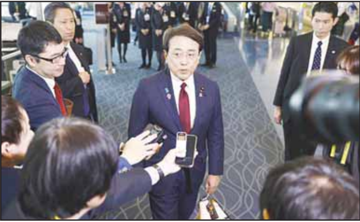
Japan's chief trade negotiator and Economic Revitalization Minister Ryosei Akazawa, center, speaks to reporters before this departure for the U.S., at Haneda airport in Tokyo, Wednesday, April 16, 2025.

President Trump stated his intention to make this negotiation a top priority,” Ishiba said. “I believe we had talks that lead to a next step.”