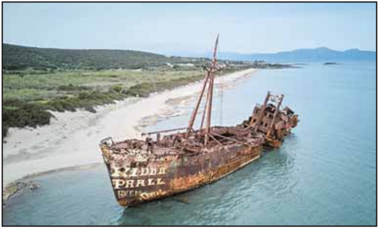
The abandoned Dimitrios shipwreck lies rusted and since 1981 at Valtaki beach near Gythio, southern Greece, on April 15, 2025.

ATHENS, Greece, April 17, Greece on Wednesday announced plans for managing human activities in maritime areas, such as tourism, offshore energy drilling, fishing and environmental protection, irking neighboring Turkey, which said the plans encroach on its jurisdiction. The announcement about Greece’s Maritime Spatial Planning came after the country was rebuked by the European Court of Justice earlier this year for failing to submit the plans to the European Commission, as all coastal European Union member states are required to do. Spatial planning for sea areas is considered necessary for the sustainable use of marine resources, setting out where activities such as transport, tourism, fishing and renewable energy projects can take place, and for the protection of marine environments. But Turkey’s Foreign Ministry said some of the areas specified in Greece’s plan “violate our country’s maritime jurisdiction areas in the Aegean Sea and the Eastern Mediterranean.” Although NATO allies, Greece and Turkey have been at loggerheads for years over boundaries in the Aegean and the eastern Mediterranean, with escalating tension bringing them close to war several times in recent decades.