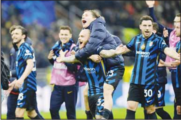
Inter Milan players celebrate at the end of the Champions League quarterfinal second leg soccer match between Inter Milan and Bayern Munich at the San Siro Stadium in Milan, Italy, Wednesday, April 16, 2025.

The Inter fans were in for a nervy final 14 minutes, however, as Serge Gnabry's cross found Dier at the byline, and his header strangely looped into the far top corner from the tightest of angles.