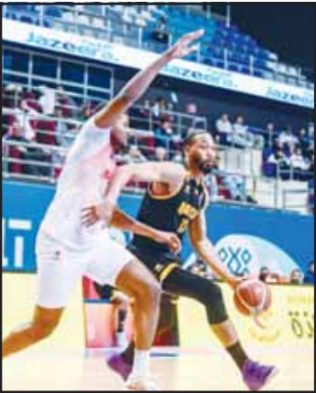
Players battling for the ball in this file photo.