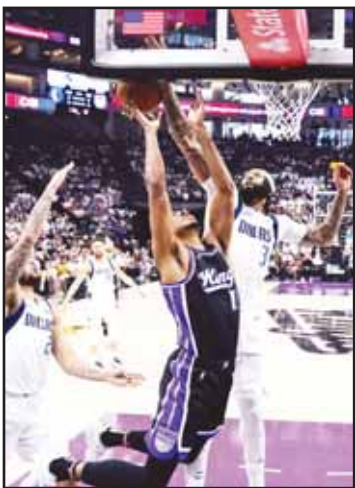
Dallas Mavericks forward Anthony Davis (3) blocks a shot by Sacramento Kings forward Keegan Murray (13) during the first half of an NBA Play-In Tournament basketball game in Sacramento, Calif.

It was a disappointing ending to an underwhelming season for the Kings, who fired coach Mike Brown in De-