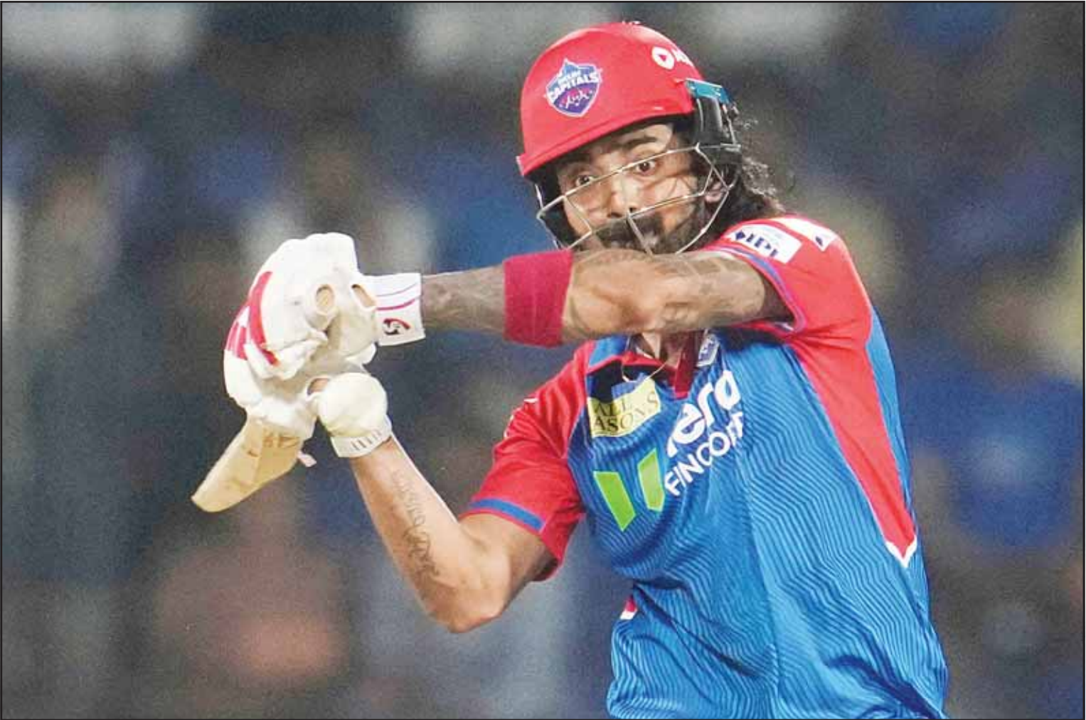
Delhi Capitals’ KL Rahul plays a shot during the super over of the Indian Premier League cricket match between Delhi Capitals and Rajasthan Royals at Arun Jaitley Stadium in New Delhi, India.

NEW DELHI, India, April 17, Fast bowler Mitchell Starc inspired table-toppers Delhi Capitals to a tense victory in the super over against Rajasthan Royals in the Indian Premier League.