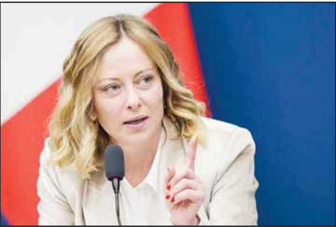
Italian Premier Giorgia Meloni holds a year-end press conference in Rome on Jan 9.

MILAN, April 17, Italian Premier Giorgia Meloni will test her mettle as a bridge between the EU and the United States when she meets with US President Donald Trump in the White House on Thursday, the first European leader to have a face-to-face with Trump since he announced, and then suspended, 20% tariffs on European exports. Meloni secured the meeting at a critical juncture in the trade war as Italy’s leader, but she also has, in a sense, been “knighted” to represent the European Union. She has been in close contact with EU Commission President Ursula von der Leyen ahead of the trip, and “the outreach is... closely coordinated,” a commission spokeswoman said this week. “We know we are in a difficult moment,” Meloni said this week in Rome. “Most certainly, I am well aware of what I represent, and what I am defending.” The European Union is defending what it calls “the most important commercial relationship in the world,” with annual trade reaching