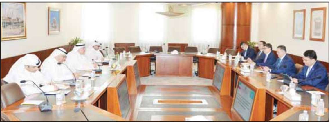
KCCI hosts Kazakh foreign minister and ambassador.

thanked KCCI for the warm welcome, affirming that this visit reflects the determination of both friendly nations to strengthen their economic relations.