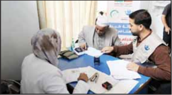
Kuwait’s Namaa charity delivers healthcare, food aid across northern Gaza and to Syrian displaced families.

The exhibition not only provided a platform for established and emerging artists to showcase their talents, but also served as a catalyst for artistic dialogue and cross-cultural exchange. As Kuwait continues to position itself as a hub for arts and culture in the region, the Spring Fine Arts Exhibition is poised to play an even greater role in enriching the nation’s artistic landscape and inspiring future generations of artists.