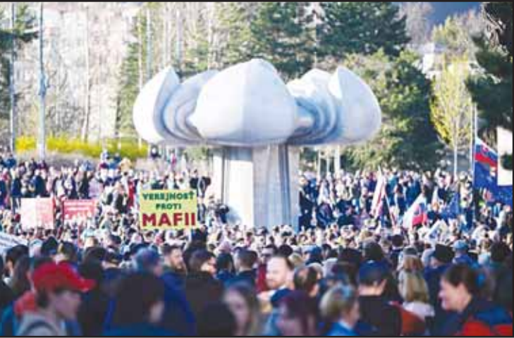
People march during a protest to condemn a draft legislation that critics consider ‘liquidating’ for many non-government organisations in Bratislava on April 3.

home and abroad, returned to power in 2003 after his leftist Smer (Direction) party won a parliamentary election on a pro-Russia and anti-American platform.