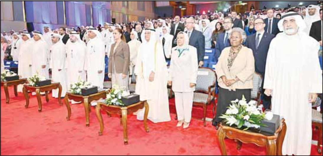
Photos during the launch of the first Higher Education Summit.