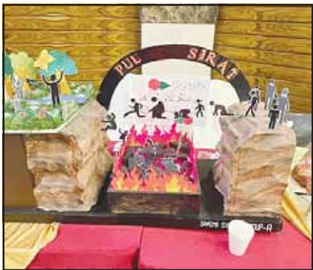
Photos during the Eid Get-Together.