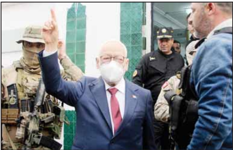
Leader of Tunisia’s Islamist Ennahda party House Speaker Rached Ghannouchi, (center), flashes a victory sign as he arrives for questioning at the judicial police headquarters in Tunis, Tunisia, April 1, 2022.

Tunisian authorities have not responded to the allegations detailed in the report, which draws a direct line between the judicial system and actions that Saied has taken to consolidate