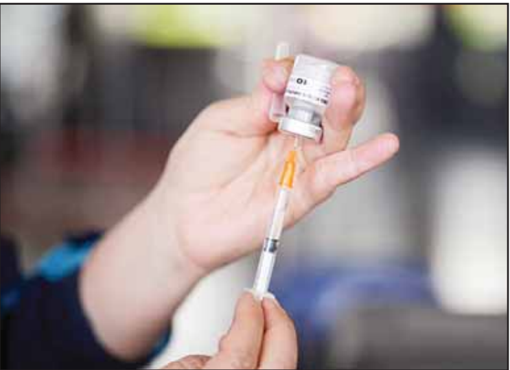
A health worker prepares a yellow fever vaccine to inoculate travelers at the bus terminal in Bogota, Colombia, Wednesday, April 16.

"She didn't find (the chips) enjoyable anymore," McCarthy said.