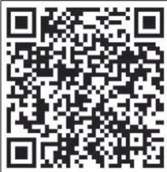
Scan QR code to access multilingual awareness campaign.

The Ministry of Interior urged all residents to familiarize themselves with these regulations to avoid penalties and contribute to safer roads in Kuwait.