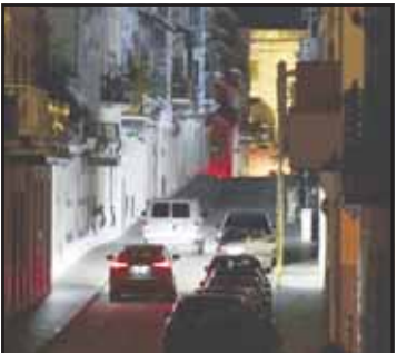
Vehicles navigate a dark street in Old San Juan, Puerto Rico, during an island-wide blackout on April 16.

The blackout snarled traffic, forced hundreds of businesses to close and