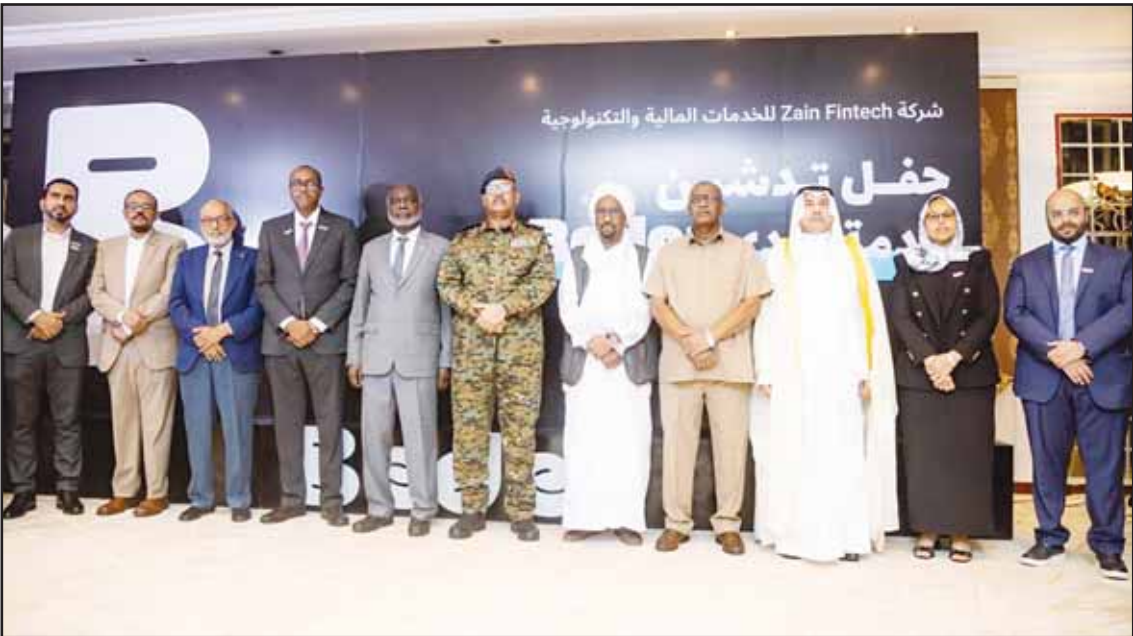
Officials pose for group photo after the launch.