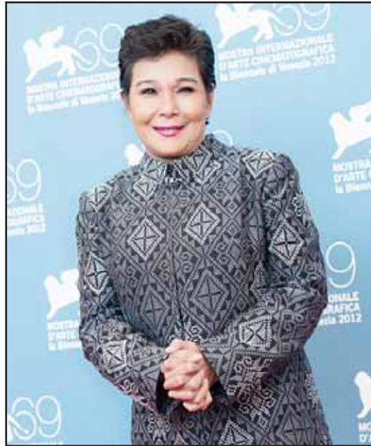
Actress Nora Aunor appears during the photo call for the film ‘Sinapupunan’ (Thy Womb) at the 69th edition of the Venice Film Festival in Venice, Italy, on Sept. 6, 2012.

She is survived by their children Lotlet, Ian, Matet, Kiko and Kenneth de León.