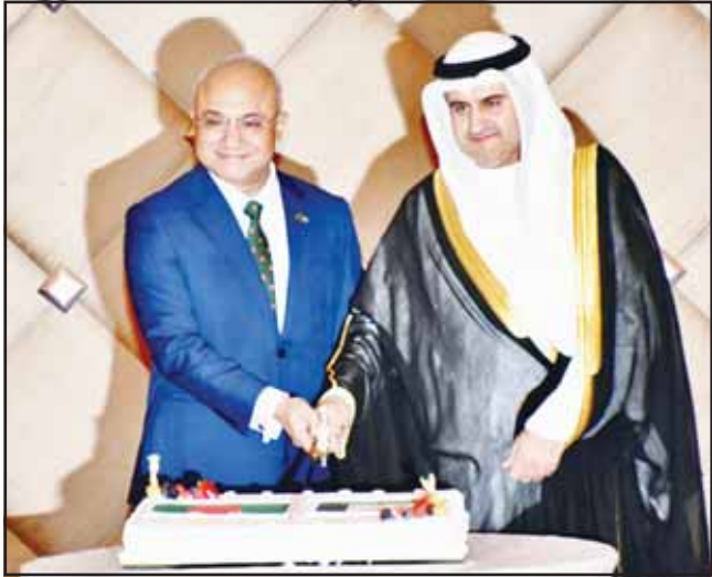
Bangladesh Ambassador and Minister of Justice cut cake at ceremony.

He also affirmed the ministry's emphasis on gender inclusion in the judiciary, adding that more than 20 women now serve as judges in Kuwait. "For the