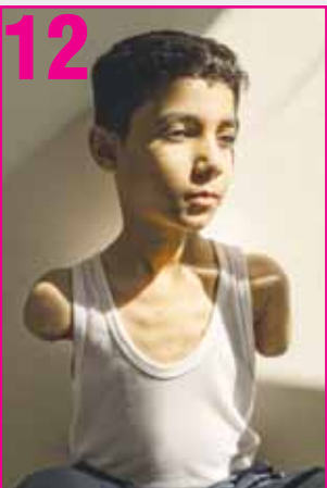
Portrait of Palestinian boy who lost both arms wins Photo of the Year