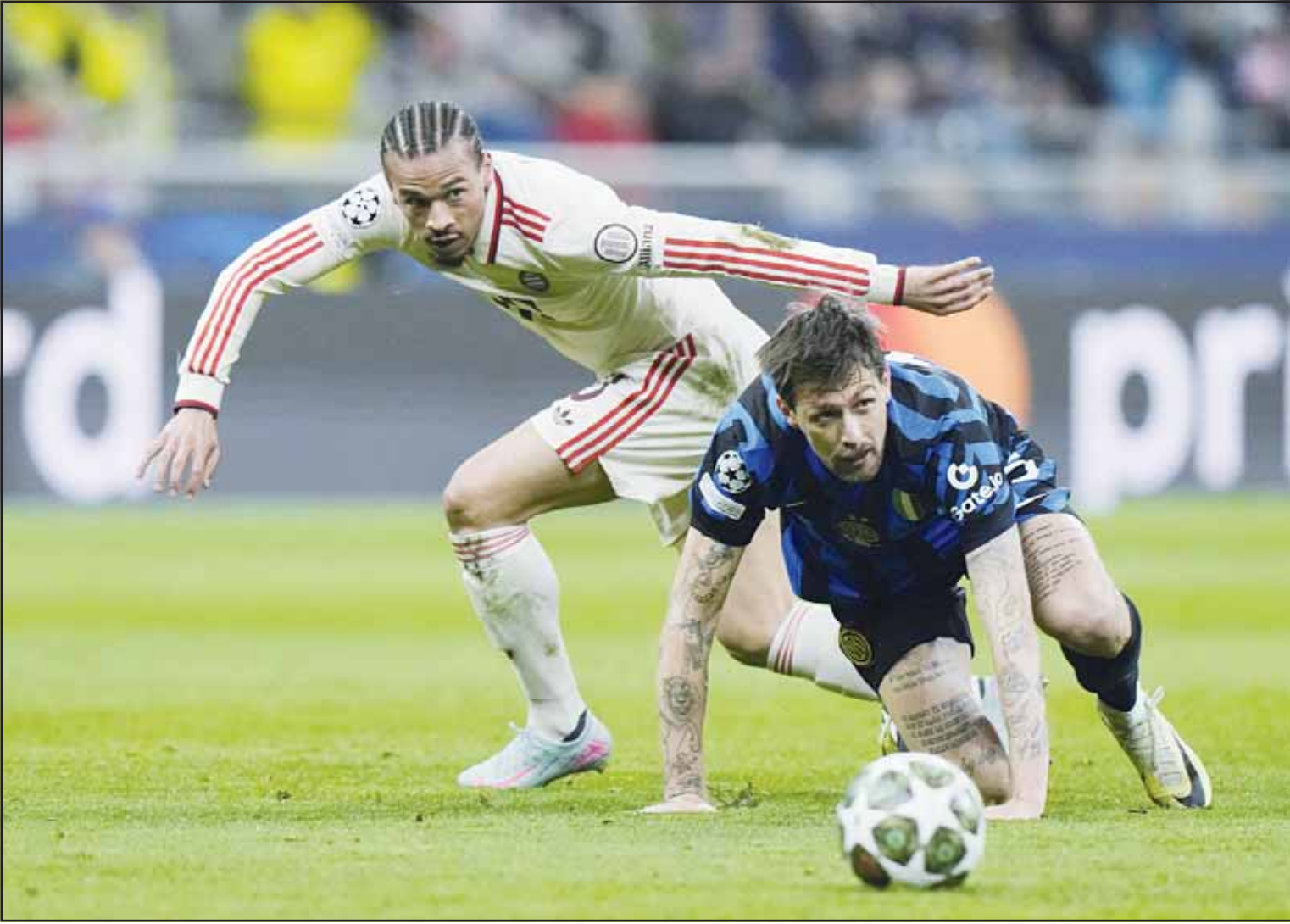
Inter Milan's Francesco Acerbi, right, in action with Bayern's Leroy Sane during the Champions League quarterfinal second leg soccer match between Inter Milan and Bayern Munich at the San Siro Stadium in Milan, Italy.