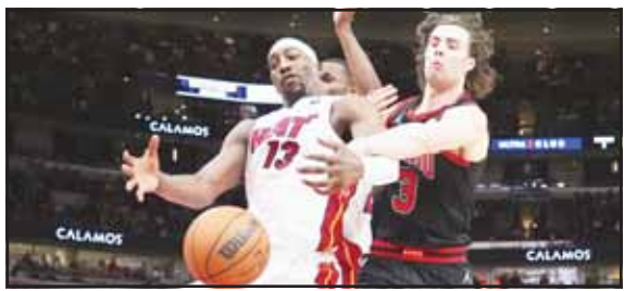
Miami Heat center Bam Adebayo, left, battles for a loose ball against Chicago Bulls guard Josh Giddey during the second half of an NBA Play-In Tournament basketball game in Chicago.