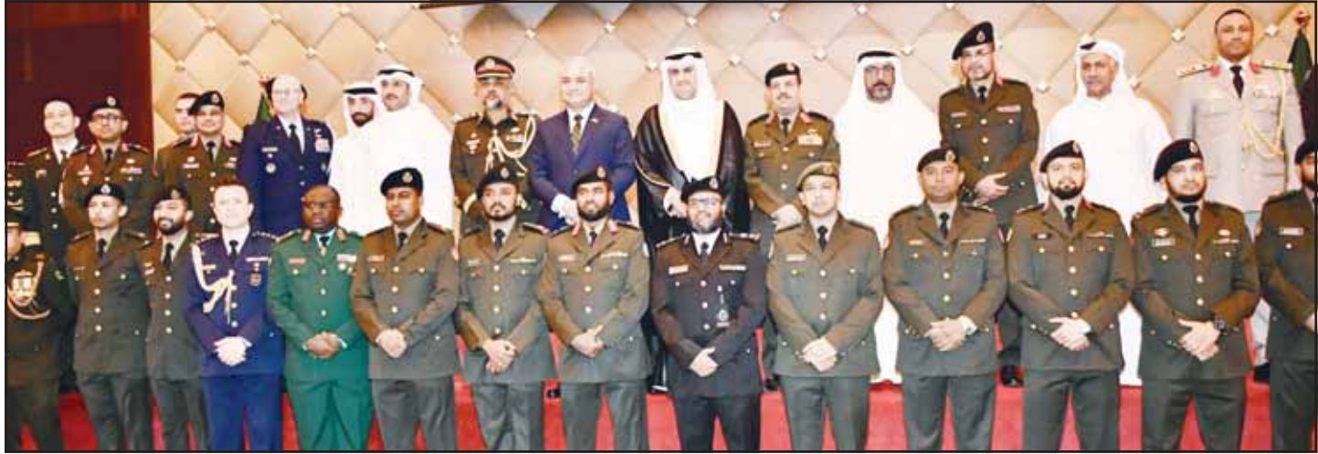
The Bangladesh Ambassador and Minister of Justice pose for a group photo during the celebration