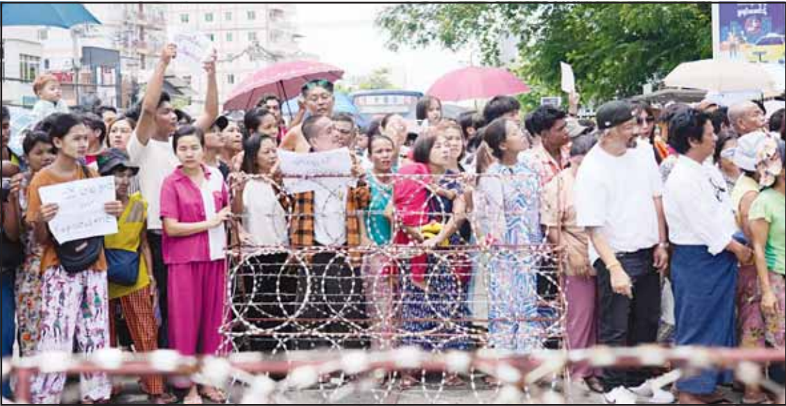
Family members and colleagues wait to welcome released prisoners outside the main gate of Insein prison as the head of Myanmar’s military government granted amnesty to thousands of prisoners to mark the country’s traditional New Year on April 17 in Yangon, Myanmar.

In a development that could further anger North Korea, South Korea’s air force announced later Thursday that it was beginning its large-scale biannual aerial exercise with US forces from Thursday. The air force said the two-week “Freedom Flag” exercise would involve 90 aircraft and other aerial assets from South Korea and the U.S.