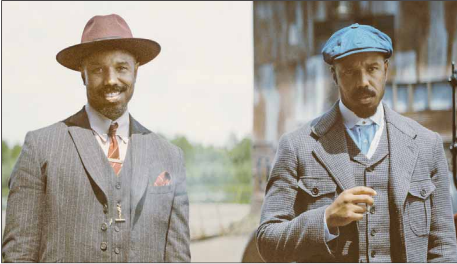
This image released by Warner Bros Pictures shows Michael B. Jordan portraying two characters in a scene from ‘Sinners.’