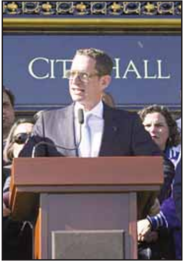
San Francisco Mayor Daniel Lurie speaks at a rally of city leaders opposing President Trump’s immigration crackdown on the steps of City Hall on Jan 28, in San Francisco.

SAN FRANCISCO, April 17, Democrats nationally may be in turmoil, but liberals in San Francisco are hopeful the new mayor’s collaborative approach will help solve entrenched problems in a city recently known for its bitter infighting and chaotic streets. Daniel Lurie, an heir to the the Levi Strauss fortune and anti-poverty nonprofit founder with no elected experience, beat out incumbent London Breed in November after spending nearly $10 million of his own money. Voters embraced his promise to make government work again after years of San Francisco attracting national attention for its empty downtown, open-air drug use and sprawling tent encampments. Earnest and affable, Lurie is often outside City Hall, talking to merchants and residents, both housed and unhoused. He’s reached out to supervisors, including those who feuded with Breed, asking questions and inviting input on thorny topics. In an interview marking 100 days in office, Lurie said San Francisco is cleaning up its act with safer streets. He brushed off concerns over the involvement of corporate executives in his administration and declined to talk about Republican President Donald Trump’s potential impact on San Francisco.