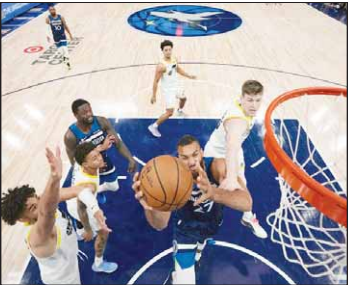
Minnesota Timberwolves center Rudy Gobert (27) goes up for a shot as Utah Jazz forward Kyle Filipowski, right, defends during the first half of an NBA basketball game in Minneapolis.