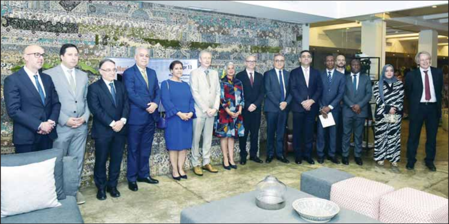
Ambassadors pose for a group photo.

Macron visit likely before year-end: French envoy