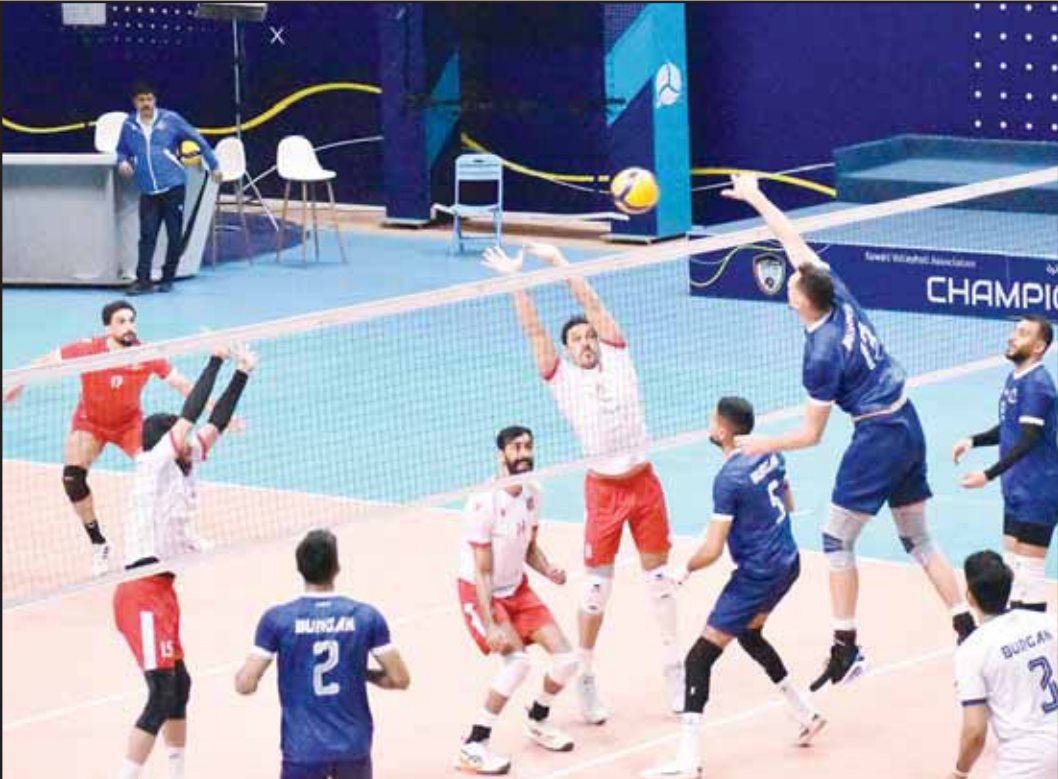
Players fighting for the ball during the league game between Burgan and Kuwait Club.