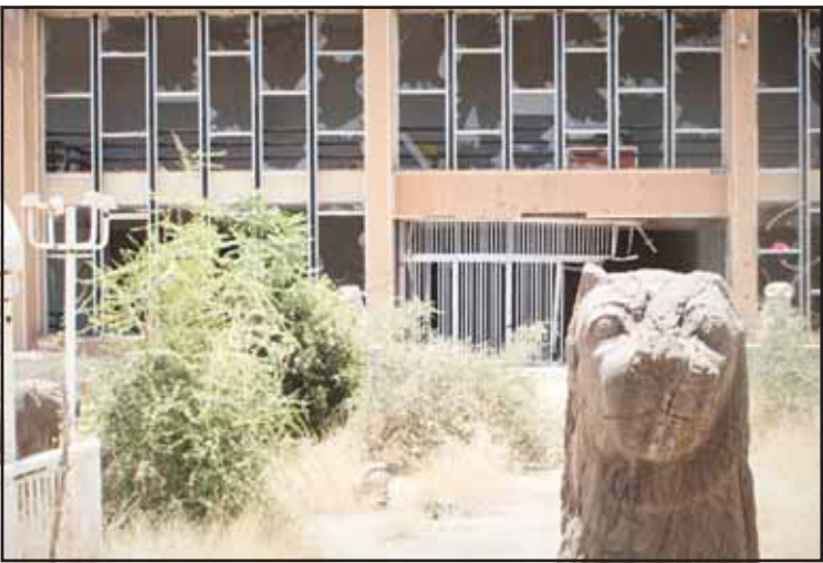
A Meroitic lion statue is seen in the garden of Sudan National Museum, the home to the country's largest artifacts that date to different eras of Sudanese history, after nearly two years of war between the army and paramilitary Rapid Support Forces (RSF), in Khartoum, Sudan, Thursday, April 3.