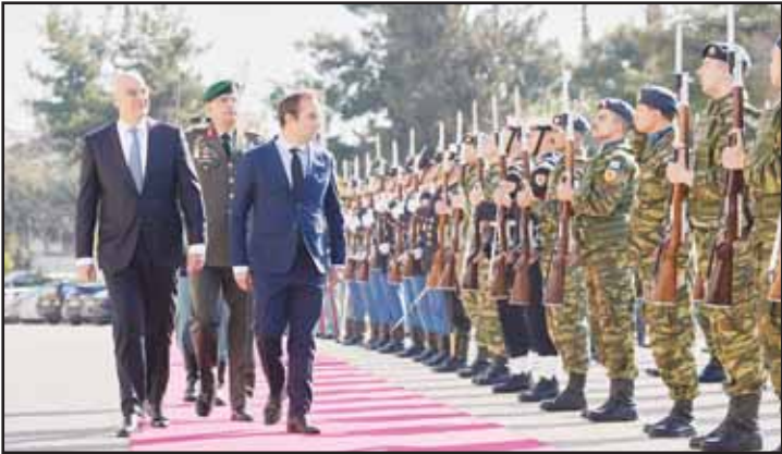
Greek Defense Minister Nikos Dendias, (front left), and his French counterpart Sebastian Lecornu, (front right), inspect the guard of honour before their meeting in Athens, Greece on April 14.

It’s legal for politicians to wager on elections, but the investigation was about whether they used inside information to gain an unfair advantage. One of the popular bets at the time was to wager on the date the prime minister would call an election.