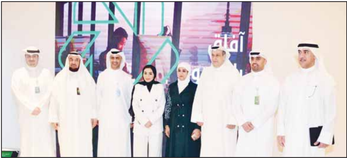
Minister of Social, Family and Childhood Affairs Dr. Amthal Al-Huwailah during the launching of a new initiative titled ‘Partners for their Training’.

Addressing the graduates, she said “today, you are making an exemplary history and building a bright future that your country will be proud of. You are capable of facing challenges, innovating and succeeding with your abilities and talents. We stand with you, hand in hand, toward a future worthy of you and Kuwait.”