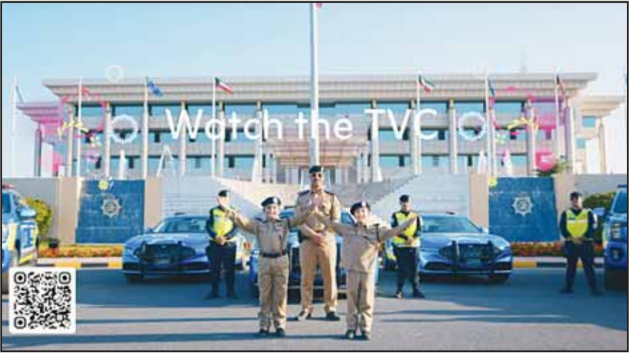
Scan the QR code to watch the TVC.

As one of the nation’s major economic entities, Zain consistently aligns with the state’s social, economic, and security development strategies. The company also expressed pride in being among the first organizations to collaborate with the Ministry of Interior in supporting this initiative, which it hopes will help save lives.