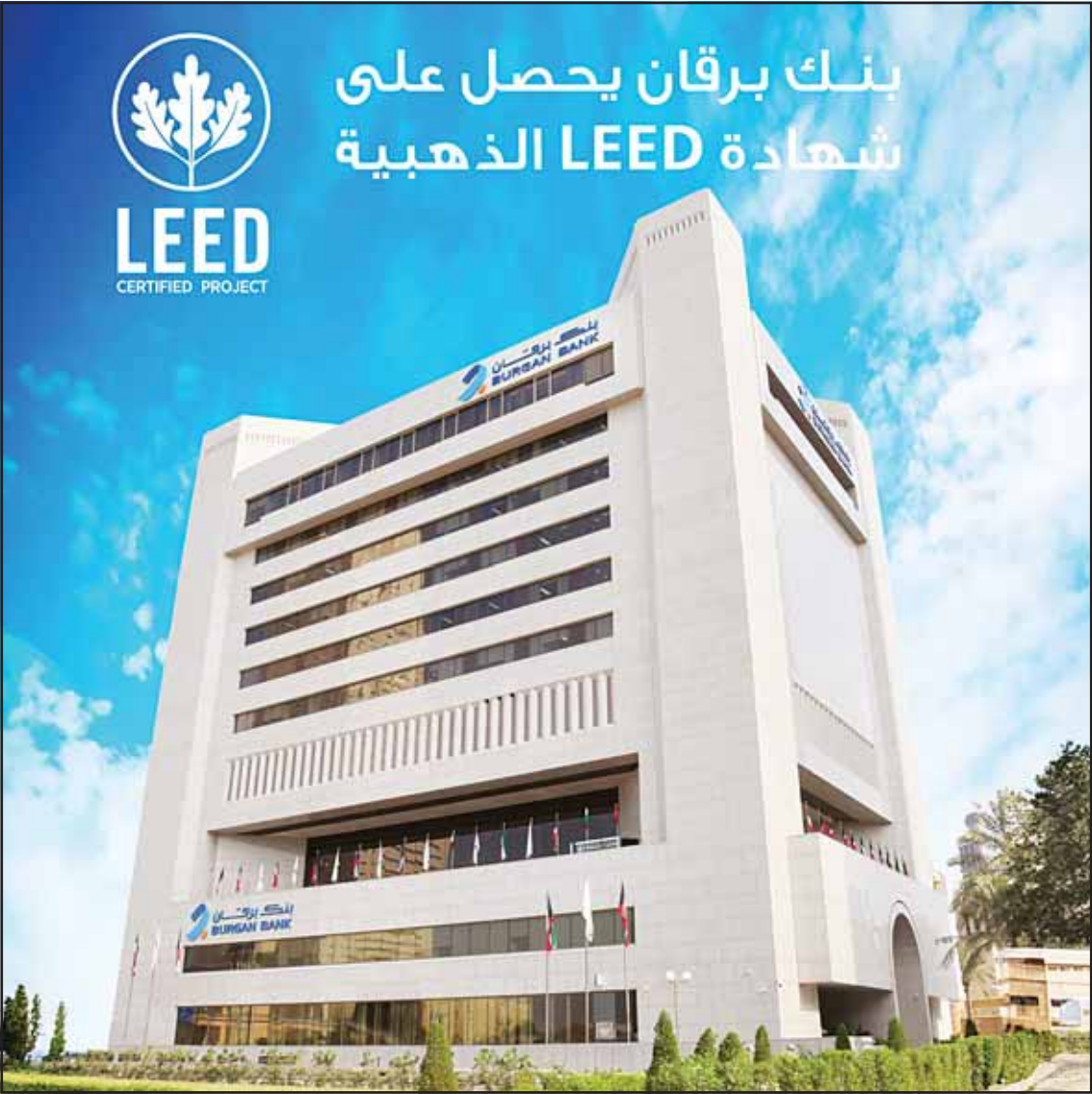
Burgan Bank achieves LEED Gold certification for Operations and Maintenance.

In 2024, Burgan Bank made significant headway in environmental sustainability, driven by a commitment to