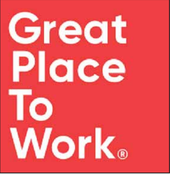
Burgan Bank is the first bank to obtain the Great Place to Work certification.