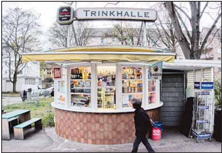
A woman walks past a former water house, a small shop that sprung up in the 19th century to encourage workers to drink affordable water rather than beer or schnapps, that is now a kiosk in Frankfurt, Germany, on March 31, 2025.

would lose something in human terms.” There were once 800 of the freestanding kiosks, but their numbers have diminished as a result of new building and other factors, Gloss says. City authorities say there are now about 300, most of them leased by breweries or distributors of drinks to their operators. Photographer Stefan Hoening says today’s water houses are a place where “everyone, no matter where they come from and no matter what their pay grade, can come together and feel at ease without being judged.” “That’s the good thing about water houses,” the 42-year-old says. “With kiosks, you usually go there, buy something and go back home. Here, people from all the different classes meet.”