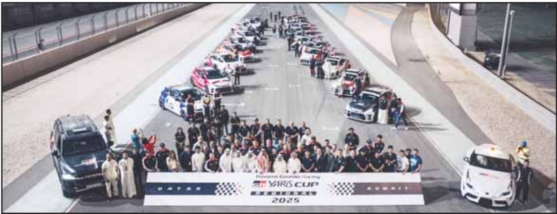
Warba Bank team with officials.