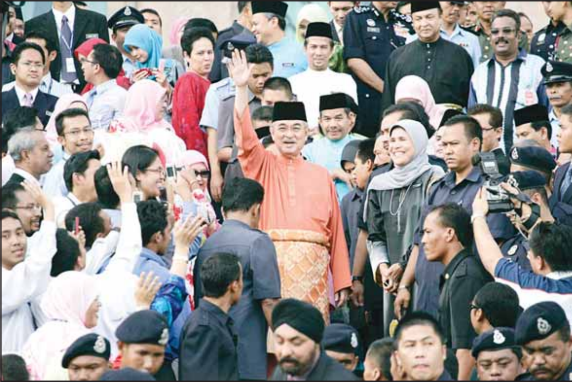
Malaysian former Prime Minister Abdullah Ahmad Badawi, (center), waves as he leaves prime minister’s office in Putrajaya, outside Kuala Lumpur, Malaysia on April 3, 2009.