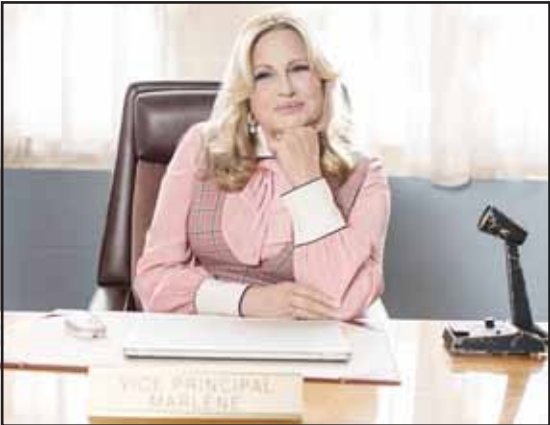
This image released by Warner Bros. Pictures shows Jennifer Coolidge in a scene from 'A Minecraft Movie.'

With an enviable "A+" CinemaScore from audiences, "The King of Kings" is poised to capitalize in the coming week before Easter. Part three of Fathom Entertainment's TV series, "The Chosen: Last Supper," also looked to appeal to Christian audiences. It launched with $6.2 million