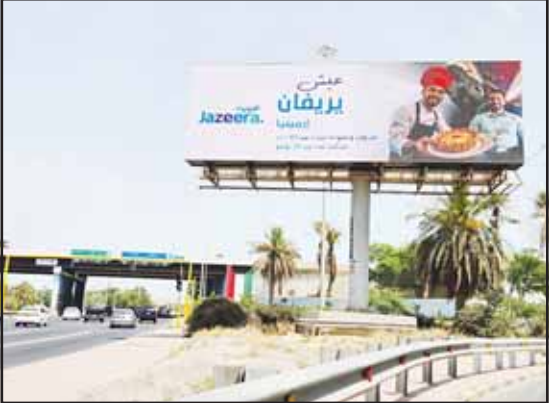
Jazeera brings creative storytelling to aviation marketing.

is not only about the destination, it’s about the journey and more importantly, the experiences. Our latest campaign is more about invoking emotions. We want our passengers to feel the excitement of travel the moment they spot a Jazeera billboard or bus wrap or scroll past our ad online.” A Broad Multi-Channel Execution This campaign reflects Jazeera’s unwavering belief that every detail of travel – across the entire customer journey – should feel personal, seamless, and inspiring. To ensure that the message hits home, Jazeera has launched a 360° campaign including social media and digital platforms, a visual takeover of billboards, digital screens, bus wraps, airport advertising, digital advertising and fresh video content – making the campaign unmissable.