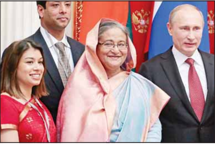
From front left: Tulip Siddiq, Bangladesh Prime Minister Sheikh Hasina and Russian President Vladimir Putin attend a signing ceremony in the Kremlin in Moscow, Russia, Jan 15, 2013.