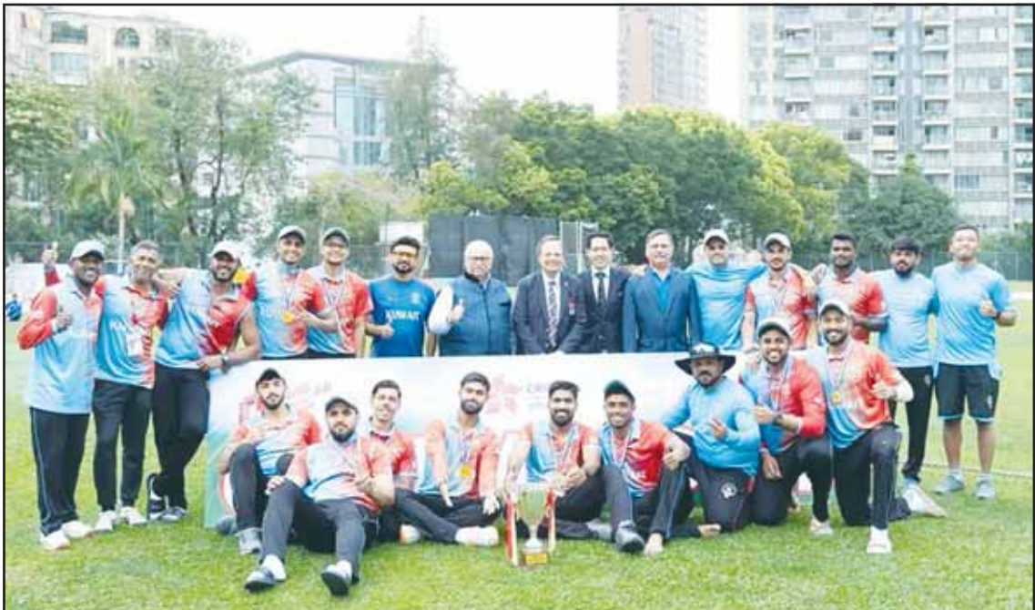
Champion of the Men's T20I Series Kuwait.