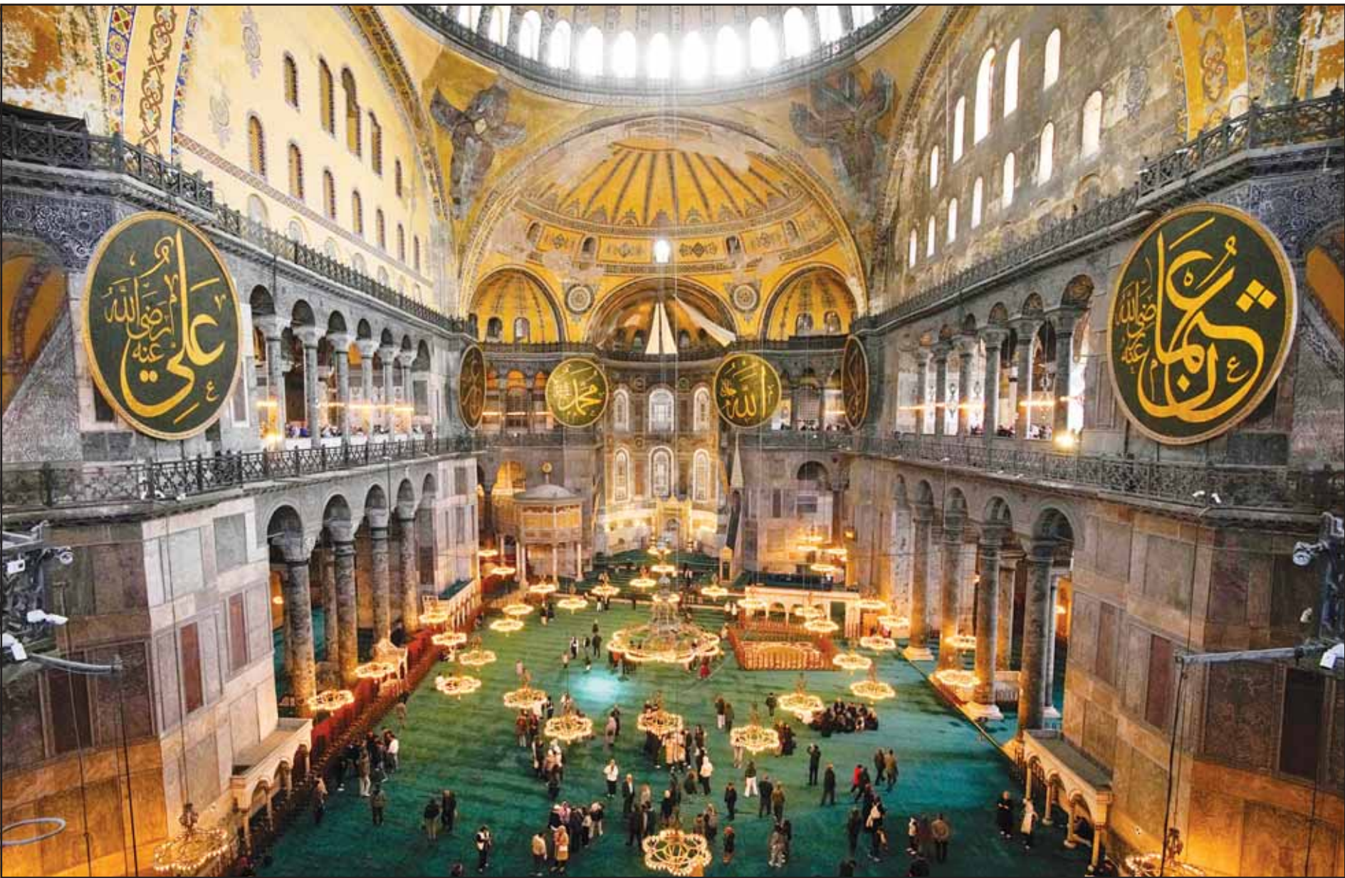
People visit Byzantine-era Hagia Sophia mosque, in Istanbul, Turkey, Sunday, April 13.

with my own eyes.” He said all the city’s museums were damaged, particularly the Ethnography Museum, where walls were demolished and halls and offices burned. The ransacking is a blow to a country with a rich heritage, one that has deep resonance among Sudanese but is often overlooked abroad because of Sudan’s decades of instability. UNESCO said in September it was concerned about looting at the Sudan National Museum, which it helped renovate in 2019. It warned that sale or removal of artifacts “would result in the disappearance of part of the Sudanese cultural identity and jeopardize the country’s recovery.” A UNESCO spokesperson said Friday that damage, looting and destruction of museums and cultural sites happened across Sudan’s states of Khartoum, River Nile, Northern State, Gezira and the Darfur region. An accurate assessment isn’t possible due to the ongoing fighting.