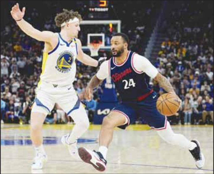
Los Angeles Clippers guard Norman Powell (24) moves the ball while defended by Golden State Warriors guard Brandin Podziemski (2) during the second half of an NBA basketball game in San Francisco.