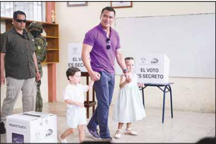
Incumbent President Daniel Noboa holds his children’s hands after voting in the presidential election runoff in Olon, Ecuador on April 13.