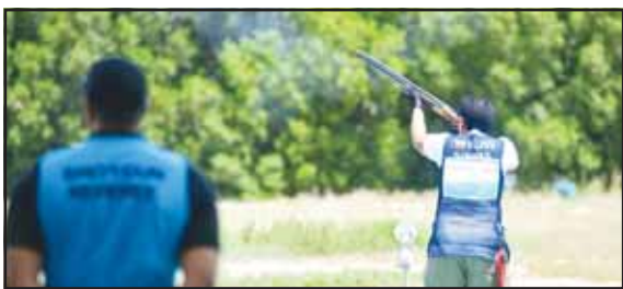
Kuwaiti shooter aims for a target during the International Shooting Championship.