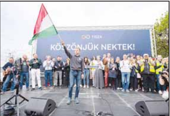
Leader of the Hungarian opposition Tisza Party Peter Magyar waves a Hungarian flag before the results of the party’s public survey entitled ‘Voice of the Nation’ is announced in Budapest, Hungary on April 13.

But recent polls suggest that Tisza has pulled ahead of Fidesz in popularity as Magyar’s campaign focuses on economic and social issues facing the country like persistent inflation, a poor healthcare system and alleged government corruption.