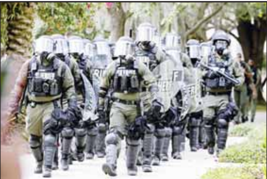
Law enforcement officers approach protesters as they congregate at MLK Plaza at the University of South Florida on April 30, 2024, in Tampa, Fla.

Under a 287(g) task force model, such as the agreement being pursued by the University of Florida, participating officers