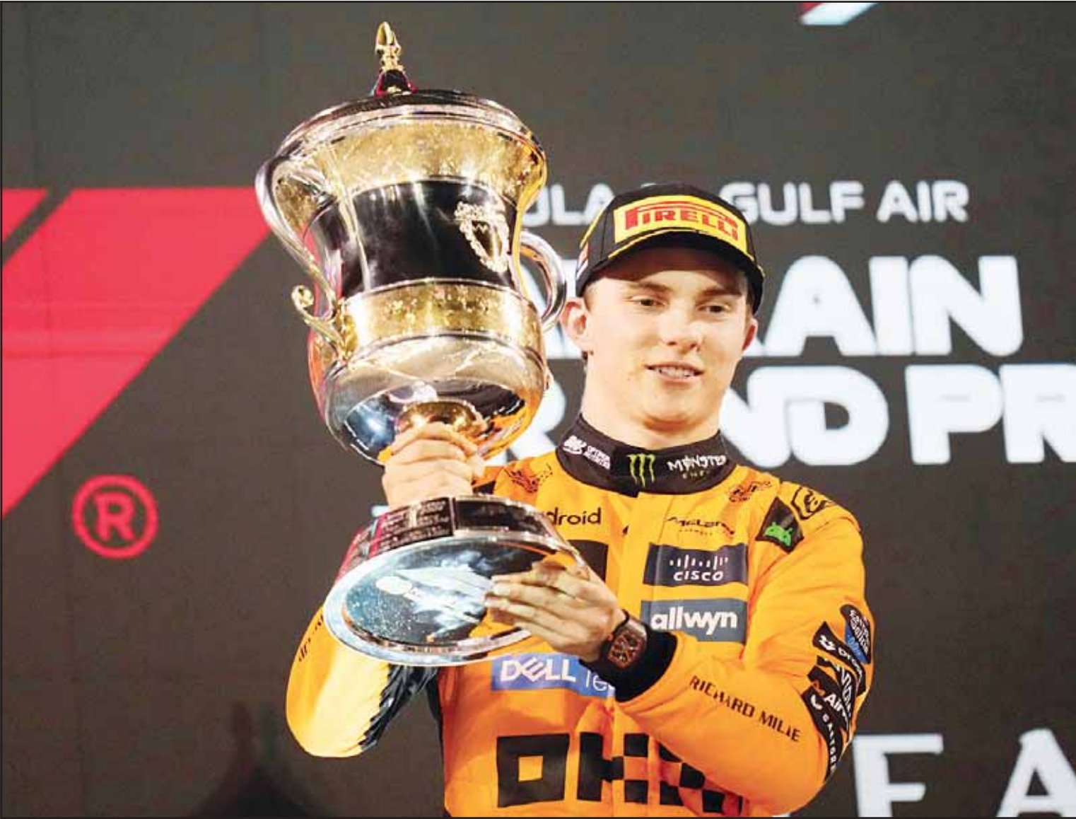
McLaren driver Oscar Piastri of Australia holds the trophy after winning the the Formula One Bahrain Grand Prix, in Sakhir.