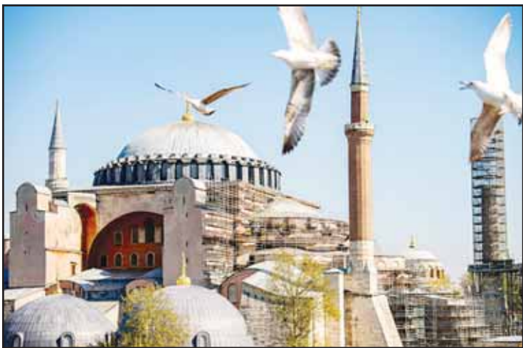
Scaffolds are installed in Byzantine-era Hagia Sophia mosque for restoration work, in Istanbul, Turkey, Sunday, April 13. (AP)

ISTANBUL, April 14, (AP): Turkey has begun a new phase in sweeping restorations of the nearly 1,500-year-old Hagia Sophia in Istanbul, focusing on preserving the monument’s historic domes from the threat of earthquakes. Officials say the project will include reinforcing Hagia Sophia’s main dome and half domes, replacing the worn lead coverings and upgrading the steel framework while worship continues uninterrupted in the mosque. A newly installed tower crane on the eastern façade is expected to facilitate the efforts by transporting materials, expediting the renovations. “We have been carrying out intensive restoration efforts on Hagia Sophia and its surrounding structures for three years,” said Dr. Mehmet Selim Okten, a construction engineer, lecturer at Mimar Sinan University and a member of the scientific council overseeing the renovations. “At the end of these three years, we have focused