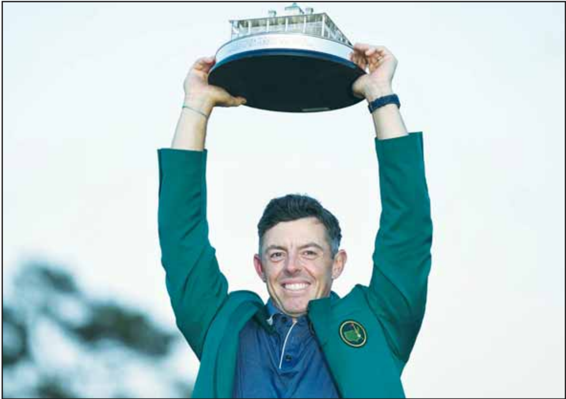
Winner Rory McIlroy, of Northern Ireland, holds the trophy at the Masters golf tournament in Augusta, Ga.

give up on your dreams. Never, ever give up on your dreams." This was shaping up as another horror show for McIlroy, who in 2011 lost a four-shot lead on the final day with a 43 on the back nine, a highlight reel that now can start collecting dust. "I didn't make it easy today," McIlroy said. Right when it looked as though he would throw away another major, McIlroy delivered two majestic shots when nothing less would do, two birdies that sent him to the 18th hole with a one-shot lead. That still wasn't enough. He hit a wedge into the bunker and wound up missing a 5-foot par putt for a 1-over 73 and the first Masters playoff in eight years.