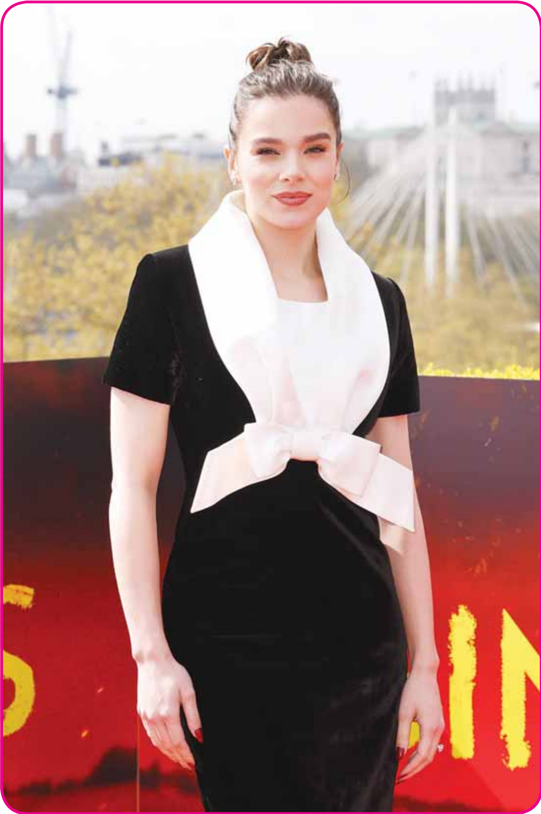
Hailee Steinfeld poses for photographers during the photo call for the film 'Sinners' on Sunday, April 13, in London.