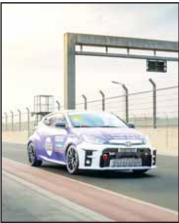
GR Yaris Warba car