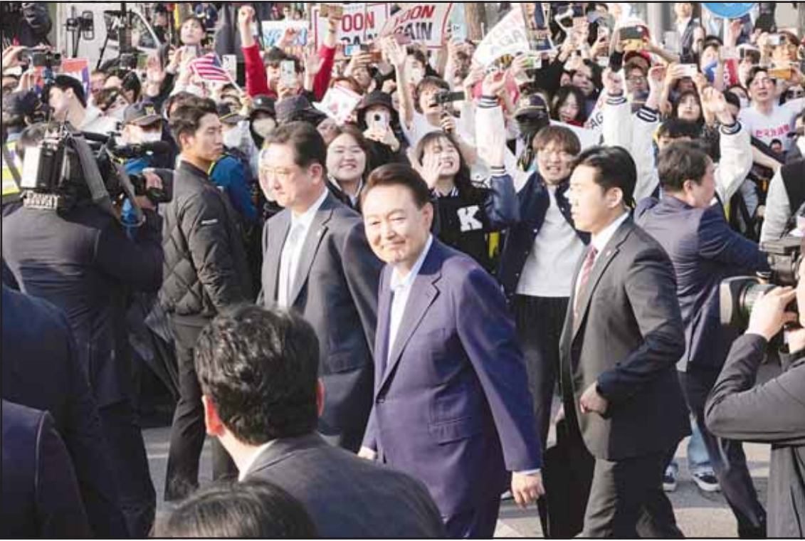
Recently ousted South Korean President Yoon Suk Yeol leaves the presidential residence in Seoul, South Korea on April 11.