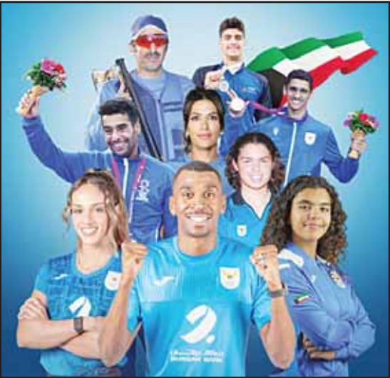
The Kuwaiti athletes that participated in the 2024 Paris Olympics.

In addition, Burgan supported numerous initiatives across the areas of health, sports, education, and inclusion. Highlights included its continued support for Team Kuwait at the Paris 2024 Olympics, backing youth empowerment through sports and national pride. For 23 years, Burgan has also proudly partnered with the Kuwait Association for Care of Children in Hospital (KACCH) and Bayt Abdullah Children’s Hospice (BACCH), ensuring vital palliative care services for children in need. Further community contributions in 2024 included support for the Kuwait Association for Learning Differences,