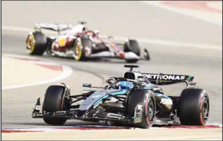
Mercedes driver George Russell of Britain in action during the Formula One Bahrain Grand Prix, in Sakhir.

Charles Leclerc and Lewis Hamilton before falling short in his attempt to beat Russell for second. “A messy race for me and disappointed not to bring home the one-two for McLaren,” Norris said. Russell had to deal with electrical problems on his car and was facing an investigation into his use of the DRS overtake aid system. Russell said it had opened by accident when he pressed the button to use the radio but said he eased off and didn’t gain an advantage. The stewards agreed and didn’t give him a penalty. Russell’s second place was the best result for Mercedes since Russell won the Las Vegas Grand Prix in November. Leclerc was fourth for Ferrari after losing a hard-fought battle to Norris while his teammate Hamilton started ninth but cut through the field to finish fifth. After last week’s race in Japan resembled a procession, with all of the top six finishing in the order they started, Bahrain offered a festival of overtaking. Verstappen won last week but was never in contention in Bahrain and was even last at one stage. He survived an overheating car and a slow pit stop to place sixth, passing Pierre Gasly, who was seventh for Alpine. Esteban Ocon of Haas was eighth, with Yuki Tsunoda ninth for his first points since joining Red Bull - and the team’s first for any driver other than Verstappen since November - and Oliver Bearman 10th in the other Haas.