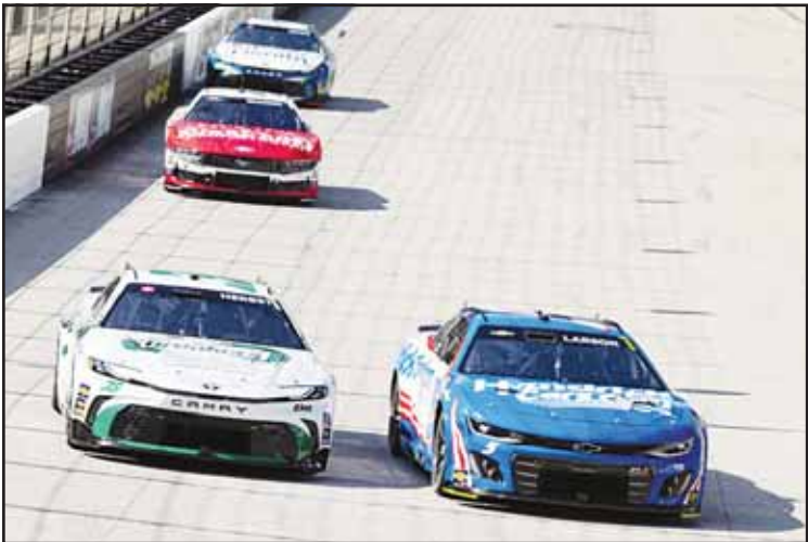
Kyle Larson (5) passes Riley Herbst (35) during a NASCAR Cup Series auto race in Bristol, Tenn.