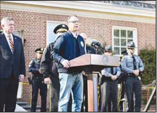
Pennsylvania Gov Josh Shapiro speaks during a news conference at the governor’s official residence about a suspected arson fire that forced him, his family and guests to flee in the middle of the night on the Jewish holiday of Passover on April 13, in Harrisburg, Pa.