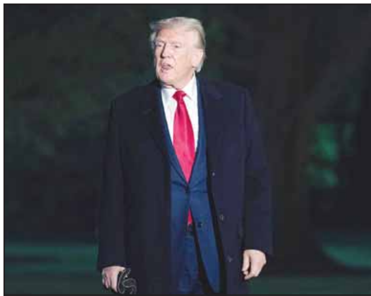
President Donald Trump talks to reporters as he walks on the South Lawn of the White House in Washington, Sunday, April 13.

In his social media message, Trump said "60 Minutes" was no longer a news show but "a dishonest Political Operative simply disguised as 'News,' and must be responsible for what they have done, and are doing."