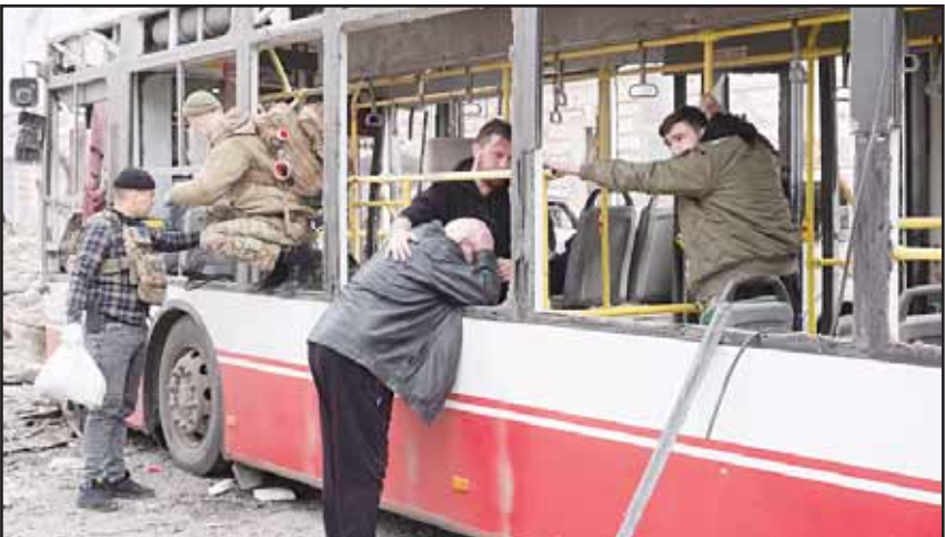
A man cries as he leans on the bus that was hit by a Russian missile on Sumy, Ukraine on April 13.

Polish Foreign Minister Radek Sikorski, whose country holds the European Union’s rotating presidency, called the attacks “Russia’s mocking answer” to Kyiv’s agreement to a ceasefire proposed by the U.S. over a month ago.