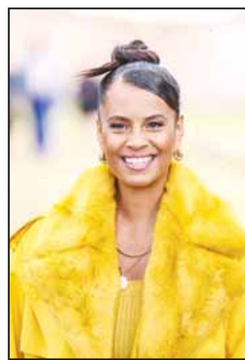
Neneh Cherry poses for photographers upon arrival at the Burberry Spring Summer 2024 fashion show on Monday, Sept. 18, 2023 in London.

Meanwhile, National Book Award winner Sigrid Nunez and