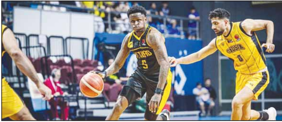
Al-Ittihad player dribbles the ball past Al-Qadsiya player.