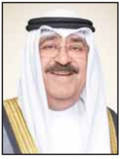
HH the Amir