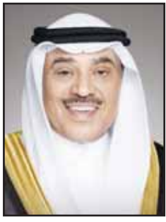
HH the Crown Prince