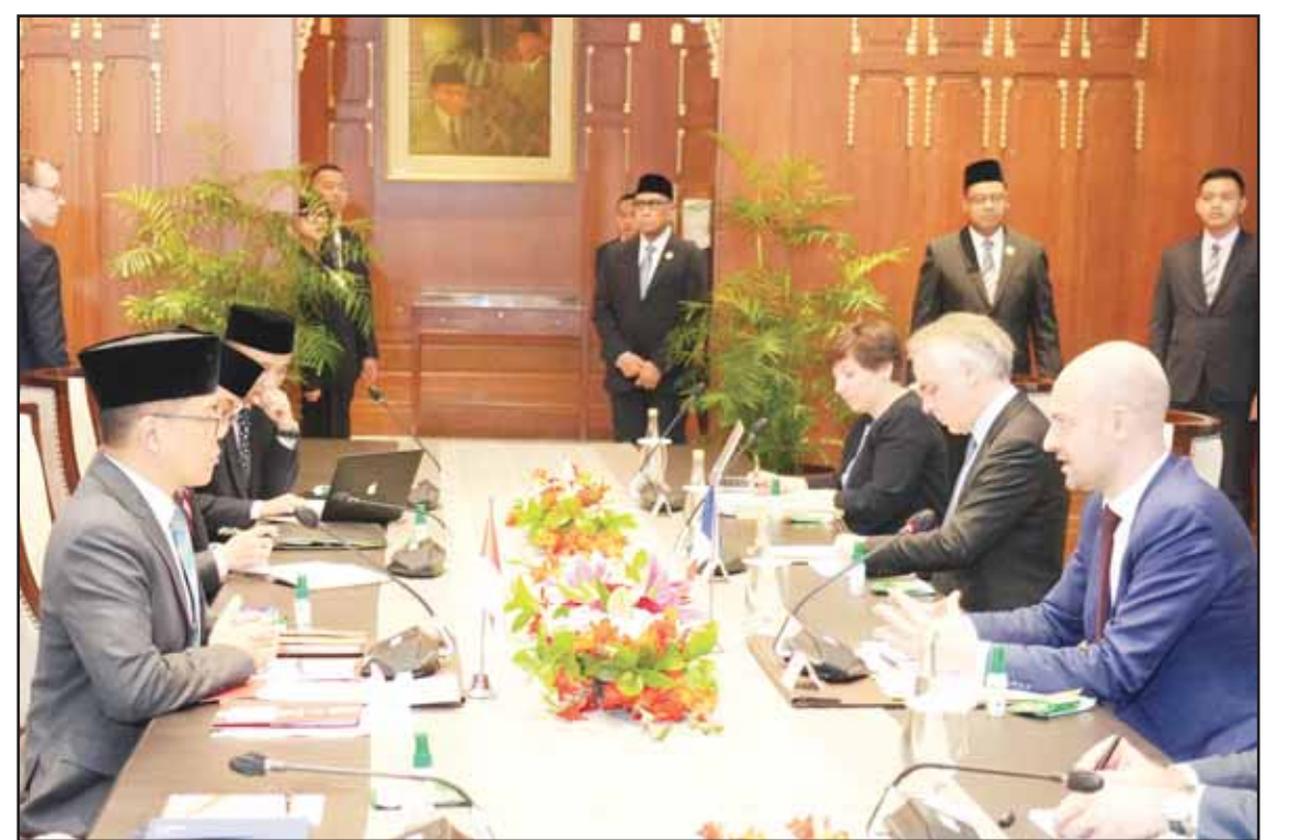
Indonesia's Foreign Minister Sugiono, (left), sits with France's Foreign Minister Jean-Noel Barrot, right, during their bilateral meeting in Jakarta, Indonesia on March 26.