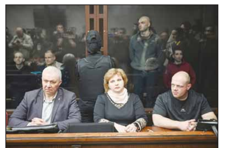
Lawyers of Ukrainians captured by Russia during hostilities in Ukraine sit in front of the defendant's cage during a hearing at the Southern District Military Court in Rostov-on-Don, Russia on March 26.

The defendants included 14 current or former fighters of the elite Azov brigade, which Russia designated a terrorist group, and nine women and one man who worked as cooks or support personnel, according to Russian media reports and rights activists. Twelve defendants were not in court - 11 had returned to Ukraine in two prisoner exchanges and were convicted in absentia. One more died in custody last year, and the case against him had been closed.