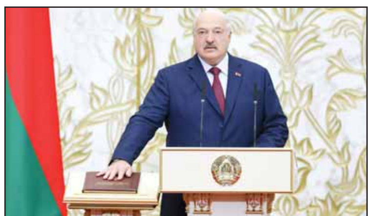
In this photo released by Belarus' Presidential Press Service, Belarusian President Alexander Lukashenko takes his oath of office during his inauguration ceremony at the Palace of the Independence in Minsk, Belarus on March 25.

Opposition members have been imprisoned or exiled abroad by Lukashenko's unrelenting crackdown on dissent and free speech.