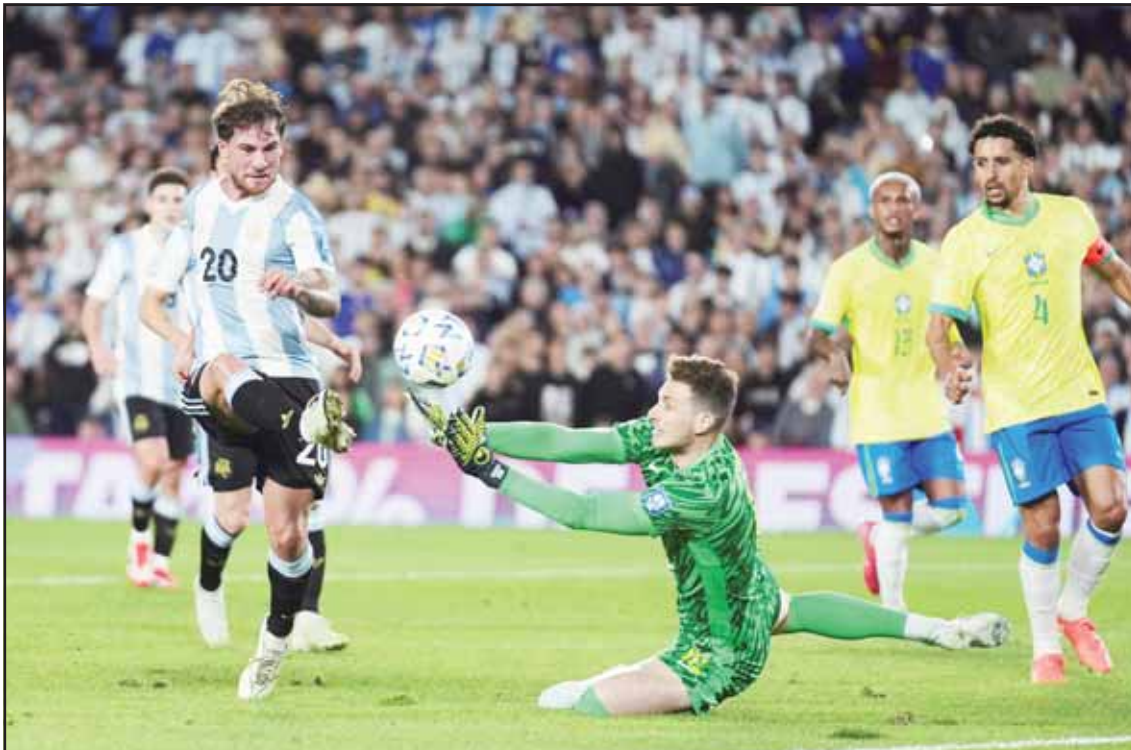
Argentina's Nicolas Tagliafico scores his side's third goal against Brazil during a World Cup 2026 qualifying soccer match at Monumental Stadium in Buenos Aires, Argentina, Tuesday, March 25, 2025.

BUENOS AIRES, Argentina, March 26, Defending champion Argentina had to put the celebrations on hold for a while after securing a place at the 2026 World Cup before kickoff against arch-rival Brazil.