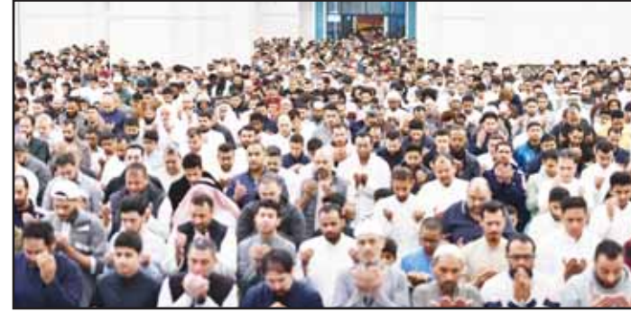
O, Allah, please forgive us: Worshippers packed like sardines in one of the mosques south of Kuwait City on the 25th night of holy month of Ramadan.

The halls of the Grand Mosque were filled with worshippers who started arriving since the evening hours opting to perform the night prayer behind a group of imams with melodious voices, carefully selected by the Ministry of Awqaf and Islamic Affairs