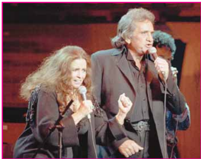
In this Oct. 16, 1992, file photo, singers June Carter Cash and husband Johnny Cash perform at New York's Madison Square Garden.