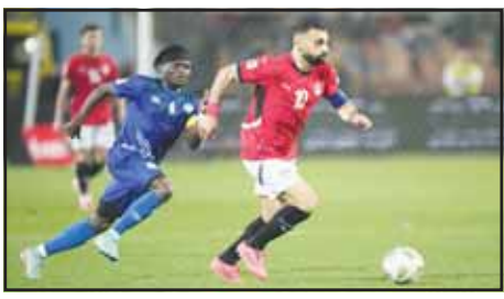
Egypt's Mohamed Salah, right, is challenged for the ball by Sierra Leone's Alhassan Koroma at a World Cup 2026 qualifying soccer match at Cairo International Stadium. Egypt won 1-0. — See Page 15