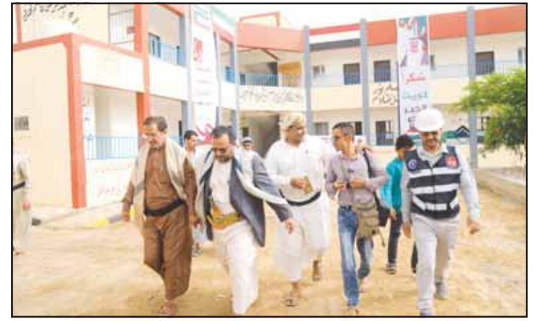
Aisha Fakhro Educational Center meets the needs of hundreds of displaced students in Yemen's Marib Governorate.