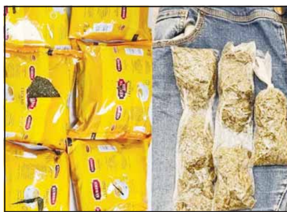
Marijuana packed in tea bags seized by airport customs.