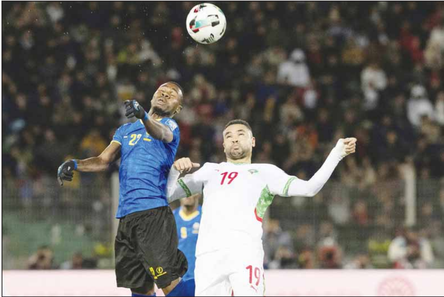
Tanzania's Mudathiri Yahya Abbas, left, is challenged by Morocco's Youssef En-Nesyri during the World Cup Group E qualifying soccer match between Morocco and Tanzania at the Stade municipal d'Oujda, Morocco.

Congo moves top of Group B on 13 points, one ahead of unbeaten Senegal