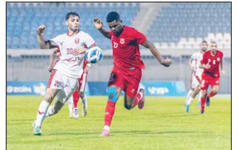
A file photo of players challenging for the ball during the Zain Premier League match.

After this round, the top six teams will advance to the single-round "Championship" league, while the bottom four teams will compete in the "Relegation League," also in a single-round format, with two teams set for