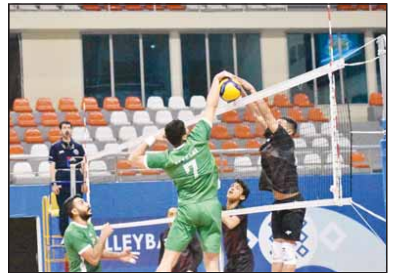
Players battling for the ball.

Meanwhile, Al-Nasr, Al-Sulaibikhat, Al-Yarmouk, Al-Tadamon, and Al-Sahel will compete in the first division across three stages.