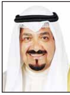
HH the PM