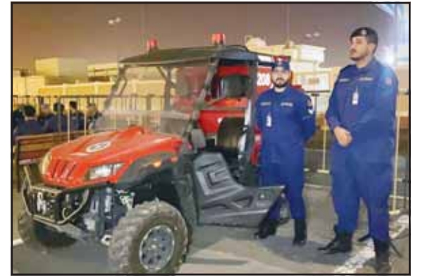
KFF use such buggies in case of inaccessible spots at the blaze site.