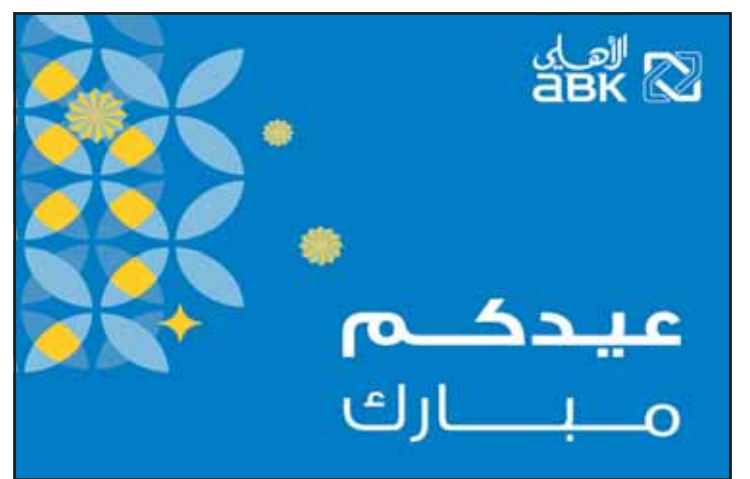
ABK extends Eid Al-Fitr greetings.

The Bank has also confirmed its full operational readiness to serve customers 24/7 via its various digital platforms throughout the holiday. This includes Online Banking via eahli.com, Mobile Banking through the ABK app, as well as the Bank's call center Ahlan Ahli 1 899 899 and its ATM network.