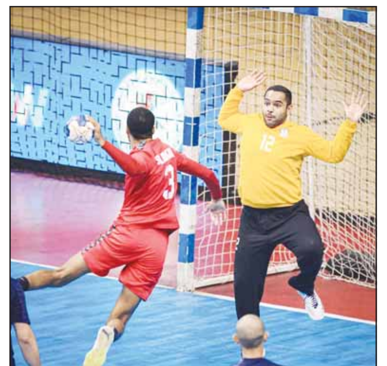
Sulaibikhat player makes a goal attempt against Yarmouk.