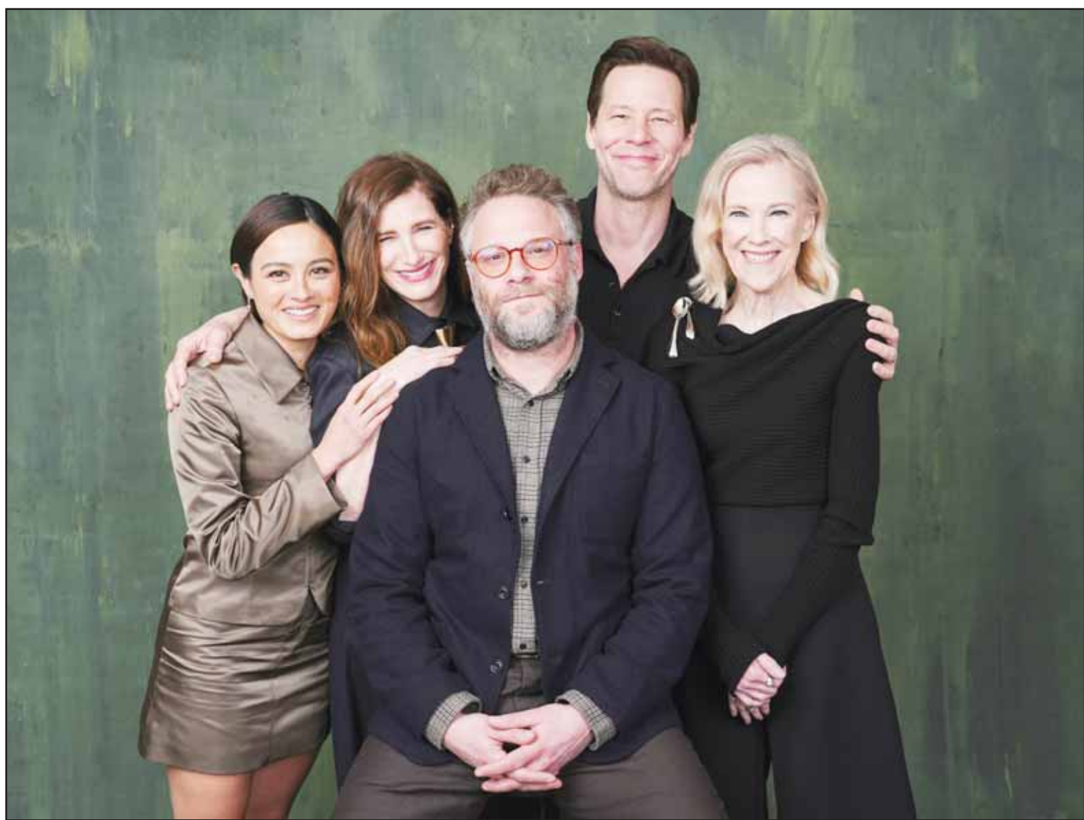
Chase Sui Wonders, (from left), Kathryn Hahn, Seth Rogen, Ike Barinholtz and Catherine O'Hara, cast members in the Apple TV+ series 'The Studio,' pose together on Thursday, March 20, in Los Angeles.