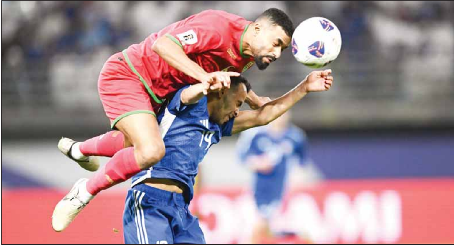
Players vie for the ball during World Cup qualifying match between Kuwait and Oman.

Despite this, Kuwait's progress under Argentine coach Juan Pizzi has been notable, as the team has begun to develop a clearer identity on the field. However, fans aspire to more than just improvement – they want tangible success and a return to the World Cup, especially with Asia's expanded qualification spots increasing their chances of