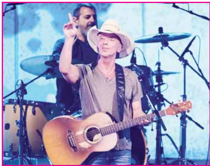
Kenny Chesney performs during the iHeartRadio Music Awards, on Monday, March 17, 2025 at the Dolby Theatre in Los Angeles.