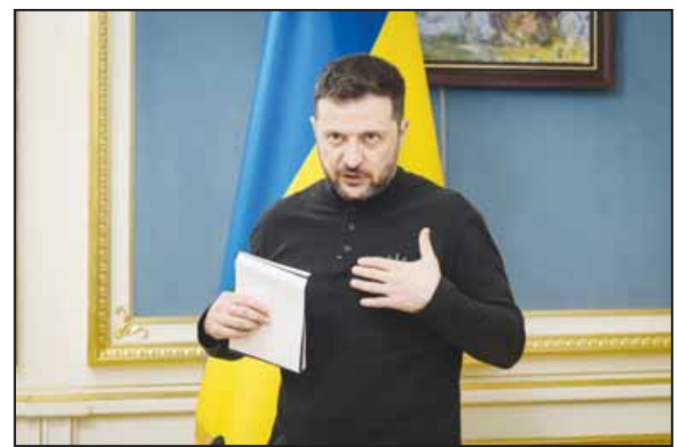
Ukrainian President Volodymyr Zelenskyy speaks during a briefing in Kyiv, Ukraine on March 25.

thanked the US for its efforts to strike an agreement, questions remained over some key details, and a comprehensive peace deal to end the three-year war still looked distant.