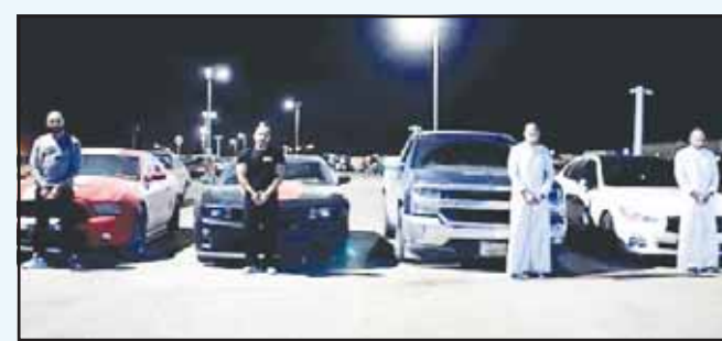
Some of the drifters and their cars in police custody.