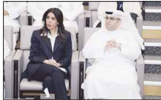
Minister of Housing Abdullatif Al-Mishari and Minister of Public Works Dr. Noura Al-Mashaan during the first meeting of the government coordination committee to follow up on the implementation of services related to housing projects.

Al-Mishari underscored the importance of government agencies adhering to project timetables and performance indicators to ensure timely and efficient execution. He explained that an agency's efficiency is measured by its ability to adhere to the plans and schedules it has submitted.