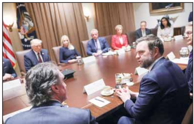
US Vice President JD Vance, (in foreground at right), speaks during a cabinet meeting at the White House in Washington on March 24.