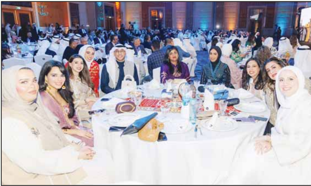
Part of the audience.