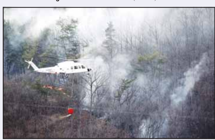
A helicopter performs a water drop on a wildfire in North Gyeongsang province, South Korea on March 22.

Australian state of Victoria announced on Saturday that an 18-year-old man was charged with murder following a fatal stabbing in Lyndhurst, a suburb in Melbourne, earlier this month.