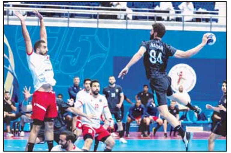
Kuwait Club players defend as an opponent makes a goal attempt.

Meanwhile, Al-Salmiya is determined to avenge its Super Cup loss. Under national coach Yaqoub Al-