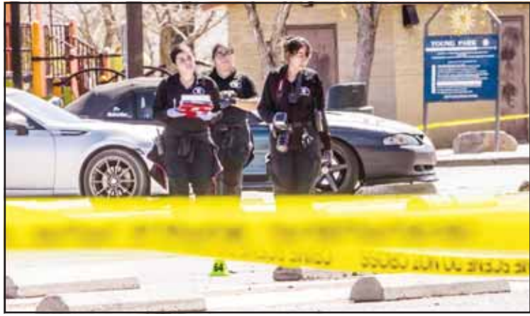
Crime scene technicians investigate the parking lot at Young Park after Friday night's fatal shooting in Las Cruces, NM on March 22.