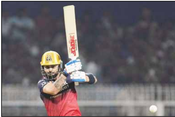
Royal Challengers Bengaluru's Virat Kohli bats during the Indian Premier League cricket match between Kolkata Knight Riders and Royal Challengers Bengaluru at Eden Gardens in Kolkata, India.

Kock early when he was caught behind off Josh Hazlewood for four.