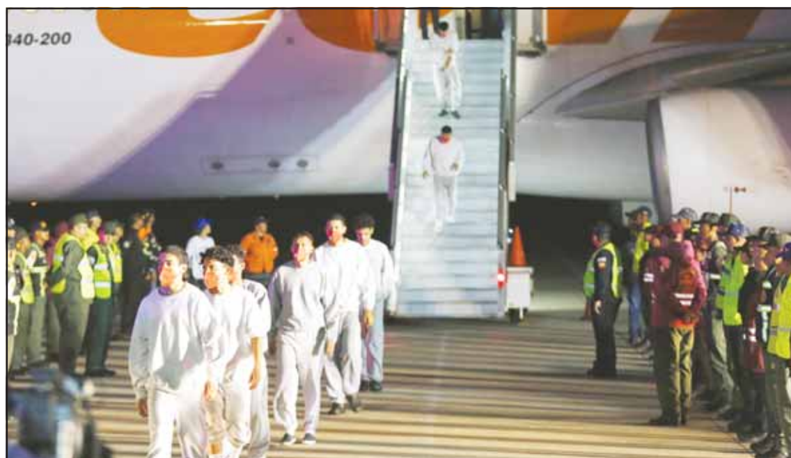
Venezuelan migrants deported from the United States deplane at the Simon Bolivar International Airport in Maiquetia, Venezuela on Feb 20.