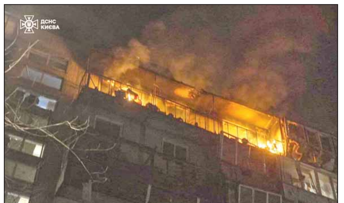
In this photo provided by the Ukrainian Emergency Service, firefighters put out the fire after a drone hit an apartment in a multi-storey building during Russia's drone attack in Kyiv, Ukraine on March 23. (AP)

"The government is determined to do everything it can to prevent a repeat of what happened at Heathrow," Miliband said.