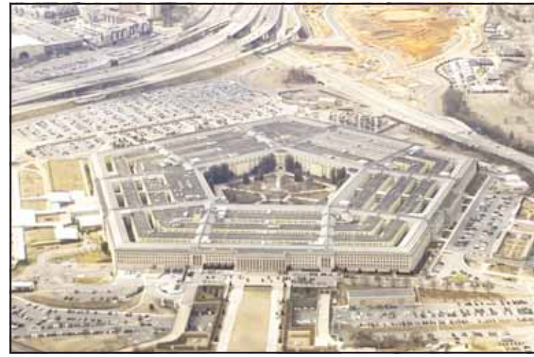
The Pentagon is seen in this aerial view through an airplane window in Washington on Feb 20.

The Justice Department on Friday announced an investigation into "the