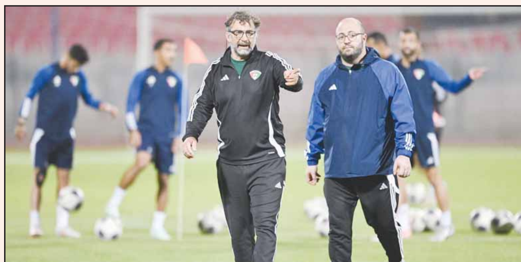
The head coach Juan Pizzi, alongside assistant Ahmed Abdul Karim lead training session.

"Our dear fans ... you are our source of strength. Book your tickets and cheer for the Blues!"