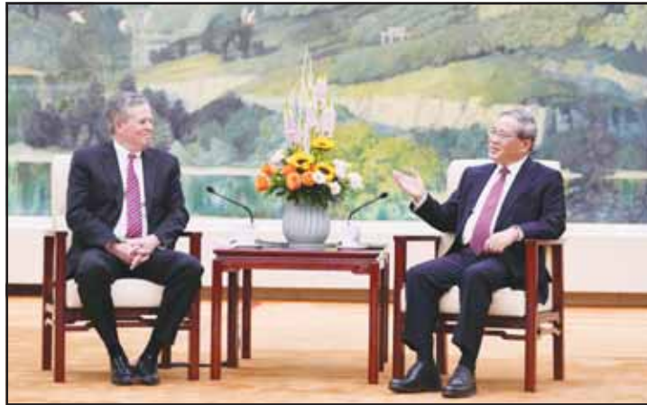
Chinese Premier Li Qiang, right, meets US Senator Steve Daines in the Fujian Room at the Great Hall of the People in Beijing, China on March 23.

Just months into Trump's second term, relations between the world's two