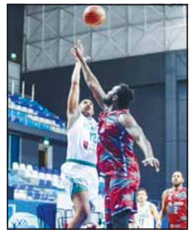
Players fighting for the ball.

Al-Nasr controlled the game from start to finish, winning all four quarters. It led 23-20 after the first quarter and extended its advantage to 53-47 by halftime, thanks to a 31-point second quarter. Al-Nasr delivered its strongest defensive performance in the third quarter, restricting Al-Arabi to just 17 points, while American