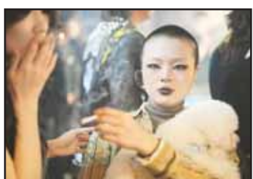
A woman attends a punk festival in Hangzhou, China, Friday, Jan. 17, 2025.

About a dozen people in front of the stage slammed into each other as if possessed by the thumping beat. There