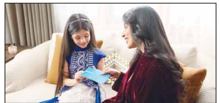
Burgan Bank supports Eidity campaign with 15 ATMs across Kuwait.

Every year, Burgan Bank also offers a complimentary Eidy delivery service to its Elite customers, in collaboration with Peacock Concierge. As part of this service, the Bank delivers fresh bank notes in the denominations of the customer's choice and to any location they prefer – be it their home or workplace – to save them the hassle of visiting a branch in person.