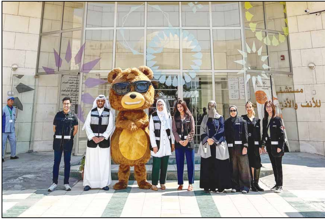
Group photo of the team in front of Zain Hospital.