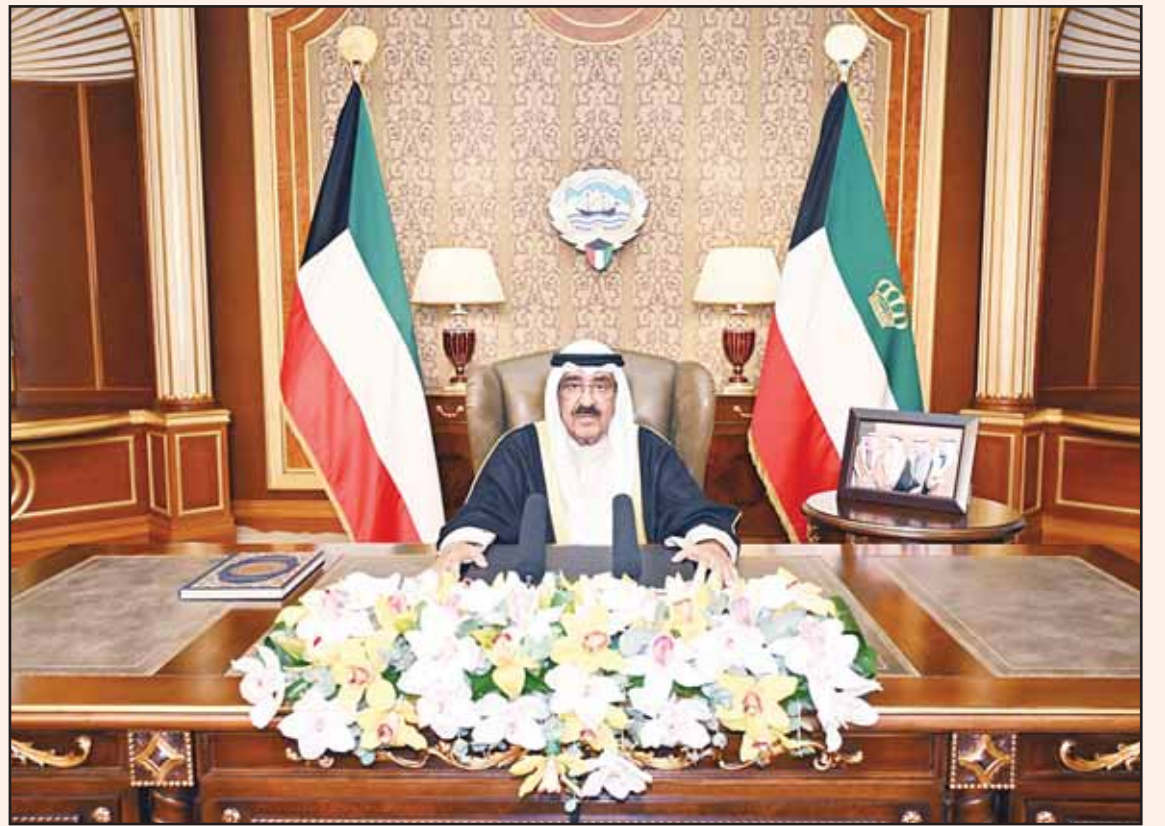
His Highness the Amir Sheikh Meshal Al-Ahmad Al-Jaber Al-Sabah addresses the nation on the occasion of the last 10 days of Ramadan.