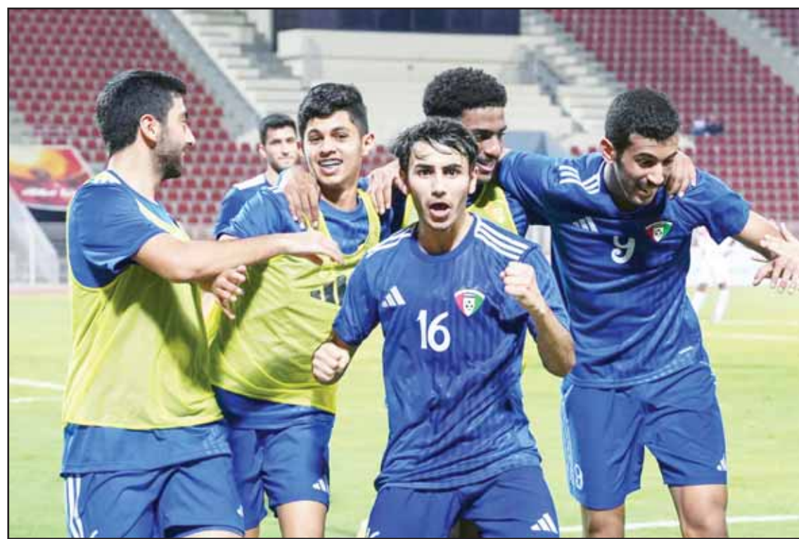
Kuwaiti players celebrate after besting UAE.

MUSCAT, March 23: The Kuwait Olympic team secured a 1-0 victory over the UAE at the Qaboos Complex in Muscat, during the West Asian Under-23 Championship.