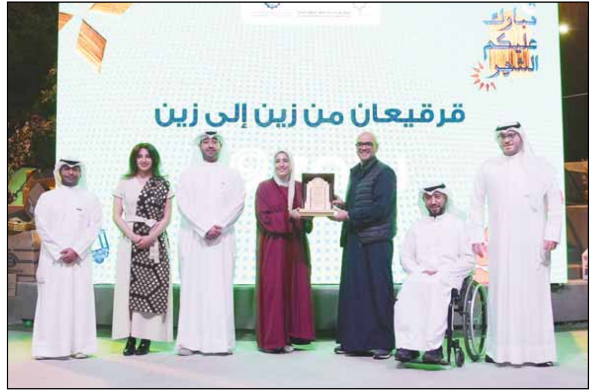
Zain recognized for its annual support of the Girgeaan celebration at Al-Kharafi Center.

Celebrating Girgeaan at Zain & Jaber Hospitals, Al-Kharafi Center, and Al-Tomoooh Club