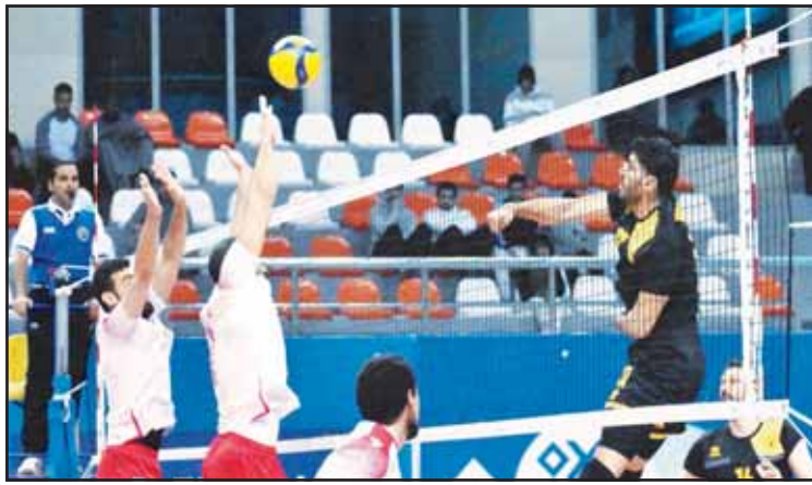
Qadsia player spikes the ball as Kuwait Club players defend.