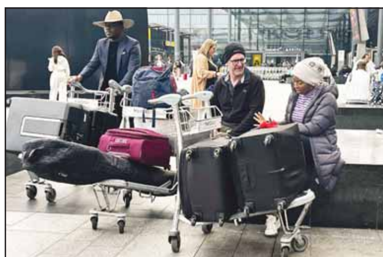
Travellers wait outside the terminal as Heathrow Airport slowly resumes flights after a fire cut power to Europe's busiest airport in London on March 22.

tem Operator, which oversees U.K. gas and electricity networks, to "urgently investigate" the fire, "to understand any wider lessons to be learned on energy resilience for critical national infrastructure."