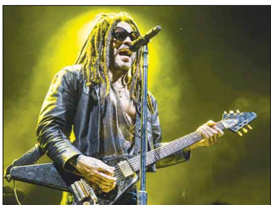
Artist Lenny Kravitz performs on stage at the Royal Arena, in Copenhagen, Saturday, March 22.

"I am immensely grateful for the extraordinary support I have received since the beginning of the trial. I now want to tell my story in my own words," Pelicot said.