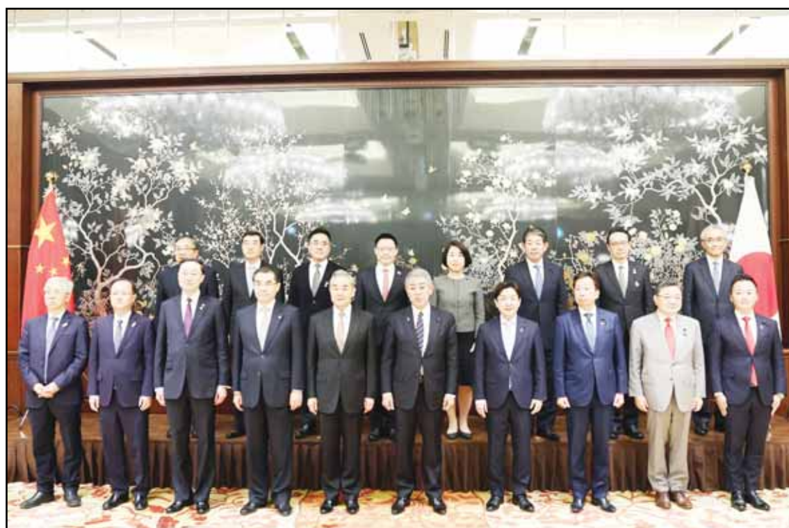
Chinese Foreign Minister Wang Yi, also a member of the Political Bureau of the Communist Party of China Central Committee, co-chaired the sixth China-Japan High-Level Economic Dialogue with Japanese Foreign Minister Takeshi Iwaya in Tokyo, Japan.

The two countries should uphold the tradition of promoting political relations through economic cooperation, expand dialogue and exchanges across all sectors to cultivate new growth driv-