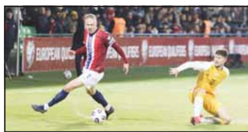
Norway's Erling Haaland controls the ball next to Moldova's Victor Mudrac during a Group I, World Cup qualifier soccer match between Moldova and Norway at the Zimbru stadium in Chisinau, Moldova.