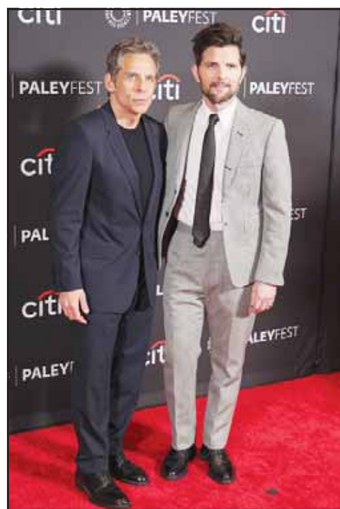
Ben Stiller, (left), and Adam Scott arrive at a screening of 'Severance' during PaleyFest, on March 21, at the Dolby Theatre in Los Angeles.

Stiller: I mean, it's constantly in process. That's what the process of making the show was on Season 1 and also on Season 2. And I don't know if I could explain the process, but it's very fluid, even though it's obviously a show that has a lot of specifics that we're always trying to think