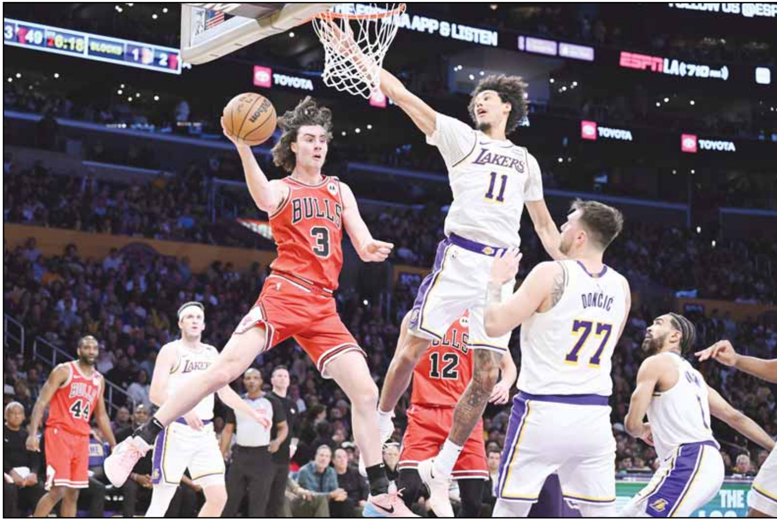
Chicago Bulls guard Josh Giddey (3) passes the ball in front of Los Angeles Lakers center Jaxson Hayes (11) and guard Luka Doncic (77) in the first half of an NBA basketball game in Los Angeles.