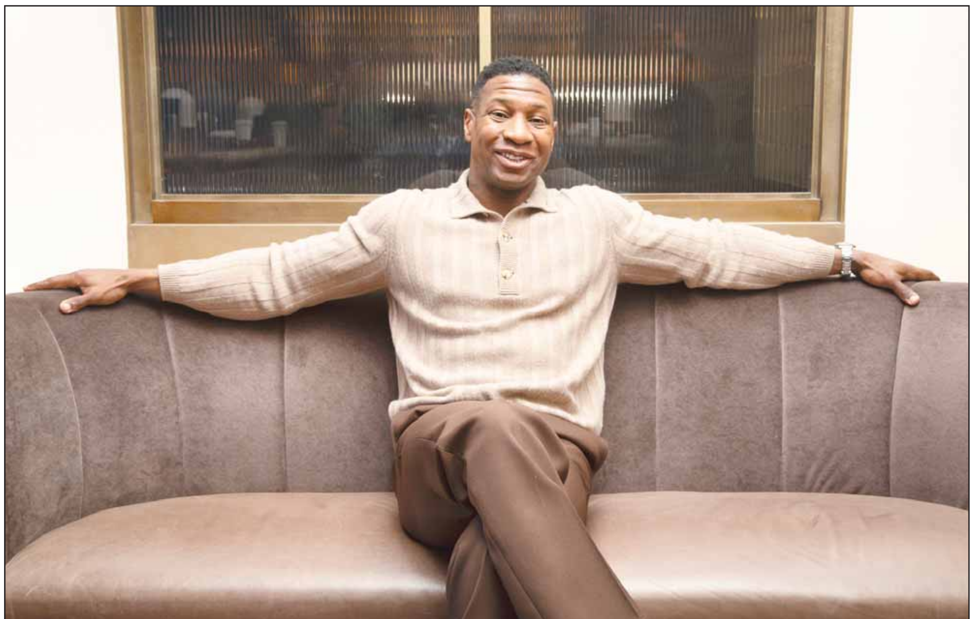
Jonathan Majors poses for a portrait on Wednesday, March 19, 2025, in New York.