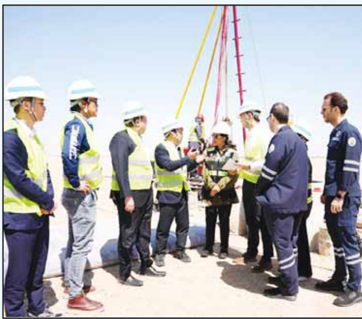
Minister of Public Works Dr. Noura Al-Mashaan visits the site of the project in Boubyan Island.

Kuwait rolls out new licensing amendments