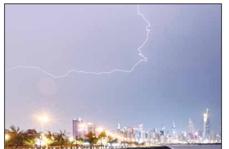
This photo taken on March 22, 2025 shows lightning over the skyline of Kuwait City.