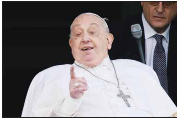
Pope Francis gestures as he appears at a window of the Agostino Gemelli Polyclinic in Rome, Sunday, March 23.

"I see this woman with the yellow flowers. Brava!" a tired and bloated-looking Francis said. He gave a weak sign of the cross before being wheeled back inside.