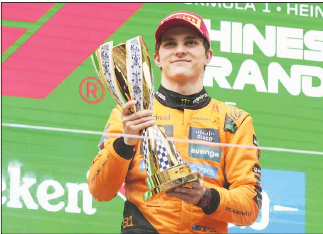
McLaren driver Oscar Piastri of Australia celebrates on the podium after winning the Chinese Formula One Grand Prix race at the Shanghai International Circuit, Shanghai.

"I'm (also) happy considering how bad my last few days have been and how much I struggled just to kind of get comfortable and understand how