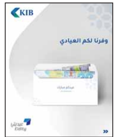
KIB launches Eidiya service nationwide for Eid Al-Fitr.

Al Wayel added: "Through this initiative, our valued customers can obtain Eidiya in all denominations, including KD 1, KD 5, KD 10, and KD 20. We are committed to providing this service to meet our customers' needs during this delightful occasion, enhancing their celebrations and making