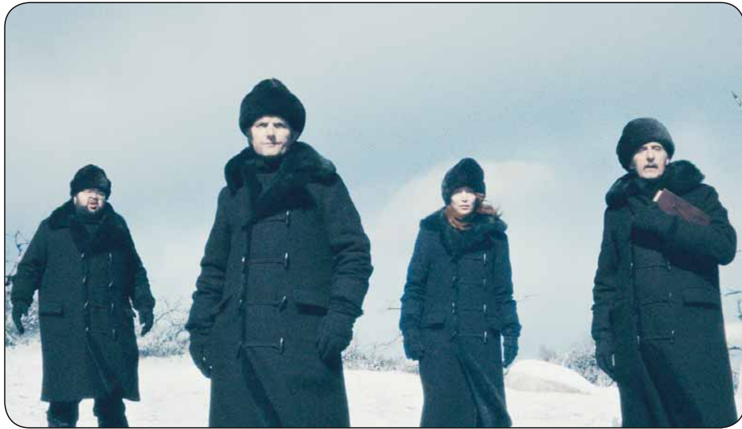
This image released by Apple TV+ shows Zach Cherry, (from left), Adam Scott, Britt Lower and John Turturro in a scene from 'Severance.'