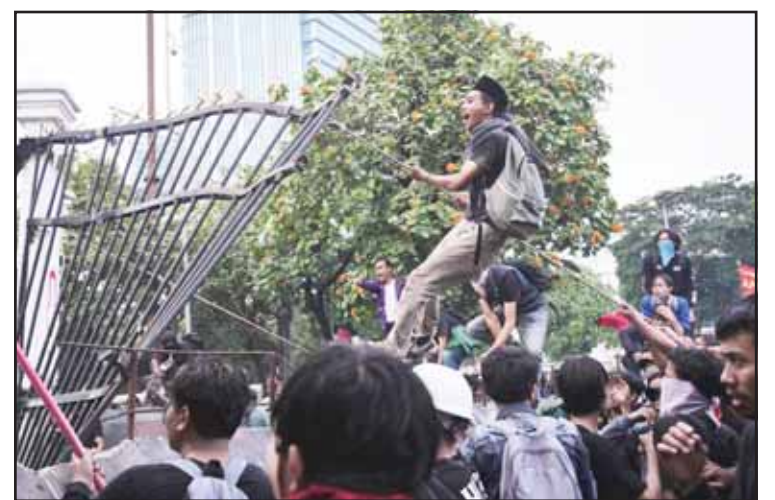
Protesters tear down the fence at parliament in Jakarta, Indonesia on March 20 during a rally against the passing of a controversial revision of a military law that will allow military officers to serve in more government posts without resigning from the armed forces.

Under current law, military personnel are permitted to serve in only 10 ministries and state institutions, in-