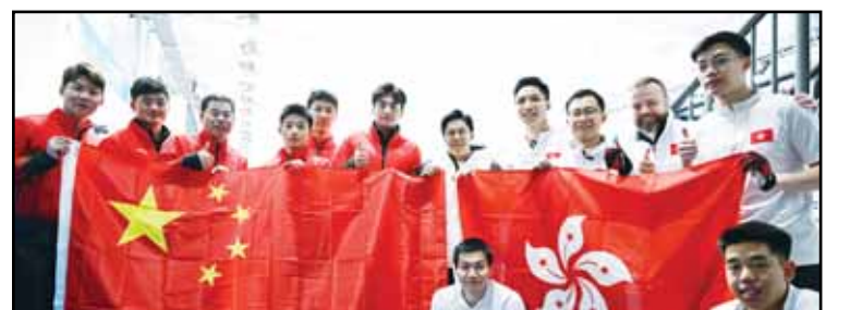
Team China and China's Hong Kong pose for photos after the Curling men's bronze medal match between China and China's Hong Kong at the 9th Asian Winter Games in Harbin, northeast China's Heilongjiang Province.

This win not only secured China a spot in the 2026 Winter Olympics but also marked their return to the World Championship podium after 14 years.