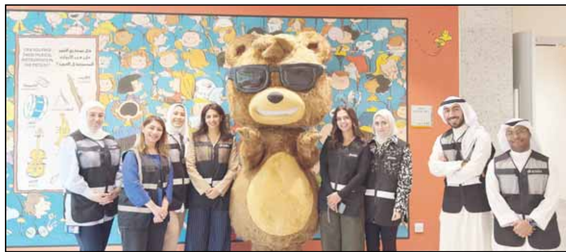
The Zain Al-Shuhoor volunteer team at Jaber Hospital.

Zain also continued its support for the annual Girgeaan celebrations at Al-Kharafi Special Needs Center and the Al-Tomoooh Sports Club for individuals with intellectual disabilities. Both events featured a variety of entertainment and cultural ac-