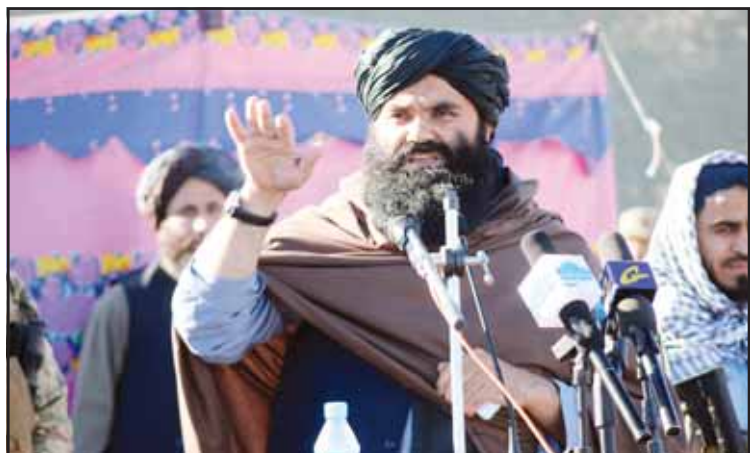
Acting interior minister Sirajuddin Haqqani, speaks during the funeral prayers of Khalil Haqqani, the minister for refugees and repatriation, during his funeral procession in eastern Paktia province, Afghanistan on Dec 12, 2024.

"The recent developments in Afghanistan-US relations are a good example of the pragmatic and realistic engagement between the two governments," said Jalaly. Another official, Shafi Azam, hailed the development as the beginning of normalization in 2025, citing the Taliban's announcement it was in control of Afghanistan's embassy in Norway.