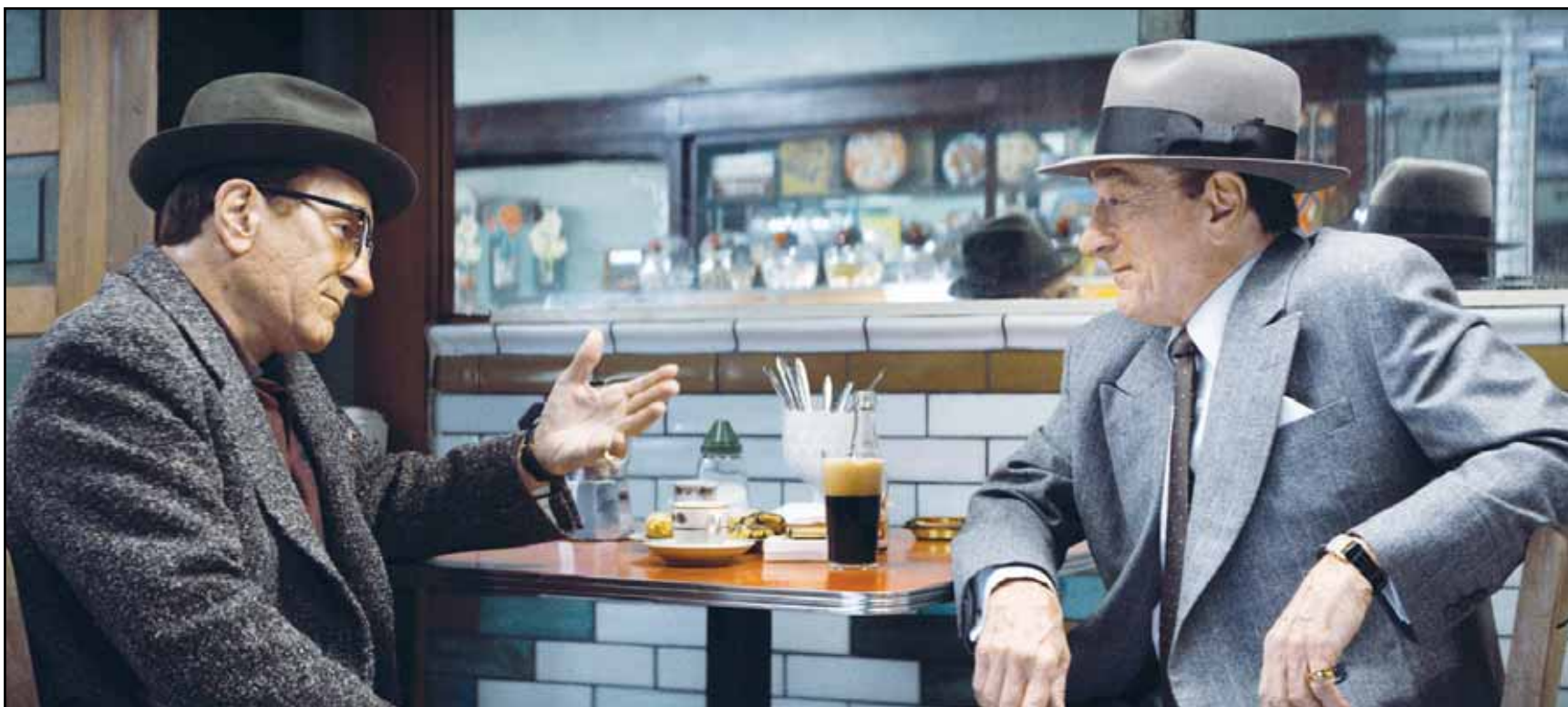
This image released by Warner Bros. Pictures shows Robert De Niro as Vito Genovese, (left), and Robert De Niro as Frank Costello in a scene from 'The Alto Knights.'