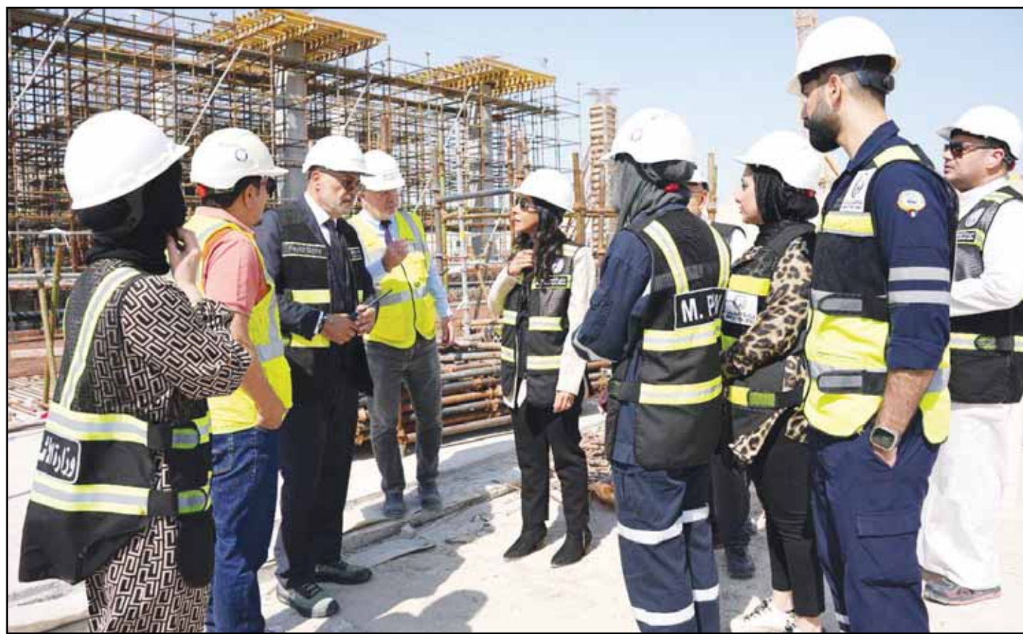
The Minister of Public Works inspects the new airport project 'T2'.