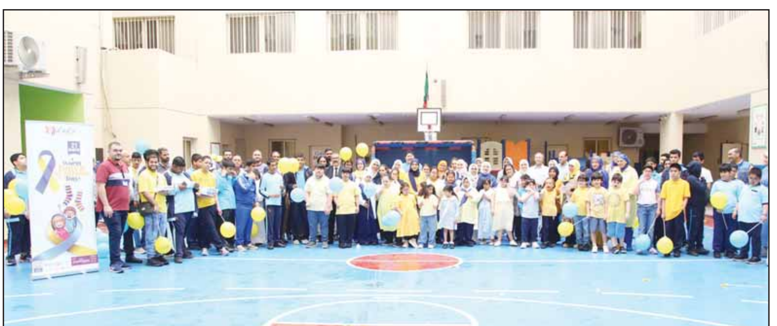
Lulu Hypermarket promotes inclusivity on World Down Syndrome Day.

Lulu Hypermarket remains committed to supporting social causes and fostering meaningful relationships within the community. Through such initiatives, the company continues to reinforce its dedication to social responsibility, inclusivity, and making a positive impact on society.