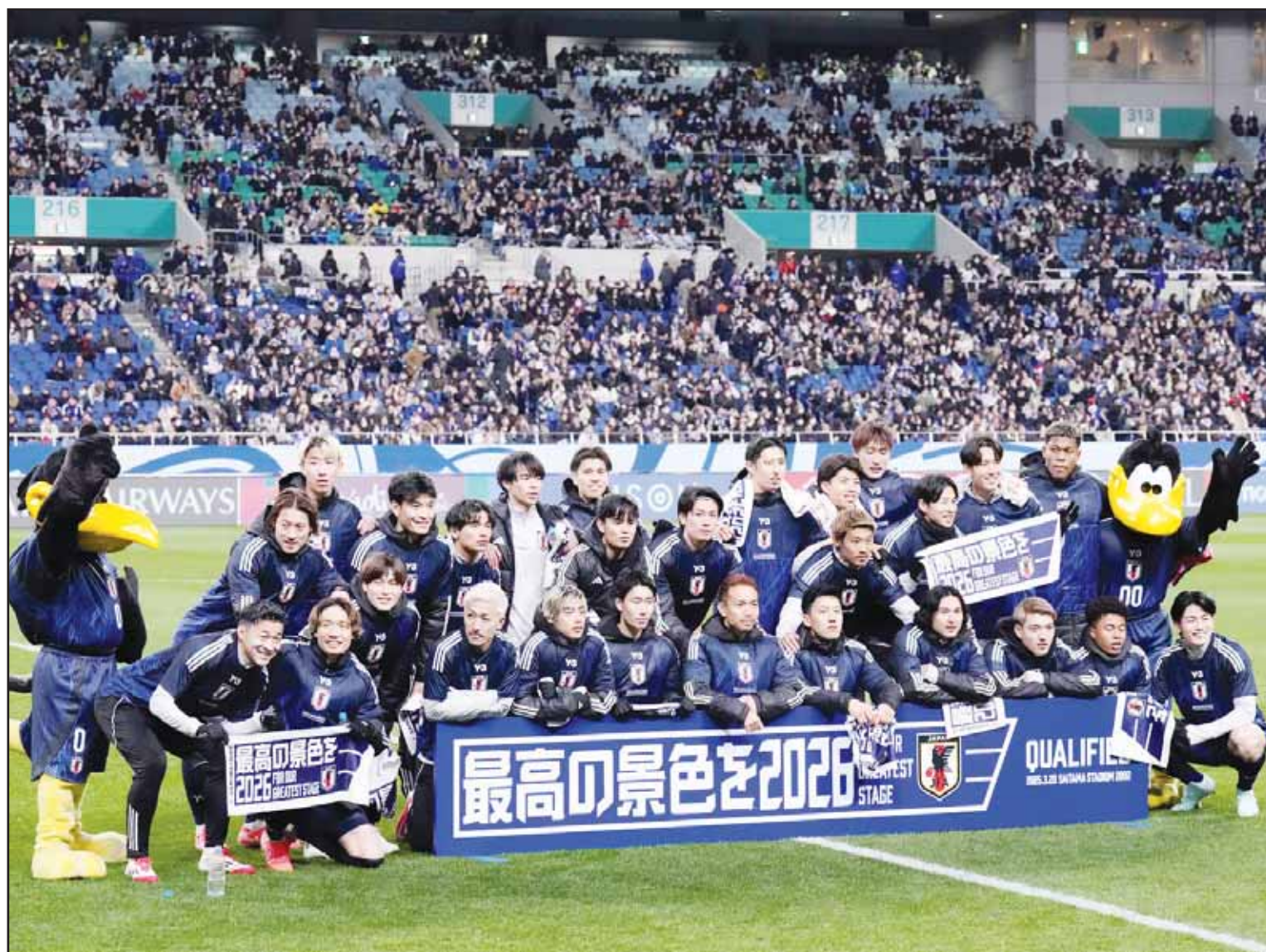
Japan players pose together as they celebrate after defeating Bahrain in the World Cup qualifying soccer match at Saitama Stadium in Saitama, Japan.