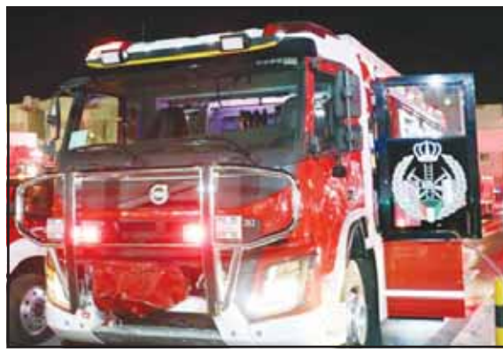
Fire brigade at the site.

Following this, the Mutlaa Police Station investigator ordered the case to be registered as misdemeanor under number 51/2025 and instructed detectives to arrest the culprits.