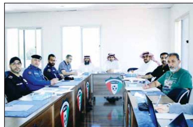
The coordination meeting in progress at the Kuwait Football Association headquarters.

The top two from each of the three six-team groups in the third round of Asian qualifying advance to the World Cup while the third- and fourth-placed teams advance to another stage to compete for two more places.