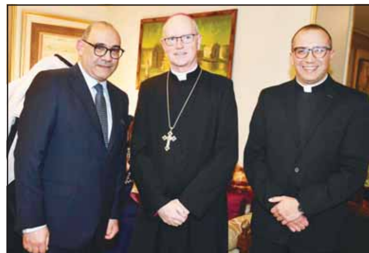
Iraqi ambassador and visitors from the church.