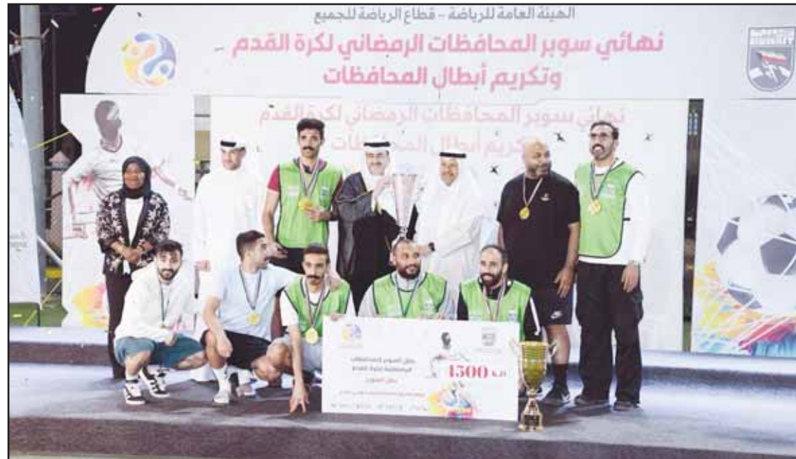
Farwaniya Governorate team crowned with the Super Cup.

KUWAIT CITY, March 20: The Public Authority for Youth Stadium in Mishref recently hosted the final of the Governorates Ramadan Super Cup football tournament, organized by the Sports for All Sector of the Public Authority for Sports.