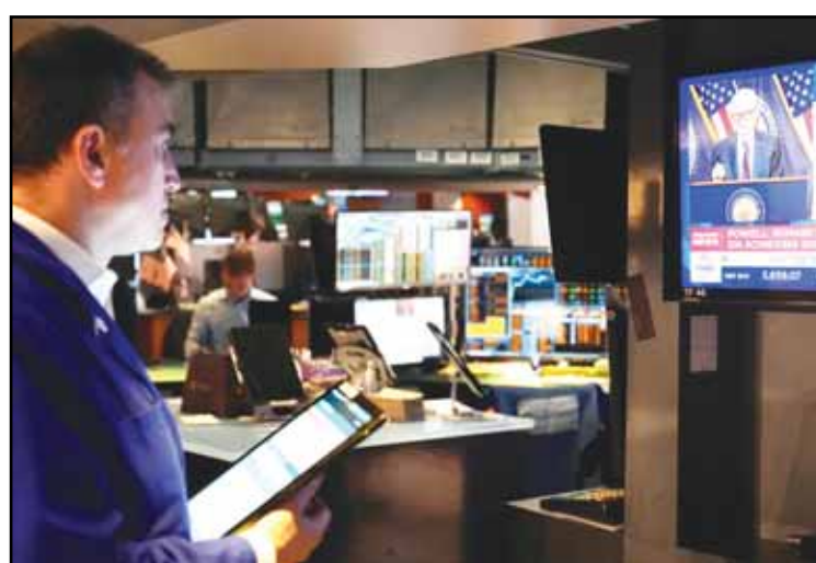
A news conference by Federal Reserve Chair Jerome Powell is displayed on the floor of the New York Stock Exchange in New York, Wednesday, March 19, 2025.