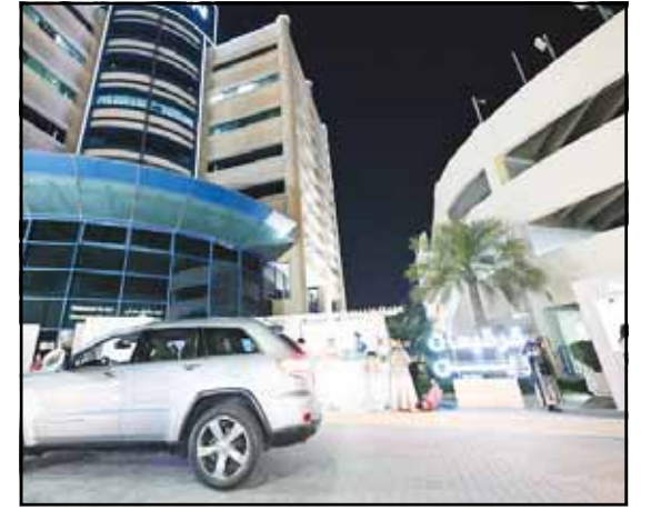
Zain's Girgeaan – an exceptional experience with a unique flavor.

Hundreds of vehicles visited Zain HQ in Shuwaikh to join the fun for third year running