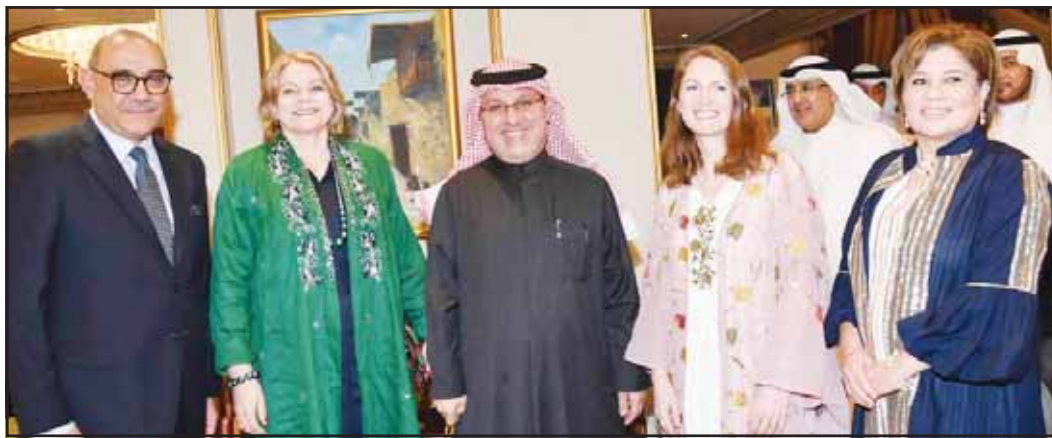
Iraqi ambassador receives UK, EU and Bahrain ambassadors.