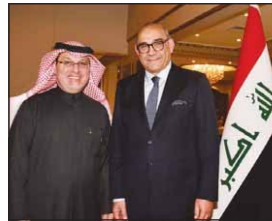
Iraqi ambassador and Bahraini ambassador to Kuwait.