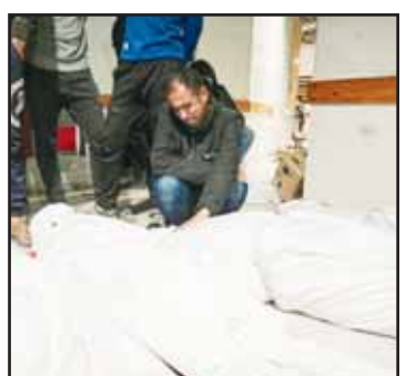
A man reacts over the bodies of victims of an Israeli army airstrike at Indonesia Hospital ahead of a mass funeral in Beit Lahia, northern Gaza Strip, Thursday, March 20, 2025.

bardment of civilians and called on the international community to take action against the Israeli occupation.