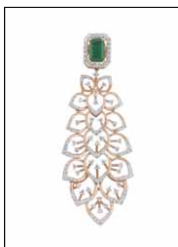
Kalyan Jewellers celebrates Akshaya Tritiya with exclusive offers.

without the concerns of price hikes while continuing to embrace the tradition of gold buying."