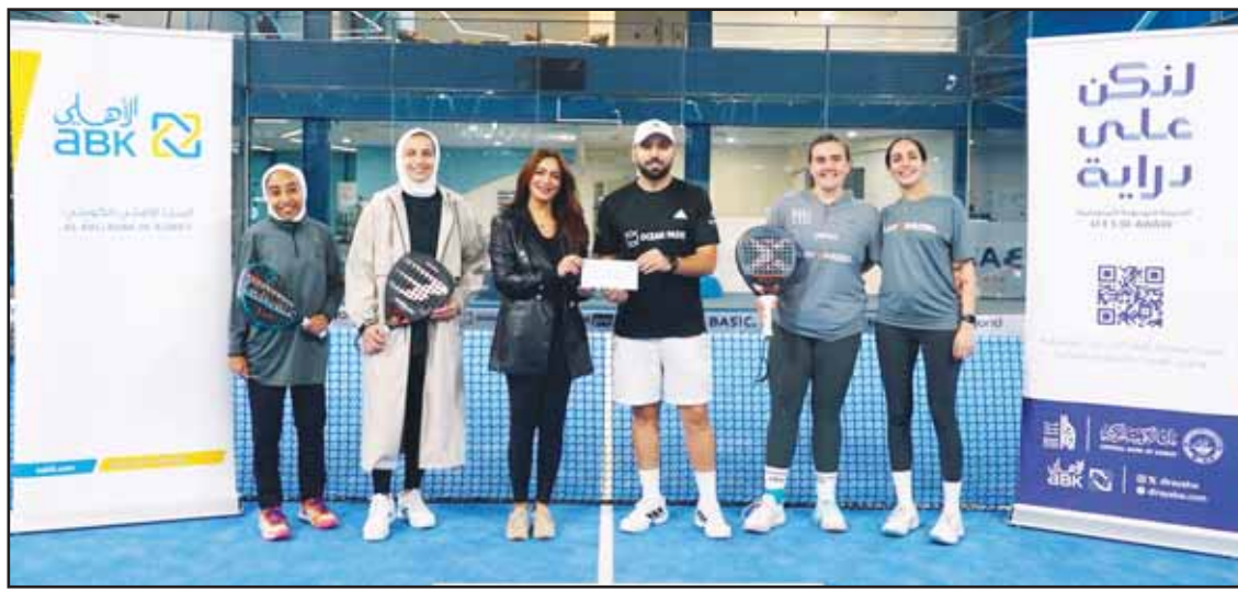
ABK hosts monthly padel tournaments to promote financial inclusion.

During these events, the Bank's team actively interacts