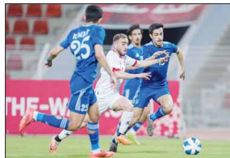
Players vying for the ball during Kuwait, Jordan game.

Now, Kuwait shifts focus to Lebanon, aiming for a crucial victory to keep its hopes alive in the tournament.