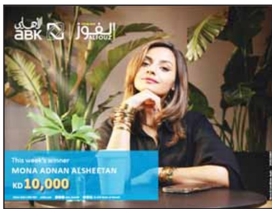
ABK's Alfouz account winner.

Open an Alfouz account today and enjoy increased opportunities to win the lifestyle you've been waiting for!