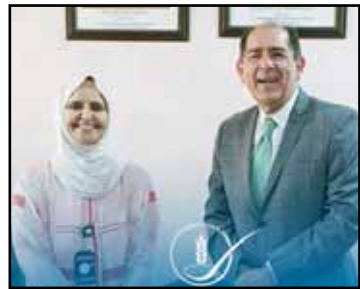
PAFN Chair and Director General with the Ambassador of Peru to Kuwait.