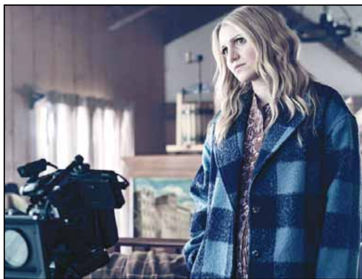
This image released by Paramount+ shows Anneleigh Ashford in a scene from the series 'Happy Face.'