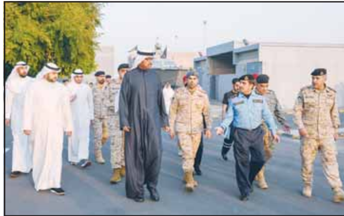
Minister of Defense Sheikh Abdullah Ali Abdullah Al-Sabah conducts a tour of the base.