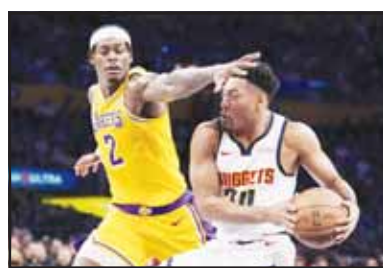
Denver Nuggets guard Jalen Pickett, right, tries to shoot as Los Angeles Lakers forward Jarred Vanderbilt reaches in during the second half of an NBA basketball game in Los Angeles. Lakers won 120-108. - See Page 15