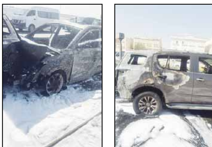
The two vehicles involved in the collision on the Sixth Ring Road.

Previously, sources from the institution had informed that the increase in retirement applications had placed huge pressure on employees, leading to delays in the disbursement of retirees' pensions. It had implemented several measures at the time to ease the pressure on employees and accelerate the processing of retirement applications. This included allocating additional teams working on a shift system to speed up the completion of retirement transactions and reduce the waiting period for retirees to receive their pensions.