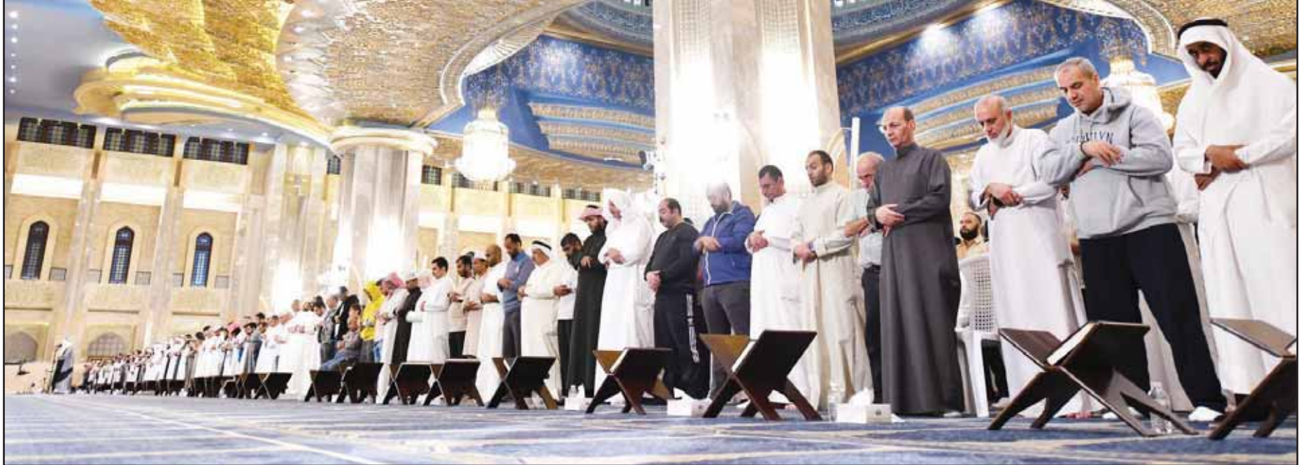
Devout worshippers gather at the Grand Mosque for Qiyam prayers on Wednesday night, seeking blessings in Ramadan's sacred nights.