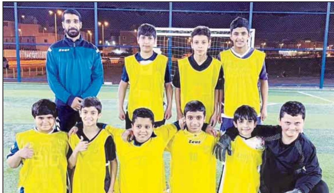
One of the championship teams.

KUWAIT CITY, March 20: The fourth edition of the Sabah Al-Ahmad Football Association Ramadan Tournament for adults and juniors is in full swing, with the first two days of competition concluding at Sabah Al-Ahmad Stadium. A total of 35 teams are participating in this year's tournament, delivering exciting performances.