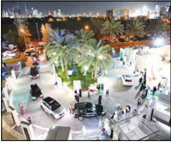
Hundreds of cars flocked to Zain's headquarters to celebrate.