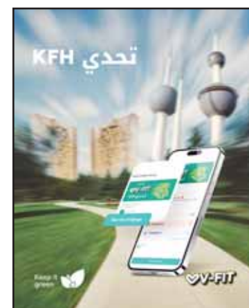
V-Fit virtual walking challenge.

He explained that participants in the competition can earn credits and purchase value within the V-Thru app for every 2,000 steps, promoting exercise and supporting Kuwaiti businesses featured in the app.