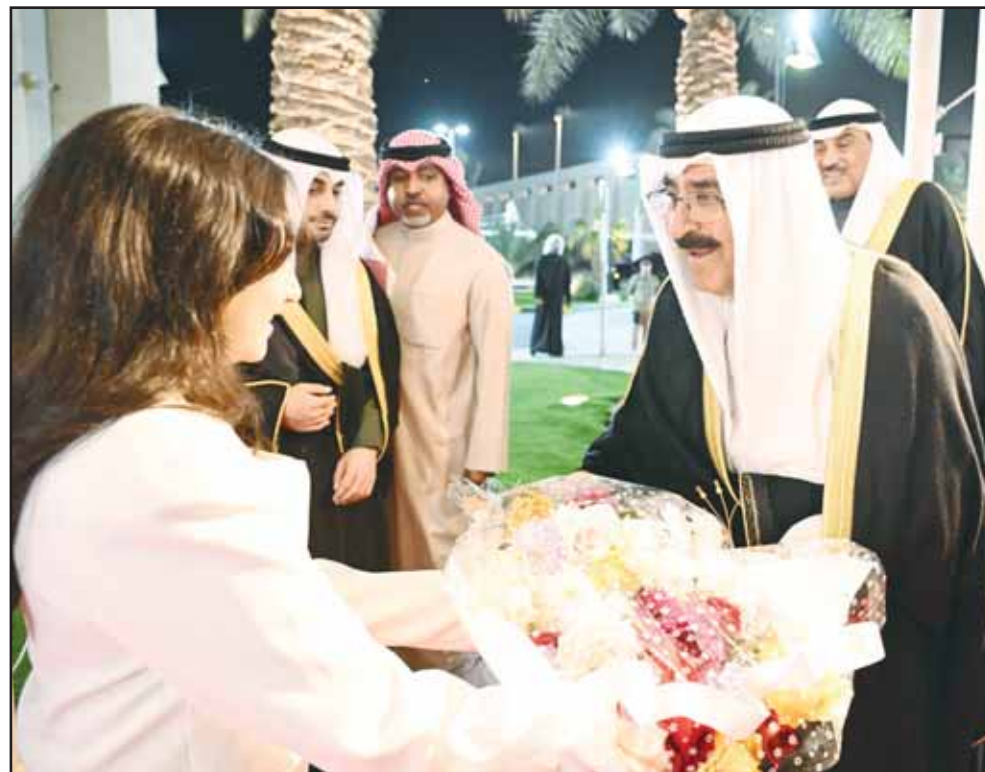
His Highness the Amir, accompanied by His Highness the Crown Prince and Acting Prime Minister, visits the Kuwait Sport Club for Deaf (KSCD).