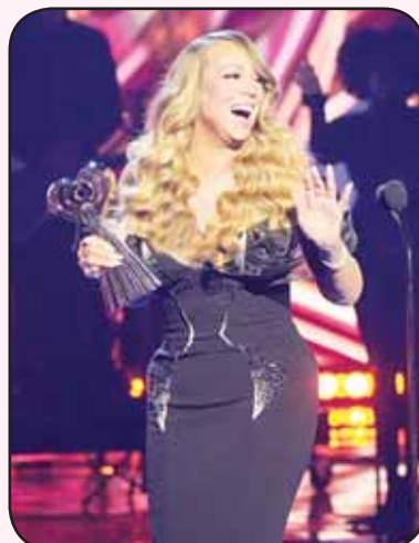
Mariah Carey accepts the icon award during the iHeartRadio Music Awards.