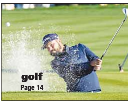
golf Page 14