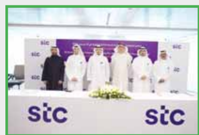
9 stc General Assembly for year ended Dec 31 2024 approves cash dividend of 35 Kuwaiti fils per share