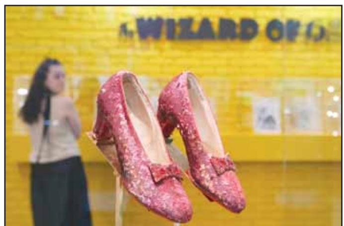
The original ruby slippers worn by Judy Garland in the classic 1939 film The Wizard of Oz are displayed in London ahead of being offered for auction on Dec. 7, at Heritage Auctions in the US, Nov. 27, 2024.