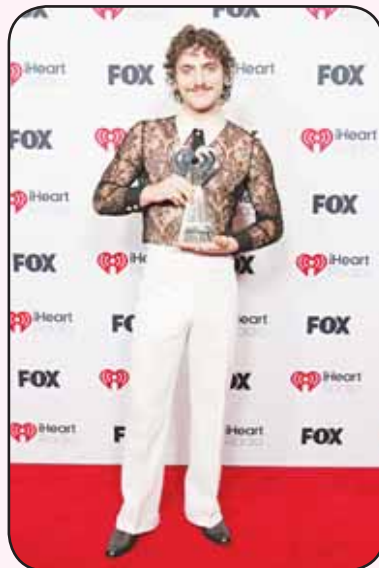
Benson Boone, winner of the award for song of the year for "Beautiful Things," poses in the press room during the iHeartRadio Music Awards.