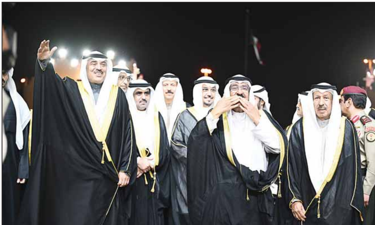
His Highness the Amir, accompanied by His Highness the Crown Prince and Acting Prime Minister, visits the Diwaniya of Nabat Poets.