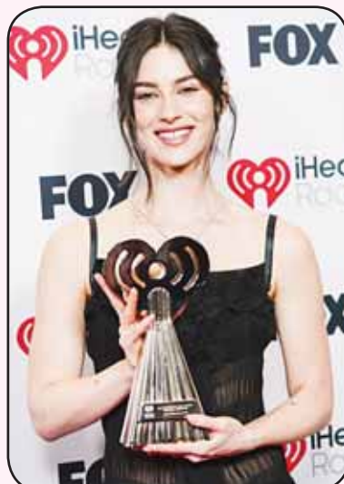
Gracie Abrams, winner of the award for breakthrough artist of the year, poses in the press room.