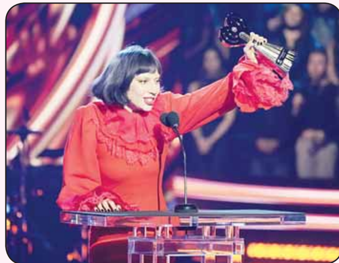
Lady Gaga accepts the innovator award during the iHeartRadio Music Awards, March 17, at the Dolby Theatre in Los Angeles.