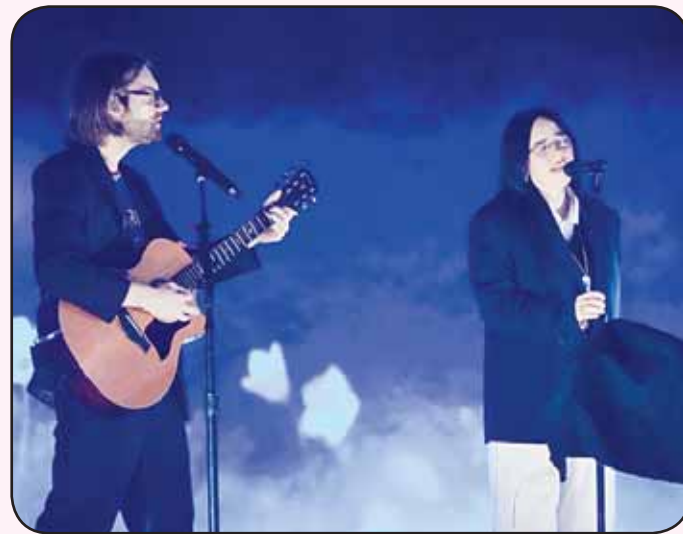
FINNEAS, (left), and Billie Eilish perform during the iHeartRadio Music Awards, on Monday, March 17, at the Dolby Theatre in Los Angeles.