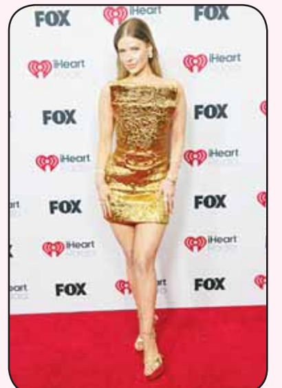
Ariana Madix arrives at the iHeartRadio Music Awards, March 17.