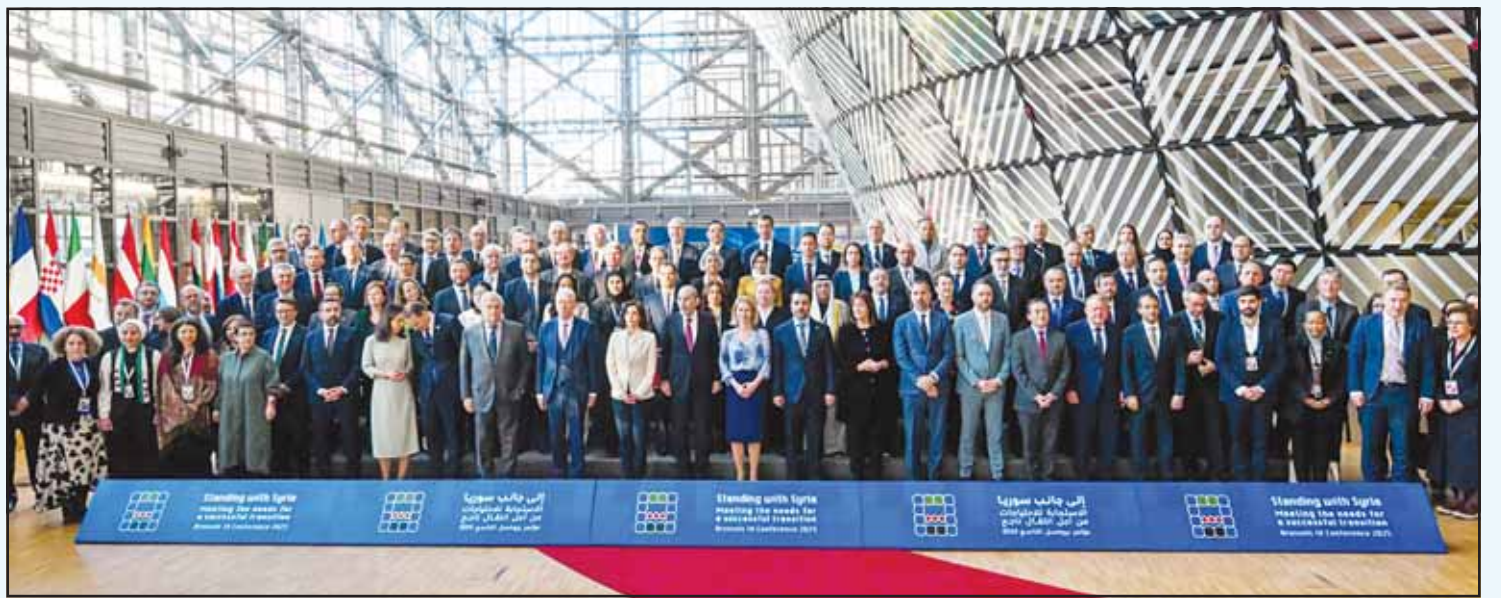
Brussels 9th Conference 2025

international pledges and fulfilling them by more than 90 percent. He stressed that Kuwait is keen on respecting the sovereignty, independence and territorial integrity of Syria, and rejecting foreign interference in its internal affairs. Al-Enezi pointed out that since the fall of the former regime in Syria, Kuwait sent an air bridge loaded with tons of aid and medical relief needed to secure supplies for the Syrian people, and will continue to stand by and support them. He thanked the EU for convening this meeting, which confirms the Union's keenness to providing appropriate conditions to Syria.