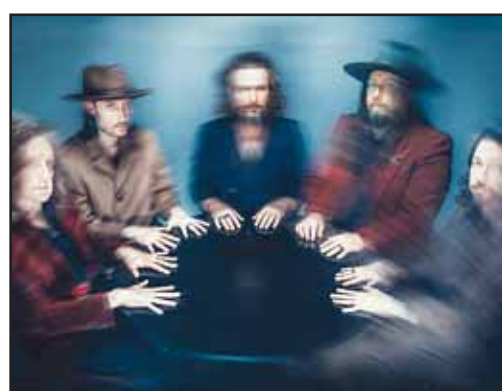
This album cover image released by ATO Records shows 'is' by My Morning Jacket.