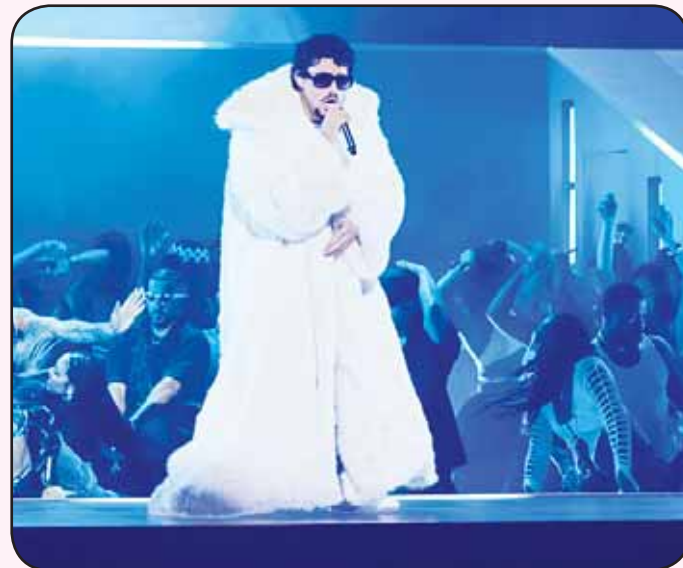
Bad Bunny performs during the iHeartRadio Music Awards, on March 17, at the Dolby Theatre in Los Angeles.