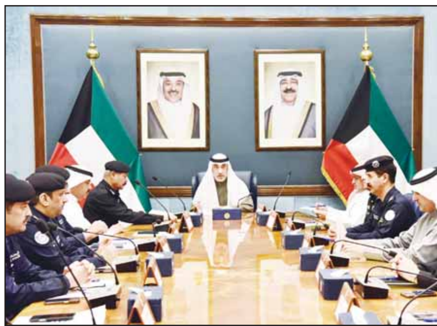
Acting Prime Minister chairs a meeting with Assistant Undersecretaries of the Ministry of Interior to review security preparations for the last ten days of Ramadan and Eid Al-Fitr.