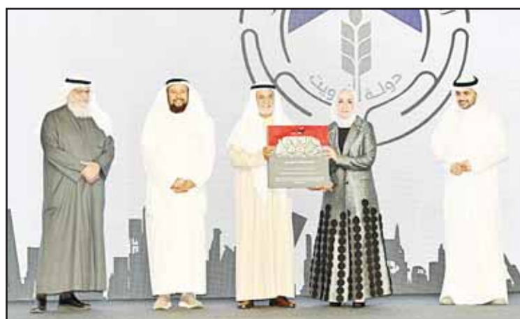
Among the honored organizations.

crises and wars. "It also strengthens bonds between Kuwait's leadership, government and people; and our people in Palestine and the Gaza Strip."