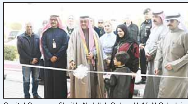
Capital Governor Sheikh Abdullah Salem Al-Ali Al-Sabah inaugurates the awareness day exhibition.