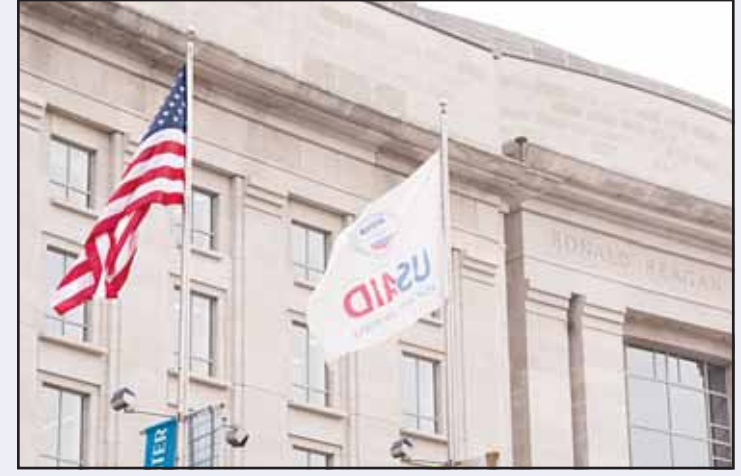
The flag of the United States Agency for International Development, or USAID, right, flies alongside the American flag in front the USAID office in Washington on Feb 3.

Showing the extraordinary power of Musk and his budget-slashing Department of Government Efficiency, thousands of USAID employees have been laid off and programs shut down around the world in the two weeks since