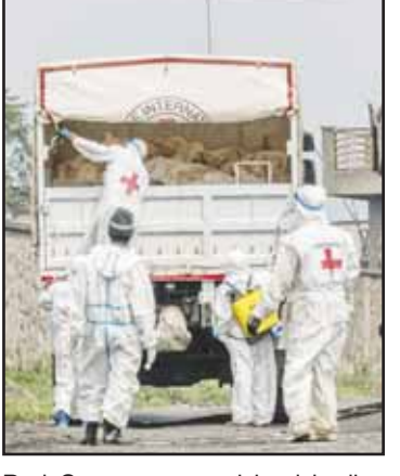
Red Cross personnel load bodies of victims of the fighting between Congolese government forces and M23 rebels in a truck in Goma. Democratic Republic of Congo on Feb 3 as the UN health agency said 900 died in the fight.

But the rebels said Monday they did not intend to seize Bukavu, though they earlier expressed ambition to