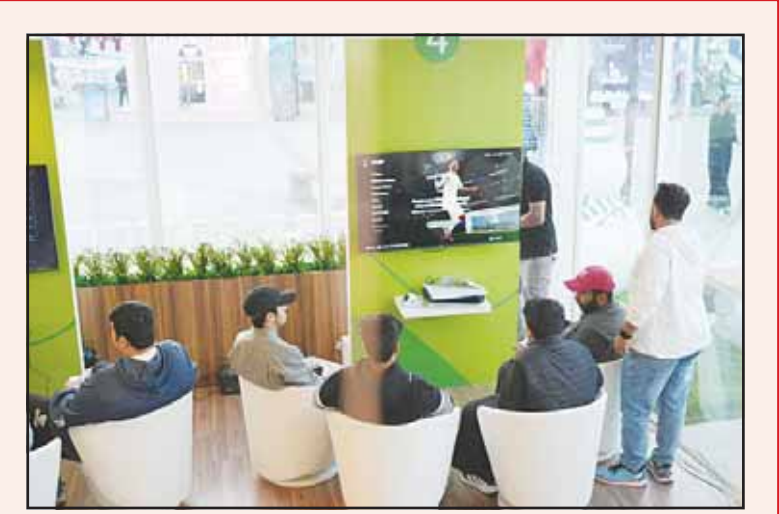
FC 2025 PlayStation tournament for Hesabi customers in progress.

Event in collaboration with Kuwait Esports Committee