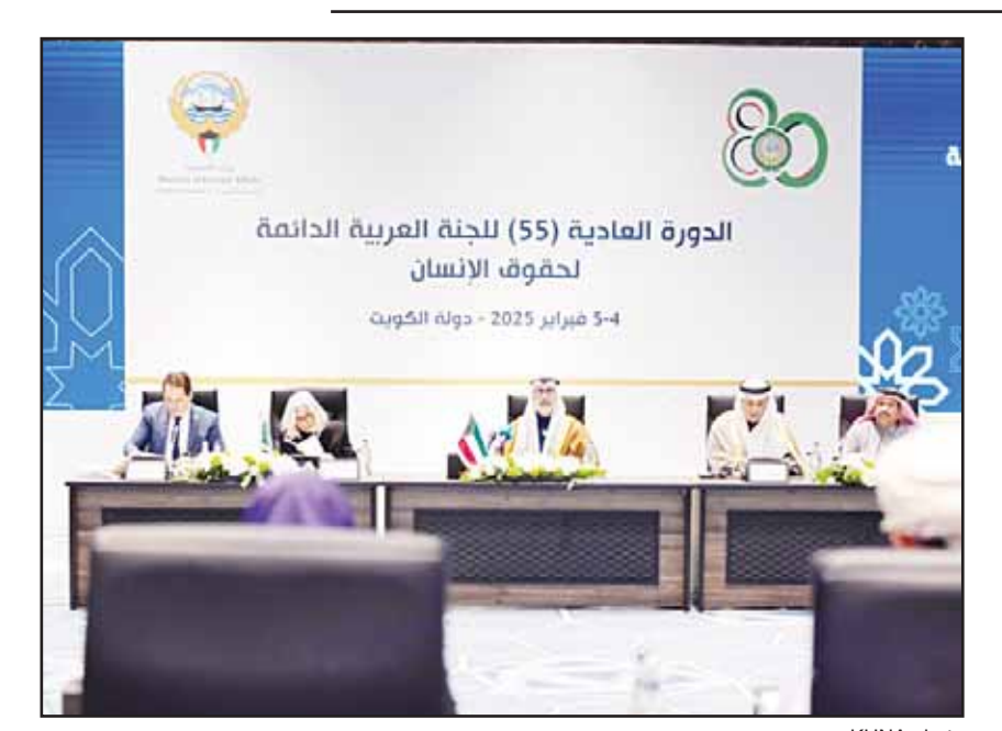
Deputy Foreign Minister Ambassador Sheikh Jarrah Jaber Al-Ahmad Al-Sabah speaking at the 55th regular session of the Permanent Arab Committee for Human