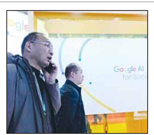
cial Intelligence at a supply chain expo in Beijing, Wednesday, Nov. 27, 2024.

The impact on U.S. exports may be limited. Though the U.S. is the biggest exporter of liquid natural gas globally, it does not export much to China. In 2023, the U.S. exported 173,247 million cubic feet of LNG to China, representing about