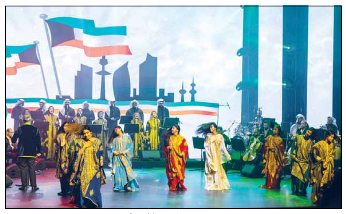
Part of the opening ceremony

COPOUS convenes on an annual basis in a bid to further its mission of promoting and monitoring international cooperation on the peaceful use of outer space.