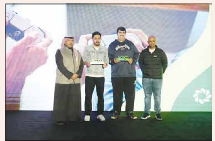
The second place team honored.