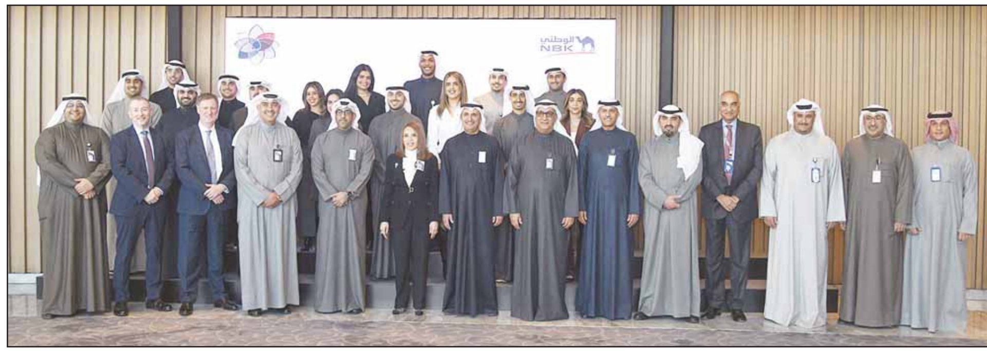
The Bank's Executive Management during the closing ceremony of the Moody's Credit Certificate Program.

Approximately 55 trainees participated in the program, divided into three groups at intermediate and advanced levels. Participants represented various departments across the bank, including the Consumer Banking Group, Risk Management Group, Private Banking Group, Corporate Banking Group, International