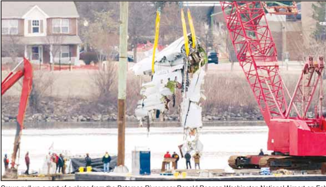
Crews pull up a part of a plane from the Potomac River near Ronald Reagan Washington National Airport on Feb 3 in Arlington, Va.

Conservative Republicans have long sought to roll back USAID's status as an independent agency, while Democrats traditionally back its status as an independent agency. President John F. Kennedy created USAID in 1961 at the height of the United States' Cold War struggle with the Soviet Union, seeking a more efficient way to counter Soviet influence abroad through foreign assistance, and viewing the State Department as frustratingly bureaucratic at that.