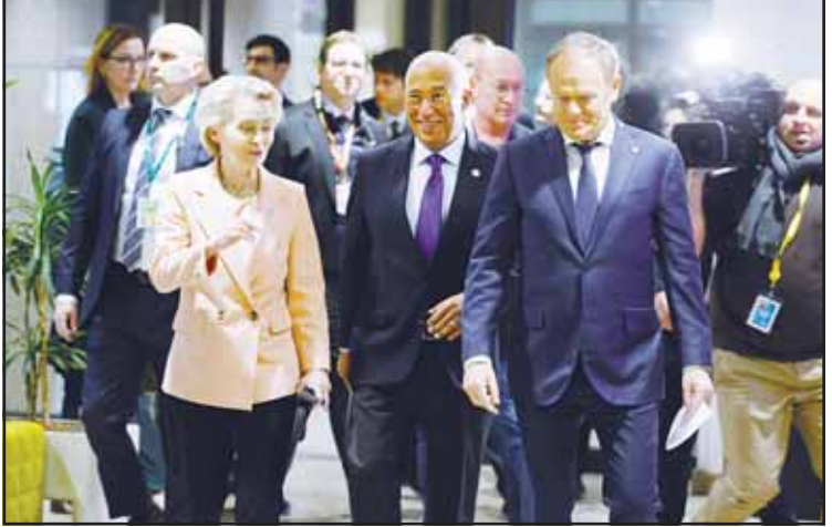
European Commission President Ursula von der Leyen, (left), European Council President Antonio Costa, (center), and Poland's Prime Minister Donald Tusk arrive at the European Council building after an EU summit in Brussels on Feb 3.

and the United States might end up in a "conflict among allies," said Polish Prime Minister Donald Tusk, whose