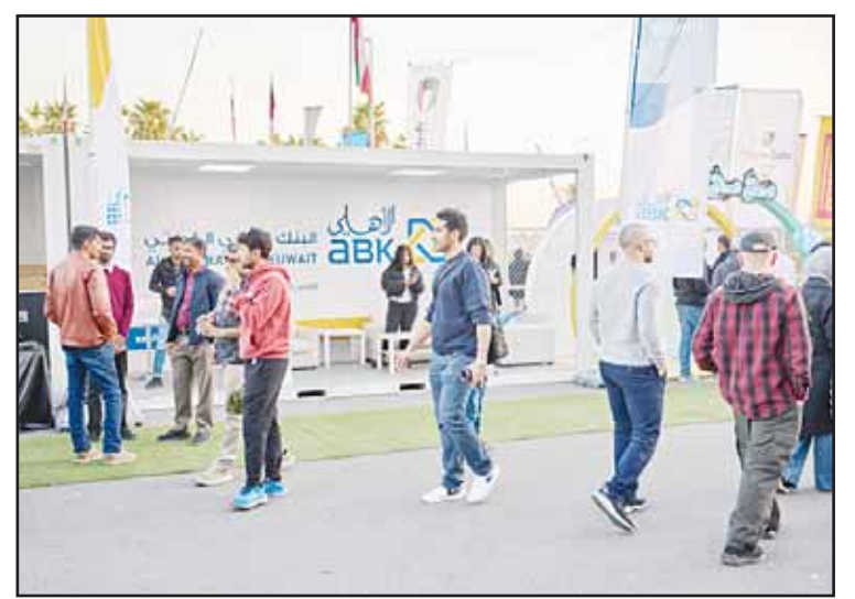
Crowd at ABK stand at event

For more information about ABK, please follow the Bank's Instagram account @abk_kuwait, visit eahli.com, contact Ahlan Ahli 1 899 899 or visit one of the Bank's branches across Kuwait.