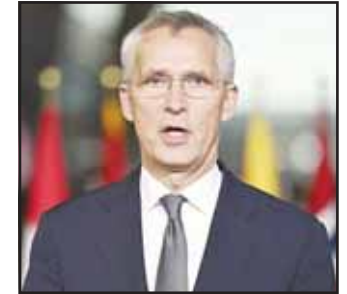
NATO Secretary General Jens Stoltenberg makes statements during a transition ceremony at NATO headquarters in Brussels, Belgium on Oct 1, 2024.

That left current Prime Minister Jonas Gahr Støre, the leader of Stoltenberg's center-left Labor Party, with several Cabinet posts