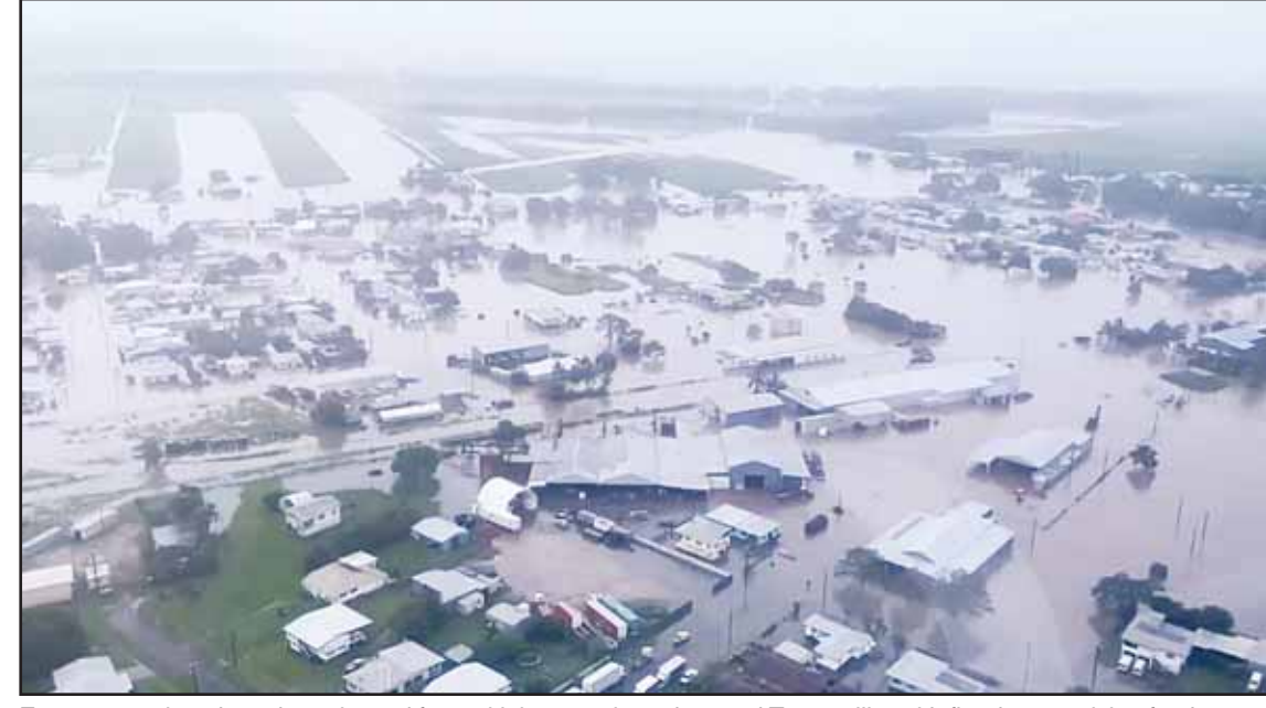
Emergency alerts have been issued for multiple areas in and around Townsville, with floodwaters rising for the past three days. Queensland's Premier David Crisafulli has said more flooding is likely.

All those aboard the Philippine air force NC-212i turbo-prop transport plane were unharmed, the Philippine military said.