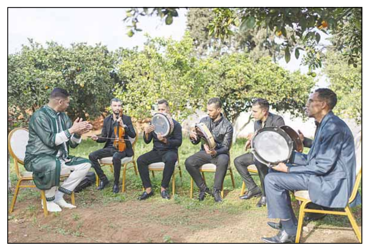
A music band prepares for a traditional performance known as Aita, in Sidi Yahya Zaer, south of the capital Rabat. Morocco, Monday, Jan. 27, 2025.