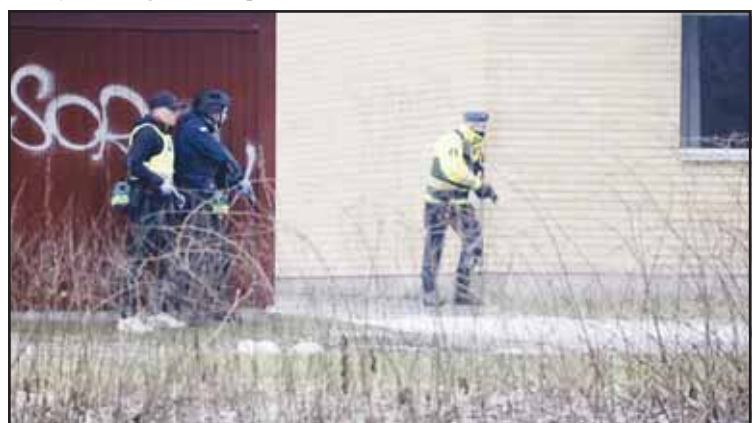
Police at the scene of an incident at Risbergska School, in Örebro, Sweden on Feb 5.

school were evacuated following the shooting. "The reports of violence in Orebro are very serious. The police are on site and the operation is in full swing," Justice Minister Gunnar Strömmer told TT.