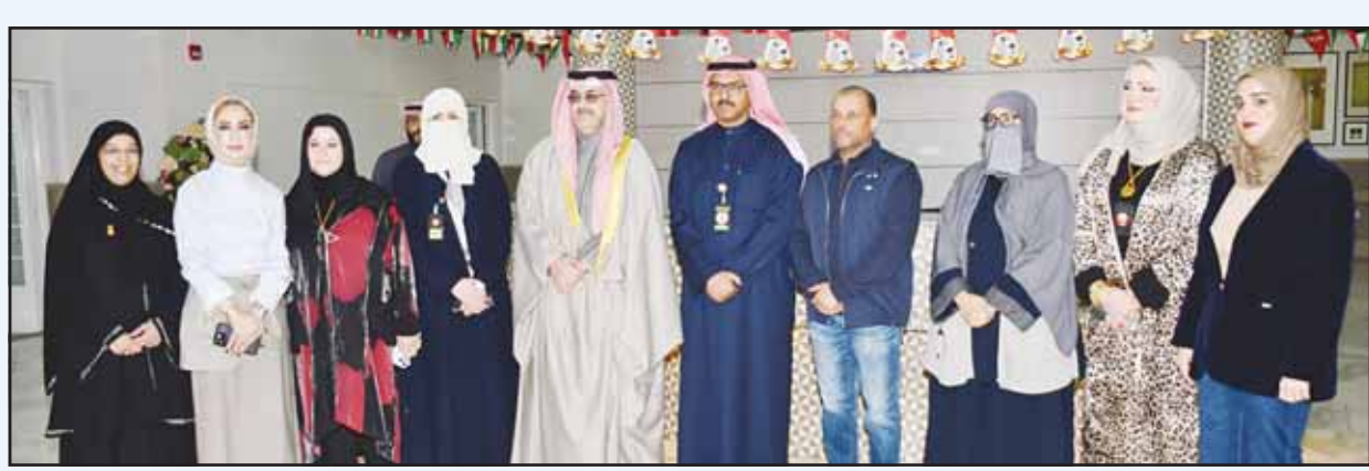
Group photo with the Governor of the Capital, Sheikh Abdullah Salem Al-Ali Al-Sabah.