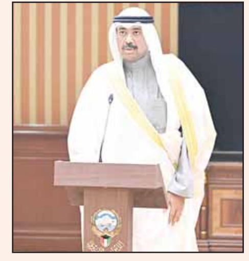
Newly-appointed Defense Minister Sheikh Abdullah Al-Salem Al-Sabah takes the constitutional oath before His High-