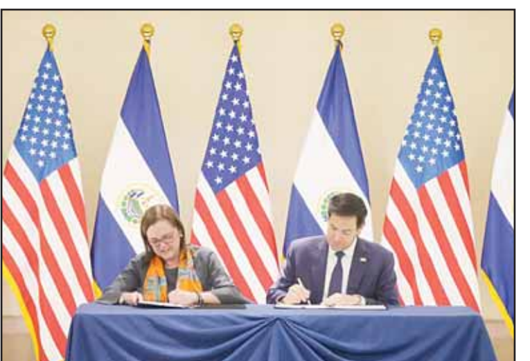
US Secretary of State Marco Rubio, (right), and El Salvador's Foreign Minister Alexandra Hill Tinoco sign a memorandum of understanding regarding civil nuclear cooperation between their countries at the Intercontinental Real Hotel in San Salvador, El Salvador on Feb 3.

inadequate or nonexistent. Rubio arrived in San Salvador shortly after watching a US-funded deportation flight with 43 migrants leave from Panama for Colombia. That came a day after Rubio delivered a warning to Panama that unless the government