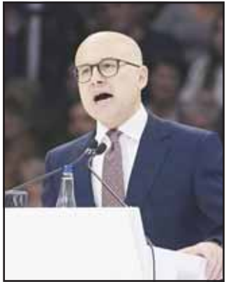
Outgoing Serbian Prime Minister Milos Vucovic speaks during a pre-election rally of his ruling Serbian Progressive Party in Belgrade, Serbia on Dec 2, 2023. (AP)

BELGRADE, Serbia, Jan 28, (AP): Serbia's populist Prime Minister Milos Vucovic resigned Tuesday in an attempt to calm political tensions following weeks of massive anti-corruption protests over the deadly collapse of a concrete canopy. The canopy collapse in November, which killed 15 people in the northern city of Novi Sad, has become a flashpoint reflecting wider discontent with the increasingly autocratic rule of Serbia's populist President Aleksandar Vucic. He has faced accusations of curbing democratic freedoms in Serbia despite formally seeking European Union membership for the troubled Balkan nation. "It is my appeal for everyone to calm down the passions and return to dialogue," Vucovic told a news conference announcing his resignation. Novi Sad Mayor Milan Djuric also will step down on Tuesday, Vucovic said. Vucovic's resignation could lead to an early parliamentary election. The resignation must be confirmed by Serbia's parliament, which has 30 days to choose a new government or call a snap election. Pro-government media said President Vucic will attend a Cabinet session on Tuesday evening to