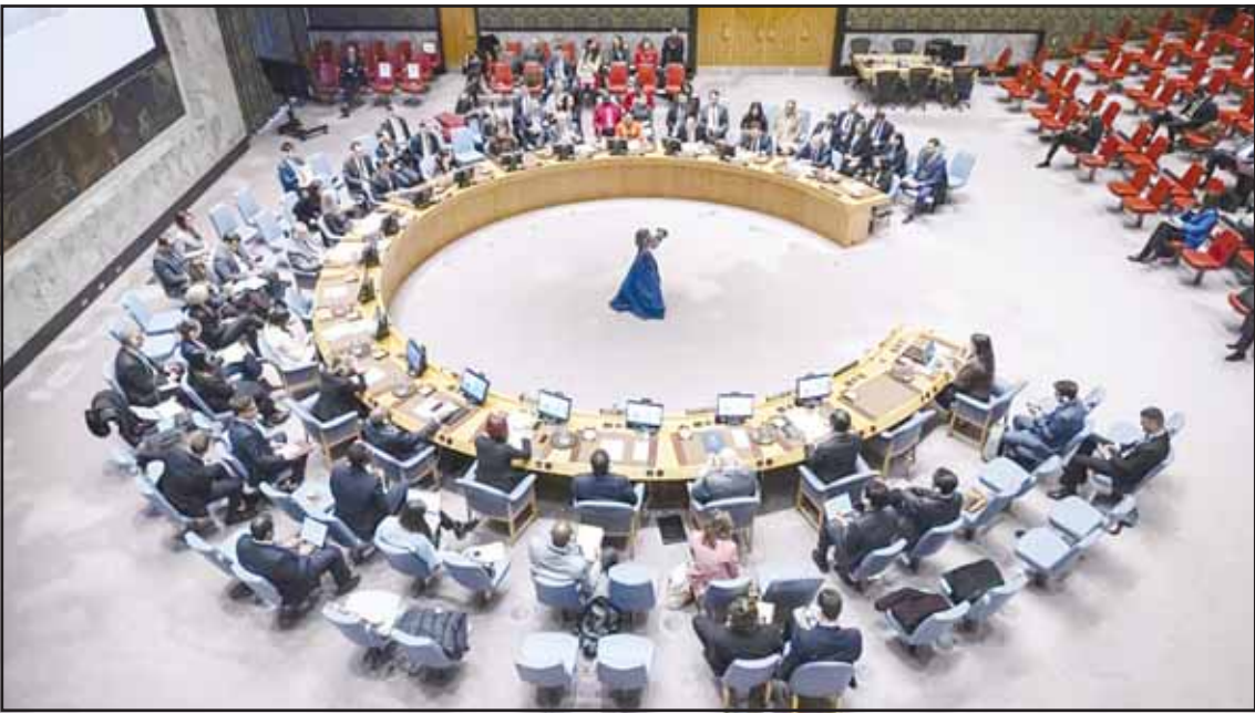
A general view shows a Security Council meeting at the United Nations headquarters on Jan 17.