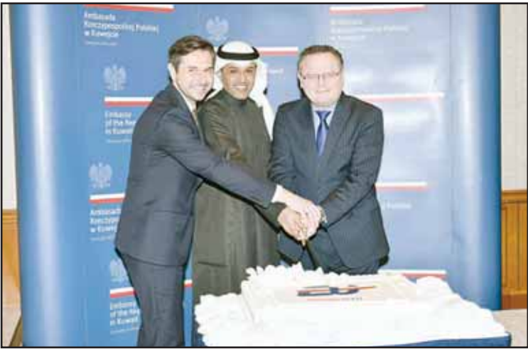
A ceremonial cake being cut at the Poland Travel Roadshow.