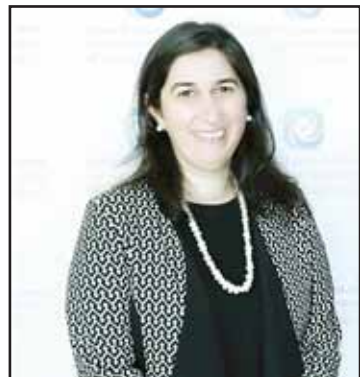
Dr. Ebba Al Ozairi

Obesity is a global health challenge that requires comprehensive guidelines to address its impact. Dr. Ebba Al Ozairi commented that clinical obesity can severely damage organs and lead to life-threatening complications (eg, heart attack, stroke, and renal failure). Preclinical obesity is a state of excess fat storage with a maintained tissue and organ functions, but an increased risk of developing clinical obesity and other non-communicable diseases (eg, type 2 diabetes, cardiovascular disease, or cancer). To diagnose clinical obesity, healthcare professionals should look for one or both of the following: reduced organ function and/or the inability of a person to carry out daily tasks due to excess fat.