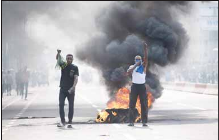
People protest in Kinshasa, Democratic Republic of the Congo on Jan 28, against the Rwanda-backed M23 rebels' advances into eastern Congo's capital Goma.