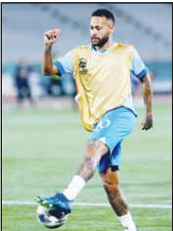
In this file photo, Al Hilal's Neymar shoots the ball during warm up for the AFC Champions League soccer match against Iran's Nassaji at the Azadi Stadium in Tehran, Iran.

Neymar returned in October and had his most recent appearance for the Saudi club in November. The Brazilian said in different interviews there were doubts about whether