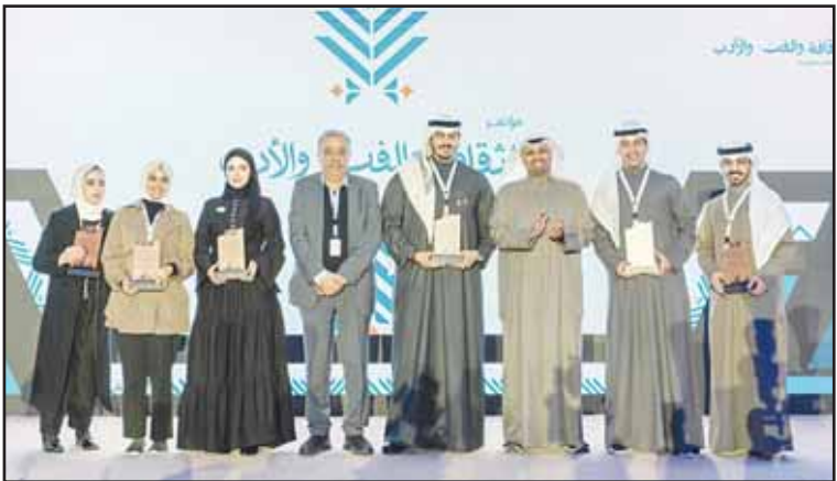
Kuwaiti delegation being honored during the three-day Culture, Art, and Literature Conference.