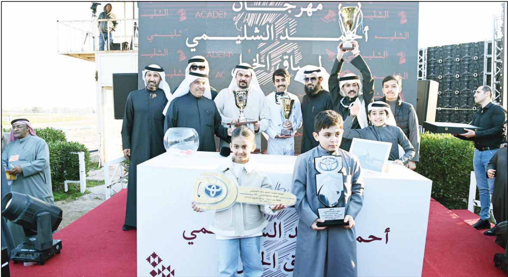
Sheikh Sabah Al-Nasser crowns the winners.