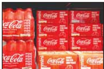
Cleared cases of soft drinks sit on a shelf in a supermarket in Antwerp, Belgium, after Coca-Cola recalled some of its soft drinks in Europe, Tuesday, Jan. 28, 2025. (AP)

Chlorate comes from chlorine disinfectants which are used in the treatment of water used for food processing. The chemical has been linked to potentially serious health problems, notably among children by interfering