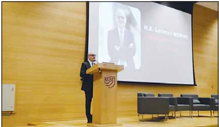
The Italian envoy Lorenzo Morini addressing the event.

weight of school bag were taken without any additional cost; as the approved budget for printing school books was adhered to, based on the commitment to achieve balance between providing education at the required level and preserving the State's financial resources. It stressed that this trend reflects its deep commitment to protect the health of students and guarantee their safety from the effects of carrying weights exceeding the recommended capacity for different age groups in schools. It explained that this step aims to ensure the provision of an educational environment; which meets the needs of students, and supports their educational and health development.