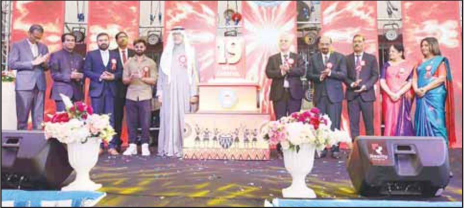
A photo of distinguished dignitaries and ICSK officials at the event.