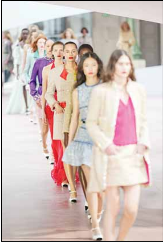
Models wear creations as part of the Chanel Haute Couture Spring Summer 2025 collection, in Paris, Tuesday, Jan. 28, 2025.

Daniel Roseberry's Icarus reimagined traditional couture codes with a provocative edge. Inspired by vintage ribbons,