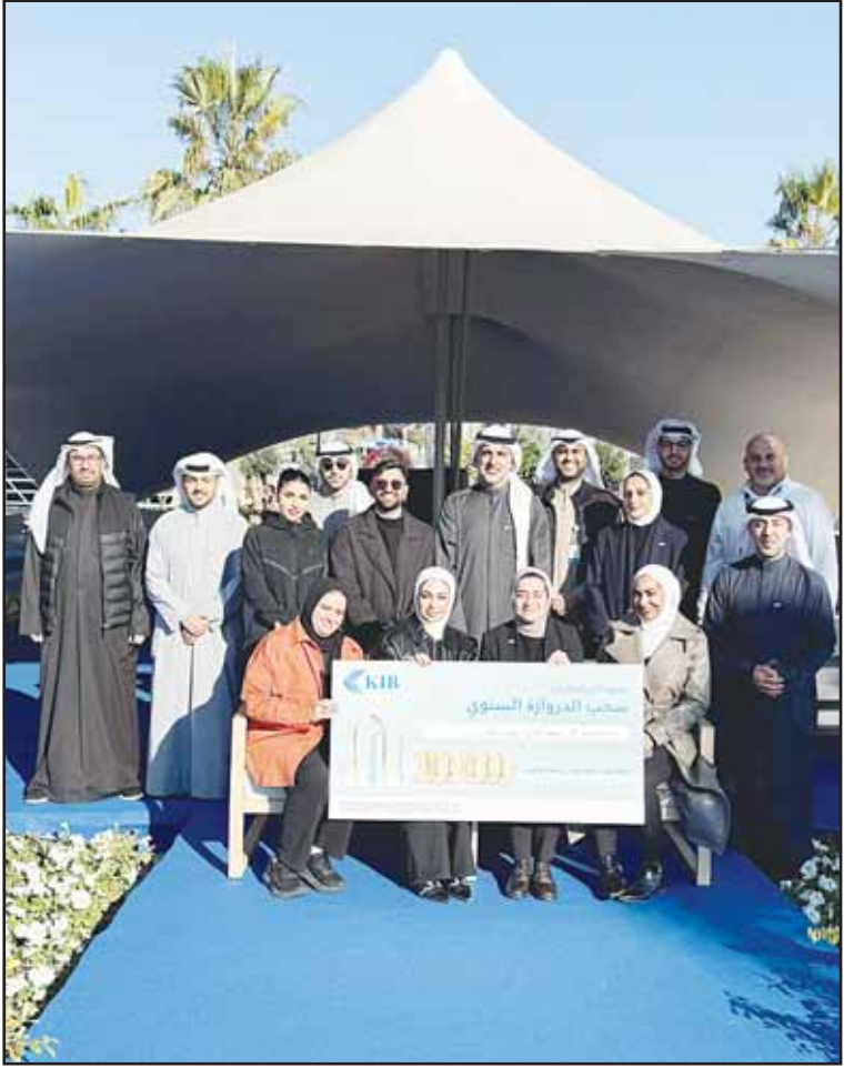
KIB's Dirwaza account's 2025 mega draw winner.

Additionally, Al Dirwaza account automatically grants customers instant issuance of an ATM card, with a KD 2,000 ATM daily withdrawal limit, as well as the ability to issue credit cards against the cash collateral in the account. To open the account and participate in its draws, a minimum of KD 100 is required and can only be withdrawn upon account closure.