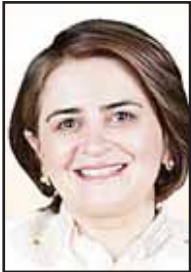
Dr. Ghadir Asiri

“Since its inception, the State of Kuwait has recognized the vital role of education in the country’s growth, transitioning from a primitive, illiteracy-prone education system to a modern, compulsory and institutionalized one through the implementation of Law No. 11 of 1965.