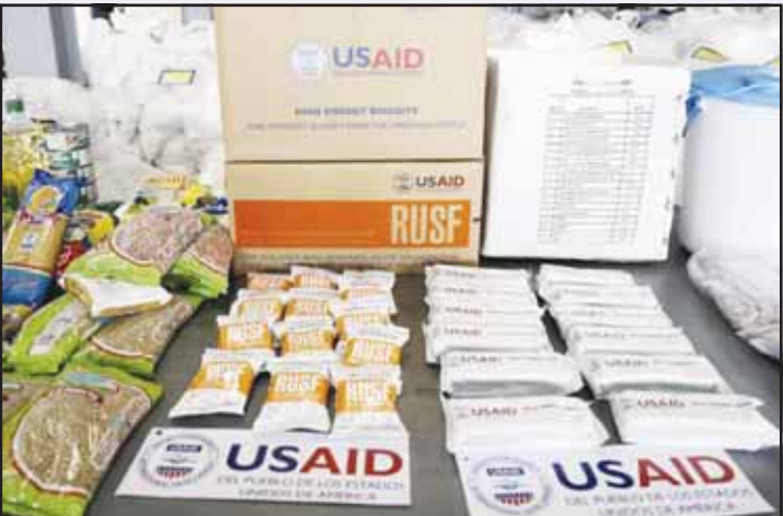
USAID humanitarian aid destined for Venezuela is displayed for the media at a warehouse next to the Tienditas International Bridge on the outskirts of Cucuta, Colombia, Feb 19, 2019.

and seek waivers to continue life-saving activities, from getting clean water to war-displaced people in Sudan to continuing to monitor for bird flu globally, the former official said. Secretary of State Marco Rubio has specifically exempted only emergency