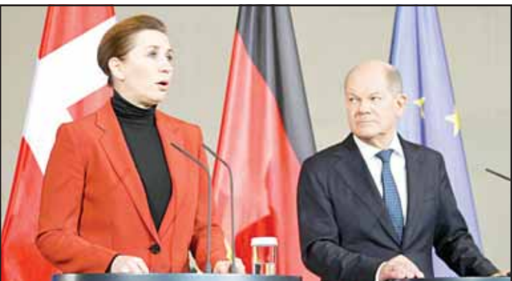
Prime Minister of Denmark Mette Frederiksen, (left), and German Chancellor Olaf Scholz hold a joint press conference after their bilateral talks at the Federal Chancellery in Berlin on Jan 28.

BERLIN, Jan 28, Denmark's prime minister embarked on a tour of major European capitals Tuesday as the continent faces what she called "a more uncertain reality" and her country moves to strengthen its military presence around Greenland. Prime Minister Mette Frederiksen planned stops in Berlin, Paris and Brussels, the latter to meet NATO Secretary General Mark Rutte. Her trip comes as new U.S. President Donald Trump has said he would not rule out the use of military force to seize control of Greenland, an autonomous territory belonging to NATO and European Union member Denmark. On Monday evening, her government announced a roughly 14.6 billion-kroner (nearly $2 billion) agreement with parties including the governments of Greenland and the Faeroe Islands to "improve capabilities for surveillance and maintaining sovereignty in the region." Those will include three new Arctic naval vessels, two additional long-range surveillance drones and satellite capacity, the Defense Ministry