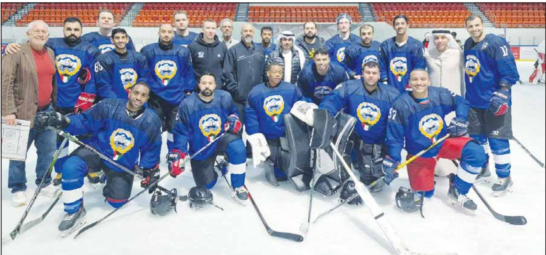
The Kuwait ice hockey team.

He expressed gratitude to the Kuwaiti Olympic Committee and the Public Authority for Sports, praising their support as a key factor in the club's development and success.