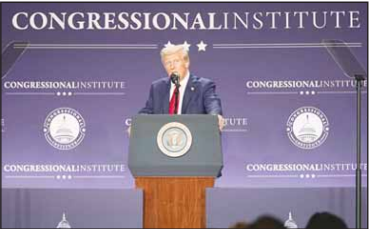
US President Donald Trump speaks at the 2025 House Republican Members Conference Dinner at Trump National Doral Miami in Doral, Florida on Jan 27.

DORAL, Fla. Jan 28, US President Donald Trump regaled House Republicans on Monday with a rhetorical highlight reel from his first week in office, and he urged them to support his immigration crackdown and border security proposals. "We have no apologies and we're moving very fast," Trump said. "I really focus on the border more than anything else," he said, downplaying the importance of inflation, an issue that fueled his candidacy last year but one that he has less control over as president. Speaking at House Republicans' annual policy retreat, Trump made clear his political ambitions as he rallied lawmakers to advance their conservative agenda. "We're forging a new political majority that's shattering and replacing Franklin Roosevelt's New Deal coalition, which dominated American politics for over 100 years," he said. The conference is being held at Trump National Doral Miami, a posh resort with four golf courses owned by the billionaire president. Although Republicans are euphoric over election victories that have given them total control in Washington, they're also facing difficult negotiations in the coming weeks and months. They need to find consensus on a spending bill before a March 14 deadline, when funding for the federal government expires.