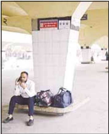
Stranded passengers wait at a railway station, after trains across the country have been canceled as railway workers went on strike for higher pensions and other benefits, in Dhaka, Bangladesh on Jan 28.

170 million people. It employs about 25,000 people and operates a network of over 36,000 kilometers (22,000 miles). The main Kamalapur Railway Station in the capital, Dhaka, was mobbed by hundreds of disappointed passengers who were not aware of the strike. Many waited for hours before going home. As the country's railway adviser visited, passengers shouted complaints. Fouzul Kabir Khan, the country's railway affairs adviser, told reporters that such a nationwide strike was "regrettable" and he urged the protesters to end the strike. He said that "doors for discussion" were open to resolve the standoff.