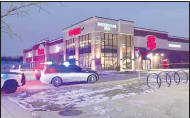
Police respond to the scene of a deadly shooting at a grocery store on Jan 27, in Elkhart, Ind.

A shooting at a grocery store in northern Indiana on Monday left three people dead, including the suspected shooter, and two police officers wounded, officials said. Police received a 911 call at about 5:30 pm about a shooting at Martin's Super Market in Elkhart, the city police department said in a social media post. When officers arrived, they found two shooting victims dead inside the store. When police "engaged" the shooting suspect outside the store, two officers were wounded and the suspect was fatally shot, according to the Elkhart Police Department post, which was made to update information given at an earlier news conference. The officers were taken to hospi-