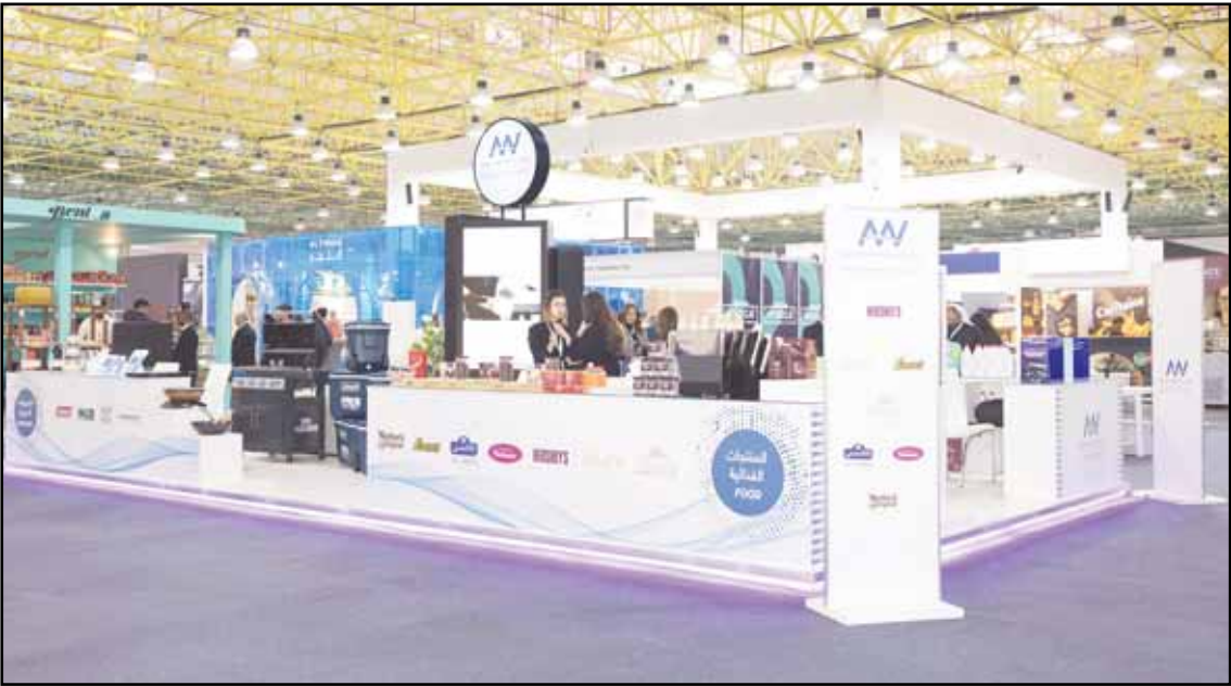
HORECA Kuwait Exhibition.

side competitions in culinary arts, barista, mocktail, and housekeeping, judged by international experts.