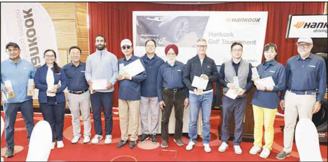
Group photo of winners.