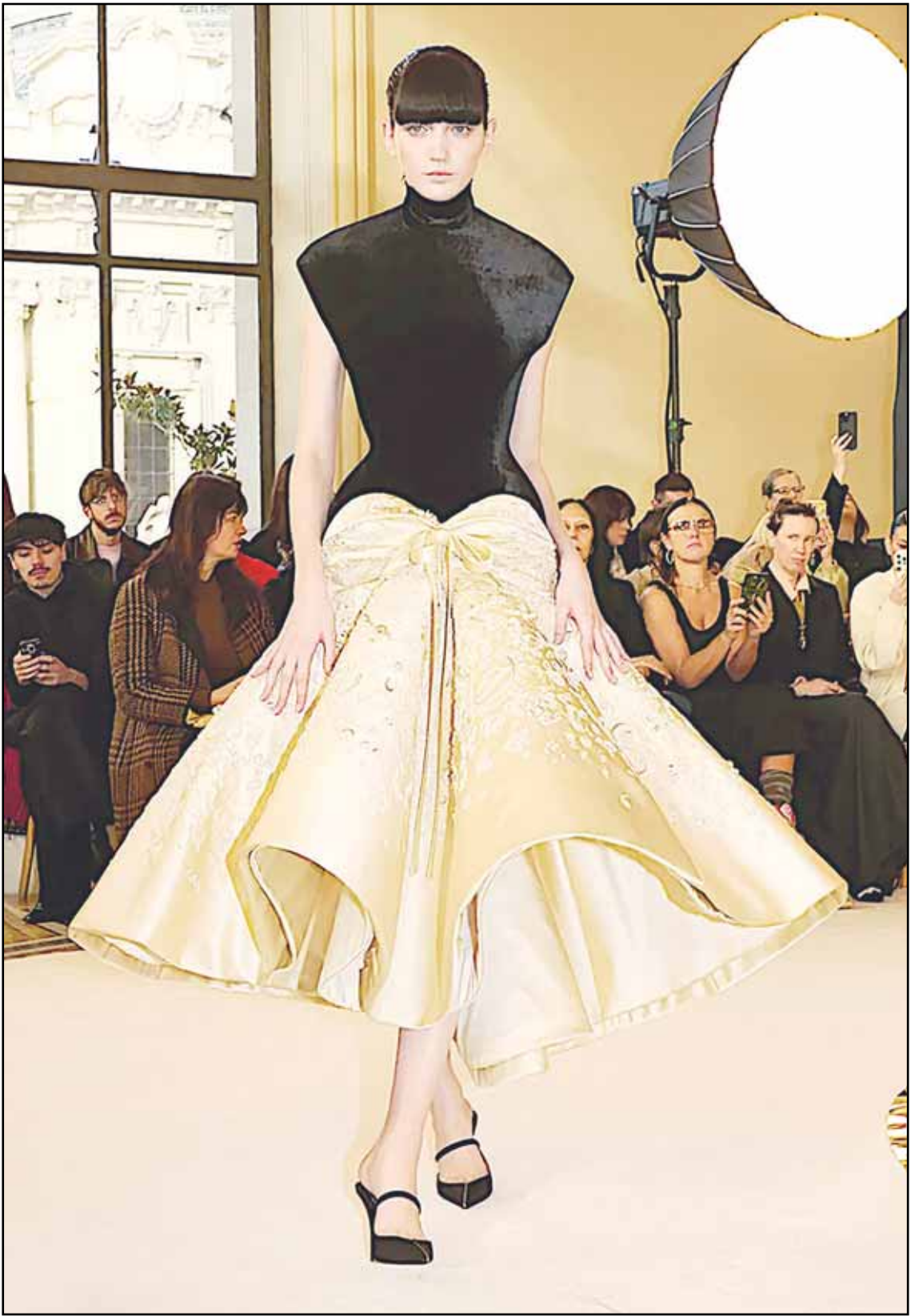
A model presents a creation by Schiaparelli during the Haute Couture Week Spring/Summer 2025 in Paris, France, Jan. 27, 2025.

he turned soft hues like butter, saffron and "toast" brown into bold baroque silhouettes that disrupted tradition.