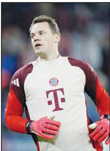
Bayern's goalkeeper Manuel Neuer stretches himself during warm up before the Champions League opening phase soccer match between FC Bayern and Paris Saint Germain, at the Allianz Arena in Munich, Germany.

in the Champions League last Wednesday, and he had three disallowed goals in the first half of an eventual 1-0 win against Young Boys.