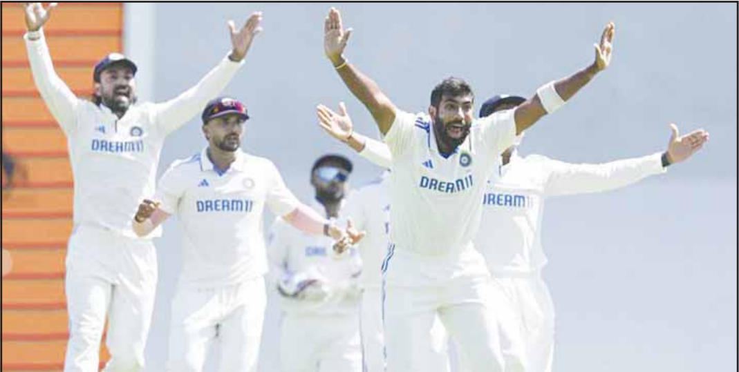
In this file photo, India’s Jasprit Bumrah appeals successfully for the wicket of Australia’s Marnus Labuschagne during the second day of fifth test between Australia and India.

The 24-year-old Omarzai finished the year as Afghanistan’s second highest scorer in ODIs behind Rahmanullah Gurbaz and helped his country win four of the five bilateral series in a calendar year that included victories over South Africa and Bangladesh. Indian left-handed batter Smriti Mandhana capped a perfect year by earning the ICC’s women’s ODI player of the year award as she racked up 747 runs in 13 ODIs. Mandhana’s run tally put her ahead of Laura Wolvaardt (697), Tammy Beaumont (554) and Hayley Matthews (469). Mandhana also scored a women’s record of four ODI centuries in a calendar year, hitting 95 fours and six sixes.