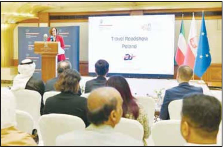
A photo from the Poland Travel Roadshow.