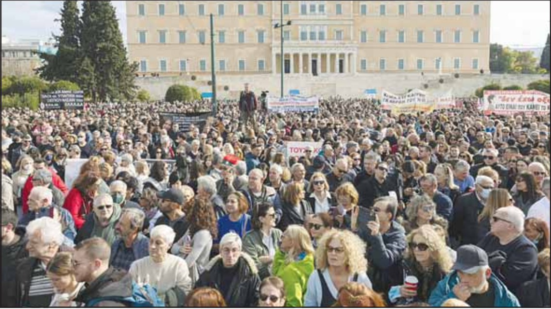
People attend a rally organised by the association of the families of victims of the Tempi train collision, which killed 57 people almost two years ago, at central Syntagma square, in Athens, Greece on Jan 26.