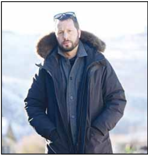
Mstyslav Chernov, director of the documentary film "2000 Meters to Andriivka," poses for a portrait during the Sundance Film Festival on Thursday, Jan. 23, 2025, in Park City, Utah.