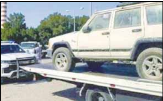
An abandoned car is taken away.

Al-Barrak also called for fostering a transparent and cooperative work environment while accelerating financial and administrative reforms to serve national and public interests.