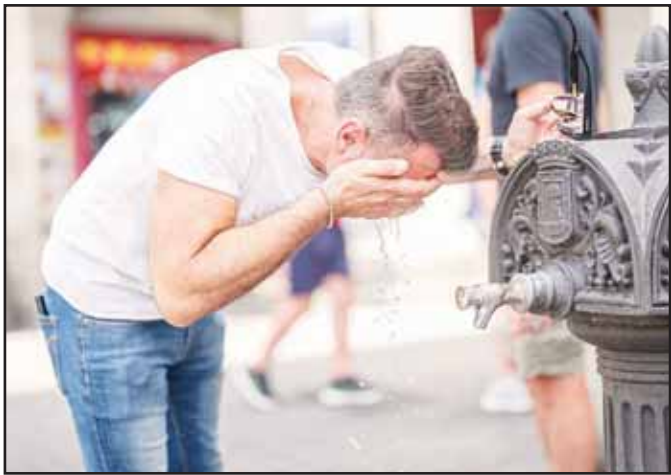
A man cools off in a fountain during a hot and sunny day of summer in Madrid, Spain, July 19, 2023.

Several heat waves have killed thousands of people in the last few years in Europe, but one in 2003 is the biggest with about 70,000 deaths.