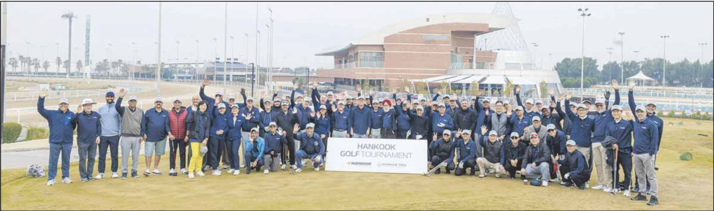
Golfers before Tee-off.