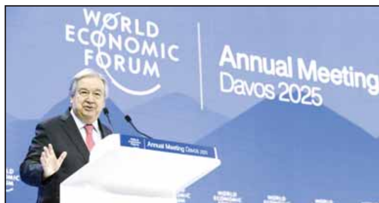
Antonio Guterres, Secretary-General of the United Nations, speaks during a plenary session in the Congress Hall during the 55th annual meeting of the World Economic Forum (WEF) in Davos, Switzerland, Wednesday, Jan. 22, 2025.

António Guterres, the United Nations secretary-general, has been one of the highest-profile advocates for the fight against climate change. That effort has been rattled by promises by U.S. President Donald Trump to "drill, baby, drill" and expand fossil-fuel production in the world's largest economy.