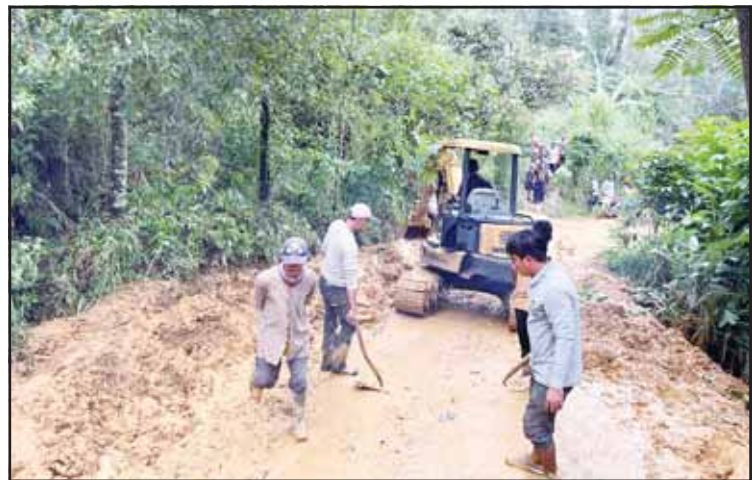
Workers clear a road cut off by a landslide following a flash flood in Pekalongan, Central Java, Indonesia on Jan 22.

Scores of rescue personnel recovered two mud-caked bodies as they searched a Petungkriyono area where tons of mud and rocks buried two houses and a cafe. Rescuers are still searching for seven people reported missing.