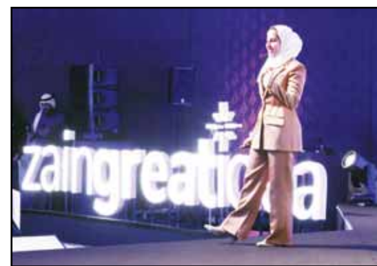
An entrepreneur presents her pitch during the event.