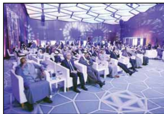
From the event.