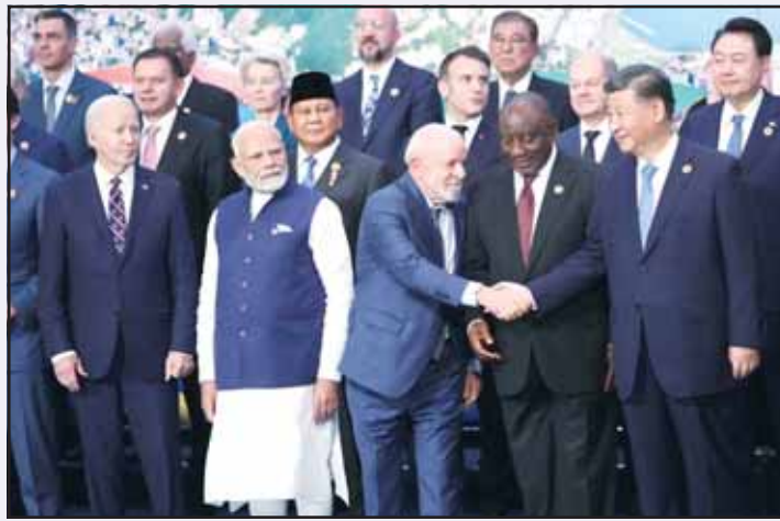
From left: US President Joe Biden, India's Prime Minister Narendra Modi, Brazil's President Luiz Inacio Lula da Silva, South Africa's President Cyril Ramaphosa and China's President Xi Jinping gather for a G20 Summit world leaders' group photo, in Rio de Janeiro on Nov 19, 2024.

Chinese President Xi Jinping told European Council President Antonio Costa in a phone conversation last week that both sides could bring more "stability and certainty" to the turbulent global situation. China and Britain restarted eco-