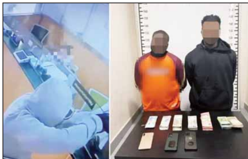
Video and photo from the Ministry of Interior show the daring armed robbery at a currency exchange office in Al-Mahboula and the swift capture of the gang behind it.

KUWAIT CITY, Jan 22: An African gang was apprehended by the Criminal Security Sector's the General Department of Criminal Investigations within 24 hours of their armed robbery of a foreign exchange office in Mahboula. The gang stole approximately KD 4,600 in foreign currencies, reports Al-Seyassah daily.