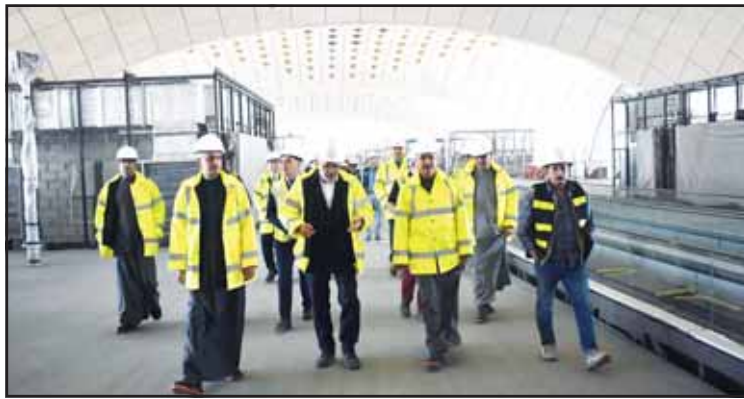
Part of the tour