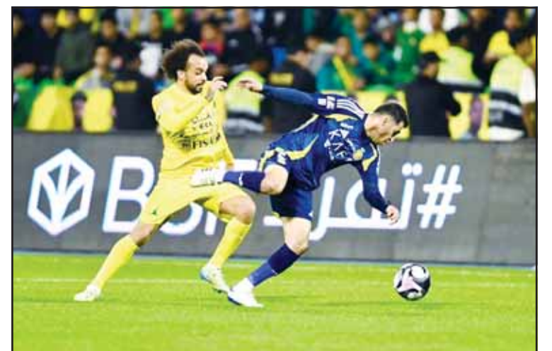
Players battle for the ball during the Saudi Pro League soccer match.

DAMMAM, Saudi Arabia, Jan 22, (AP): Cristiano Ronaldo scored twice for Al-Nassr in a 3-1 victory over Al-Khaleej to move atop the Saudi Pro League goalscoring standings above Aleksandar Mitrovic and Karim Benzema.