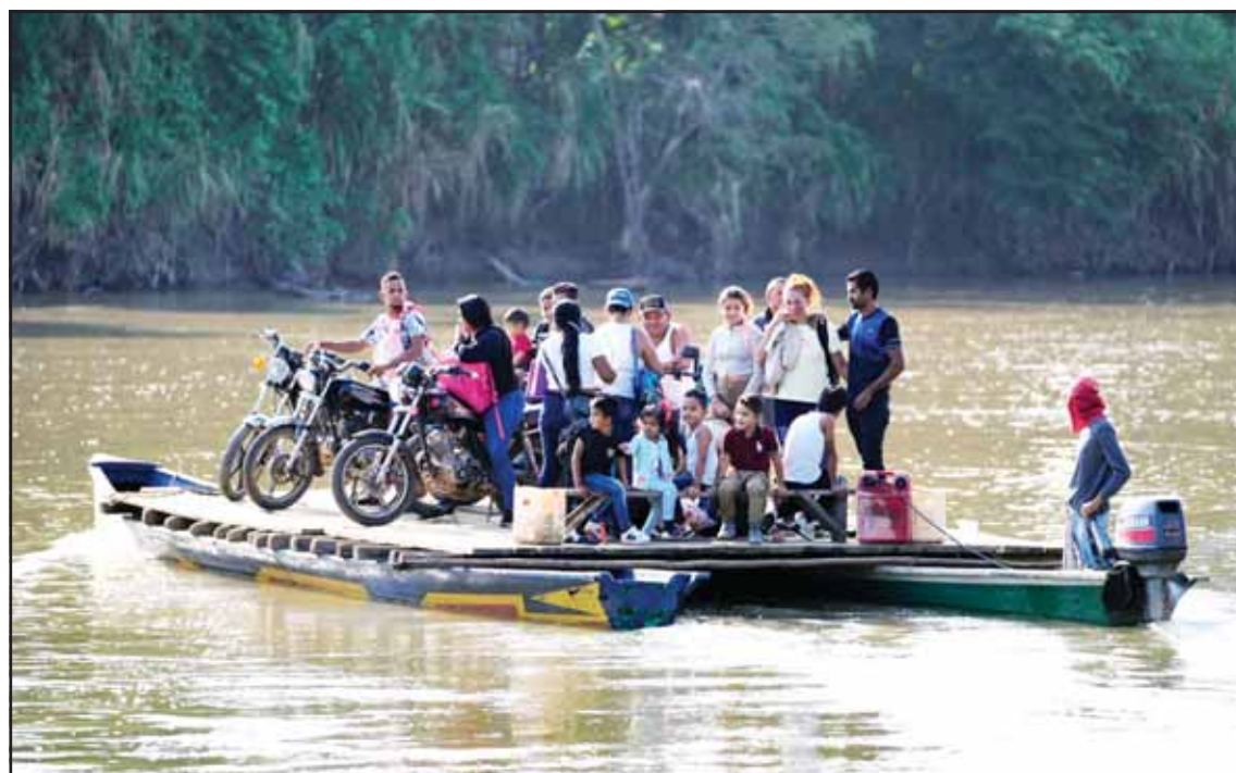
Residents cross the Tarra River to Venezuela from Colombia's Tibu on Jan 21, following guerrilla attacks that killed dozens and forced thousands to flee their homes in the Catatumbo region.

The Luohe's armaments include a variety of machine guns for close combat and anti-air and anti-ship missiles, according to defense publications, some of which say the ship could become the backbone of the Chinese navy.