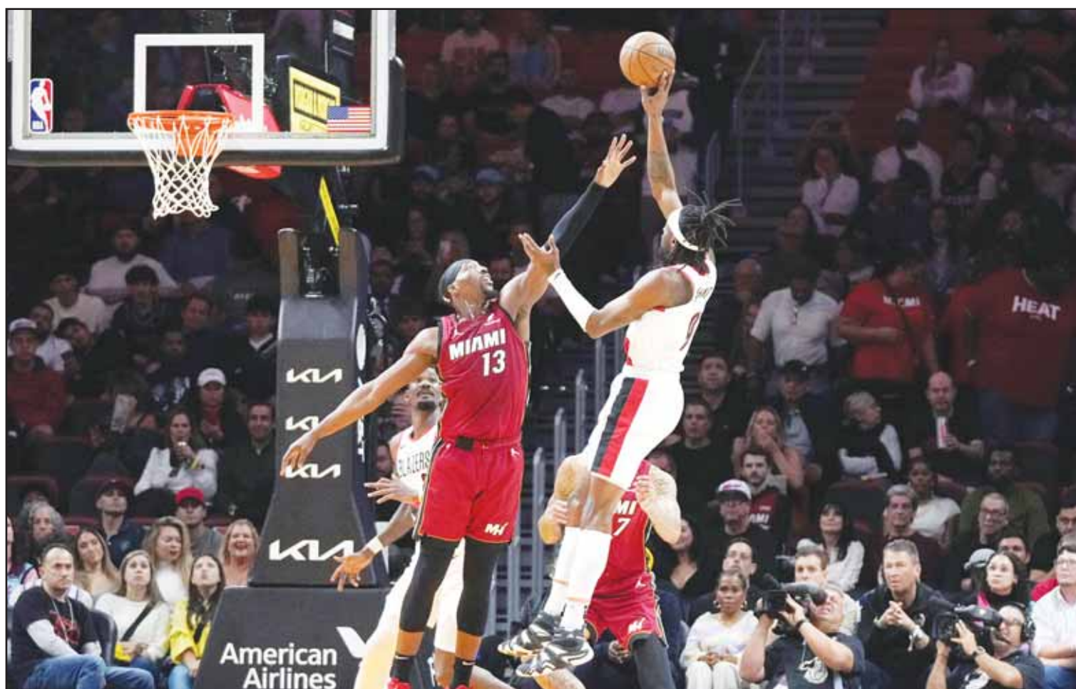
Portland Trail Blazers forward Jerami Grant, right, shoots as Miami Heat center Bam Adebayo (13) defends during the first half of an NBA basketball game in Miami.

Uzbekistan was the fifth national team coached by Katanec, including two spells with Slovenia, who he led to its tournament debut at the 2000 European Championship.