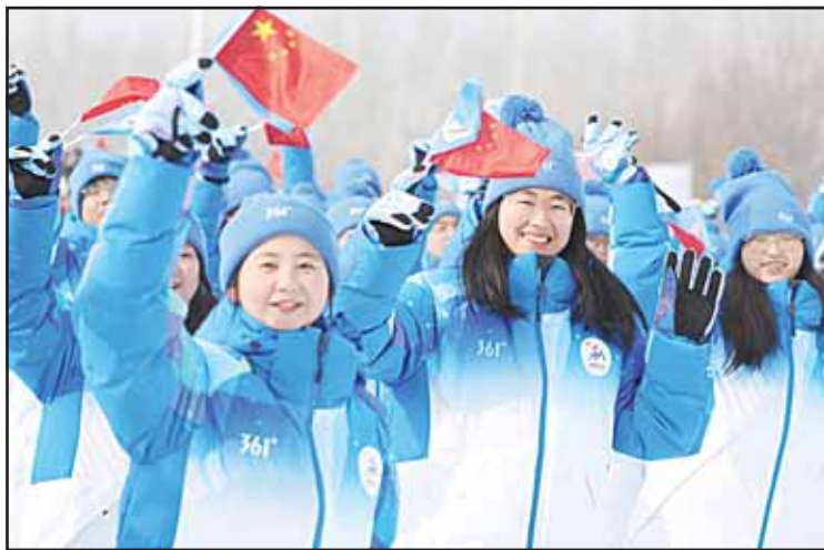
Spectators react during the flame lighting ceremony for the Harbin 2025 Asian Winter Games at the Sun Island Scenic Area in Harbin, northeast China's Heilongjiang Province.