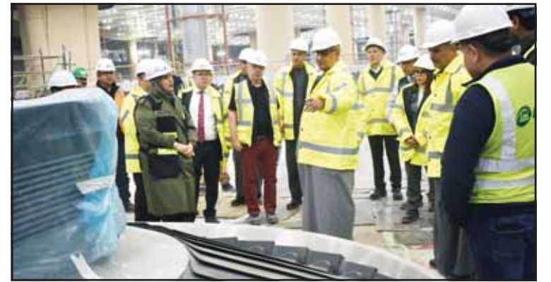
Executive Management on a project tour.

KUWAIT CITY, Jan 22: The Executive Management of the National Bank of Kuwait (NBK) conducted a site visit to the new Kuwait Airport project, where they were provided with an in-depth briefing on the latest advancements in the implementation of its phases.