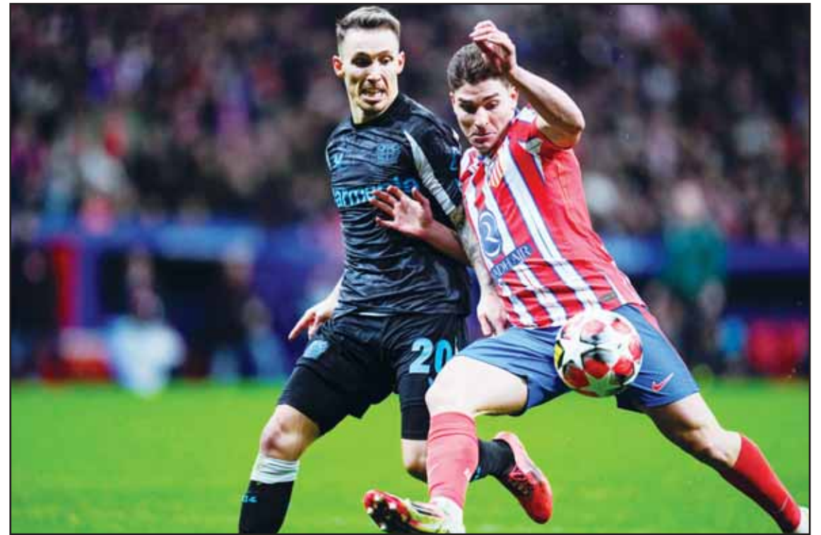
Atletico Madrid's Julian Alvarez, right, and Leverkusen's Alex Grimaldo fight for the ball during a Champions League opening phase soccer match at the Riyadh Air Metropolitan stadium in Madrid, Spain.

LONDON, Jan 22, Liverpool became the first team to guarantee a place in the last 16 of the new Champions League format by beating Lille 2-1, while Barcelona fought back from two goals down to stun Benfica 5-4 in a thriller.