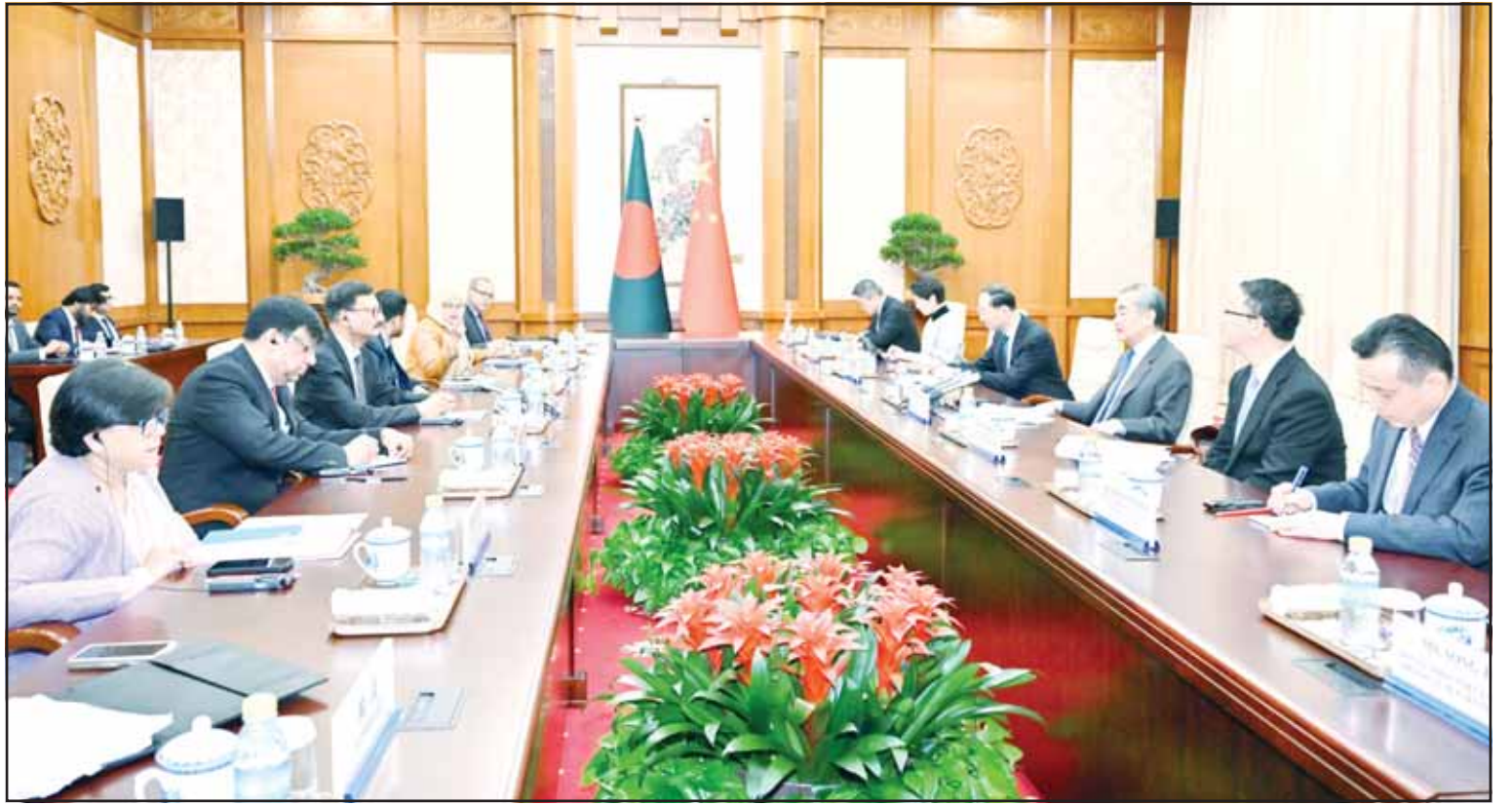
Chinese Foreign Minister Wang Yi, also a member of the Political Bureau of the Communist Party of China Central Committee, holds talks with Adviser for Foreign Affairs of the Interim Government of Bangladesh Touhid Hossain in Beijing, capital of China on Jan 21.