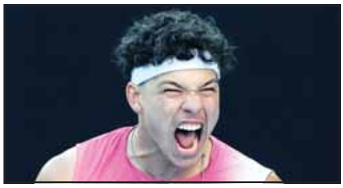
Ben Shelton of the U.S. reacts during his quarterfinal match against Lorenzo Sonego of Italy at the Australian Open tennis championship in Melbourne, Australia. Shelton beats the unseeded Sonego 6-4, 7-5, 4-6, 7-6 (4). - See Page 15