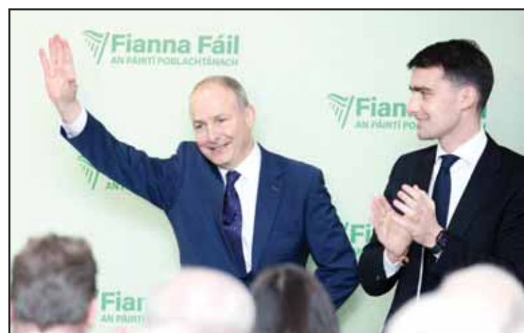
Fianna Fail leader Micheal Martin and deputy leader Jack Chambers during the Fianna Fail conference at the Radisson Hotel, in Dublin on Jan 19.

In Ireland's Nov. 29 election, voters bucked a global trend that saw incumbent governments ousted around the world in 2024. Fianna Fáil won 48 of