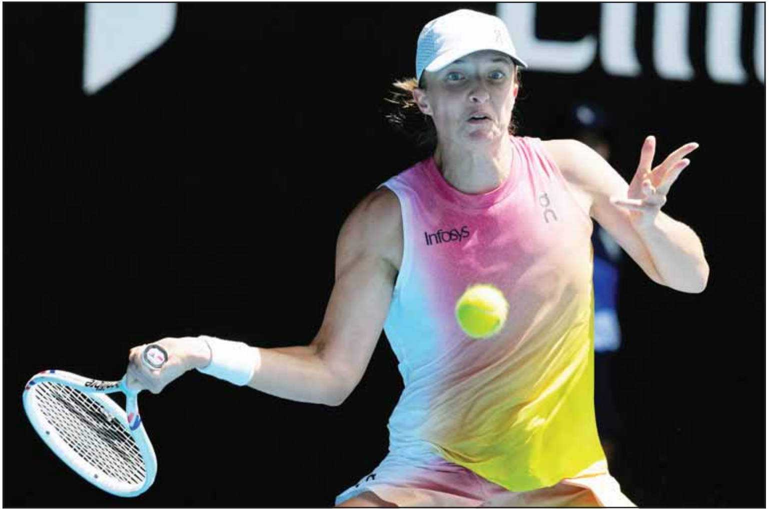
Iga Swiatek of Poland plays a forehand return to Emma Navarro of the U.S. during their quarterfinal match at the Australian Open tennis championship in Melbourne, Australia.

"I think it was tougher than the score said. I wanted to stay focused until the end and keep my intensity," said Swiatek, who hit 22 winners and broke serve five times.