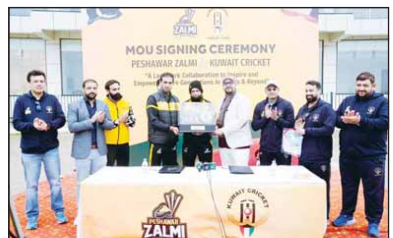
Photos from the MOU signing event.