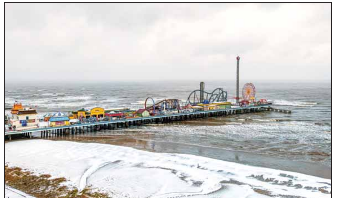
shows snow over Galveston, Texas on Jan 21.