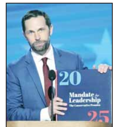
US Rep Jason Crow, D-Colo., holds a copy of Project 2025 as he speaks during the Democratic National Convention on Aug 22, 2024, in Chicago.

The Democratic National Committee, under the direction of retiring