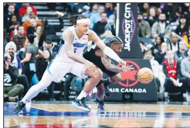
Orlando Magic forward Paolo Banchero (5) and Toronto Raptors guard Jamal Sheard (23) battle for possession during the first half of an NBA basketball game in Toronto.

in the third quarter before the Nets rallied and moved out to a one-point lead at 88-87 on a 3-pointer by Keon Johnson with 5:18 left.