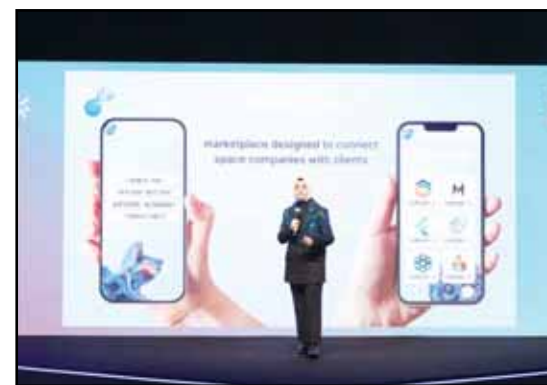
A participant presents her startup to investors.

ners, including Rasameel Investment, Architech, current and past members of judgespanels, mentors, experts, and speakers from Kuwait and around the world, the Zain team, and all the talented entrepreneurs and idea owners who have been a part of the program for 15 years.