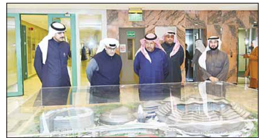
Minister of State for Municipal Affairs and the Minister of State for Housing Affairs Abdul Latif Al-Mishari, Farwaniya Governor Sheikh Athbi Naser Al-Athbi Al-Sabah inspecting design of a future project.

He thanked the Ministry of Foreign Affairs and the Ministry of Social Affairs in Kuwait, and the Egyptian Red Crescent.