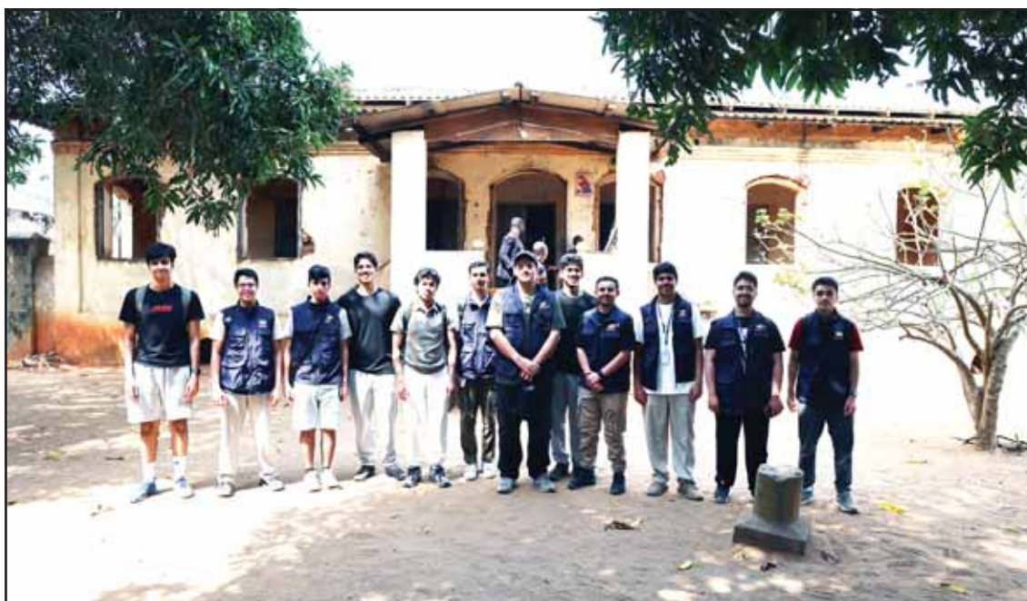
Photos from the Togo and Bosnia trip by the 'Be Among High-Achievers' students.

of culinary arts, in which they participated in a cooking workshop that included preparing some of the most traditional dishes in Bosnia.