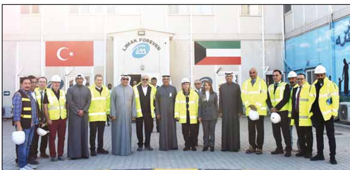
Executive Management in a group photo with Limak officials.

NBK is an active partner in achieving achievements and successes in Kuwait by financing the country's mega