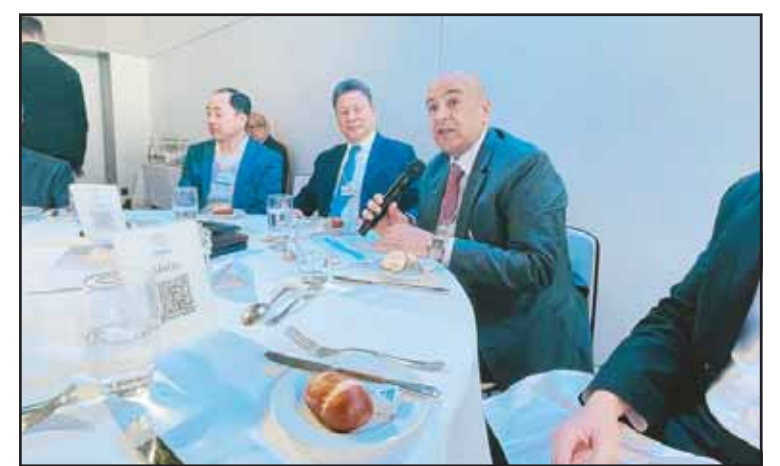
Secretary General of the Gulf Cooperation Council (GCC) Jassim Al-Budaiwi during his participation in roundtable discussion.

enhancement of this relationship to several factors, including shared interests at the time of both organizations' founding, opportunities to boost economy and trade, and the distinguished bilateral relations among member states.