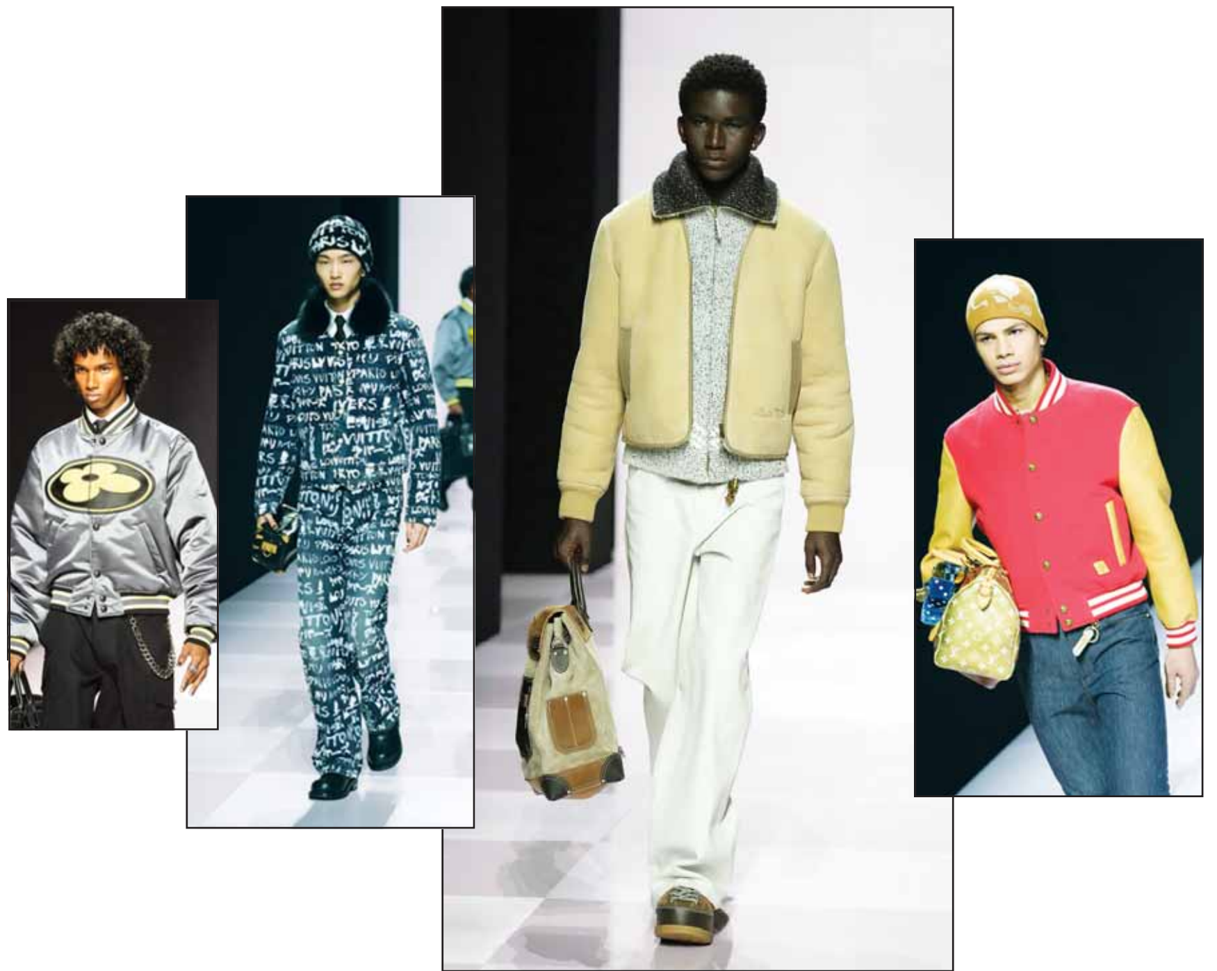
Models wear creations as part of the men's Louis Vuitton Fall-Winter 2025-2026 collection, that was presented in Paris, Tuesday, Jan. 21, 2025.

East & West styles merge at star-studded show