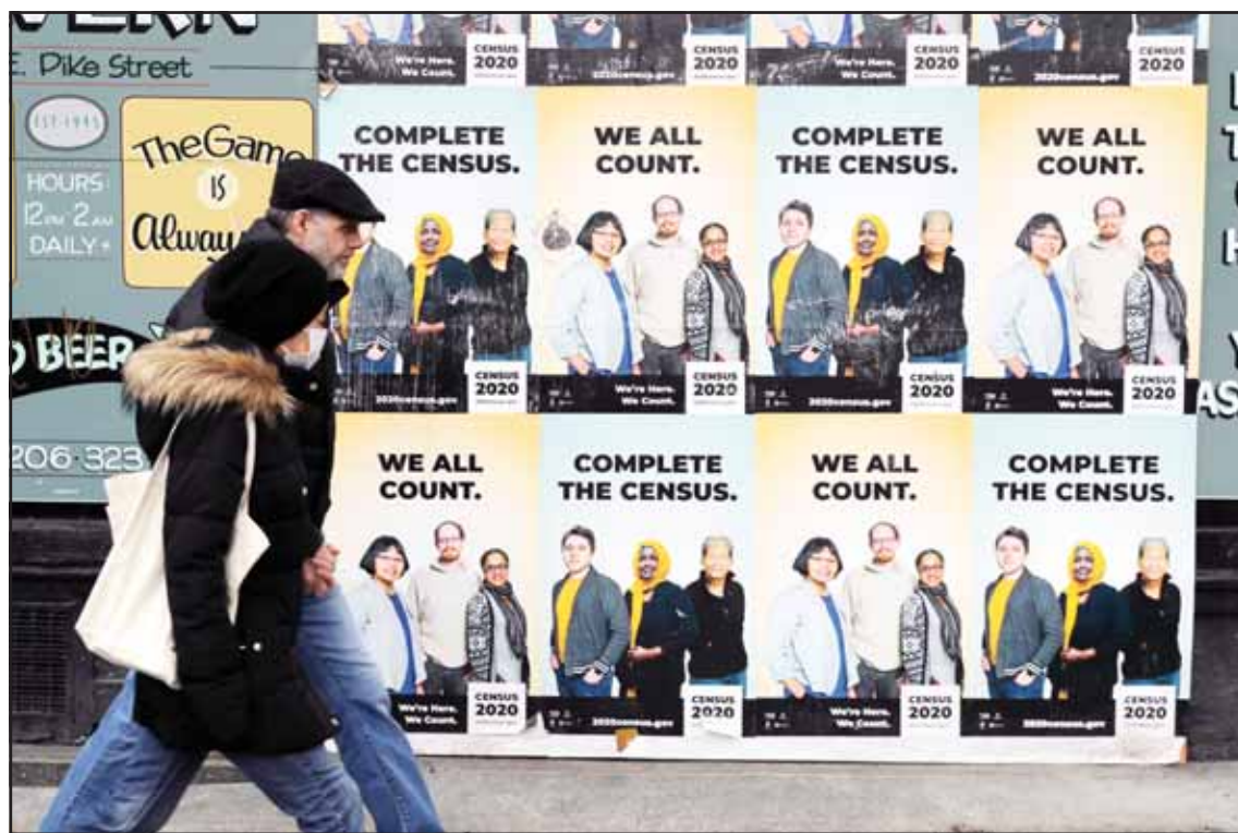
People walk past posters encouraging participation in the 2020 Census in Seattle's Capitol Hill neighborhood on April 1, 2020.

"If he's successful with even half the executive orders, every future president is going to want to do the same thing," he said.