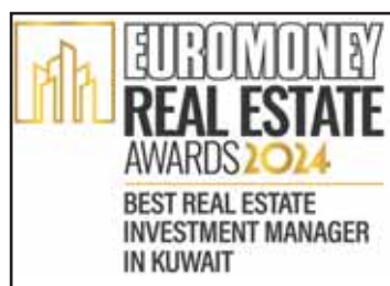
Best Real Estate Investment Manager Kuwait.