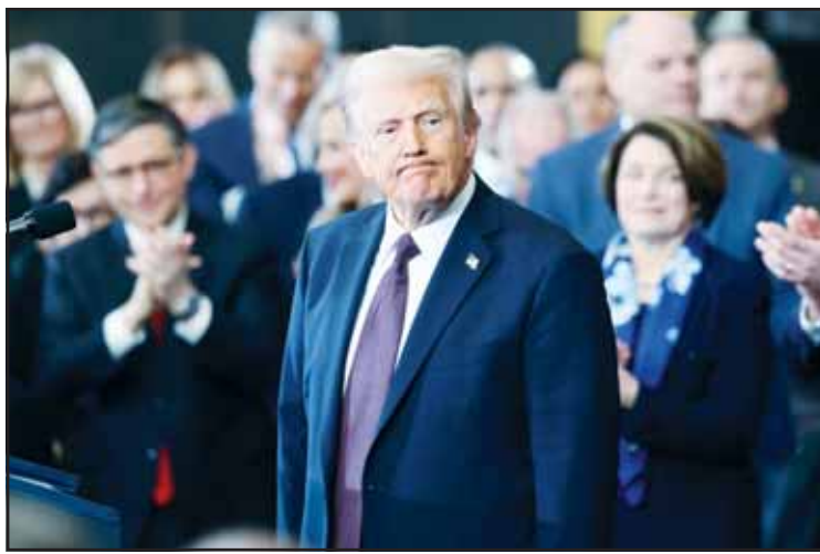
US President Donald Trump stands after taking the oath of office at the 60th Presidential Inauguration in the Rotunda of the US Capitol in Washington on Jan 20.

Sitting in the Oval Office just hours after being inaugurated on Monday, Trump rejected the characterization.