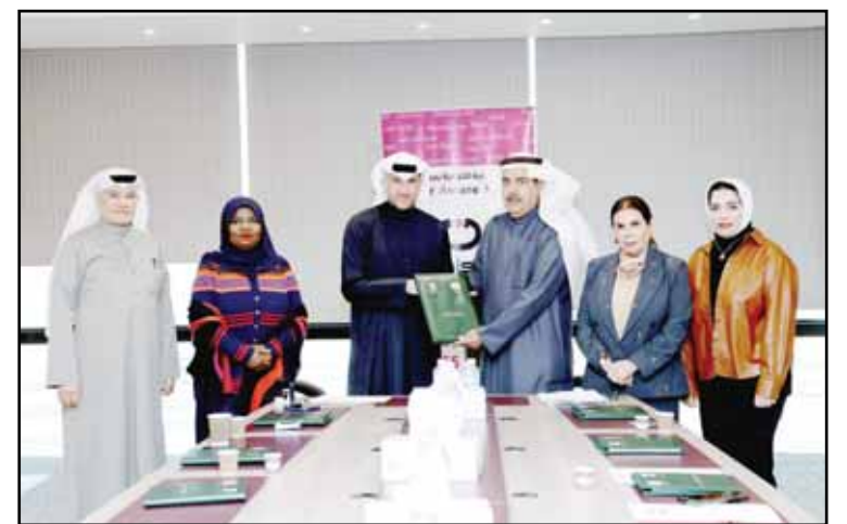
CAN and Sports Authority officials after signing of MoU.