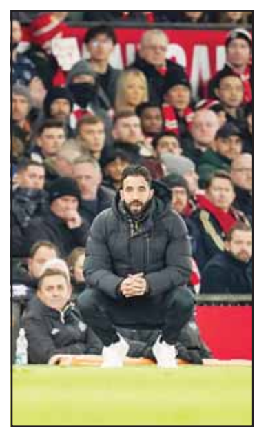
Manchester United's head coach Ruben Amorim looks on during the English Premier League soccer match between Manchester United and Southampton at the Old Trafford stadium in Manchester, England.

"I am a young guy and sometimes I make a mistake. This time I needed to talk. Maybe it was a mistake and I get more nervous and go to the (media) conference really nervous, and then you say things you shouldn't