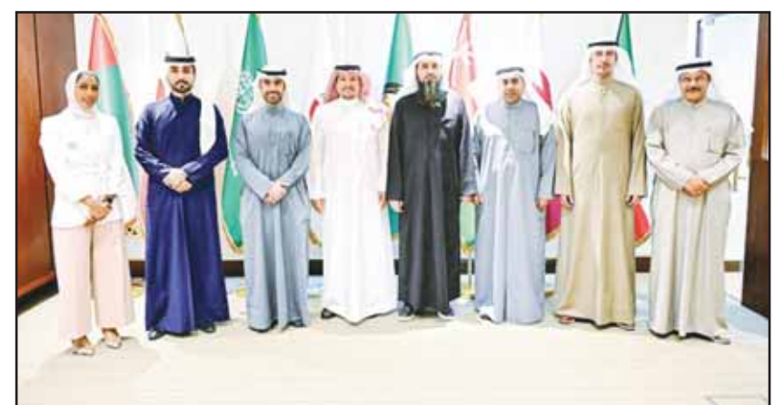
Group photo during the signing of the memorandum of understanding.

Tel: +973 17701201 - Ext. 351 | Email: reservation@albander.com | www.albander.com | @albanderhotelandresort