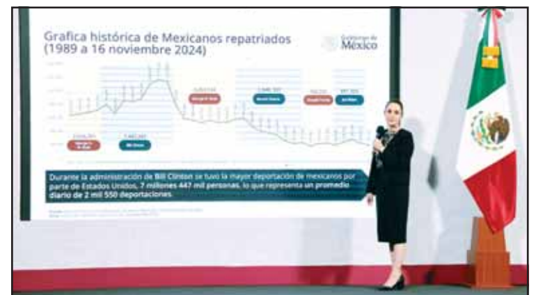
Image provided by Mexico's Presidency shows Mexican President Claudia Sheinbaum speaking during her morning press conference at the National Palace in Mexico City, capital of Mexico on Jan 21.