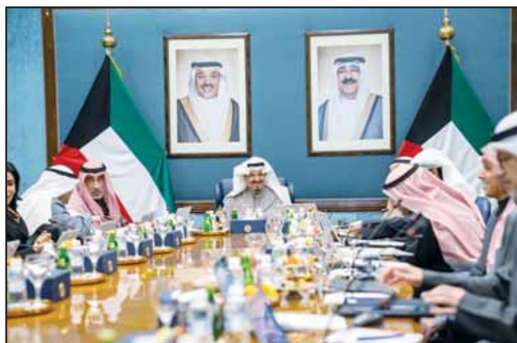
PM Diwan photo

Welcoming the recently-announced ceasefire-hostage deal in Gaza Strip, the Cabinet appreciated the successful mediation efforts, led by the State of Qatar, the Republic of Egypt and the