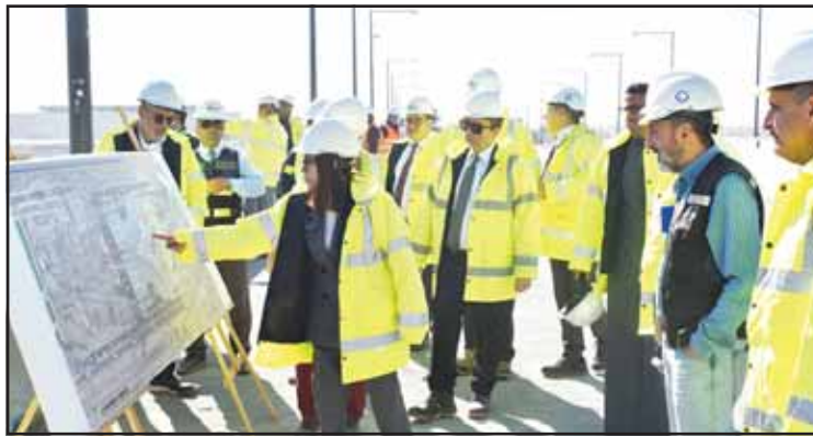
NBK Executive Management view the progress of the project.