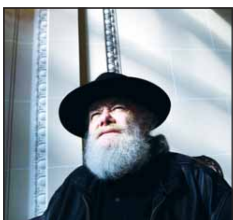
Musician Garth Hudson poses in Toronto on Tuesday, Nov. 2, 2010.

"There would be an informal discussion, before each recording," Hudson told the online publication Something Else! in 2014. "There would be ideas floating around, and the telling of stories. And then we'd go back to the songs."