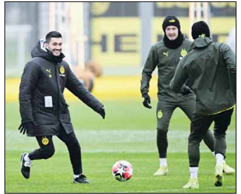
Dortmund's coach Nuri Sahin, centre left, smiles as he conducts a training one day ahead of their Champions League soccer match against FC Bologna, in Dortmund, Germany.

Paolo Banchero had 26 points and 12 rebounds for Orlando, which couldn't hold on after taking leads of 10-0 and 32-11 in the opening period. The Magic have lost four straight.