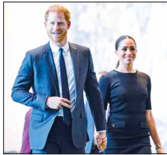
Prince Harry and Meghan Markle arrive at United Nations headquarters, July 18, 2022.

The case was one of three lawsuits Harry has brought accusing British tabloids of violating his privacy by eavesdropping on phone messages or using private investigators