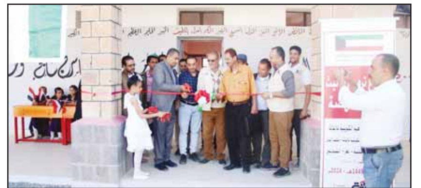
Kuwait Relief completes the rehabilitation and furnishing of two schools in southern Yemen.

He added that a contract was signed for the construction, completion, and maintenance of 1,777 houses and public buildings, as well as works for asphalt surface layers, supply and installation of low-pressure and medium-pressure cables, and street lighting works in sector BP-3 of the affordable housing project.