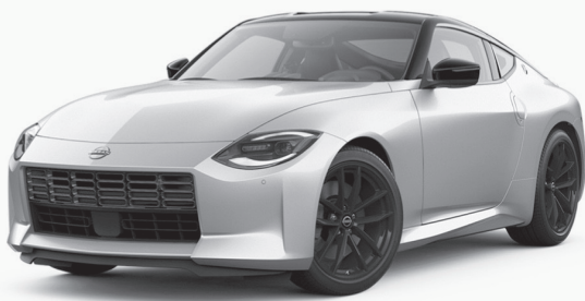
NISSAN - 370 Z - MODEL 2023 - 2024