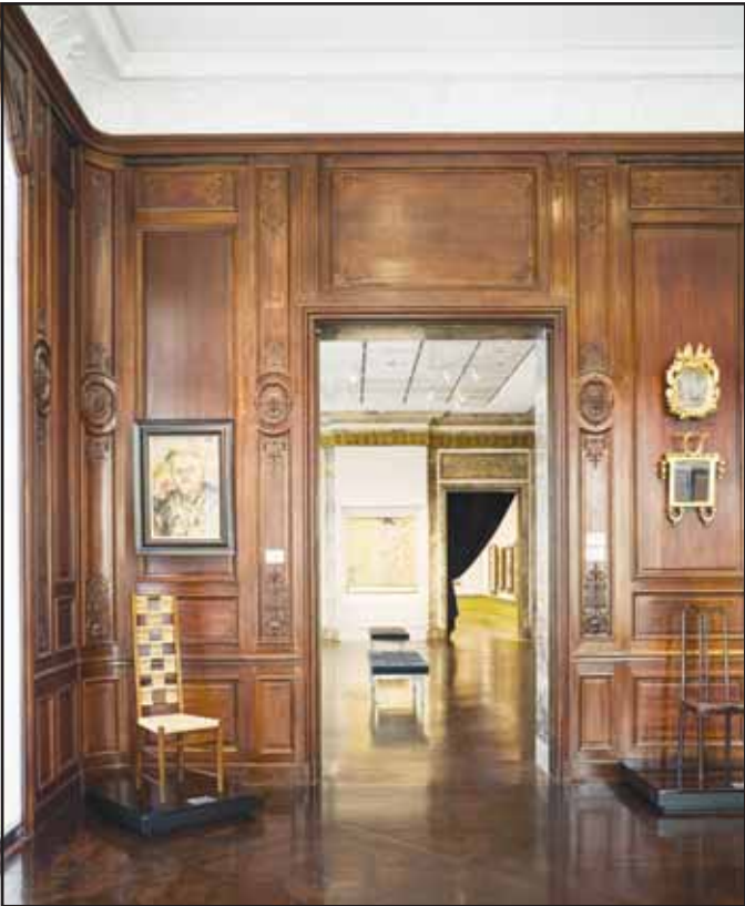
This Feb. 21, 2024, image released by the Neue Galerie New York shows an exhibition room featuring works of Austrian and German art and design at the Neue Galerie, a museum on the Upper East Side of Manhattan in New York.