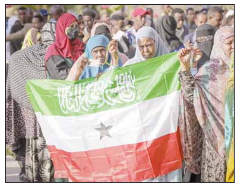
A woman displays the Somaliland flag as people queue to cast their votes during the 2024 Somaliland presidential election at a polling station in Hargeisa, Somaliland, on Nov 13.

In August, Brazil accepted Argentina's request to guard the diplomatic compound in Caracas after Maduro's government expelled its diplomats following Venezuela's July presidential election. The vote's disputed results, which Venezuelan electoral authorities claimed favor Maduro, prompted Milei to declare that he would not recognize "another fraud."