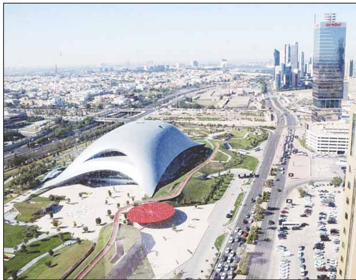
A stunning view of Kuwait City showcasing the grandeur of Al Shaheed Park Phase 3, a captivating addition to the city's skyline.