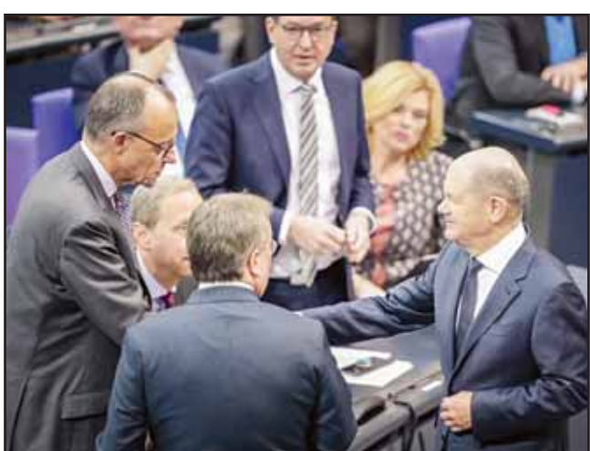
German Chancellor Olaf Scholz, (right), and the faction leader of the German Christian Democratic party (CDU), Friedrich Merz, (right), shake hands before a questioning during a meeting of the German federal parliament, Bundestag, at the Reichstag building in Berlin, Germany on Dec 4.

Scholz is expected to lose Monday's vote. His center-left Social Democrats hold 207 seats in the Bundestag and their remaining coalition partners, the environmentalist Greens, have 117. That leaves his government well short of a majority in the 733-seat chamber.