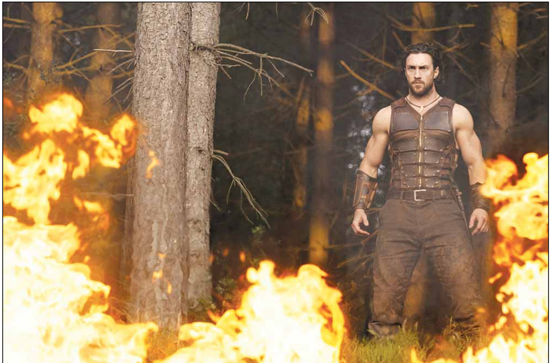
This image released by Sony Pictures shows Aaron Taylor Johnson in Columbia Pictures and Marvel's 'Kraven the Hunter.'