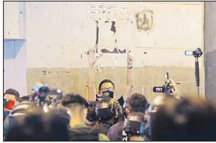
A pro-democracy lawmaker Lam Cheuk-ting, (center), gestures with five fingers, signifying the 'Five demands - not one less' as he is surrounded by riot police during a news conference to mark one-year anniversary of the Yuen Long subway attack at the subway station in Hong Kong on July 21, 2020.

'Former lawmaker Lam not acting as mediator'