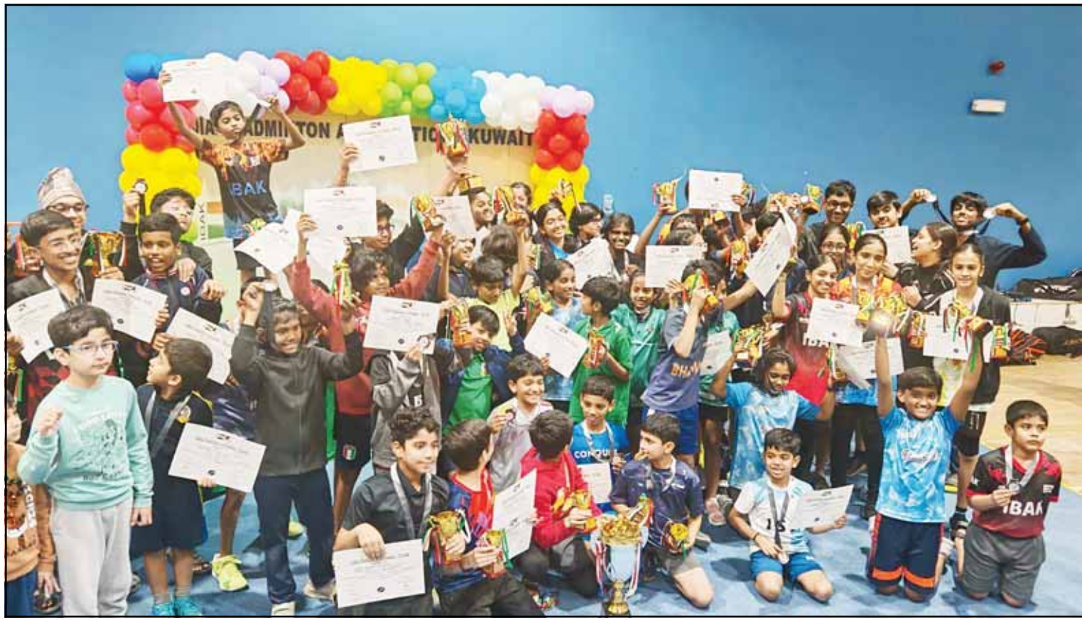
The winners pose for a group photo.