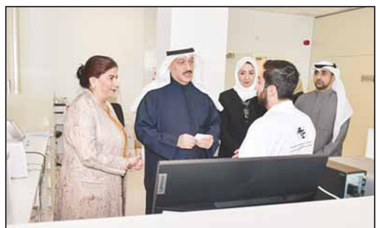
The Minister of Health receives a briefing on the functionality of the new system.