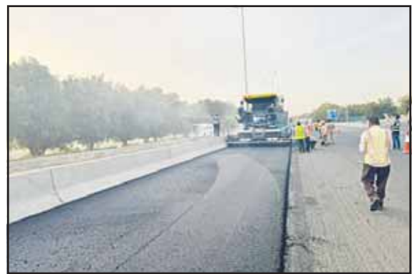
Road paving under progress in Farwaniya.