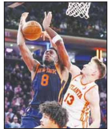
Atlanta Hawks' Bogdan Bogdanovic (13) defends a shot by New York Knicks' OG Anunoby (8) during the second half of an Emirates Cup NBA basketball game in New York.

Josh Hart scored 21 points and Karl-Anthony Towns had 19 points and 19 rebounds for the Knicks, who went 4-0 in group play and shot out to a 12-point lead Wednesday. But as in the 2021 playoffs, it was Young who was celebrating on the floor of Madison Square Garden after eliminating the Knicks.