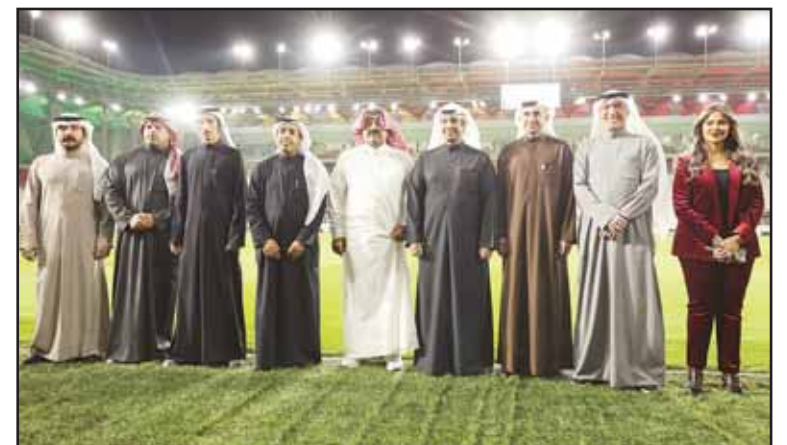
Officials pose for a group photo after the inauguration.