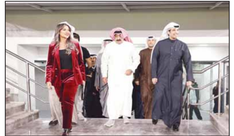
Officials arrive for the inauguration.