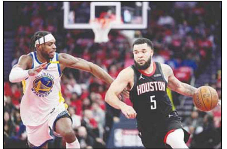
Golden State Warriors guard Buddy Hield (7) defends against Houston Rockets guard Fred VanVleet (5) during the first half of an Emirates NBA Cup tournament quarterfinal basketball game in Houston.

James expressed a desire earlier this season to play in all 82 games, but both he and the Lakers are now being practical with the inevitable minor injuries that arise during any season.