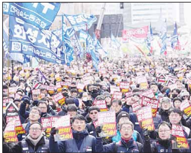
Protesters stage a rally demanding South Korean President Yoon Suk Yeol's impeachment in Seoul, South Korea on Dec 12. The signs read 'Arrest the rebellion leader Yoon Suk Yeol.'

It's unclear how Yoon's comments will affect his fate. Opposition parties hold 192 seats combined, eight votes short of a two-thirds majority of the 300 members of the National Assembly. The earlier attempt to impeach