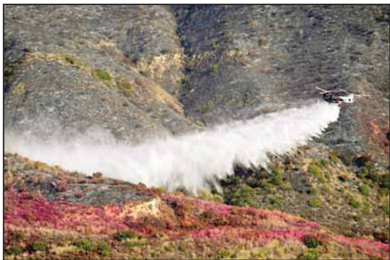
Water is dropped onto the Franklin Fire by helicopter on Dec 11, in Malibu, Calif.

But those who received the pardons would have to accept them. New California Sen. Adam Schiff, who was the chairman of the congressional committee that investigated the violent Jan. 6 insurrection, said such a pardon from Biden would be "unnecessary," and that the president shouldn't be spending his waning days in office worrying about this.