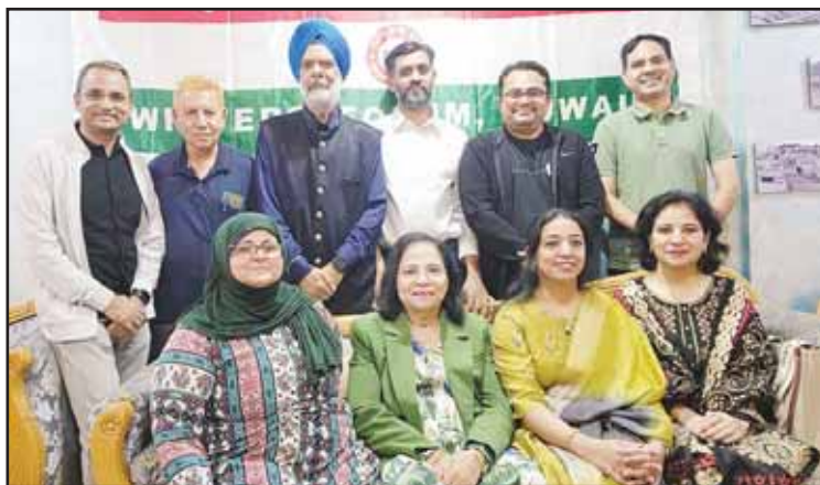
Photo during the meeting.

Also, participants enjoyed watching the live performance of the Japanese martial art "Karate", performed by Japan Karate Association in Kuwait.