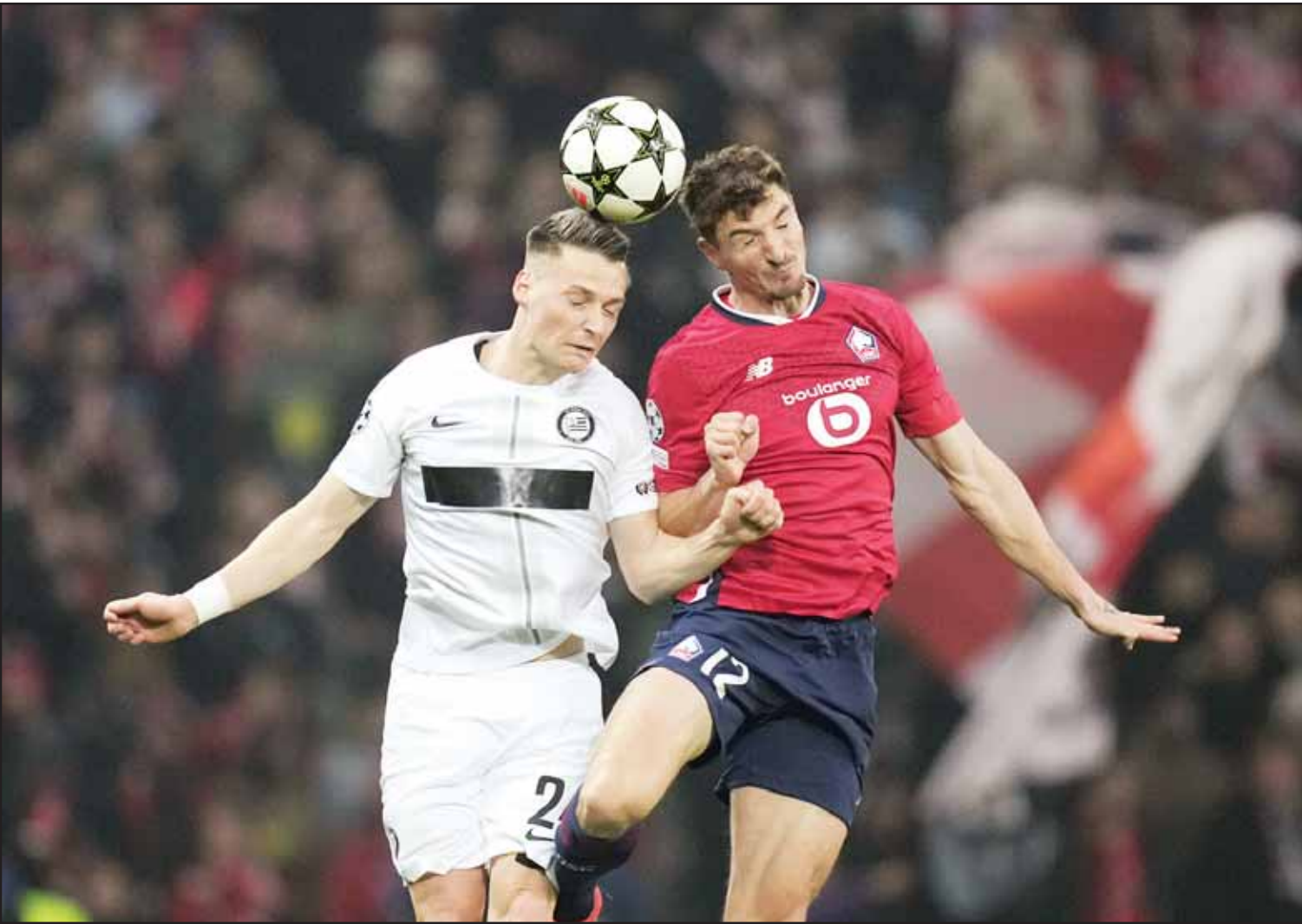
Lille's Thomas Meunier, right, challenges for the ball with Sturm's Dimitri Lavalee during the Champions League soccer match between Lille and Sturm Graz at the Stade Pierre Mauroy in Villeneuve-d'Ascq, outside Lille, northern France.

He congratulated the Custodian of the Two Holy Mosques King Salman Bin Abdulaziz Al Saud of Saudi Arabia, the Crown Prince and Prime Minister Mohammed bin Salman bin Abdulaziz Al Saud, Minister of Sports Prince Abdulaziz bin Turki Al-Faisal, and all the Saudi people for the well-deserved winning to host the world cup.