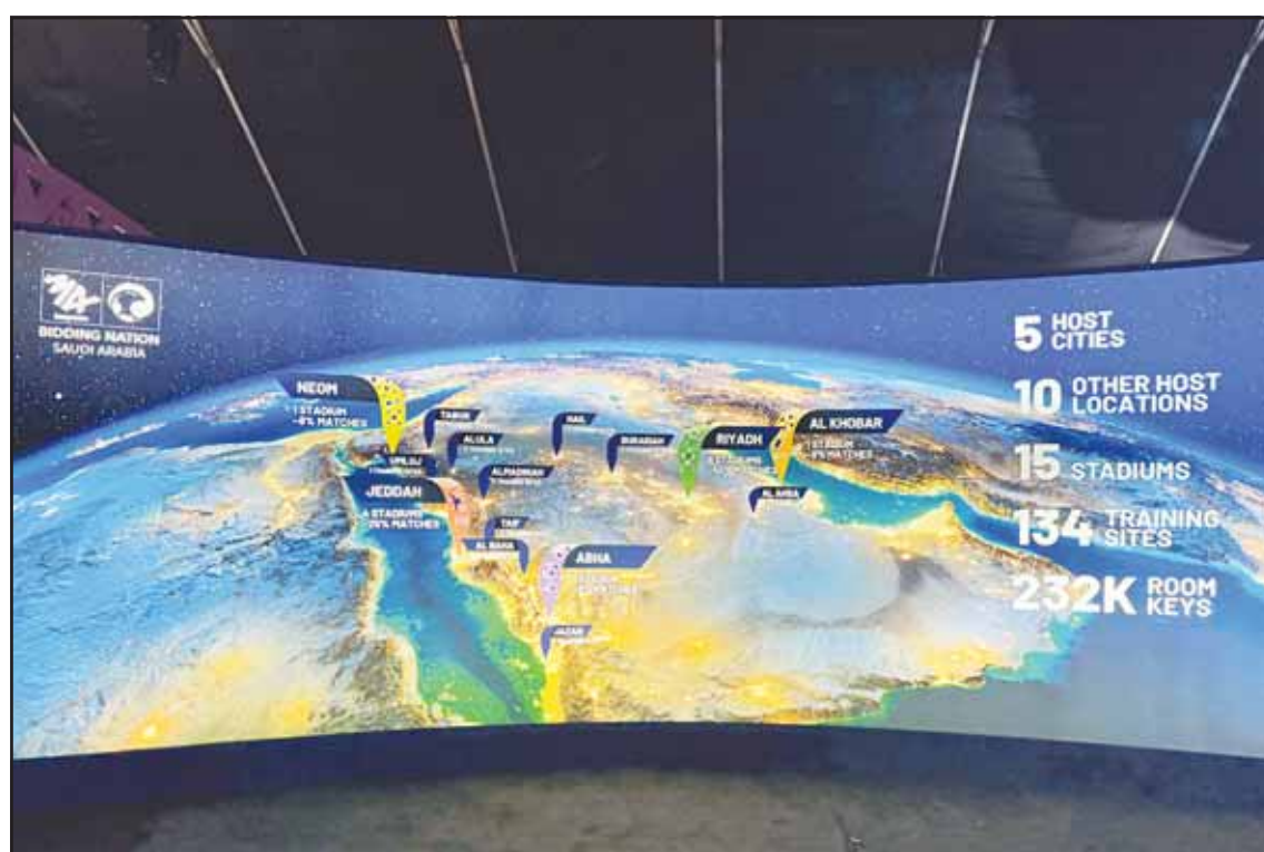
A map at the Saudi Arabia World Cup bid exhibition in Riyadh, Saudi Arabia, showing the proposed host cities and venues for the 2034 World Cup.

Saudi Arabia has shown growing influence in international sports after successfully hosting of major