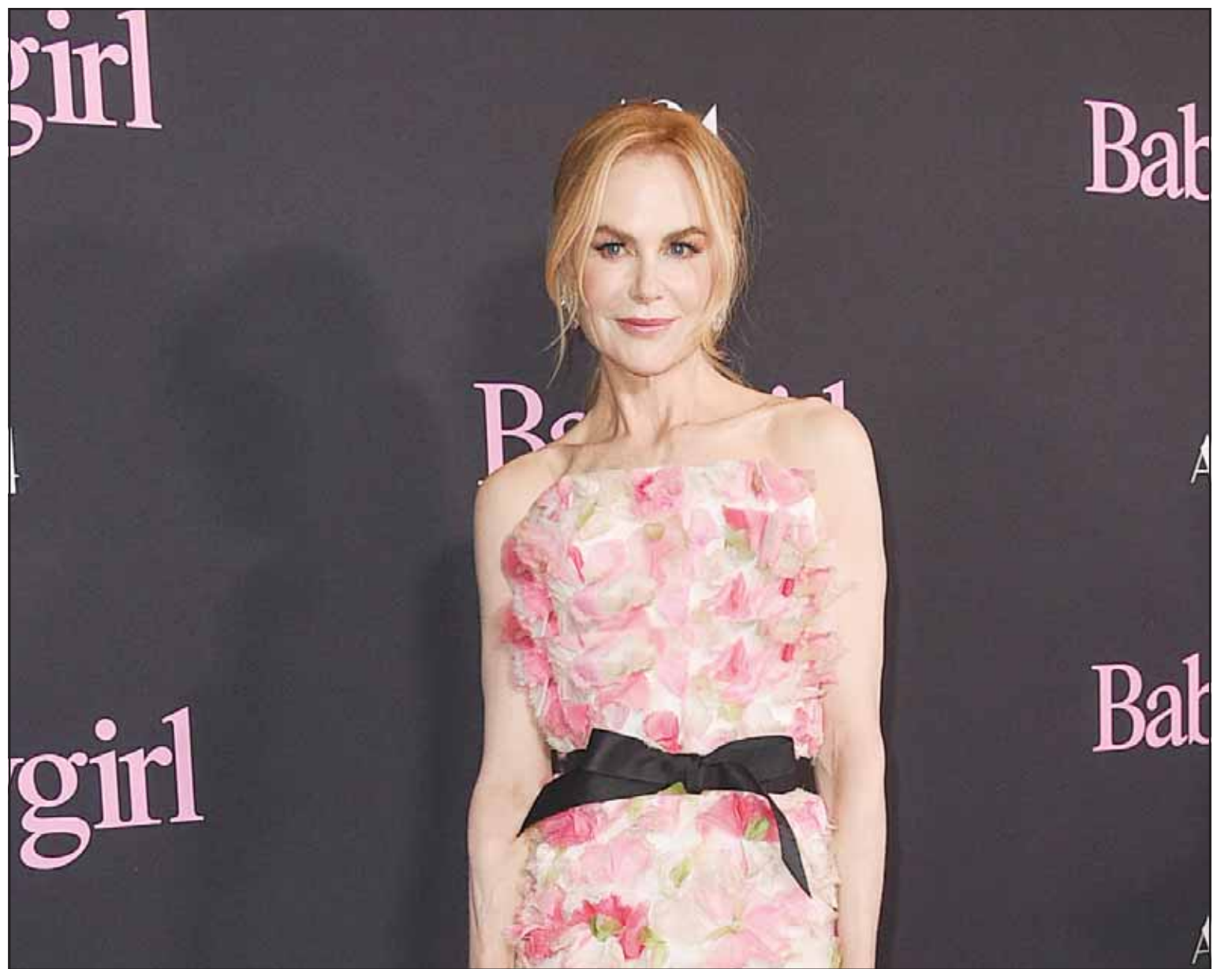
Nicole Kidman arrives at the premiere of 'Babygirl' on Wednesday, Dec. 11, at the DGA Theater in Los Angeles.