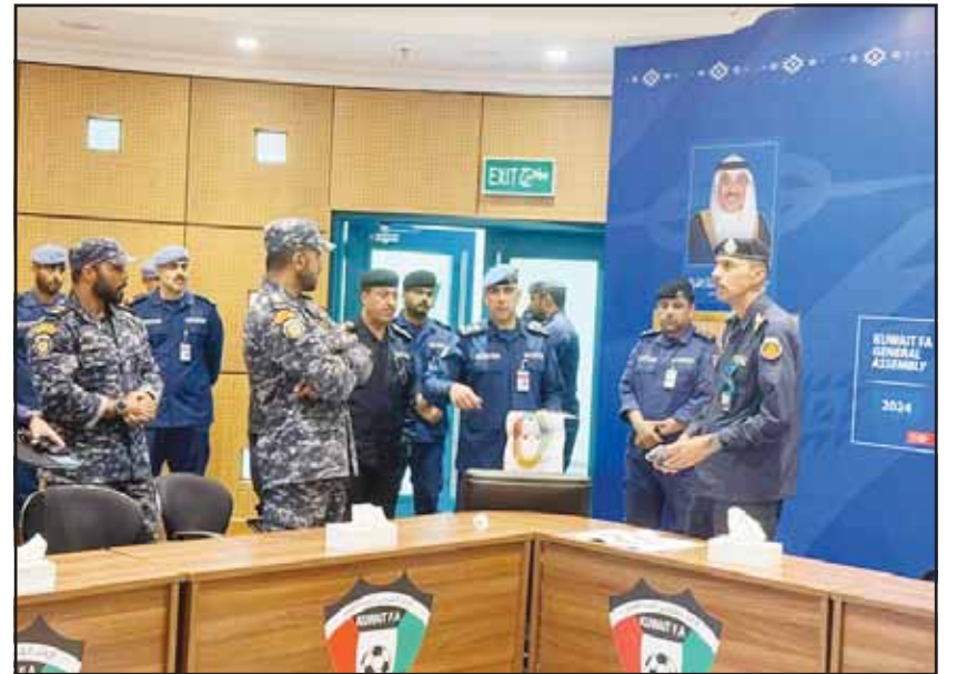
Kuwait Fire Force officials discussing preparations for the evacuation drill.

The association has made remarkable progress, with 152 centers and committees actively working across the country.