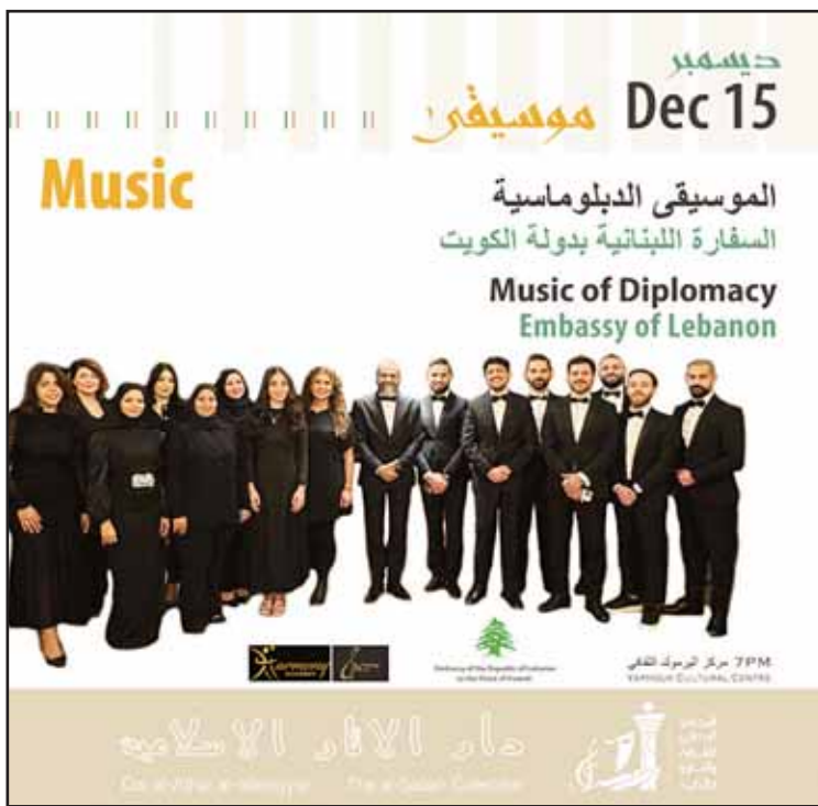
Flyer of the event.