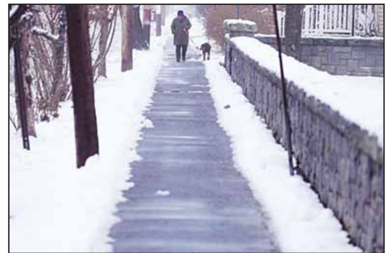
A man walks a dog as light rain falls during a winter storm on Dec 11, in Concord, NH.

"For our adversaries out there that think this is a time of opportunity that they can play one administration off the other, they're wrong, and we are - we are hand in glove," Mike Waltz, Trump's pick for national security adviser, said in a Fox News interview last month. "We are one team with the United States in this transition."