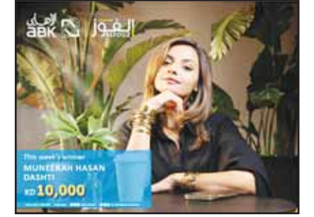
Alfouz winners flyer

fouz draw account or increase their balance to participate in the upcoming draw, which is scheduled to take place on Monday, 16 December 2024.