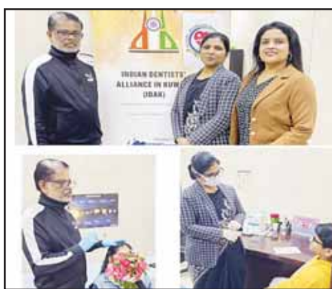
Combo photos of dental camps.