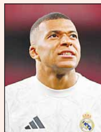
Real Madrid's Kylian Mbappé warms up prior the Spanish La Liga soccer match between Athletic Bilbao and Real Madrid at the San Mames stadium in Bilbao, Spain.

In an interview that aired Sunday on French TV station Canal