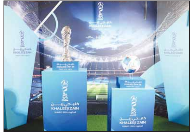
The original trophy and official ball at Zain's HQ.

Zain Group recently announced its role as the Title Partner of the tournament, now branded as Khaleeji Zain 26 for the second consecutive time. Kuwait will host this historic sporting event for the fifth time in its history, and Zain