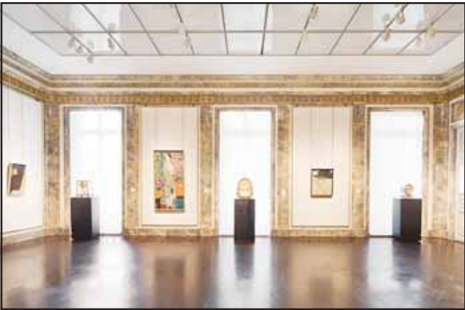
An exhibition room featuring works of Austrian and German art and design at the Neue Galerie, a museum on the Upper East Side of Manhattan in New York.