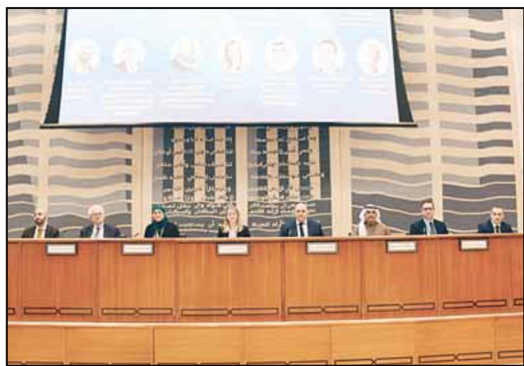
Photos from the event

Growth is anticipated to be mainly driven by the US, Brazil, Canada, and Norway. Natural gas liquids (NGLs) and non-conventional liquids from countries participating in the DoC are forecast to grow by about 0.1 mb/d, y-o-y, in 2024 to average 8.3 mb/d, followed by an increase of about 80 tb/d, y-o-y, in 2025 to average 8.4 mb/d.