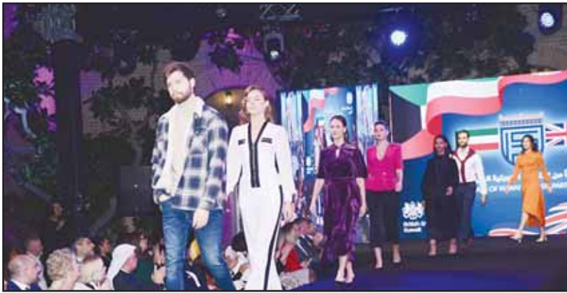
Photos during the fashion show

We look forward to exploring further opportunities to strengthen ties between our fashion industries."