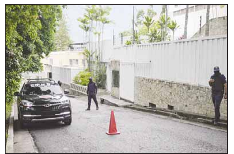
A police patrol car sits parked outside Argentina's embassy where some members of Venezuela's opposition are seeking asylum inside, in Caracas, Venezuela, July 31, 2024, three days after the contested presidential election.

A joint declaration was reached after Turkish President Recep Tayyip Erdogan met separately with Somali President Hassan Sheikh Mohamud and Ethiopian Prime Minister Abiy Ahmed on Wednesday.