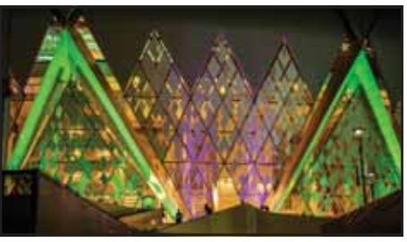
People gather at the King Abdullah Sports City stadium prior to the Soccer Club World Cup match between Al-Ittihad and Auckland City in Jeddah, Saudi Arabia.