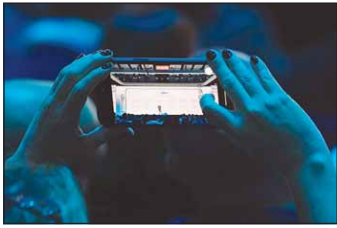
An attendee at the Microsoft Ignite conference records an address on Nov. 19, 2024, in Chicago.