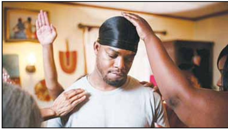
A still from 'Ricky' by Rashad Frett, an official selection of the 2025 Sundance Film Festival.