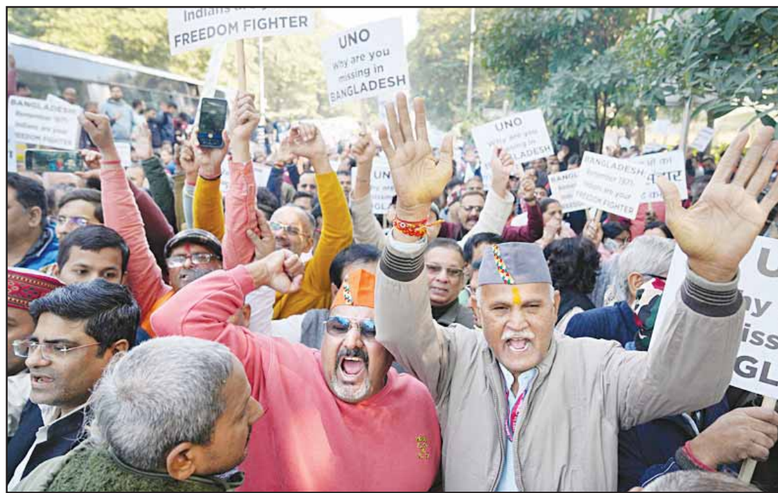
People shout slogans condemning reported attacks on Hindu and other minorities in Bangladesh during a protest near the Bangladesh diplomatic mission in New Delhi, India on Dec 10.

In his speech Thursday, Yoon said he had discussed imposing martial law only with Kim before he informed other top officials about it at a Cabinet meeting just before its declaration.