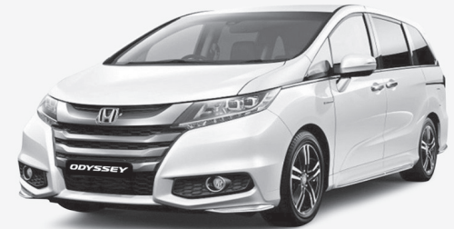
HONDA ODYSSEY J (RC-1) Model 2017 & 2018 & 2019