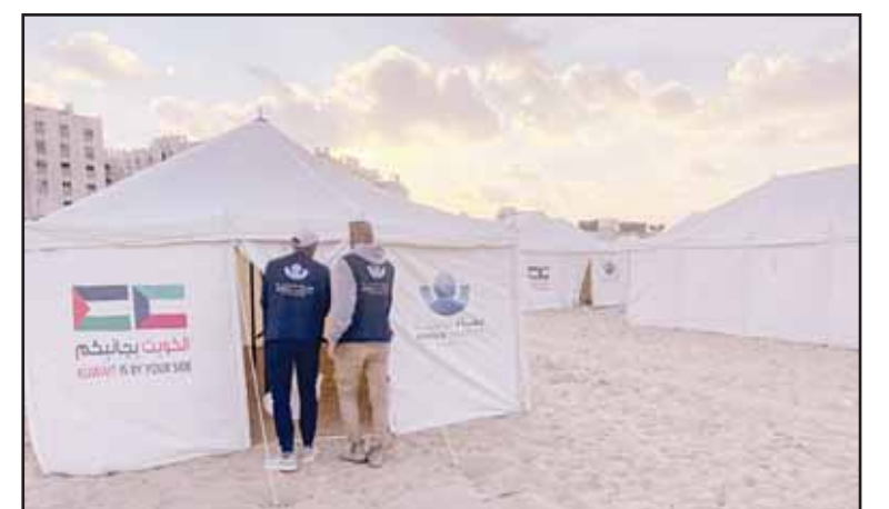
New refugee camp to house 200 families.