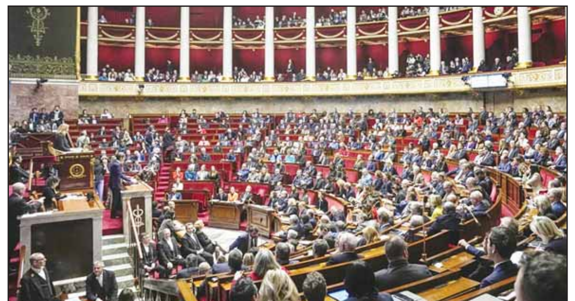
Lawmakers gather at the National Assembly on Jan 30 in Paris.

It's one of the main achievements of the European project. It started as an intergovernmental project between five EU countries - France, Germany, Belgium, the Netherlands and Luxembourg, and has gradually expanded to become the largest free travel area in the world.