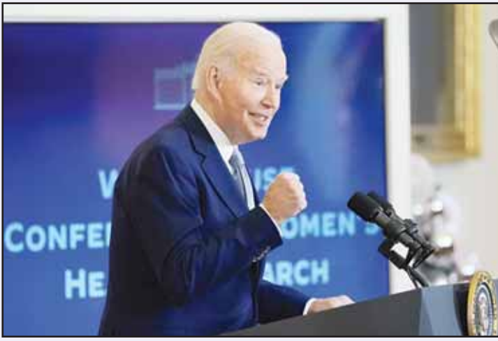
US President Joe Biden speaks at the White House Conference on Women's Health Research from the East Room of the White House in Washington on Dec 11.

Those pardoned Thursday had been convicted of nonviolent crimes such as drug offenses and turned their