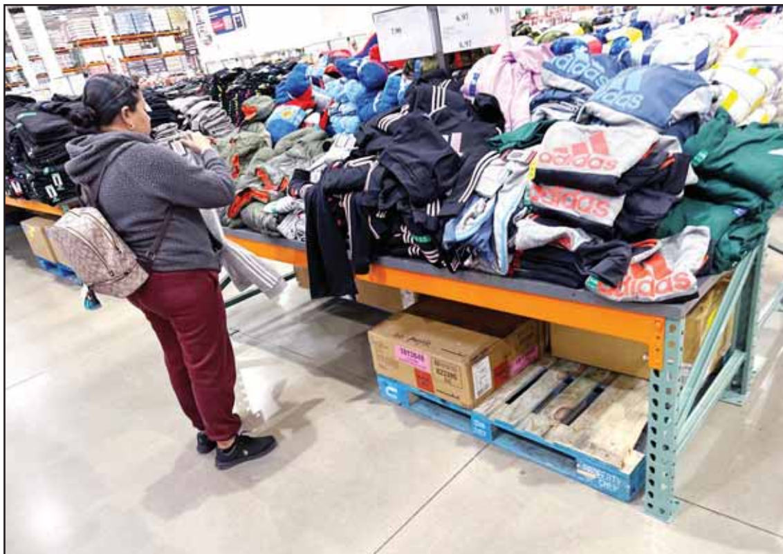
A shopper looks at clothing on display in a Costco warehouse in Sheridan, Colo.

suggested that with the economy generally healthy, the Fed could reduce its key rate slowly.