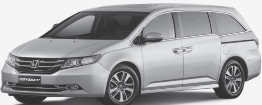
HONDA ODYSSEY (RL6) Model 2018 & 2019 & 2020