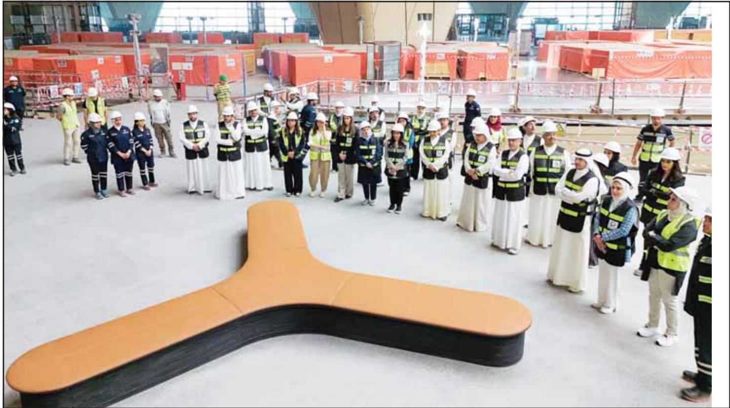
Minister of Public Works Dr. Noura Al-Mashaan checks the progress of work at the new airport terminal.

They added that the meeting affirmed the importance of integrated collaboration across all ministry sectors, with a focus on identifying clear priorities to address the most pressing issues in the educational and pedagogical fields.