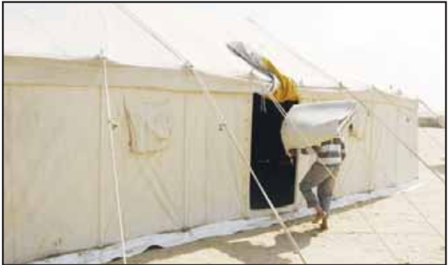
A camping tent set up in the desert.

The tweeter, whose identity has not been disclosed, was charged with publishing false information regarding the country’s internal affairs and managing several notorious fake accounts operated from outside Kuwait, some of which were registered under women’s names in London.