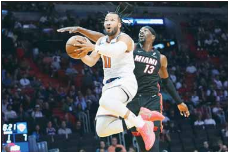
New York Knicks guard Jalen Brunson (11) goes to the basket as Miami Heat center Bam Adebayo (13) defends during the first half of an NBA basketball game in Miami.

rotation, again received contributions from throughout its deep roster as Stephen Curry missed his second straight game with a left ankle injury. He is scheduled to be re-evaluated Friday. Andrew Wiggins also sat out consecutive nights because of low back tightness. Draymond Green had 14 points and six assists. Jackson-Davis is shooting 22 for 27 (77.7%) over the first five games. Trail Blazers 106, Clippers 105 In Los Angeles, Anfernee Simons scored 25 points, Deandre Ayton had 15 points and 12 rebounds and the Portland Trail Blazers rallied to beat the Los Angeles Clippers. Deni Avdija had 13 points and 10 rebounds and made a game-saving block when he stuffed Norman Powell on a