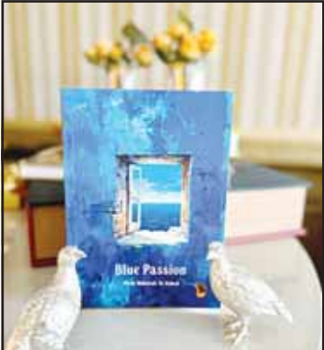
The 'Blue Passion' book