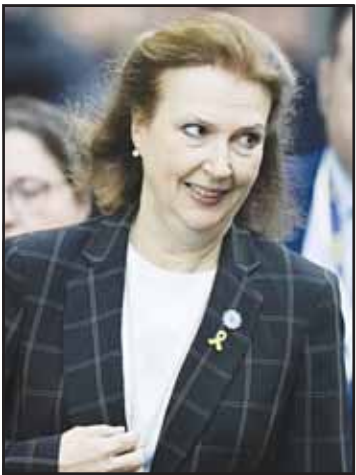
Argentine Foreign Minister Diana Mondino arrives at a ceremony in Buenos Aires, Argentina on July 18, 2024.

BUENOS AIRES, Argentina, Oct 31, Argentina's President Javier Milei dismissed his foreign affairs minister hours after the country voted in favor of lifting the U.S. economic embargo of Cuba at the UN General Assembly. Argentine Foreign Minister Diana Mondino was replaced by Argentina's ambassador to the U.S., Gerardo Werthein, Milei's spokesman Manuel Adorni said on his X account. Adorni didn't elaborate on the reasons behind the replacement, but the announcement came hours after Argentina voted Wednesday in favor of ending the embargo of Cuba. The President's office later confirmed in a press release that the dismissal was because of the vote at the U.N. "Our country is categorically opposed to the Cuban dictatorship, and it will remain firm in promoting a foreign policy that condemns all regimes that perpetuate the violation of human rights and individual freedoms," Milei's office said.