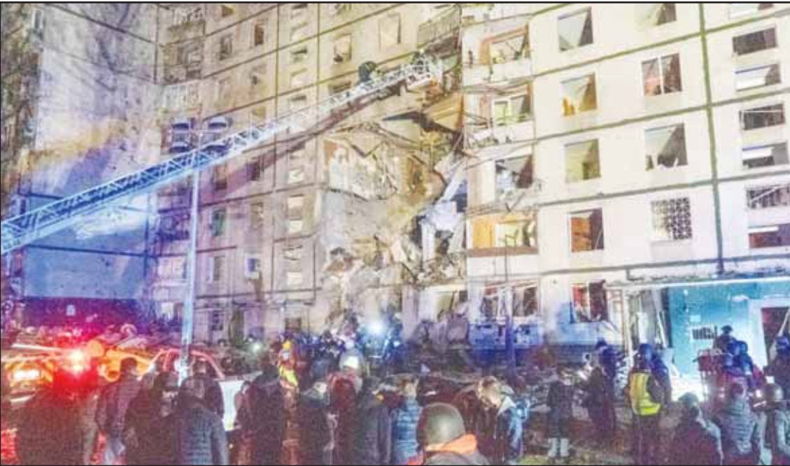
Rescuers help people after a multi-storey apartment building was hit by Russian attack in Kharkiv, Ukraine on Oct 30.

just the possibility of a second Trump presidency that has the continent anxious about tougher times ahead. European officials believe US priorities lie elsewhere, no matter who wins. The Middle East is top of President Joe Biden’s list right now, but the long-term priority is China. “The centrality of Europe to US foreign policy is different than it was in Biden’s formative years,” said Rachel Tausendfreund, a senior research fellow at the German Council on Foreign Relations in Berlin. “And in that way, it is true that Biden is the last trans-Atlantic president.” The U.S. will continue to pivot toward Asia, she said. “That means Europe has to step up. Europe has to become a more capable partner and also become more capable of managing its own security area.” Germany’s defense minister, Boris Pistorius, remarked when he signed a new defense pact with NATO ally Britain that the US will focus more on