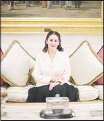
Sheikha Afrah Al Sabah