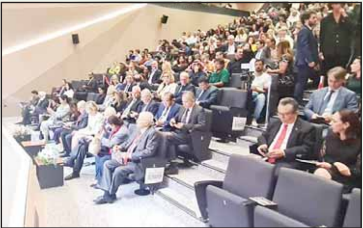
Photos taken during the event.