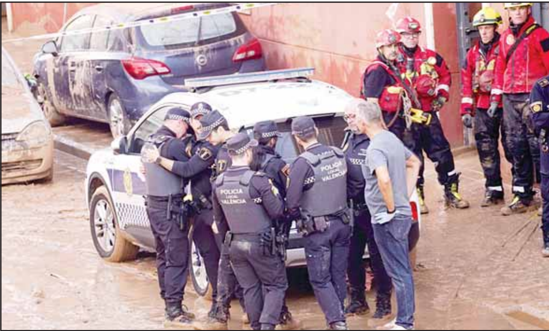
Members of the local police react to the news of one of their colleagues who died in the floods in Valencia, Spain on Oct 31.