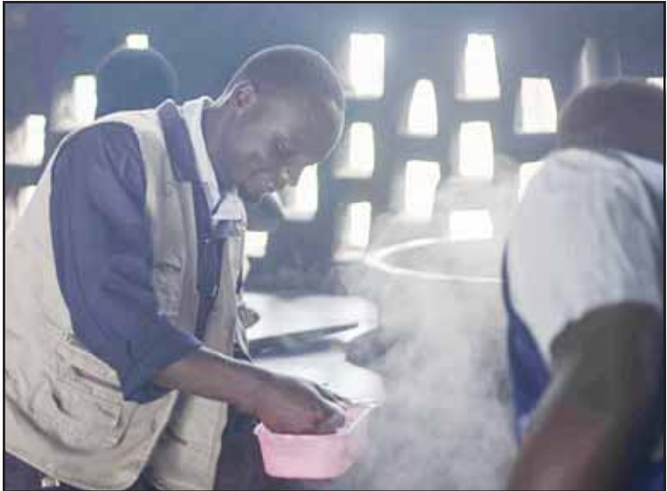
Volunteers prepare lunch for refugees at Rwamwanja Refugee Settlement in Kamwenge District, Uganda on Oct 21.