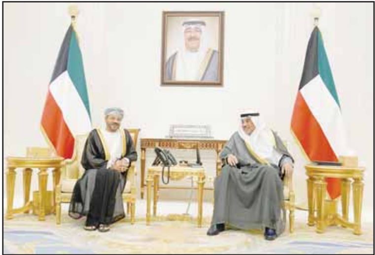
Left: HH the Crown Prince receives Omani Foreign Minister Bader Al-Bouseidi at Bayan Palace on Thursday. Right: HH the PM receives Oman's Foreign Minister.