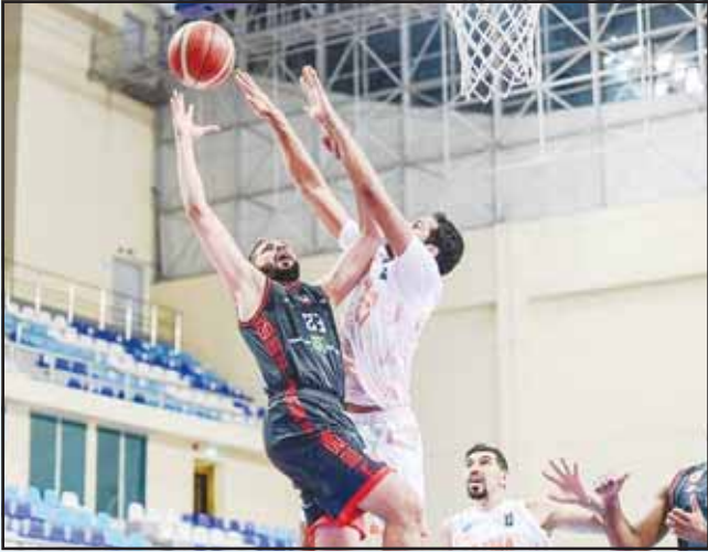
Al-Sulaibikhat and Kazma players challenge for the ball.