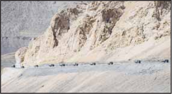
Indian army vehicles move in a convoy in the cold desert region of Ladakh, India on Sept 18, 2022. (AP)

NEW DELHI, Oct 31, (AP): India and China have moved most of their frontline troops further from their disputed border in a remote region in the northern Himalayas, India's defense minister said Thursday, some 10 days after the two countries reached a new pact on military patrols that aims to end a four-year standoff that's strained relations. Rajnath Singh said the "process of disengagement" of Indian and Chinese troops near the Line of Actual Control in