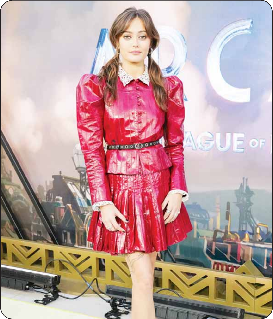
Ella Purnell arrives at the season two premiere of ‘Arcane’ on Wednesday, Oct. 30, 2024, at The Egyptian Theatre in Los Angeles.

LOS ANGELES, Oct 31, On his seventh studio album, “Chromakopia,” the multi-hyphenate Tyler, pulls back the curtain. Across 14 tracks, the rapper born Tyler Okonma interrogates the anxieties that come with age and fame, intertwining them with his own wisdom and some that arrive via carefully-placed voice messages. Tyler is a jack of all trades excelling across industries in music, fashion and television. Like his hero Pharrell Williams, Tyler is known for his unconventional fashion sense as the founder of luxury label’s Golf Wang and Golf le Fleur, along with his television work on the Adult Swim sketch comedy series “Loiter Squad.” He established his role as a counter cultural tastemaker and controversial rule breaker with his first mixtape, 2009’s album and continues to push the boundaries of music - it’s no wonder his latest release continues to break barriers. “Chromakopia” starts off strong with “St. Chroma” - an introduction to the new masked persona on the album’s cover - with forceful military cadences in the background of both Tyler and R&B singer Daniel Caesar’s vocals. A reassuring woman’s voice is heard at the beginning, “You are the light. It’s not on you. It’s in you.” “I ain’t never had a doubt inside me,” he raps. “And if I ever told you that I did, I’m (expletive) lyin’.” As a whole, the album “Chromakopia” represents the two-time Grammy-award winning artist as he delves into his 30s. In this new era, he seeks understanding in