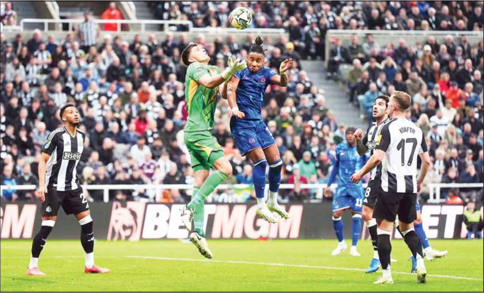
Newcastle United goalkeeper Nick Pope, left, and Chelsea's Christopher Nkunku battle for the ball during the English League Cup fourth round soccer match between Newcastle United and Chelsea at St James' Park, Newcastle, England.

The Netherlands international scored in the 46th and 63rd minutes at Amex Stadium, while Luis Diaz added a third in the 85th after Brighton had pulled a goal back through Simon Adingra. Liverpool held on after Tariq Lamptey scored Brighton's second goal in the 90th and will need to make another trip to the south coast in the last eight to play Southampton. Liverpool has won the League Cup a record 10 times, most recently last season with a victory over Chelsea in the final. Newcastle beat Chelsea 2-0 thanks to Alexander Isak's close-range strike and an own-goal by Axel Disasi and next faces Brentford, while Palace - fielding American goalkeeper Matt Turner for his debut and his first club appearance since April 2 for Nottingham Forest - defeated Aston Villa 2-1 thanks to goals by Eberechi Eze and Daichi Kamada. Jhon Duran netted for Villa. Palace's reward is a last-eight match against Arsenal, which was a 3-0 winner at second-tier Preston after goals by Gabriel Jesus, Ethan Nwaneri and Kai Havertz. Tottenham vs Manchester United Arsenal vs Crystal Palace Newcastle vs Brentford Southampton vs Liverpool