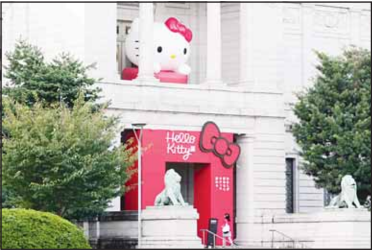
Hello Kitty display is seen at the Tokyo National Museum where the exhibition ‘As I change, so does she,’ is held.