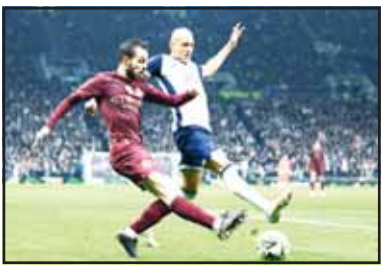
Manchester City's Bernardo Silva, front, duels for the ball with Tottenham's Richarlison during the English League Cup fourth round soccer match between Tottenham and Manchester City, at the Tottenham Hotspur Stadium in London. Tottenham won 2-1. — See Page 15