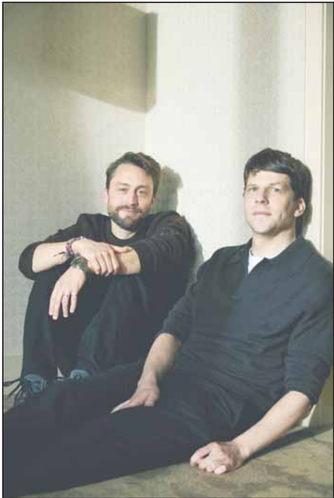
Kieran Culkin, (left), and Jesse Eisenberg pose for a portrait to promote the film ‘A Real Pain’ on Thursday, Oct. 17, 2024, in New York.