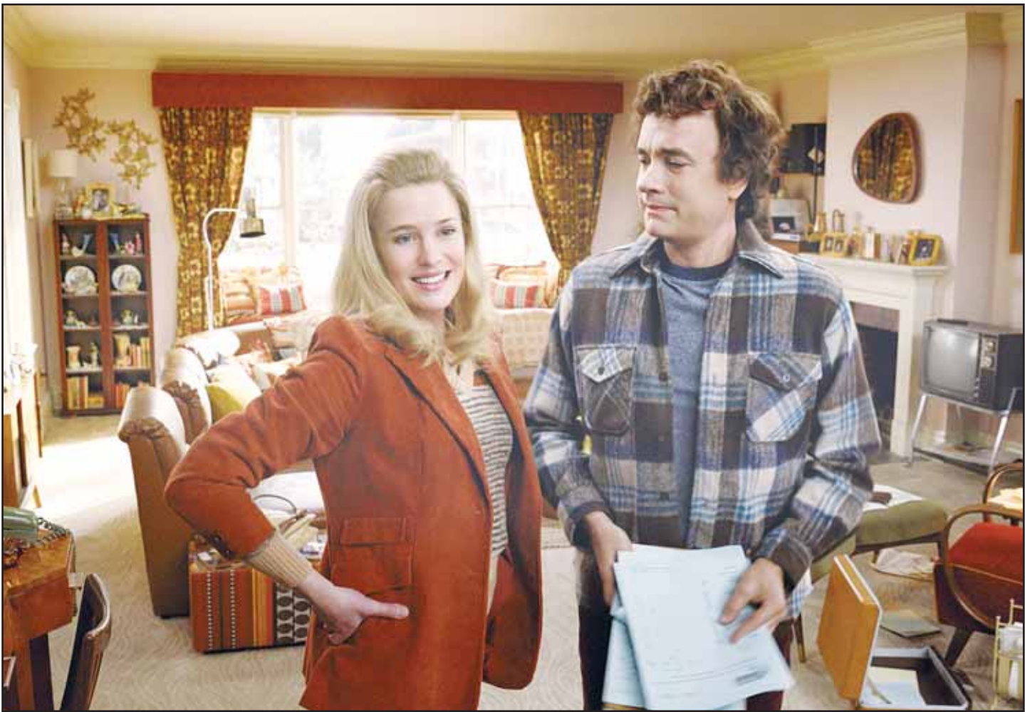
This image released by Sony Pictures Entertainment shows Tom Hanks, (right), and Robin Wright in a scene from ‘Here.’

But with “A Real Pain,” they needn’t have worried. It was celebrated by audiences and critics and had distributors lining up to chat with Eisenberg moments after its premiere. The sale turned into one of those famous all-night sessions that are rarer and rarer for festival breakouts these days.