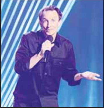
This image released by HBO shows actor-comedian-host Seth Meyers in a scene from his comedy special ‘Seth Meyers: Dad Man Walking.’

Known for his biting political commentary, Meyers says the humor in his act stems from recognizing how men and women fail each other, and he tries to spread the blame around fairly. “I’m so loath to do that special about a man complaining about his wife,” Meyers said. He enjoys when husbands and wives both recognize themselves in his comedy. “The bal-