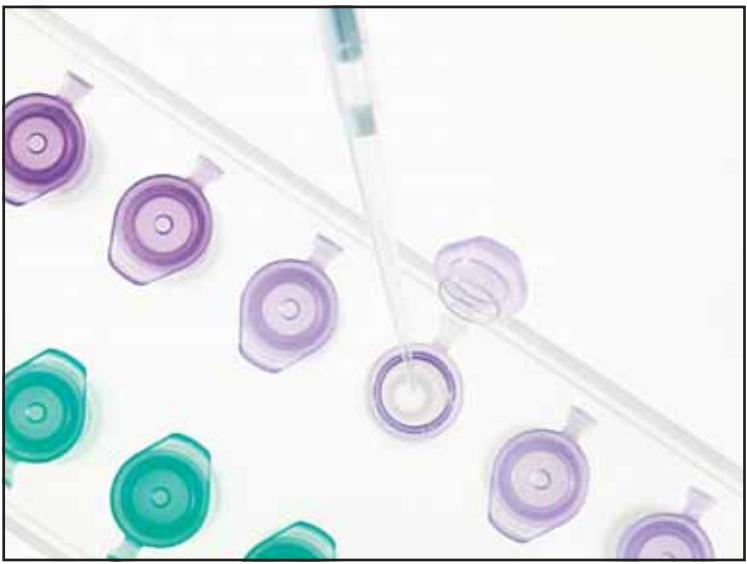
Overhead view of pipetting DNA sample into microcentrifuge tubes.

in market research and consulting survey, found that 74% of smokers across the world believe that vaping is at least as harmful as smoking cigarettes. In fact, misinformation is so rampant in countries such as Brazil, the Netherlands, Slovenia and Kazakhstan that 80% of smokers polled consider vaping to be more harmful than tobacco. These statistics illustrate the scale of the challenge facing public health officials, as well as the educational efforts and messaging needed to change perspectives. Significant misperceptions about reduced risk* alternatives and the role of THR policies in public health continue to prevail, particularly on the global