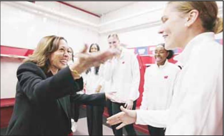
Top: Republican presidential nominee former US president Donald Trump talks to reporters as he sits in a garbage truck on Oct 30, in Green Bay, Wis. Above: Democratic presidential nominee Vice President Kamala Harris greets the Wisconsin Badgers women's volleyball team before speaking at a campaign rally at the Alliant Energy Center in Madison, Wis on Wednesday.

Trump boards garbage truck to draw attention to Biden remark