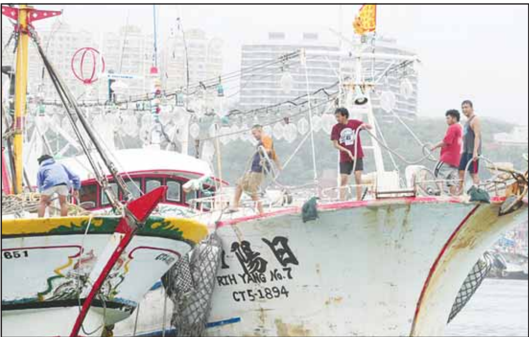
Fishermen secure their boats ahead of the arrival of Typhoon Kong-rey at Pa-tou-tzu fishing harbor in Keelung in northeastern Taiwan on Oct 30.