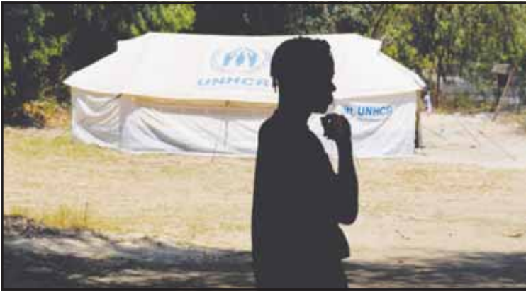
A refugee man stands in front of a tent at a camp inside the UN controlled buffer zone that divides the north part of the Turkish occupied area from the south Greek Cypriots at Aglantzia area in the divided capital Nicosia, Cyprus on Aug 9. (AP)

Musk wins court victory: A federal agency was wrong to order that Tesla CEO Elon Musk delete a 2018 social media post that union leaders saw as a threat to employee stock options, a sharply divided federal appeals court has ruled. The case involved a post made on what was then known as Twitter during United Auto Workers organizing efforts at a Tesla facility in Fremont, California. The post was made years before Musk bought the platform, now known as X, in 2022. The National Labor Relations Board said it was an illegal threat. After Tesla appealed, three judges on the 5th U.S. Circuit Court of Appeals in New Orleans upheld that decision. (AP) □ □ □ Man guilty of murder: A jury has found a man guilty of breaking into a room at a Las Vegas Strip hotel-casino and robbing and killing two Vietnamese tour leaders in June 2018. Julius Damiano Deangilo Trotter stood with his lawyers, shaking his head and glancing several times at jurors while the unanimous verdicts were read Tuesday in Clark County District Court, the Las Vegas Review-Journal reported. (AP)