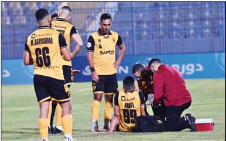
Al-Qadisiya suffers from injuries before facing Khaitan.

KUWAIT CITY, Oct 31: The ninth round of the Zain Premier League begins with a single matchup between Al-Qadisiya and Khaitan at 5:30 pm at Mohammed Al-Hamad Stadium. Tomorrow, two games are scheduled: Al-Tadamon will face Kuwait at 5:30 p.m. at Al-Sadaka and Al-Salam Stadium, followed by Kazma hosting Al-Yarmouk at Abdullah Al-Khalifa Stadium at 7:50 pm. On Sunday, Al-Nasr will take on Al-Fahaheel at Abdullah Al-Khalifa Stadium at 6:50 pm. The round concludes next Wednesday with Al-Arabi playing Al-Salmiya at Thamer Stadium, as Al-Arabi has commitments in the Asian Challenge League. In today's match, Al-Qadisiya, currently fourth in the standings with 13