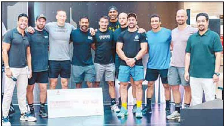
Group pictures during breast cancer awareness campaign.

KUWAIT CITY, Oct 31: As part of its social responsibility and commitment to supporting the community, Al Hamra Real Estate Company launched the ‘October Promise’ Pledge campaign under the global theme “No One Should Face Breast Cancer Alone” at Al Hamra Shopping Center at the beginning of October. The campaign aims to raise awareness of the importance of early detection of breast cancer and encourages individuals to adopt healthy lifestyles that help prevent the disease. This is in line with the company’s strategy to enhance community health and support government efforts to tackle this global health issue.