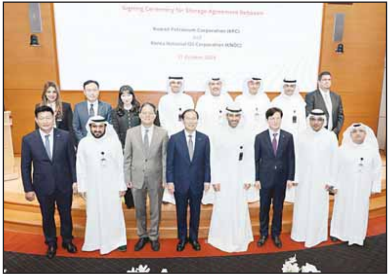
Group photo of leaders of Kuwait Petroleum Corporation and Korea National Oil Corporation.

The Ministry of Interior said in a statement that the committee decided to strip 489 individuals of Kuwaiti citizenship, pending referral to the Cabinet.