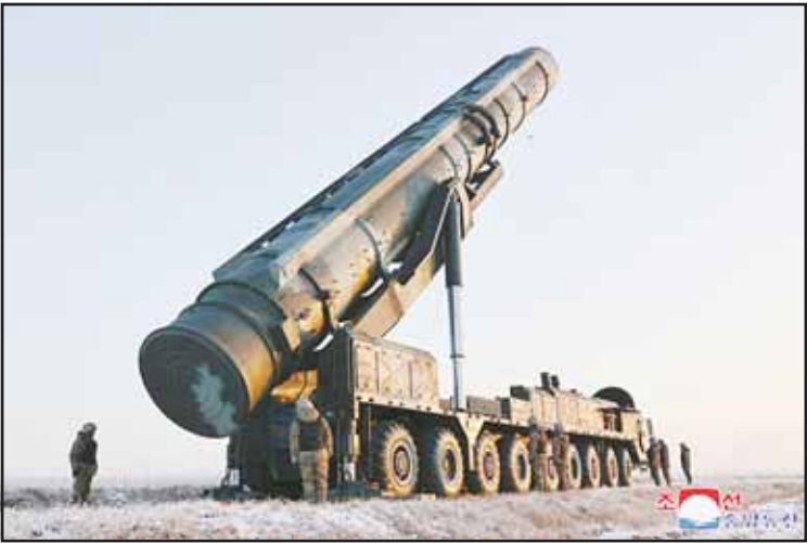
This undated photo provided Dec 19, 2023, by the North Korean government shows what it says is an intercontinental ballistic missile (ICBM) being prepared to launch from an undisclosed location in North Korea.