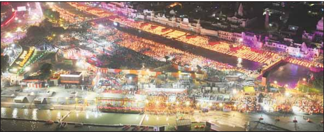
A record 2.51 million earthen oil lamps are lit along the Saryu river during Deepotsav celebrations on the eve of Diwali, creating a new Guinness World Record, in Ayodhya, India on Oct 30.

Ladakh is "almost complete." The Line of Actual Control separates Chinese and Indian-held territories from Ladakh in the west to India's eastern state of Arunachal Pradesh, which China claims in its entirety. India and China fought a deadly war over the border in 1962. Ties between the two countries deteriorated in July 2020 after a military clash killed at least 20 Indian soldiers and four Chinese. That turned into a long-running standoff in the rugged mountainous area, as each side stationed tens of thousands of military personnel backed by artillery, tanks and fighter jets in close confrontation positions. Earlier this month the two neighbors announced a border accord aimed at ending the standoff, followed by a meeting between India's Prime Minister Narendra Modi and China's President Xi Jinping on the sidelines of the recent BRICS summit in Russia, their first bilateral meeting in five years. It's not clear how far back the troops were moved, or whether the pact will lead to an overall reduction in the number of soldiers deployed along the border. "Our efforts will be to take the matter beyond disengagement; but for that, we will have to wait a little longer," Singh said. Chinese Defense Ministry spokesperson Zhang Xiaogang said Thursday that the frontline troops were "making progress in implementing the resolutions in a orderly manner."