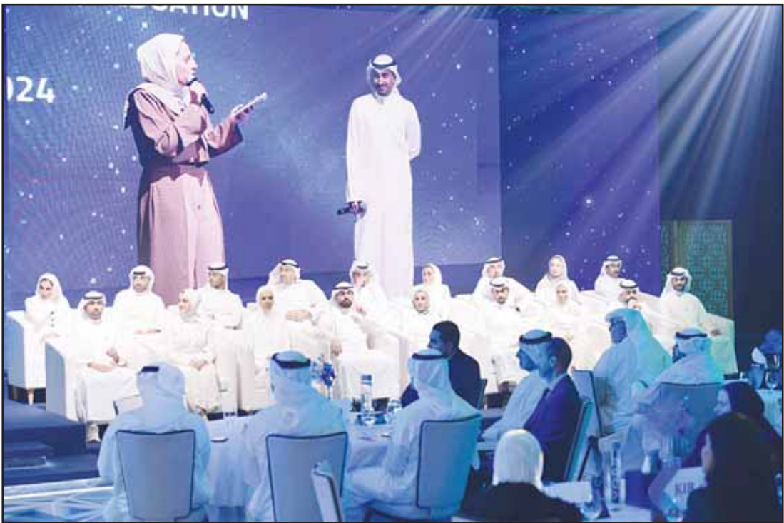
'Waed' Talent Program