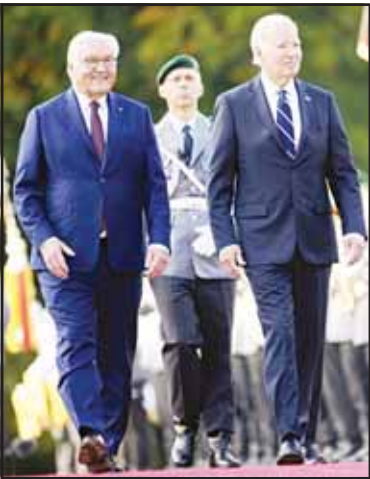
US President Joe Biden and German President Frank-Walter Steinmeier inspect the military honour guard during the welcoming ceremony at Bellevue Palace in Berlin, Germany on Oct 18. (AP)

BERLIN, Oct 31, (AP): The United States’ European allies are bracing for an America that’s less interested in them no matter who wins the presidential election - and for old traumas and new problems if Donald Trump returns to the White House. The election comes more than 2 1/2 years into Russia’s full-scale invasion of Ukraine, in which Washington has made the single biggest contribution to Kyiv’s defense. There are question marks over whether that would continue under Trump, and how committed he would be to NATO allies in general. A win by Vice President Kamala Harris could be expected to bring a continuation of current policy, though with Republican opposition and growing war fatigue among the US public there are concerns in Europe that support would wane. Trump’s appetite for imposing tariffs on US partners also is causing worry in a Europe already struggling with sluggish economic growth. But it’s not