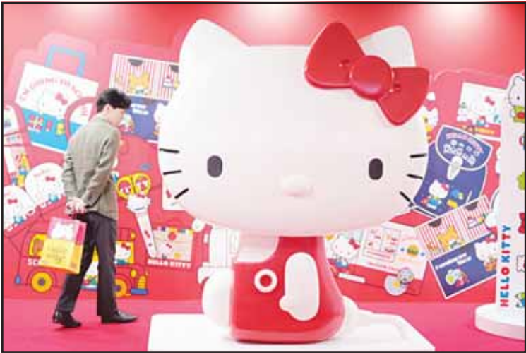
A visitor looks at giant Hello Kitty display at the exhibition ‘As I change, so does she.’