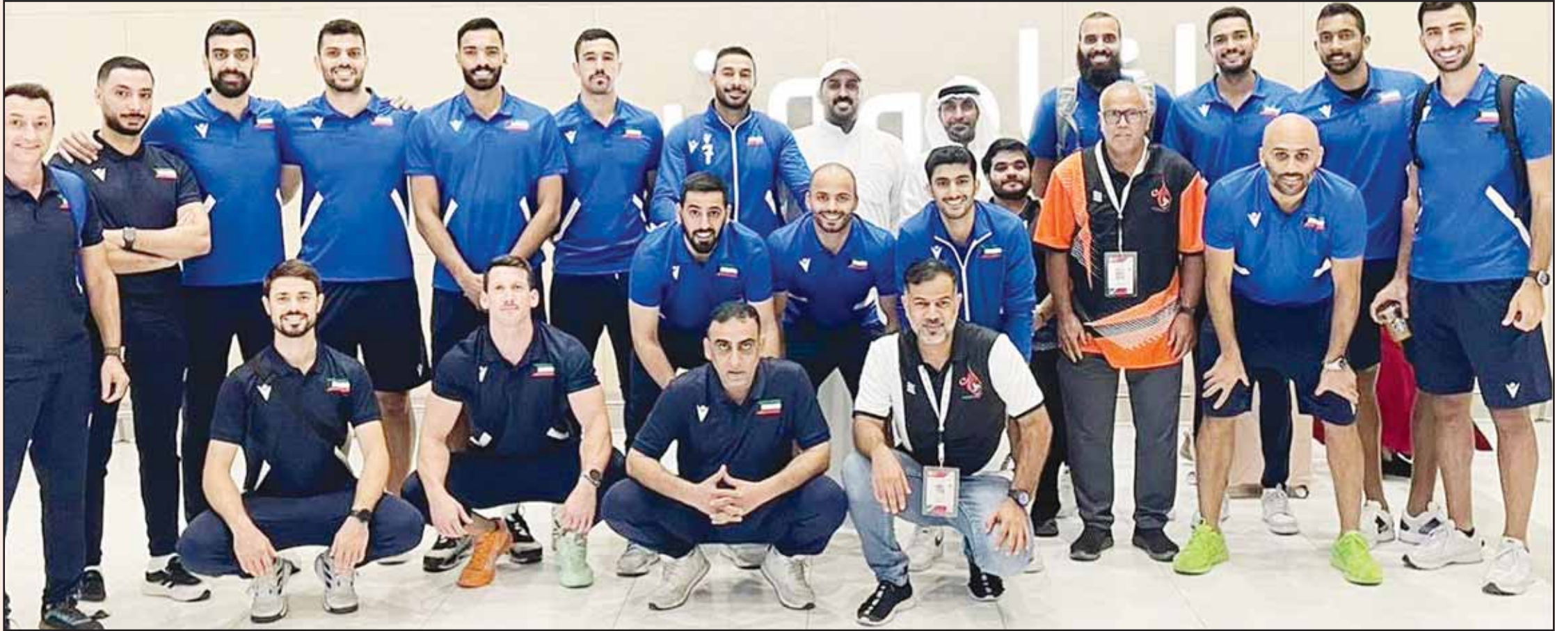
Kuwait delegation arrives in Manama.

By Khaled Al-Enezi Al-Seyassah/Arab Times Staff