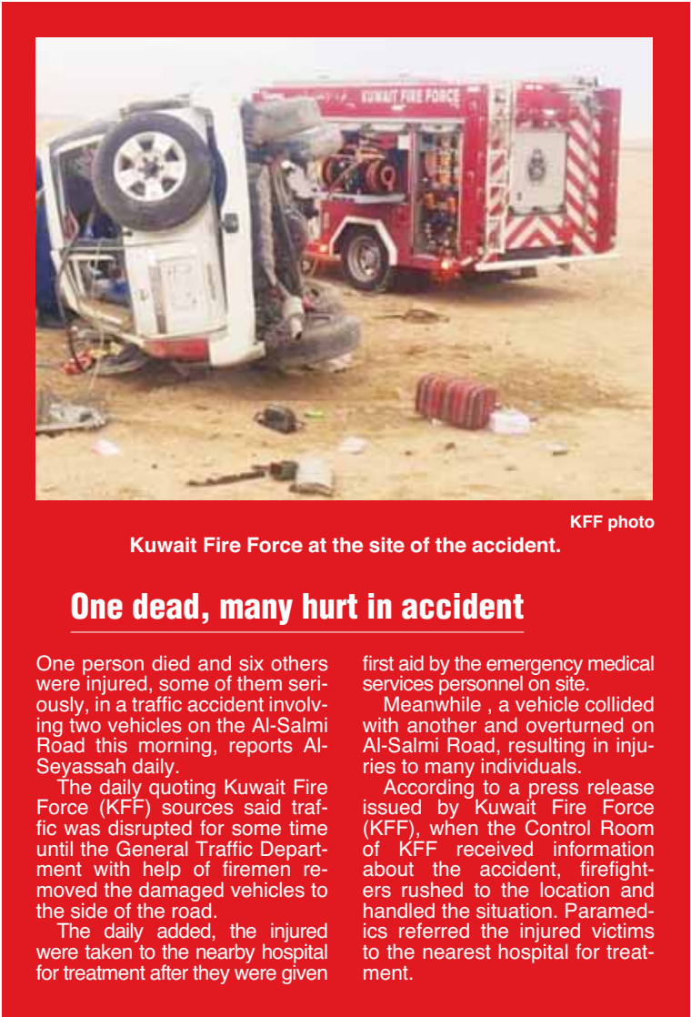
Kuwait Fire Force at the site of the accident.

— Compiled by PFX Fernandes/ Mahmoud Attiyeh