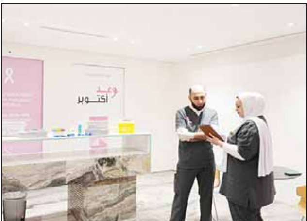
More photos of the campaign.