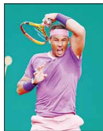
In this file photo, Rafael Nadal of Spain follows his shot to Andrey Rublev of Russia during their quarterfinal match of the Monte Carlo Tennis Masters tournament in Monaco.

Nadal's unrelenting, physical style of play - every point pursued as though it were his last, sprinting and sliding into place for that high-bouncing bull-whip of a lefty forehand - made him one of the greats of the game and the unquestioned King of Clay, the slow, red surface on which he claimed his record 14 French Open championships. That's more than anyone, man or