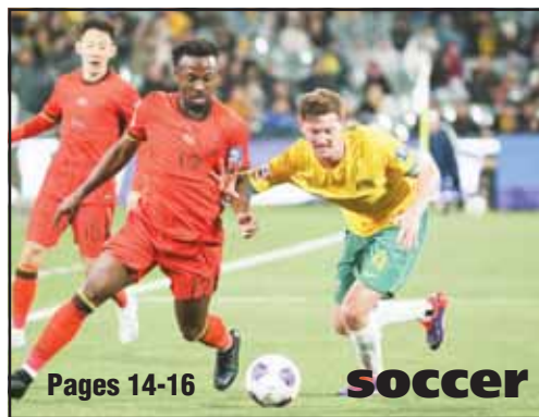
Pages 14-16 soccer