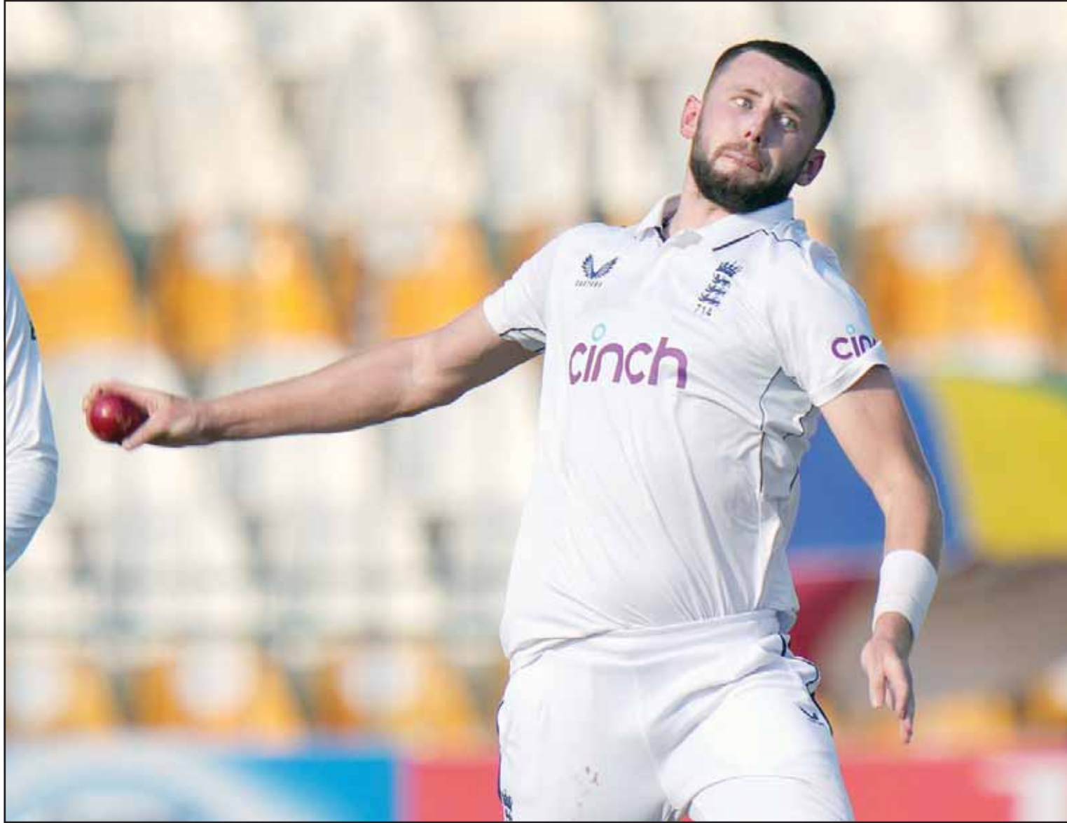
England's Gus Atkinson bowls during the fourth day of the first test cricket match between Pakistan and England, in Multan, Pakistan. (AP)