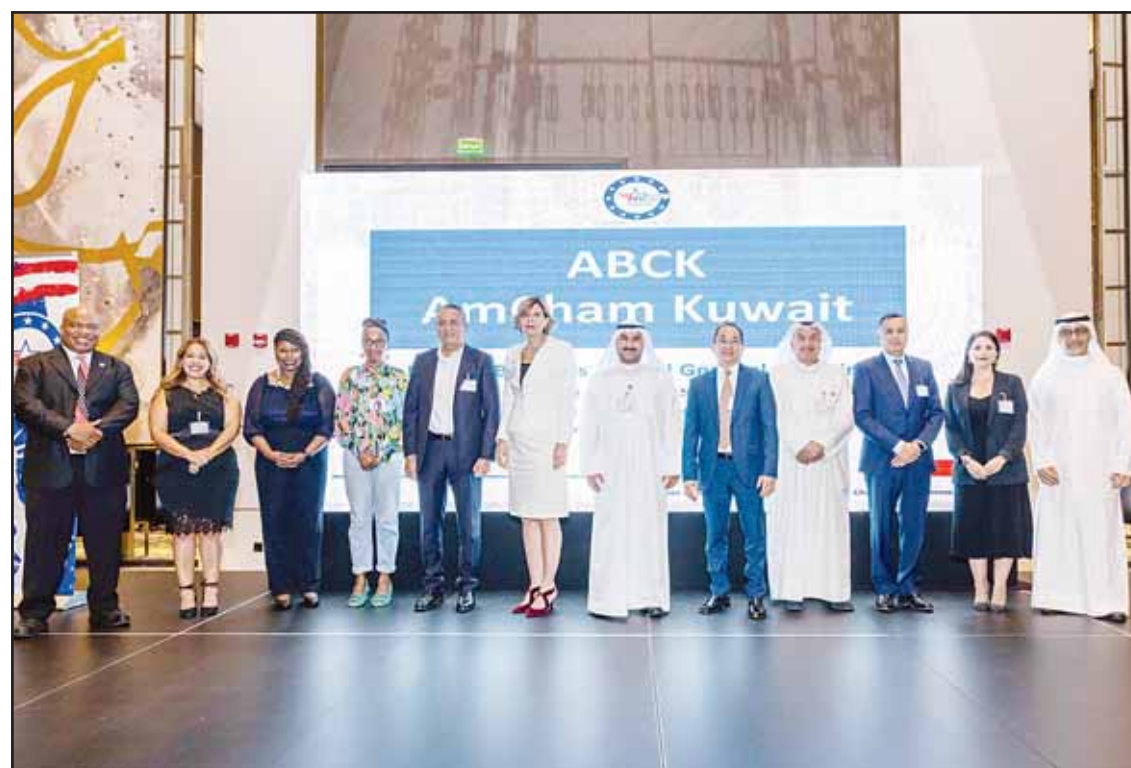
Photo during the Back to Business Annual General Meeting.