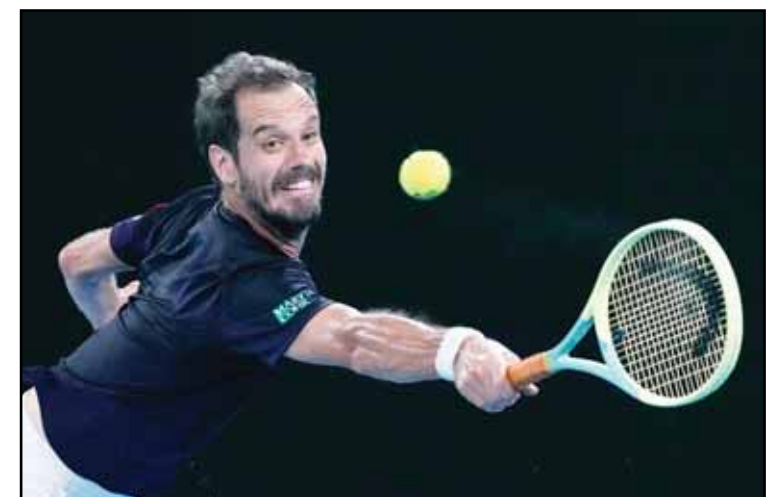
In this file photo, Richard Gasquet of France plays a backhand return to Carlos Alcaraz of Spain (unseen) during their first round match at the Australian Open tennis championships at Melbourne Park, Melbourne, Australia.

"It's wonderful to have been compared, for a little while, to Rafael Nadal, one of the greatest sportsmen in history," Gasquet wrote in his memoirs. "Deep down, I take it as a huge compliment. But how much it hurt me!" Nadal's shadow remained to the end. A few hours after Gasquet announced his retirement, it was Nadal's turn to announce his departure from tennis.