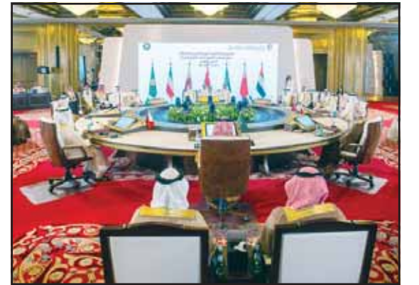
Photo during the start of the 28th meeting of the Gulf Ministerial Committee for Post and Telecommunications in Qatar.

Kuwait delegation at the GCC Ministerial Committee for Post and Telecommunications was headed by Minister of State for Communication Affairs Omar Al-Omar.