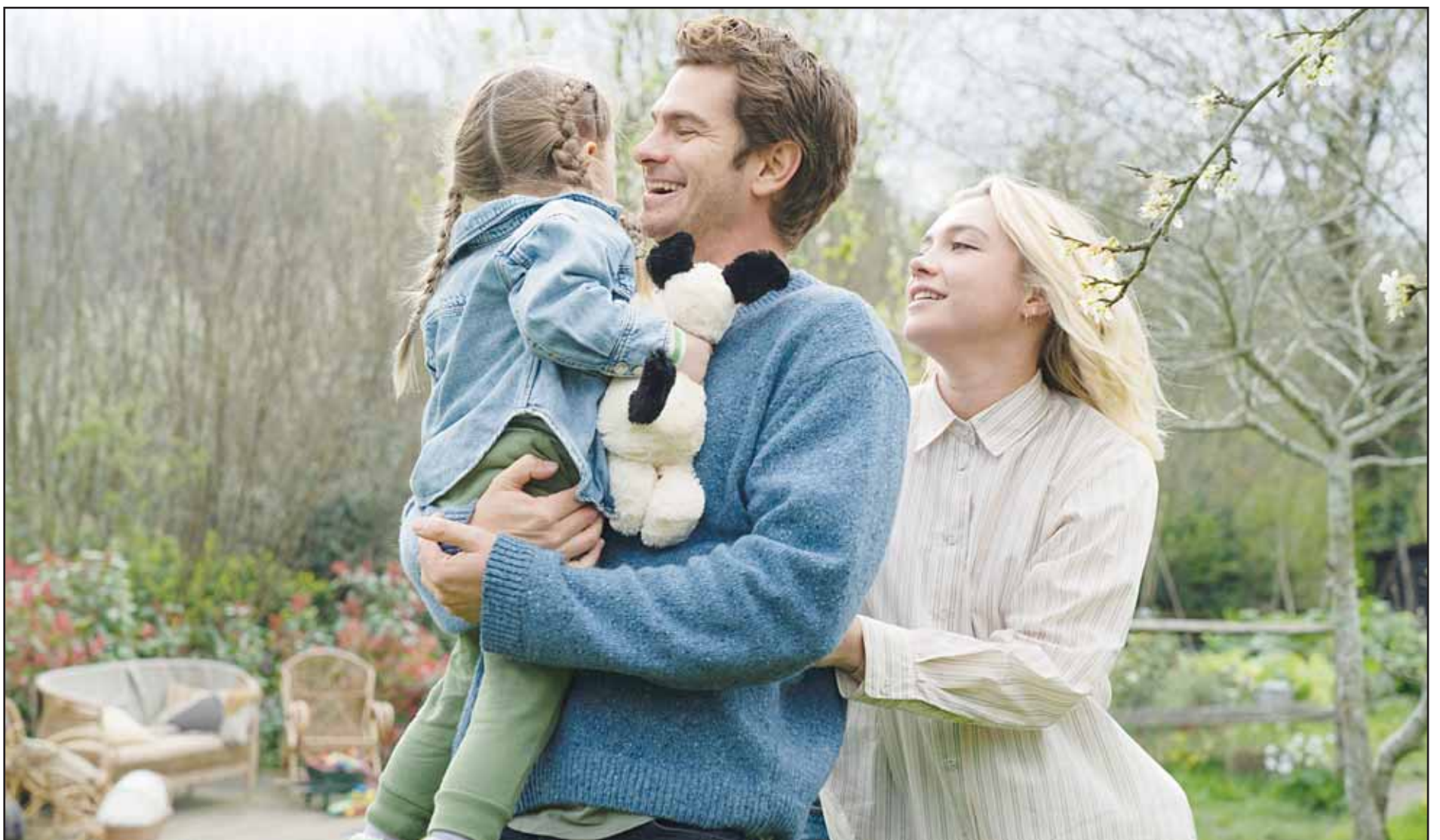
shows Andrew Garfield, center, and Florence Pugh, (right), in a scene from ‘We Live In Time.’