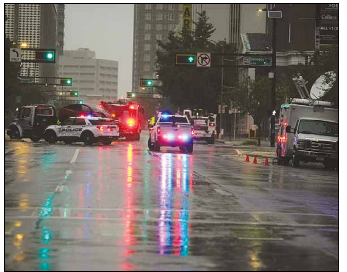
Police respond to a traffic accident between a car and a fire truck returning from a call, on near-deserted streets in downtown Tampa, Fla., during the approach of Hurricane Milton on Oct 9.

Four people were killed in tornadoes there, the St. Lucie County Sheriff's Office said.