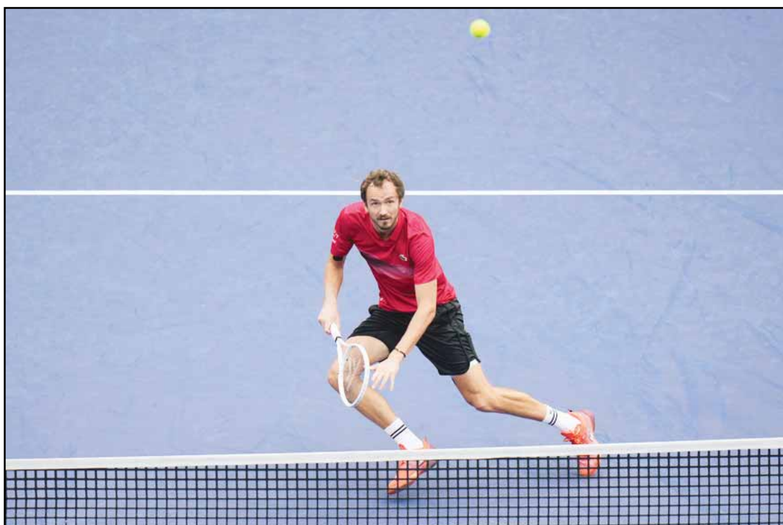
Daniil Medvedev of Russia watches the ball as he plays against Jannik Sinner of Italy during the men's singles quarterfinals match in the Shanghai Masters tennis tournament at Qizhong Forest Sports City Tennis Center in Shanghai, China.

He had spells in charge of Aldosivi and Racing Club before joining Guadalajara in December 2023.