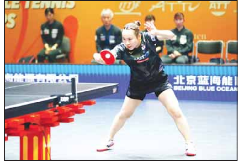
Ito Mima of Japan hits a return to Sun Yingsha of China during the women's teams final match between China and Japan at the 27th ITTF-Asian Table Tennis Championships in Astana, Kazakhstan.

Running from Monday to Sunday, the 27th Asian Table Tennis Championships in Astana, Kazakhstan, feature a total of seven events, namely men's and women's team, singles and doubles events and mixed doubles event.