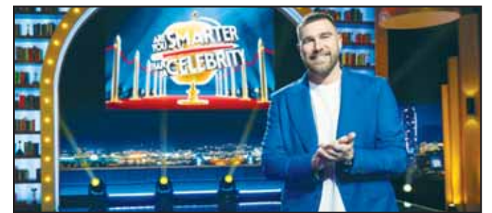
Travis Kelce on the set of the new game show ‘Are You Smarter Than a Celebrity.’

“We Live in Time,” an A24 release in New York and Los Angeles Friday and nationwide Oct. 18, is rated R by the Motion Picture Association for “language, sexuality and nudity.” Running time: 107 minutes. Three stars out of four.