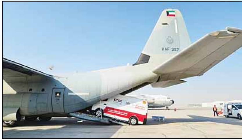
Uploading the ambulance onboard the 17th relief plane of the Kuwaiti Air Bridge.

KUWAIT CITY, Oct 10, (KUNA): His Highness the Amir Sheikh Meshal Al-Ahmad Al-Jaber Al-Sabah sent on Thursday a cable to the President of Fiji Ratu Wiliame Katonivere, congratulating him on the country's national day. His Highness the Amir wished President Katonivere good health, his country and people further progress and prosperity. His Highness the Crown Prince Sheikh Sabah Khaled Al-Hamad Al-Sabah sent on Thursday a congratulatory cable to the President of Fiji Ratu Wiliame Katonivere on his country's national day, wishing him good health and further progress and prosperity. His Highness the Prime Minister Sheikh Ahmad Abdullah Al-Ahmad Al-Sabah sent Thursday a cable to the President of Fiji Ratu Wiliame Katonivere congratulating him on his country's national day.