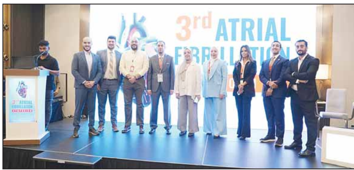
Participants at the 'Atrial Fibrillation' symposium.

e. Contributing to research and advocacy: I aspire to engage in research and advocacy efforts that highlight the importance of therapeutic nutrition in healthcare. By contributing to the body of knowledge in this field, I hope to influence practices and policies that improve the quality of care for those with nutritional issues.