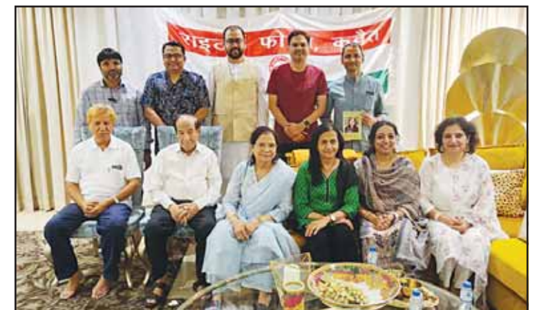
Group photo of the meeting.