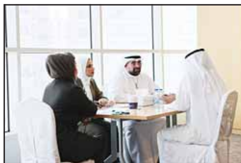
NBK partakes in career day to attract young Kuwaiti talent.

"NBK not only provides job opportunities in one of the leading financial institutions locally and regionally, but also a promising career path and prospects. This is done thanks to its world-class