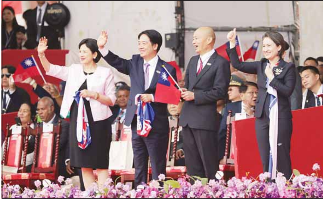
From left: Taiwan first lady Wu Mei-ru, Taiwanese President Lai Ching-te, Speaker of the Legislature Han Guo-yu and Vice President Hsiao Bi-khim wave during National Day celebrations in front of the Presidential Building in Taipei, Taiwan on Oct 10.

Maintaining its military pressure on Taiwan, China's People's Liberation Army sent 15 planes across the median line in the Taiwan Strait, prompting