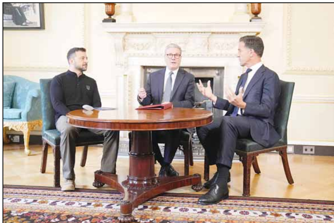
Britain's Prime Minister Keir Starmer, (center), NATO Secretary General Mark Rutte, (right), and Ukrainian President Volodymyr Zelenskyy meet inside 10 Downing Street in London on Oct 10.