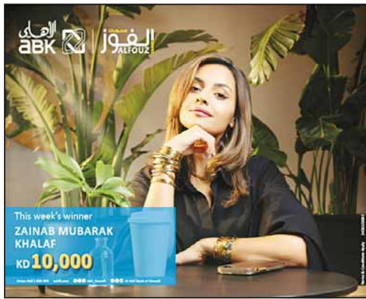
ABK Alfouz winners

By introducing a KD 100,000 quarterly draw, in addition to an exciting KD 20,000 monthly draw, the Alfouz offering has continued to surpass expectations and deliver even more customer satisfaction.