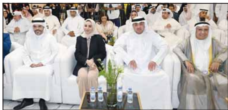
Minister of Social Affairs during the opening of Al-Firdaws Diwaniya for the Elderly and the launch of the 'Family Gathering' initiative.

For encouraging Kuwaitis to seek jobs in the private sector, there needs to be balance of the compensations and work conditions between the private and public sectors. Moreover, improving the quality of education will lead to hiking the productivity and diversifying the economy.