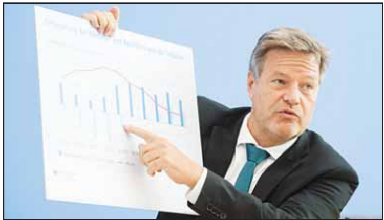
German Economy and Climate Minister Robert Habeck shows a card board with the development of nominal wages and real wages as well as inflation during a news conference of Germany's economy development in Berlin, Germany, Wednesday, Oct. 9, 2024.