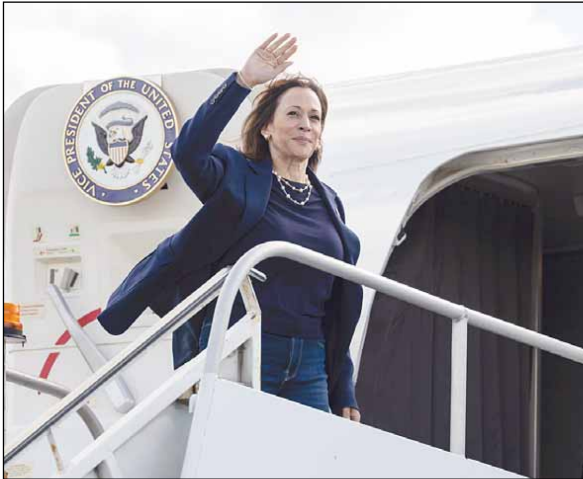
Democratic presidential nominee US Vice President Kamala Harris waves as she boards Air Force Two at LaGuardia International Airport on Oct 9 in New York.