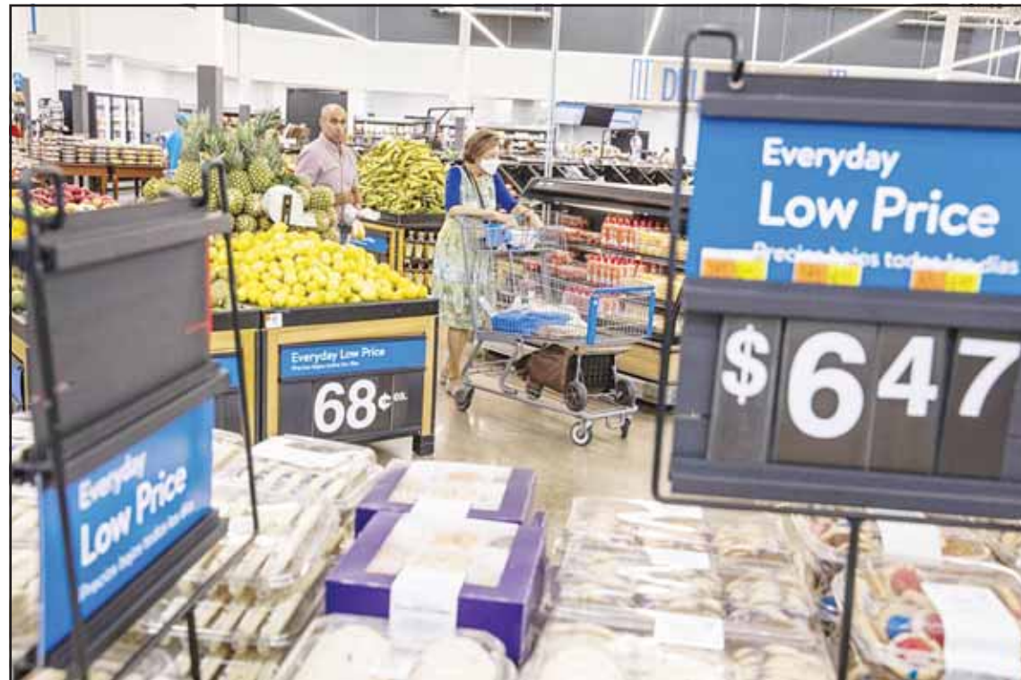
People buy groceries at a Walmart Superstore in Secaucus, New Jersey, July 11, 2024.

Chancellor Olaf Scholz's three-party coalition government has seen its popularity plunge over nearly three years in office. It has become notorious for constant infighting, for instance over next year's budget.