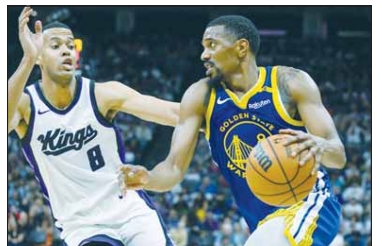
Sacramento Kings center Skal Labissiere (8) guards Golden State Warriors guard De'Anthony Melton (8) during the second half of a preseason NBA basketball game in Sacramento, Calif.

Evidently, DeRozan is still learning his way around. "Which way do I go?" DeRozan asked as he walked into the arena. But on the court, he was a quick study - the first points of Sacramento's preseason came on DeRozan's trademark midrange jumper.