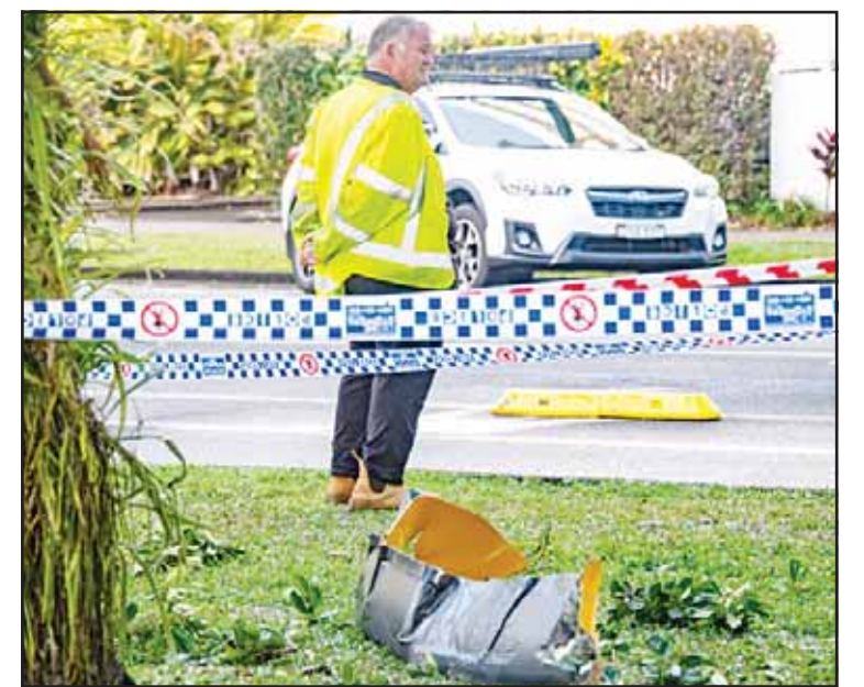
Debris from a helicopter lies on the ground after it crashed into the roof of the Double Tree by Hilton Hotel, in Cairns, on Aug 12.