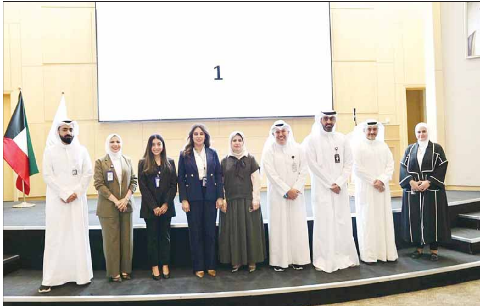
Group picture of the NBK representatives during career day.