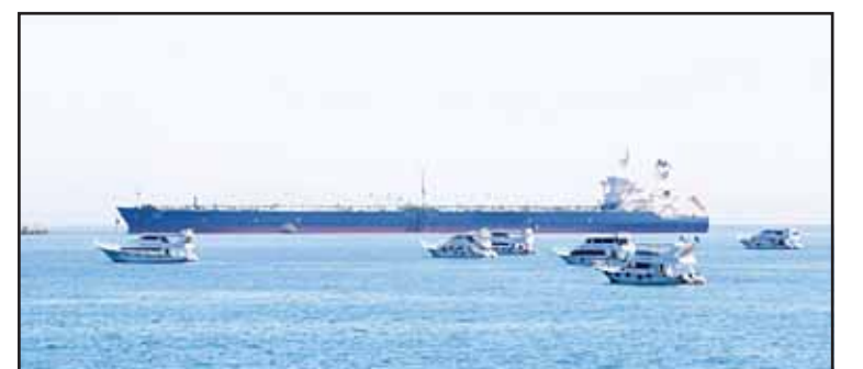
A ship sails on the Gulf of Suez, Egypt, on Oct. 8, 2024. Revenues of Egypt's Suez Canal dropped by 60 percent and the number of ships passing through the waterway decreased by 49 percent since the beginning of 2024, an Egyptian official said Sunday.

The evaluation of the acquisition offer appears to be in its preliminary stages, with further developments anticipated following the due diligence process.