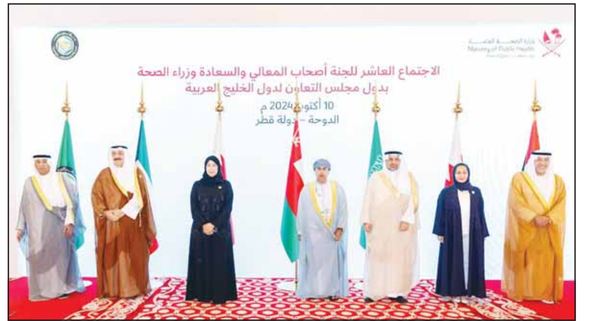
GCC Health Ministers participating in the meeting.

Al-Budaiwi stressed that what GCC countries are doing in this sector is a basic element among many elements through which they have gained this prestigious position regionally and internationally and have become a destination for many countries and regional organizations that wish to engage in strategic partnerships.