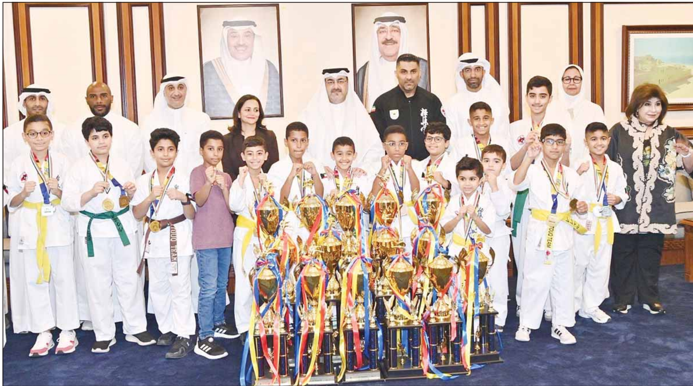
Governor of the Capital honoring the young athletes.

He expressed Kuwait's pride in its young athletes, who have begun to excel on Gulf, Arab, and international stages. The Governor emphasized that these champions set a fine example for Kuwaiti sports youth, wishing them continued success and hoping for more achievements in the future across all fields.