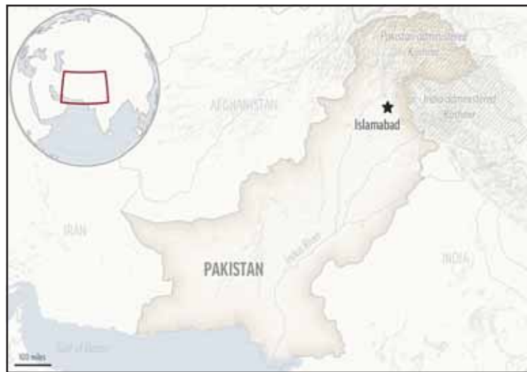
This is a locator map for Pakistan with its capital, Islamabad, and the Kashmir region.