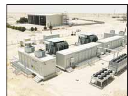
One of the power generation stations of the Kuwait Gulf Oil Company.