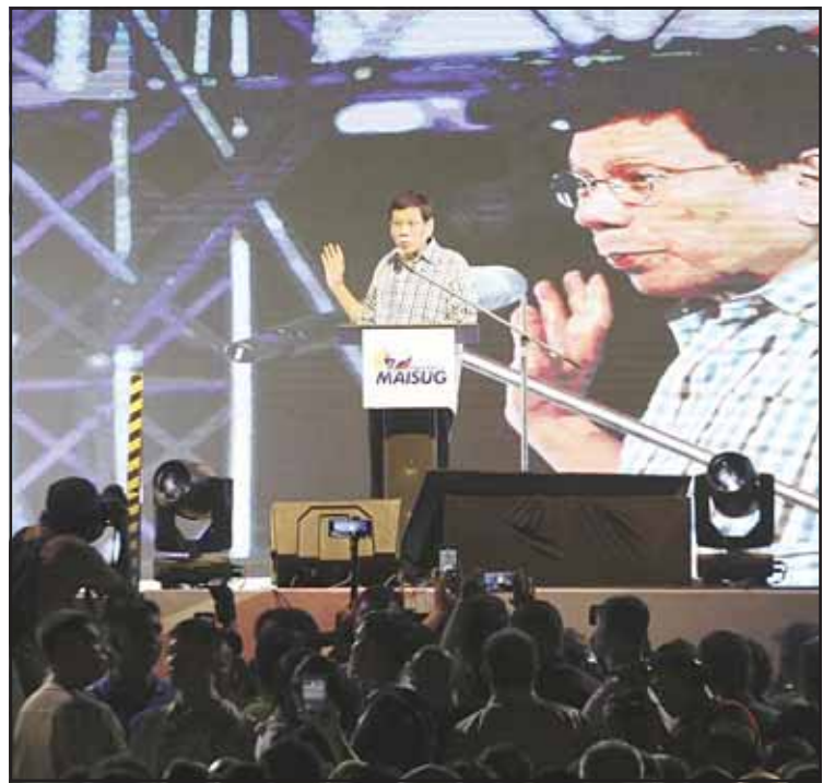
Former Philippine president Rodrigo Duterte gestures during his speech in Davao, southern Philippines on Jan 28.

Meanwhile, A Chinese defense spokesperson on Wednesday asked the United States to stop its "double-faced" approach toward China, change its double-dealing practice on the Taiwan question, and cease arming Taiwan.