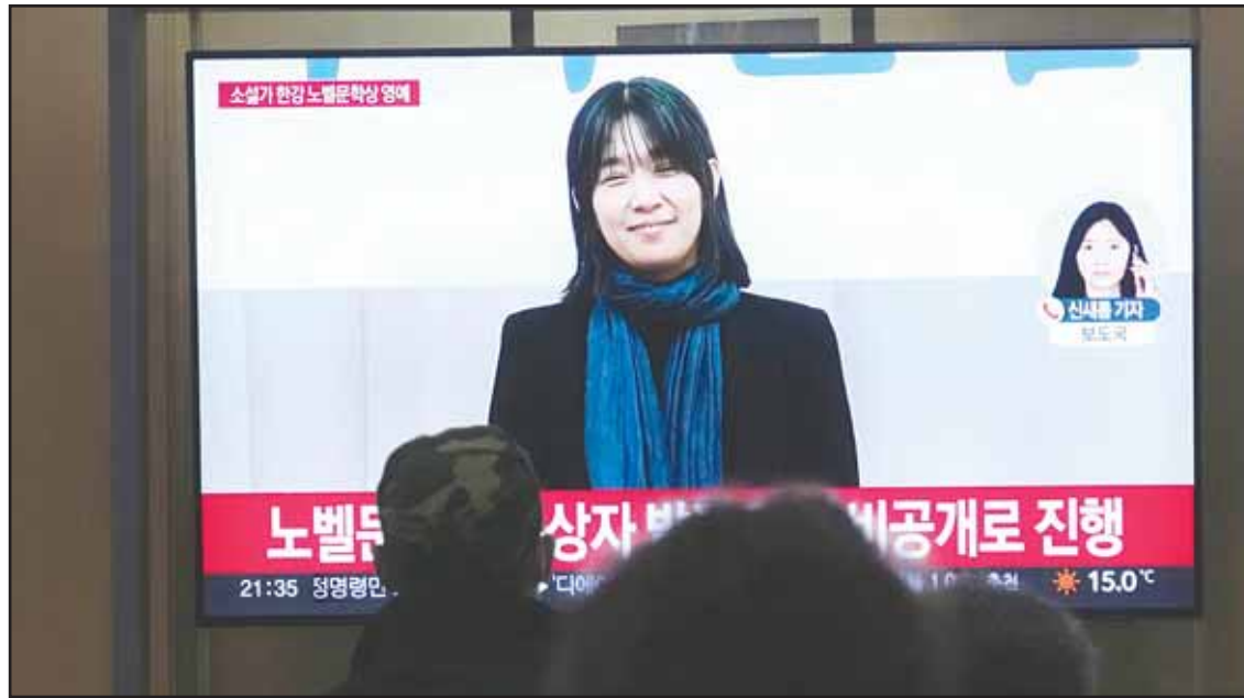
A TV screen shows an image of the winner of the 2024 Nobel Prize in Literature, South Korean writer Han Kang, during a news program at Seoul Railway Station in Seoul, South Korea, Thursday, Oct. 10.

Han made her publishing debut as a poet in 1993; her first short story col-