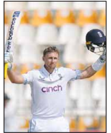
England's Joe Root celebrates after scoring double century during the fourth day of the first test cricket match between Pakistan and England, in Multan, Pakistan.

Pakistan then crumbled with its top-order stumbling against the pace of Gus Atkinson (2-28) and Brydon Carse (2-39) after Chris Woakes had uprooted the off stump of Abdullah Shafique on the first ball of the innings.