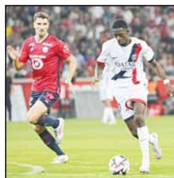
PSG's Ousmane Dembele runs with the ball watched by Lille's Thomas Meunier, left, during the French League 1 soccer match between Lille and Paris Saint-Germain, in Villeneuve-d'Ascq, France.

Following the exits of Messi to Inter Miami and Neymar to Saudi Arabia team Al-Hilal in previous years, the departure of Mbappé to Real Madrid this summer marked the end of an era at PSG, where relying on the individ-