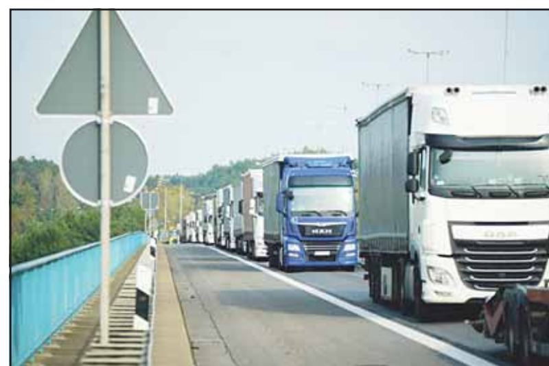
Trucks wait to enter Germany near Slubice, Poland on Sept 16. Germany tightened border controls on Monday. The new measures affected Germany's borders with France, Luxembourg, the Netherlands, Belgium, Denmark, Austria, Switzerland, the Czech Republic, and Poland.