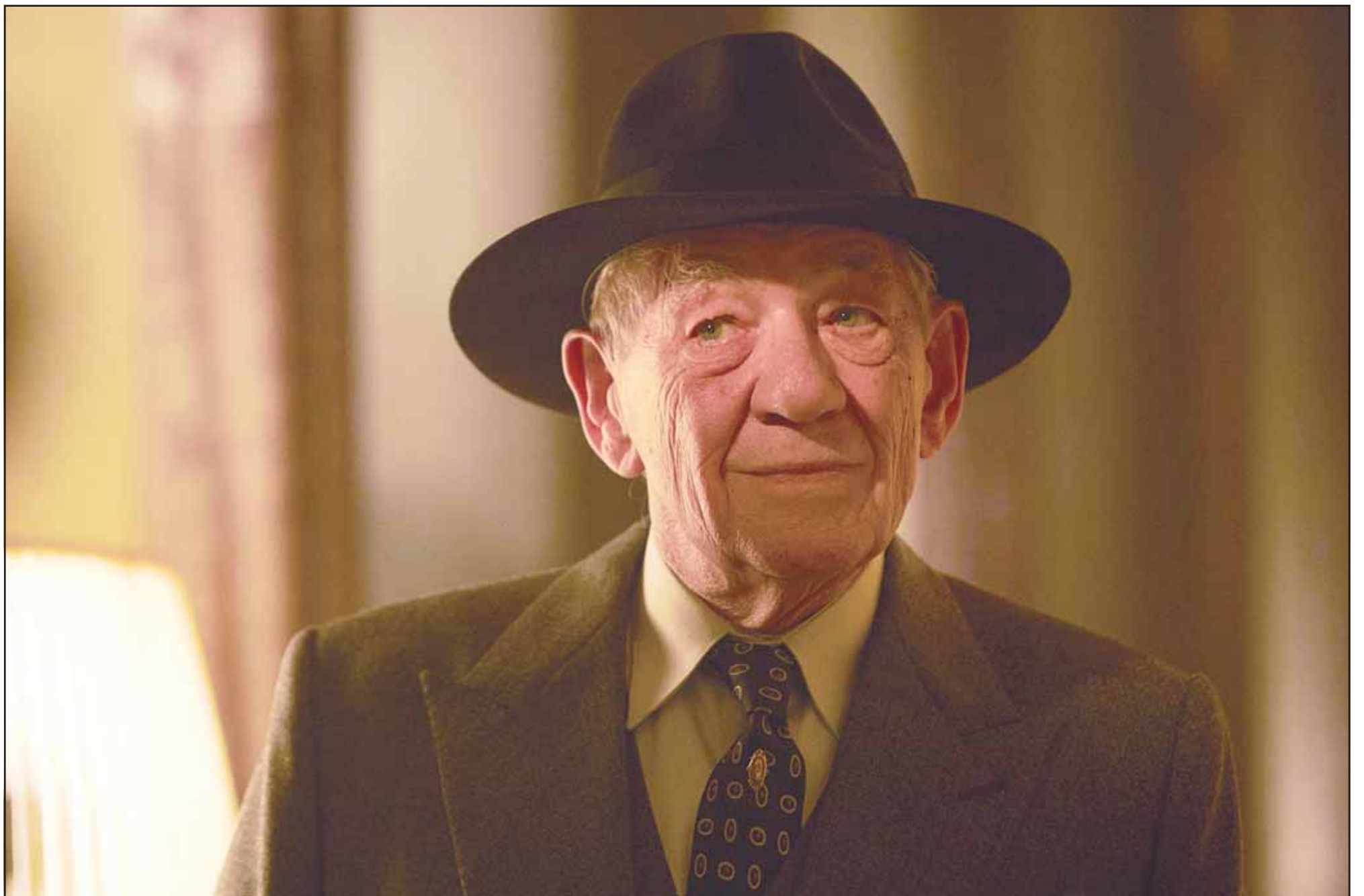
This image released by Greenwich Entertainment shows Ian McKellen in a scene from 'The Critic.' (AP)