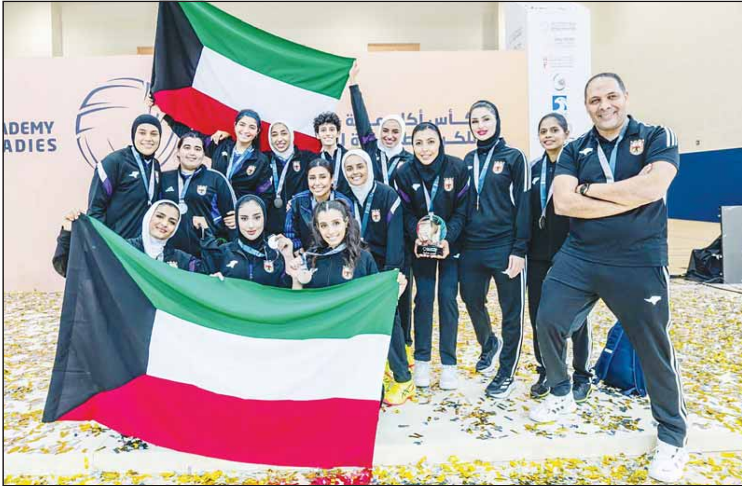
Al Oyoun players celebrate after finishing second.