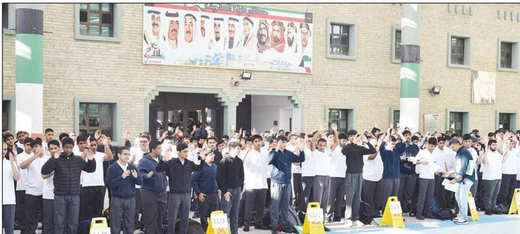
Students at a boys school on the first day assembly after summer break.