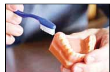
A dentist holds a model of teeth and a toothbrush in Seattle on Aug. 3, 2018.

The researchers have partners in Spain and are moving forward with the larger Maternal Brain Project, which is supported by the Ann S. Bowers Women's Brain Health Initiative and the Chan Zuckerberg Initiative. Eventually, they hope scientists can use data from a large number of women for things like predicting postpartum depression before it happens.