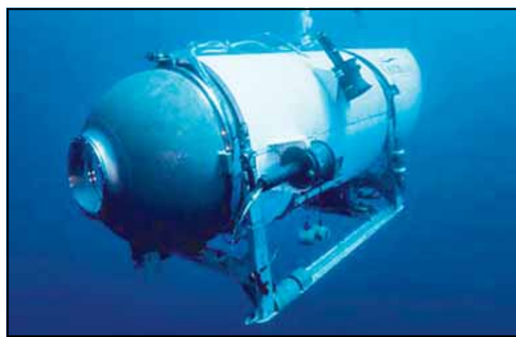
This undated image provided by OceanGate Expeditions in June 2021 shows the company's Titan submersible.