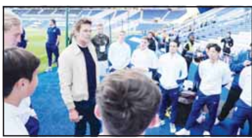
Birmingham City co-owner Tom Brady meets the players before the Sky Bet League One soccer match in Birmingham, England.