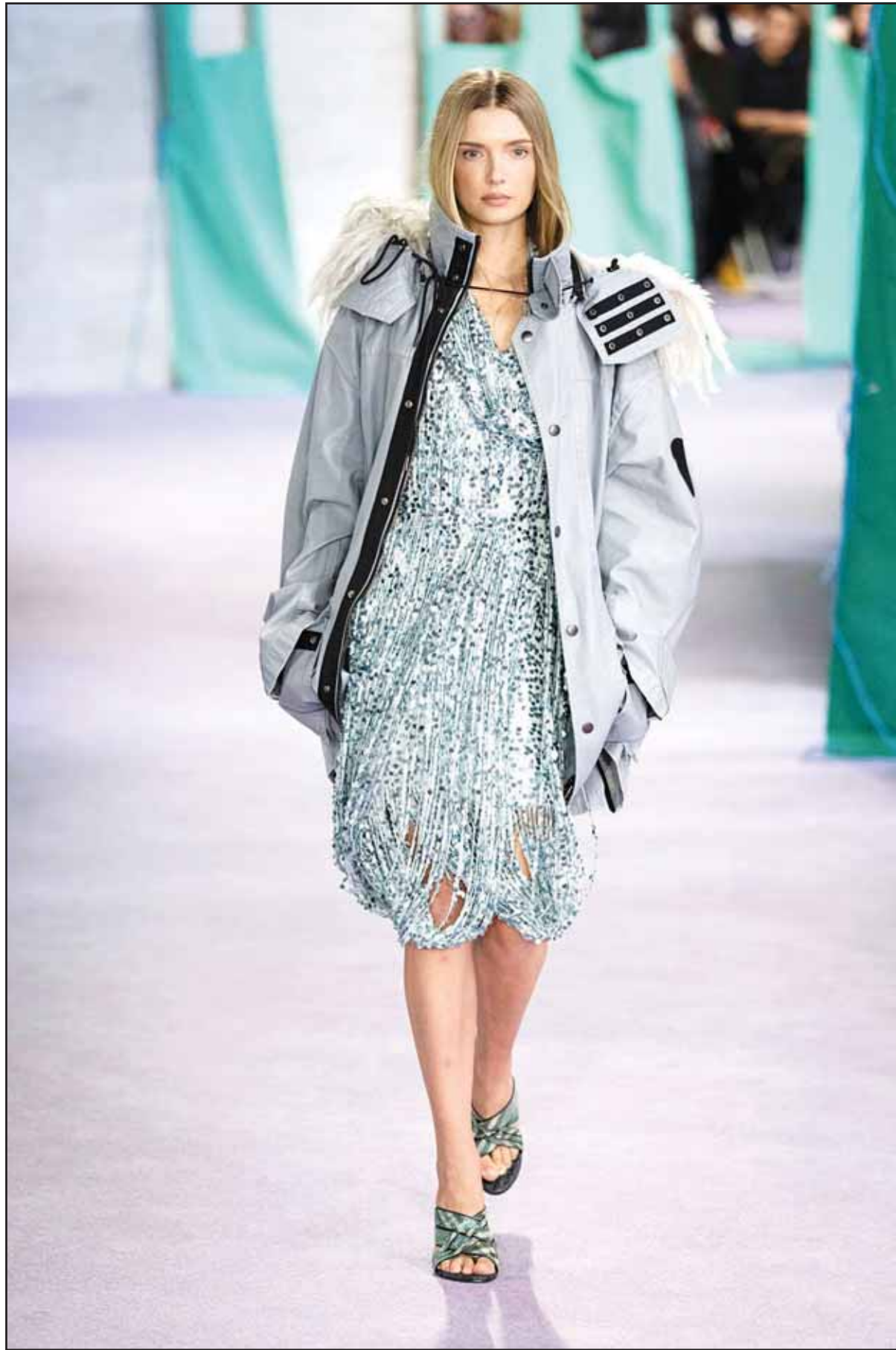
Lily Donaldson wears a creation for the Burberry Spring Summer 2025 fashion show on Monday, Sept. 16, in London.