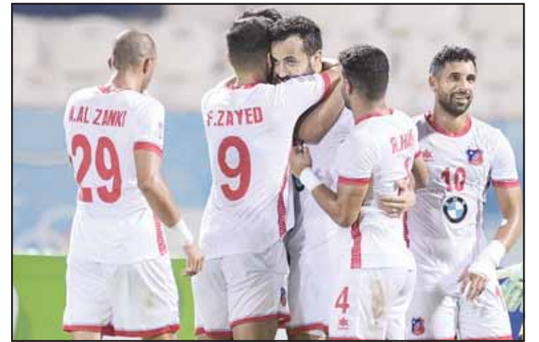
A file photo of Kuwait Club players celebrating.

prizes for the tournament, with participating group stage teams receiving no less than $300,000. The tournament champion will earn approximately $3.28 million.