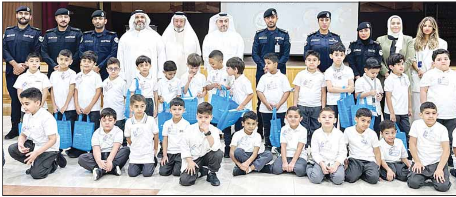
Zain's team with Mol officials during a school visit.

Zain is committed to aligning with national plans and initiatives to promote social development, recognizing the private sector's crucial role in supporting public institutions to ensure sustainable growth across various essential sectors. This commitment is reflected in the numerous partnerships Zain has formed with public institutions over the years, which have led to many successful