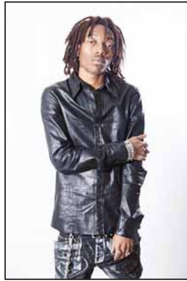
Lil Tecca poses for a portrait on Tuesday, Sept. 10, 2024, in New York.