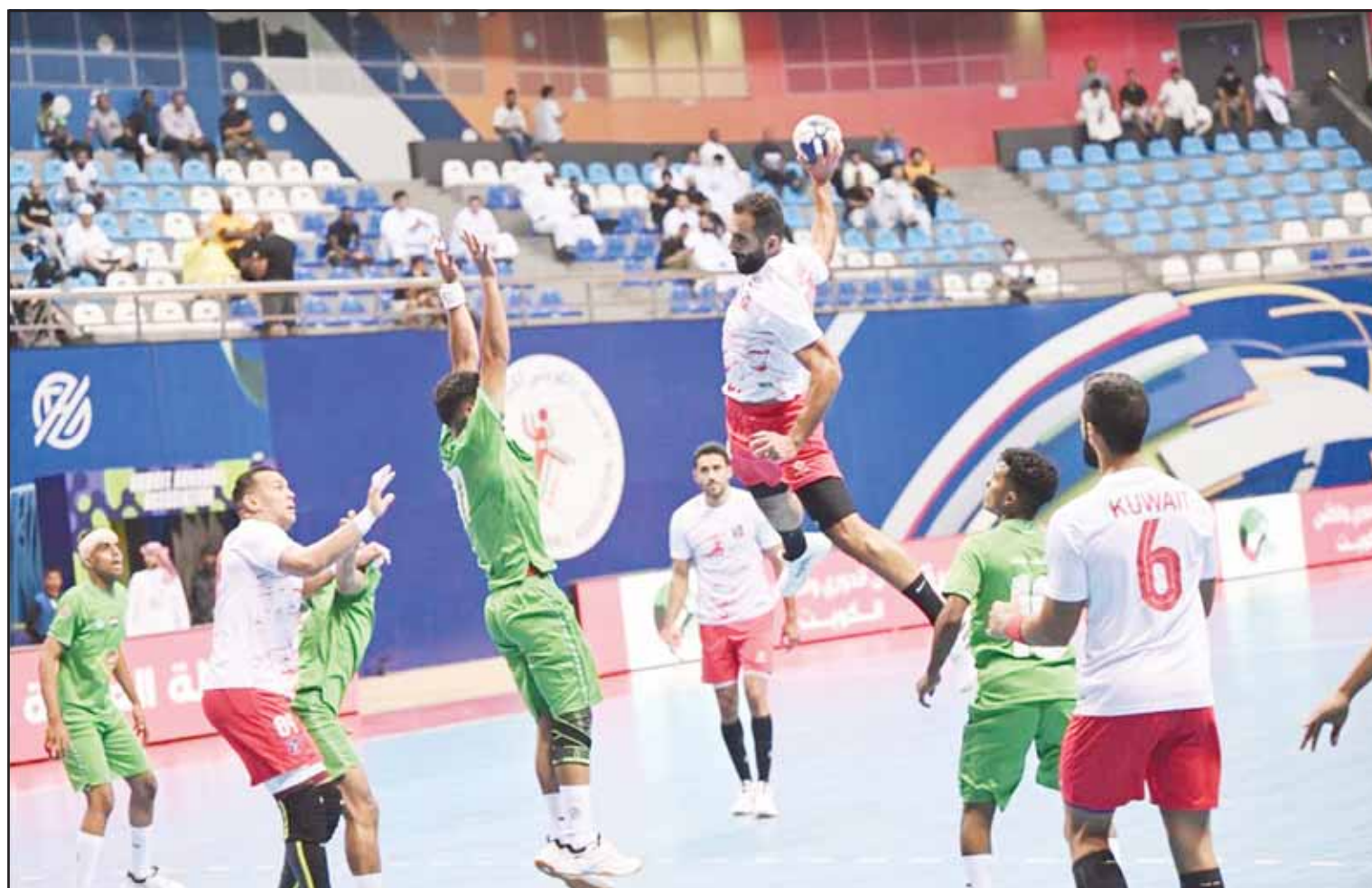
Kuwait Club players attempt to score against Al-Qoton during the opening match of the 39th Arab Handball Clubs Championship.

Birmingham's Krystian Bielik was issued a red card with four minutes remaining but it was too late for the Welsh side to react.