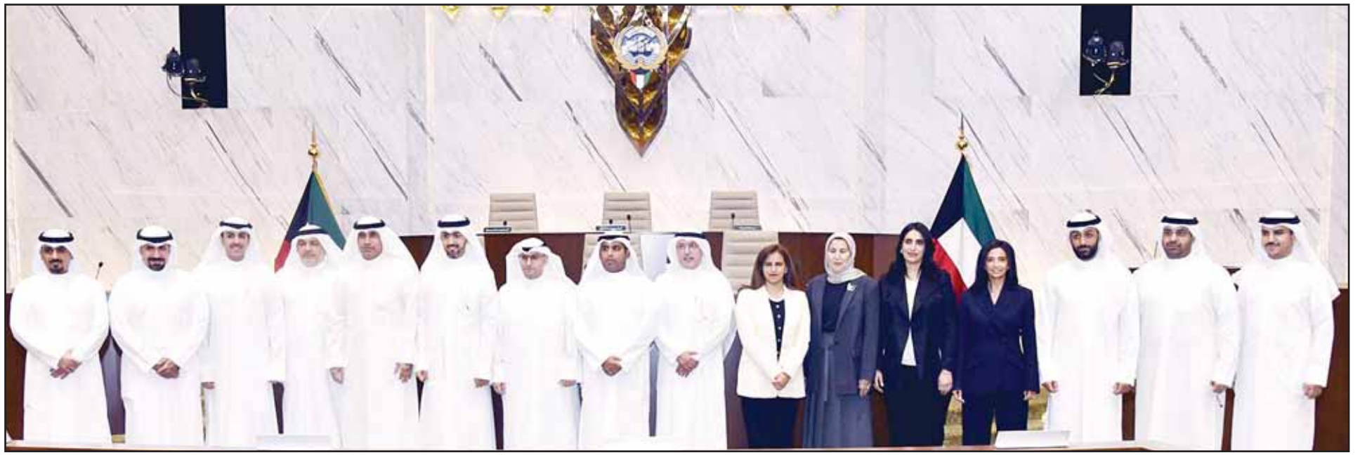
Minister of State for Municipal and Housing Affairs Abdullatif Al-Mishari poses for a group photo with the Chairman and the members of the Municipal Council.

Regarding the priority files in the State Ministry for Municipality Affairs, Al-Mishari cited the need to lay down a clear architectural vision as his top priority; indicating the connection between the architectural vision and the behavior of citizens. He asserted such vision reflects the behavior and orientations of citizens,