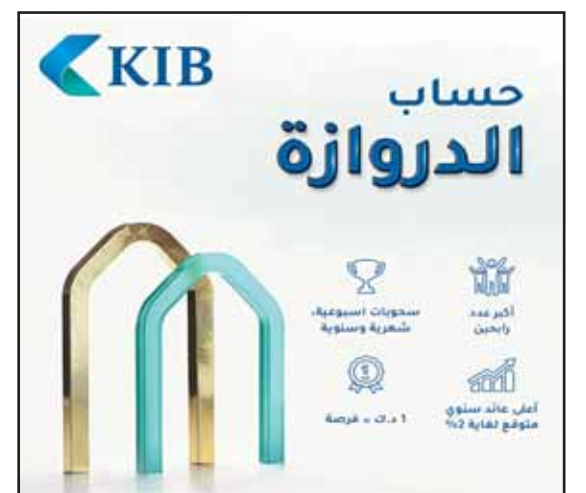
KIB's Al Dirwaza account.

Additionally, Al Dirwaza account automatically grants customers instant issuance of an ATM card, with a KD 2,000 ATM daily withdrawal limit, as well as the ability to issue credit cards against the cash collateral in the account.