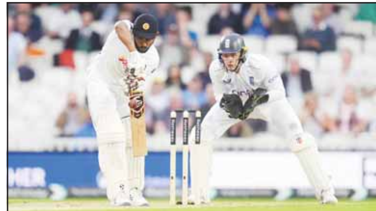
Sri Lanka's Kamindu Mendis bats during day two of the Third Rothsay Men's Test match between England and Sri Lanka in London.

New Zealand squad: Tim Southee (captain), Tom Blundell, Michael Bracewell, Devon Conway, Matt Henry, Tom Latham, Daryl Mitchell, Will O'Rourke, Ajaz Patel, Glenn Phillips, Rachin Ravindra, Mitchell Santner, Ben Sears, Kane Williamson and Will Young.