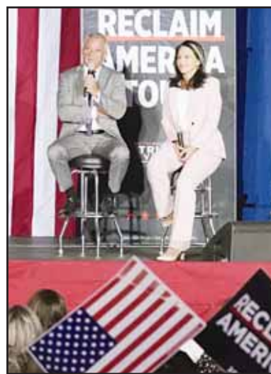
Former Independent candidate for president Robert F. Kennedy Jr., (left), and former Democratic Rep Tulsi Gabbard speak at a campaign event for Republican presidential nominee former US president Donald Trump on Sept 14 in Glendale, Ariz.

Meadows faces charges in Arizona and Georgia in what authorities allege was an illegal scheme to overturn the 2020 election results in Trump's favor. He had unsuccessfully tried to move charges in the Georgia case last year.