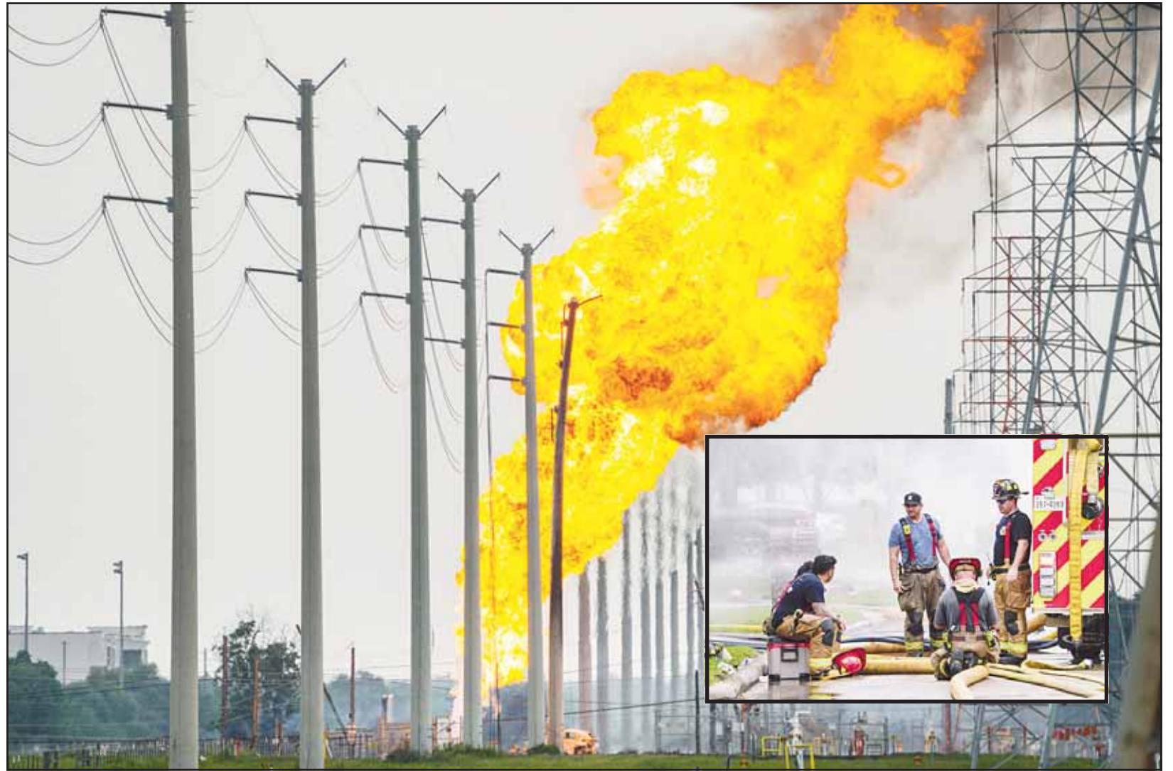
A pipeline carrying liquefied natural gas burns near Spencer Highway and Summertown on Sept 16 in La Porte, Texas. Inset: Firefighters take a break from battling a fire at a pipeline carrying liquefied natural gas near Spencer Highway and Summertown on Monday.

Hungary's government of Prime Minister Viktor Orbán deployed soldiers to reinforce barriers along the Danube, and thousands of volunteers assisted in filling sandbags in dozens of riverside settlements.