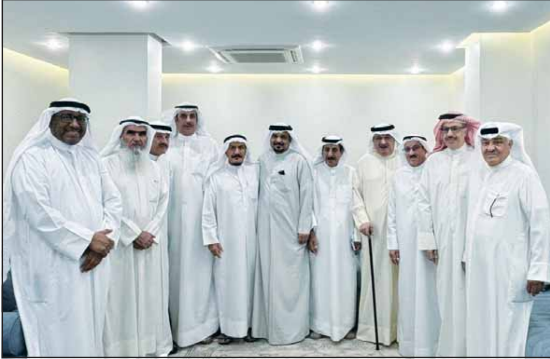
Former Jahra Club presidents during the meeting.