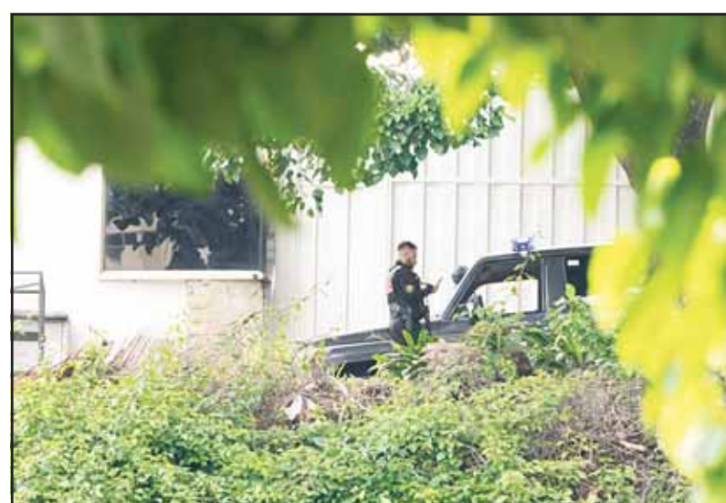
Police guard Argentina's embassy in Caracas, Venezuela on Sept 7. Venezuela's government said that Brazil can no longer represent Argentina's diplomatic interests in the country, putting at risk several anti-government opponents who have holed up for months in the Argentine ambassador's residence seeking asylum.

Venezuela revokes Brazil's role: Venezuela's government said that Brazil can no longer represent Argentina's diplomatic interests in the country, putting at risk several