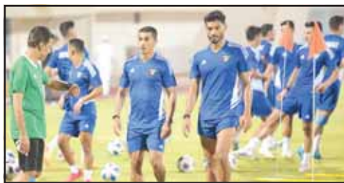
Kuwait holds its final training session for a key World Cup qualifying match against Iraq.