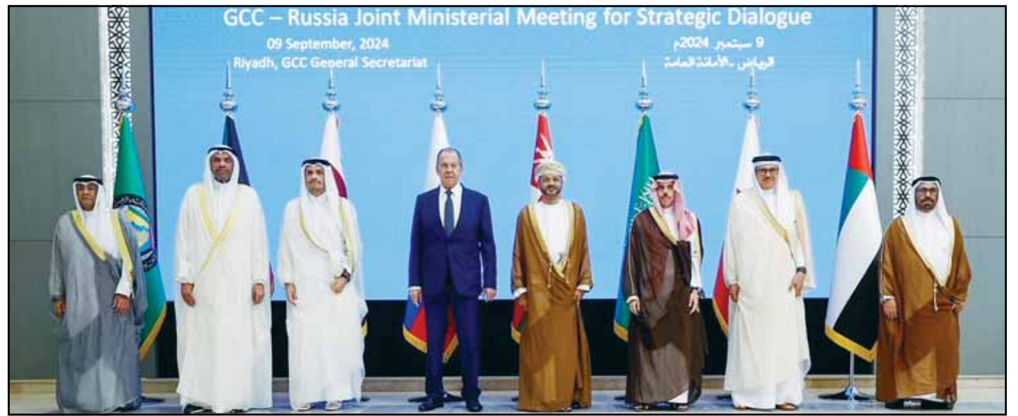
The joint ministerial meeting of the GCC foreign ministers and the FM of the Russian Federation.