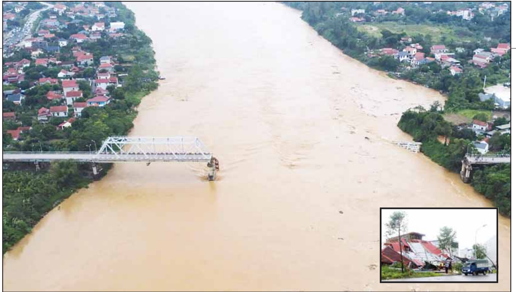
A bridge collapse due to floods triggered by typhoon Yagi in Phu Tho province, Vietnam on Sept 9. Inset: This photo taken on Sept 8 shows buildings destroyed by typhoon in Vietnam's northern province of Hung Yen.

Baba-Arab said initially that 30 bodies were found but in a later statement said an additional 18 bodies of victims who were burned to death in the collision were found. He said the dead had been given a mass burial.