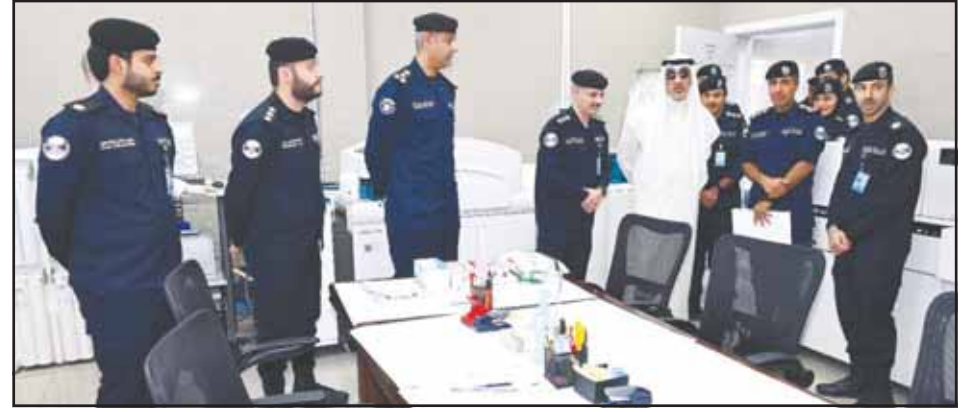
Minister Sheikh Fahad Yousef reviews the health, technical and administrative procedures followed to ensure the provision of the best health services.