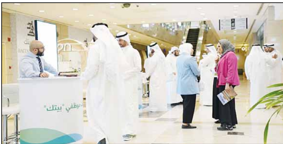
High turnout from employees at the exhibition.