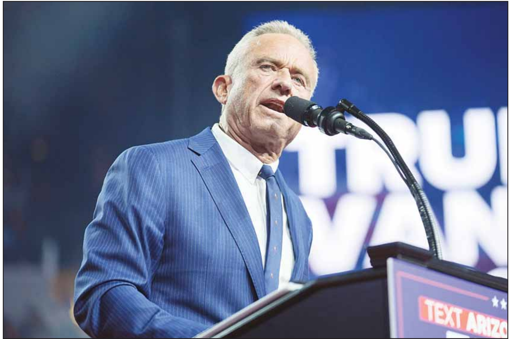
Independent presidential candidate Robert F. Kennedy Jr. speaks as he endorses Republican presidential nominee former president Donald Trump at a campaign rally at the Desert Diamond Arena on Aug 23, 2024, in Glendale, Ariz. Kennedy scored a pair of legal victories in the battleground states of North Carolina and Michigan, and a setback in Wisconsin on Sept 6 in his quest to get his name off of the ballots in some states after he suspended his campaign.

Migrants from the Middle East, Africa and Asia often seek help from people smugglers to cross borders without authorization to reach wealthy Western European countries. Migrants are often forced to travel in crammed vans or boats.