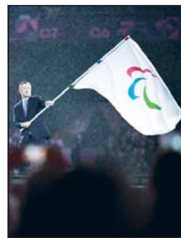
President of the International Paralympic Committee Andrew Parsons passes the Paralympic flag to Mayor of Los Angeles Karen Bass, (unseen), after receiving it from Mayor of Paris Anne Hidalgo, (not pictured), during the closing ceremony of the 2024 Paralympics in Paris, France.