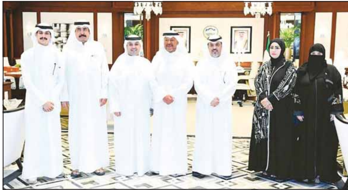
Farwaniya Governor Sheikh Athbi Al Nasser receives the Food and Nutrition Inspection Department officials in Farwaniya.