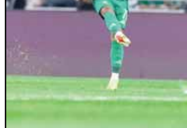
A Saudi player shoots the ball as an opponent defends.