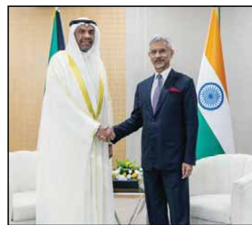
FM meeting his Indian counterpart.

He explained that the biometric fingerprinting is a State project aimed at creating a database for everyone residing in the country -- citizens or expatriates who are 18