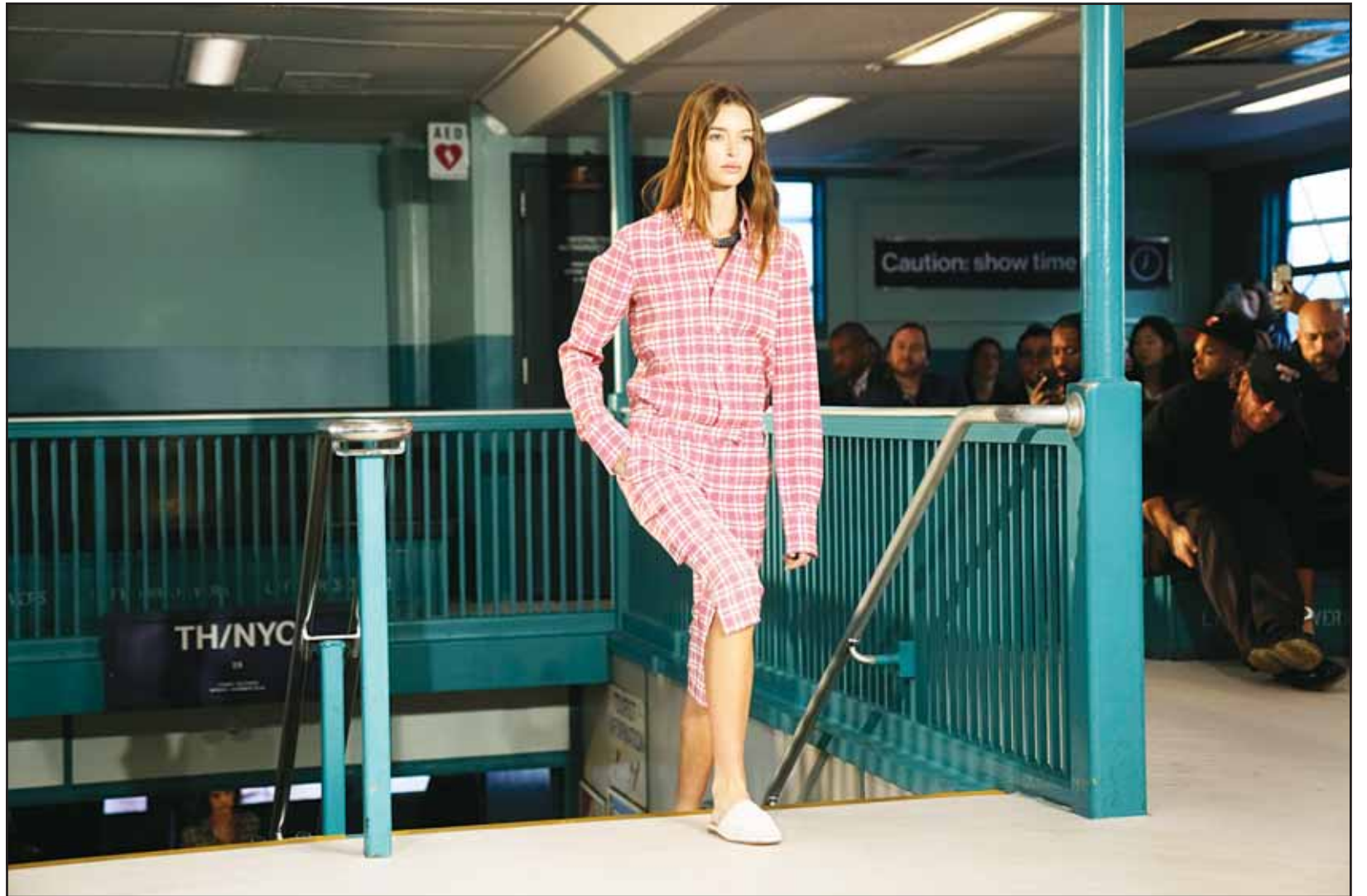
A model walks the runway during the Tommy Hilfiger Spring/Summer 2025 fashion show onboard a Staten Island Ferry as part of New York Fashion Week on Sunday, Sept. 8, in New York.