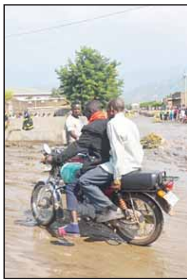
Motorcycle taxis pass through a flooded street in Kasese, western Uganda on Sept 8. Three people were killed in flash floods triggered by heavy downpours Saturday in the western Ugandan district of Kasese, according to a humanitarian relief agency.