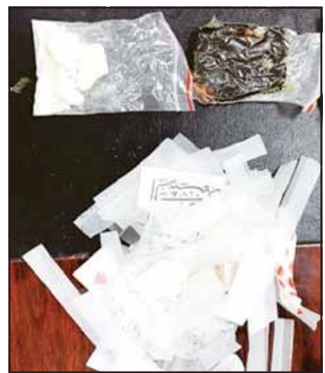
Various types of drugs (left) and mobile phones, chargers seized from the drones.

They explained that intensified surprise raids in the prison wards, continuous rotations of military personnel, the transfer of drug dealers to prison No. 3, and rigorous inspections of everyone entering the prison including officers, military staff, maintenance workers, and cleaning workers have significantly contributed to keeping the prison nearly free of contraband. This heightened security led drug dealers to resort to using drones, which take off from areas near the prison complex at dawn, to deliver contraband. Despite these efforts, the security personnel successfully thwarted the smuggling attempt.