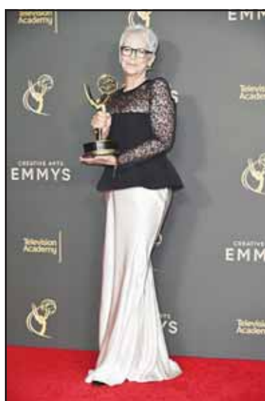
Jamie Lee Curtis poses with her award for outstanding guest actress in a comedy series for "The Bear" on night two of the Creative Arts Emmy Awards on Sunday, Sept. 8, in Los Angeles. — Details Page 11