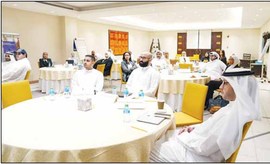
Zain is keen to invest in its human capital.