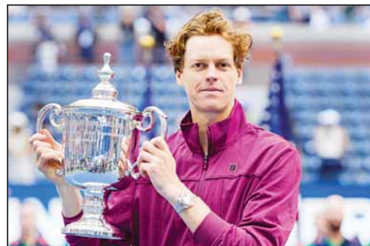
Jannik Sinner, of Italy, holds up the championship trophy after defeating Taylor Fritz, of the United States, in the men's singles final of the U.S. Open tennis championships in New York.

The tourists' previous test wins in England came in 1998 - that famous 10-wicket victory in a one-off test at