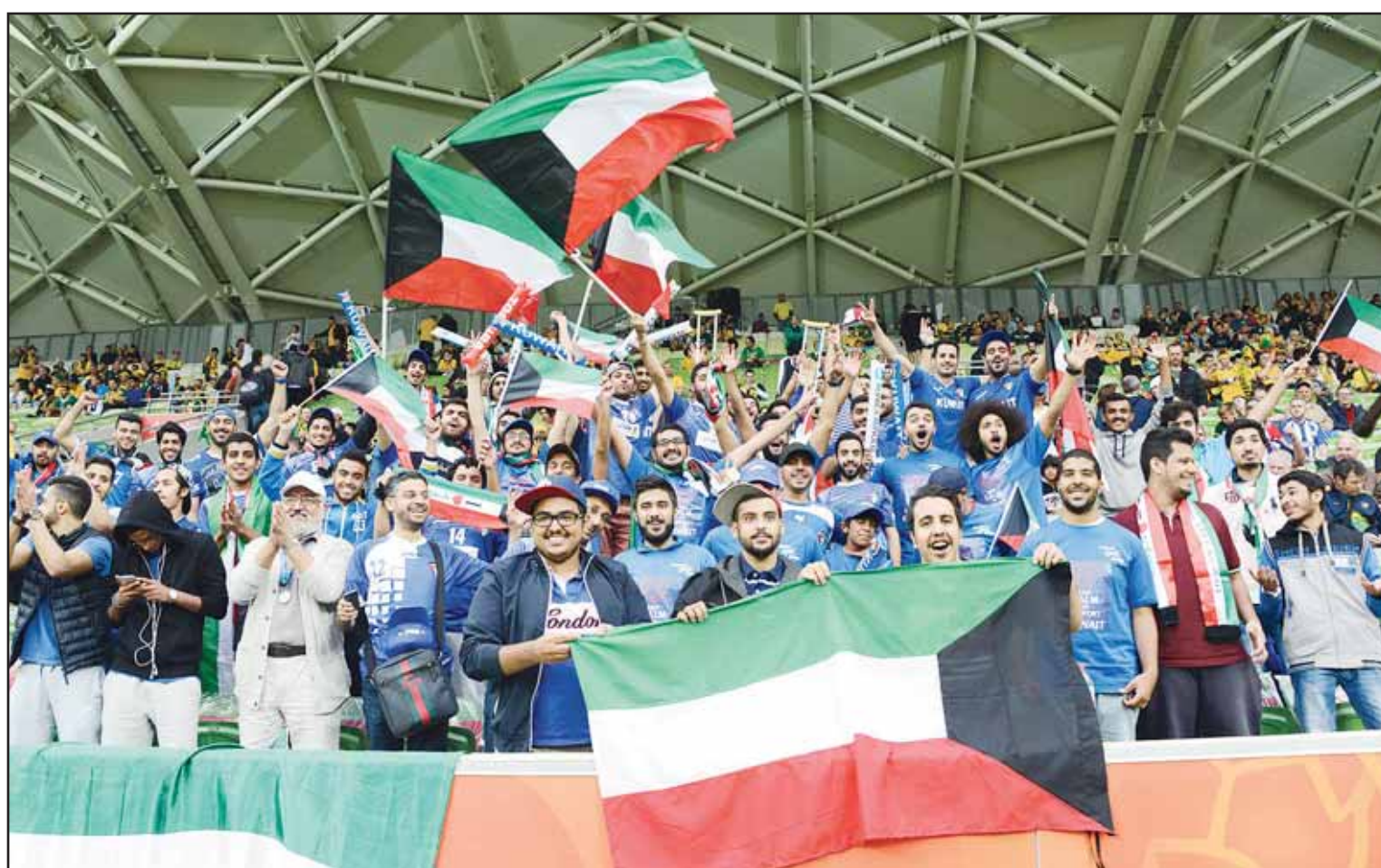
A file photo of Kuwaiti fans cheering the team.