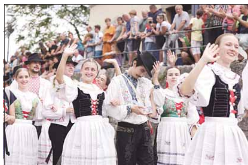
People wearing traditional costumes of Slovakia participate in the parade of the 51st National Costumes and Clothing Heritage Day in Kamnik, Slovenia on Sept 8. The 51st National Costumes and Clothing Heritage Day ended Sunday in Kamnik with a traditional parade, during which about 2,000 participants dressed in national costumes walking through the center of Kamnik. (Xinhua)

systems of pyrocumulonimbus clouds, which could bring more challenging conditions such as gusty winds and lightning strikes, according to the National Weather Service. Firefighters also faced steep terrain, which limited their ability to control the blaze, of