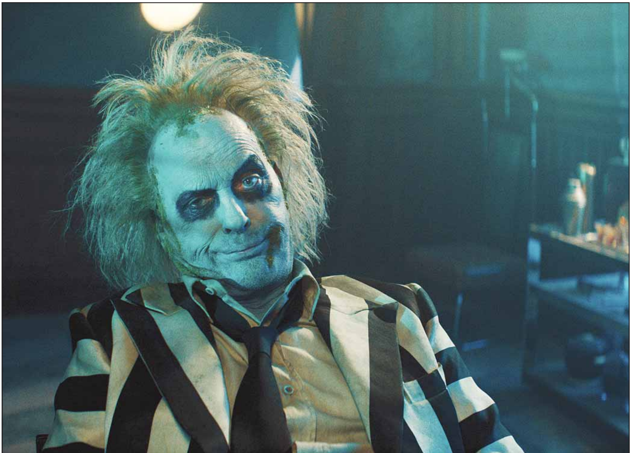
This image released by Warner Bros. Pictures shows Michael Keaton in a scene from 'Beetlejuice Beetlejuice.'