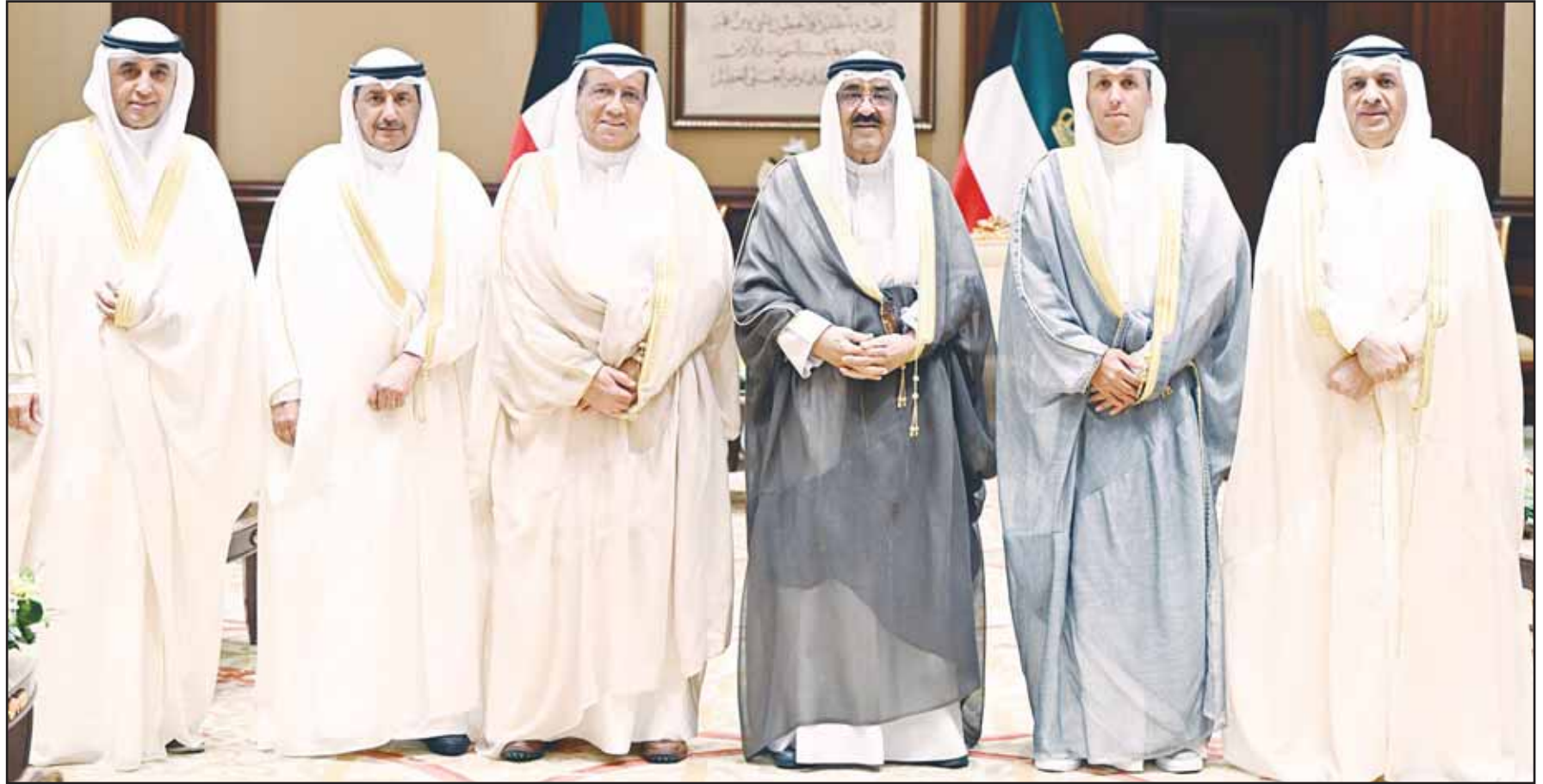
His Highness the Amir Sheikh Mishal Al-Ahmad Al-Jaber Al-Sabah receives senior judicial officials.