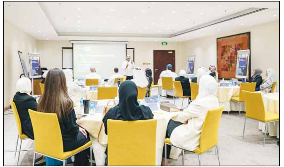
From the training program.