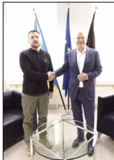
German Chancellor Olaf Scholz, (right), and Ukraine's President Volodymyr Zelenskyy meet for bilateral talks at Frankfurt Airport, Frankfurt, Germany on Sept 6. Scholz said on Sept 8 he and Zelenskyy agree that Russia should be included in a future peace conference aimed at ending Russia's war against Ukraine. He called for stepped up efforts to solve the conflict.