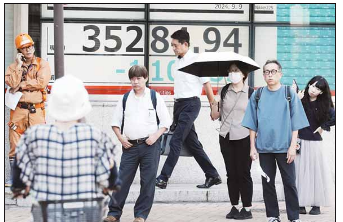
People stand near an electronic stock board showing Japan's Nikkei index at a securities firm Monday, Sept. 9, 2024, in Tokyo.