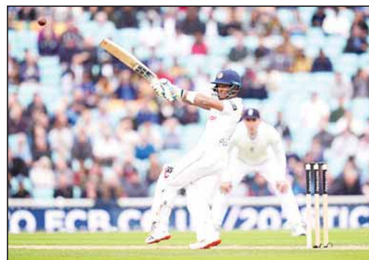
Sri Lanka's Pathum Nissanka on day four of the Third Rothesa Men's Test at The Kia Oval, in London.

Ten minutes later, it was over, thanks to Sinner's closing four-game run. He raised his arms, threw his head back and closed his eyes.