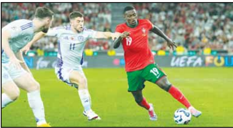
Portugal's Nuno Mendes, right, and Scotland's Ryan Christie challenge for the ball during the UEFA Nations League soccer match between Portugal and Scotland at the Luz stadium in Lisbon, Portugal.