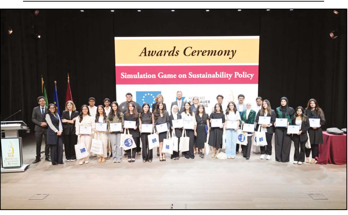
Group photo of participants and organizers