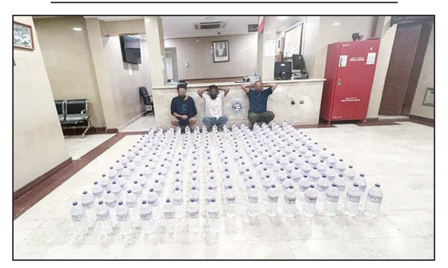
The three liquor peddlers in police custody.