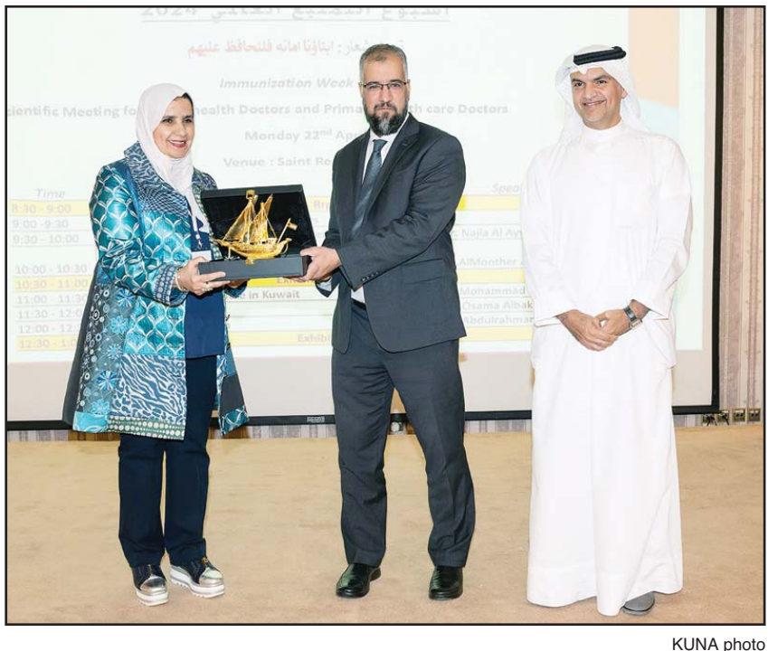
Part of the honoring during the opening of National Immunization Week.