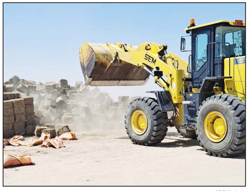
Municipality dismantles a fodder market set up on State property.