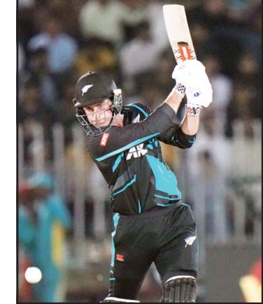
New Zealand's Tim Robinson plays a shot during the third T20 international cricket match between Pakistan and New Zealand, in Rawalpindi, Pakistan.

stump uprooted with a brutal yorker. But Chapman then took control against Pakistan spinners Abrar Ahmed (0-31) and Shadab Khan (0-24) before he cut loose against Naseem (1-44) and Shaheen Shah Afridi (0-37)