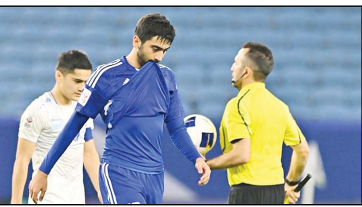
A Kuwaiti player leaves the pitch after the final whistle.