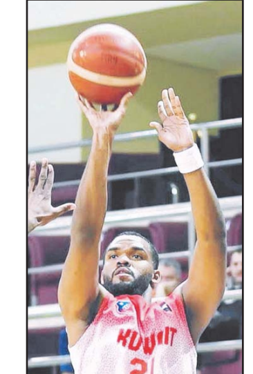
Kuwait Club player prepares

Expect an intense match as both teams boast closely matched skill levels. Manama, playing on home turf, aims to leverage home advan-