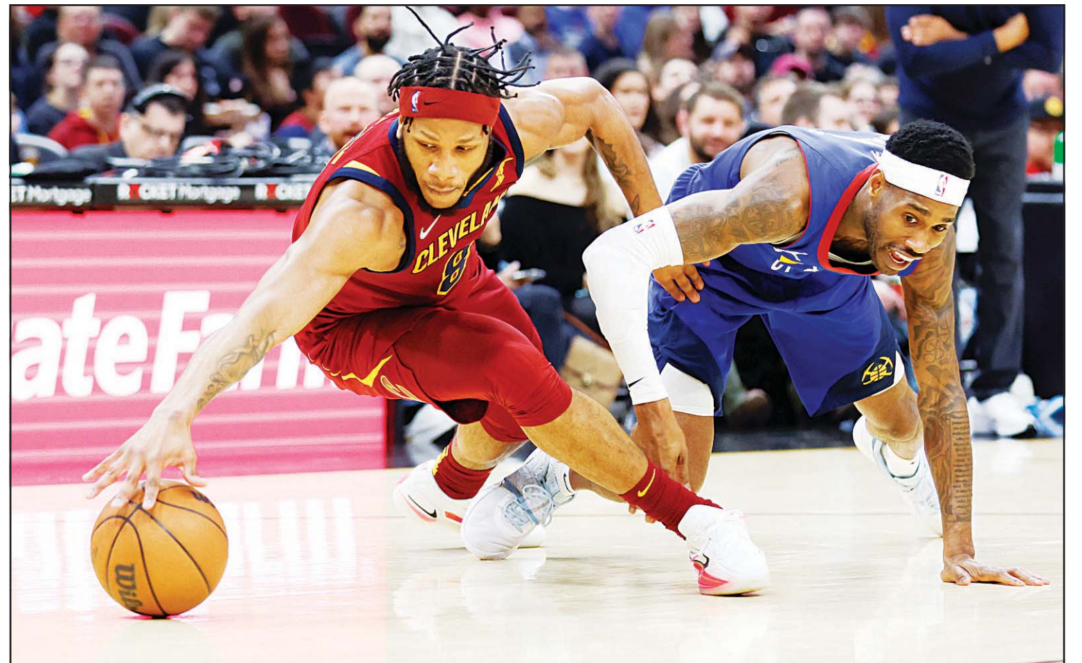
Cleveland Cavaliers' Lamar Stevens (8) steals the ball from Denver Nuggets' Will Barton (right), during the second half of an NBA basketball game in Cleveland.