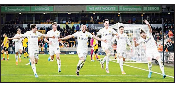
Leeds United's Luke Ayling (right), celebrates scoring with teammates during the English Premier League soccer match at Molineux Stadium, Wolverhampton, England. (AP)