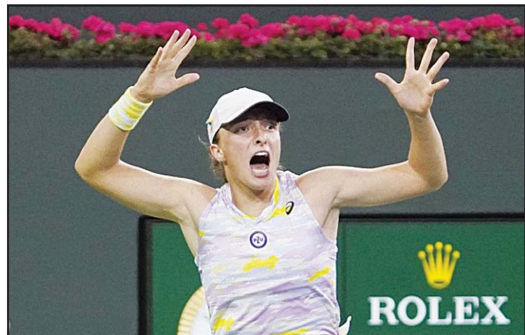
Iga Swiatek, of Poland, reacts after defeating Simona Halep, of Romania, in their women's singles semifinals match at the BNP Paribas Open tennis tournament in Indian Wells, Calif.