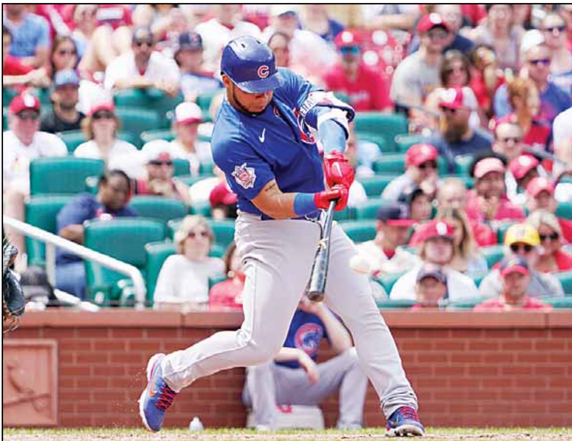
Chicago Cubs' Willson Contreras hits a two-run single during the fourth inning of a baseball game against the St. Louis Cardinals in St. Louis.

Atlanta's Kenley Jansen and the Dodgers' Craig Kimbrel (1-3) each