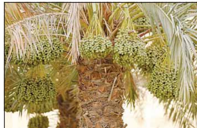
The rutab dates season has arrived in Kuwait with early varieties of the fruit in all shapes and colors hitting the market. The summer rutab dates have their taste and quality, which push consumers racing to the market to acquire them. Some clients prefer certain types of rutab including (Al-Munsef), a type of date with dual yellow and brown colors tasting and looking sweet.