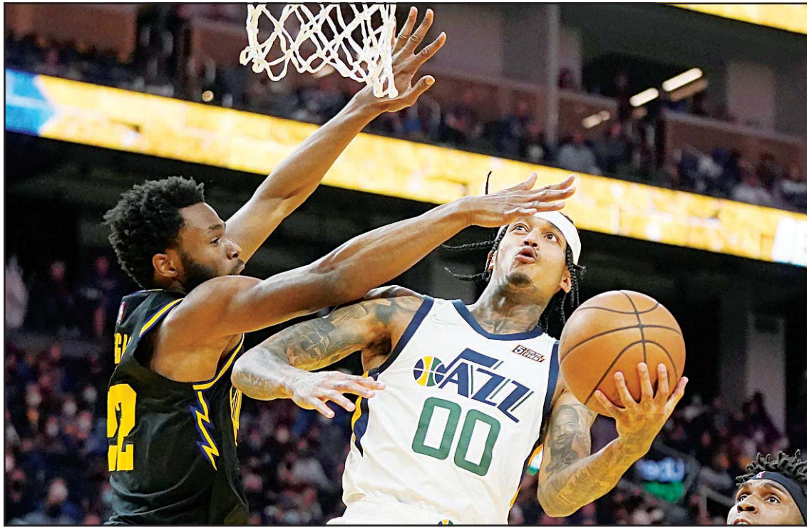
Utah Jazz guard Jordan Clarkson (00) shoots against Golden State Warriors forward Andrew Wiggins during the second half of an NBA basketball game in San Francisco, on Jan. 23.

Caleb Martin scored 15, Bam Adebayo scored 14 and Gabe Vincent had