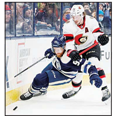
Columbus Blue Jackets' Jakub Voracek, (left), and Ottawa Senators' Thomas Chabot chase the puck during the second period of an NHL hockey game on Jan. 23, in Columbus, Ohio.

the Senators. Forsberg had 13 saves in the first period, 12 in the second and 10 in the third to get his first win since Dec. 14 after going 0-2-1 in four games in between. Sean Kuraly scored for Columbus, and Elvis Merzlikins had 31 saves. The Blue Jackets lost for the third time in four games overall, and third straight at home.