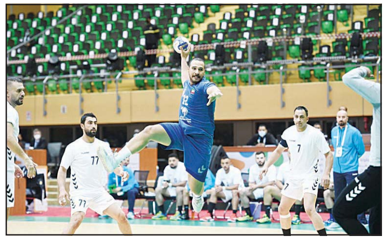
Action shot taken during the Asian handball championship.

The Jordanians managed to take an early lead in the first half, only for the Kuwaiti side to turn things around in