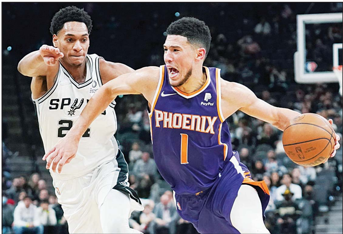
Phoenix Suns guard Devin Booker (1) drives around San Antonio Spurs guard Devin Vassell (24) during the second half of an NBA basketball game on Jan 17, in San Antonio.