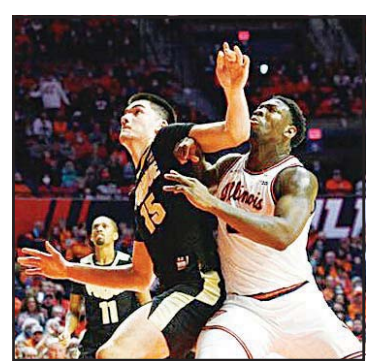
Purdue's Zach Edey (15) and Illinois' Kofi Cockburn vie for position under the basket during the first half of an NCAA college basketball game on Jan 17, in Champaign, Ill.