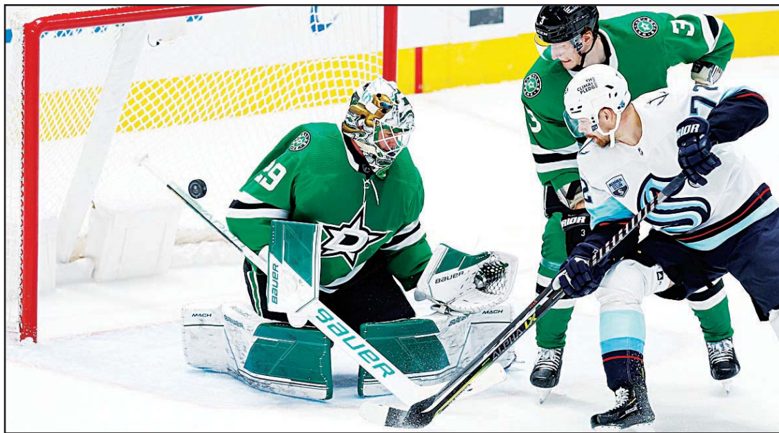
Seattle Kraken forward Joonas Donskoi (72) battles for the rebound as Dallas Stars goaltender Jake Oettinger (29) and defenseman John Klingberg (3) defend during the second period of an NHL hockey game, on Jan. 12, in Dallas.

Curtis Lazar also scored for Boston and Urho Vaakanainen got his first NHL goal. Linus Ullmark stopped 24 shots as he tries to hold onto his spot in the goalie rotation with Tuukka Rask, the winningest goalie in franchise history, expected to make his season debut on Thursday night.