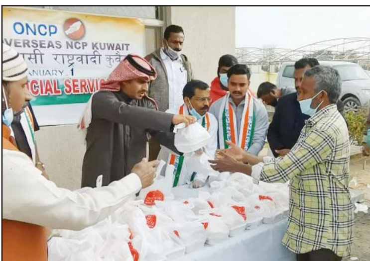
Photos from the event.