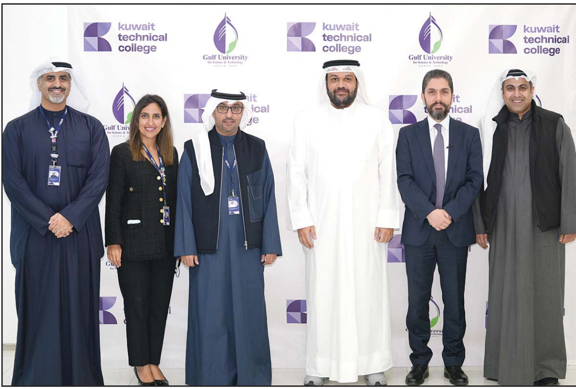
Photos from the event.