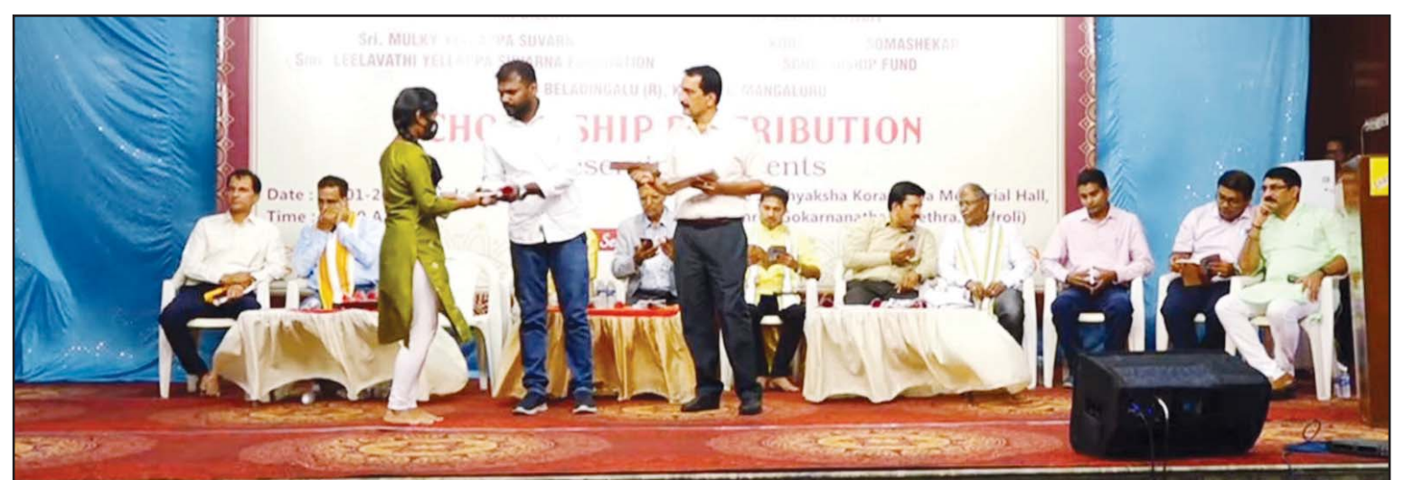
Photos from the event.