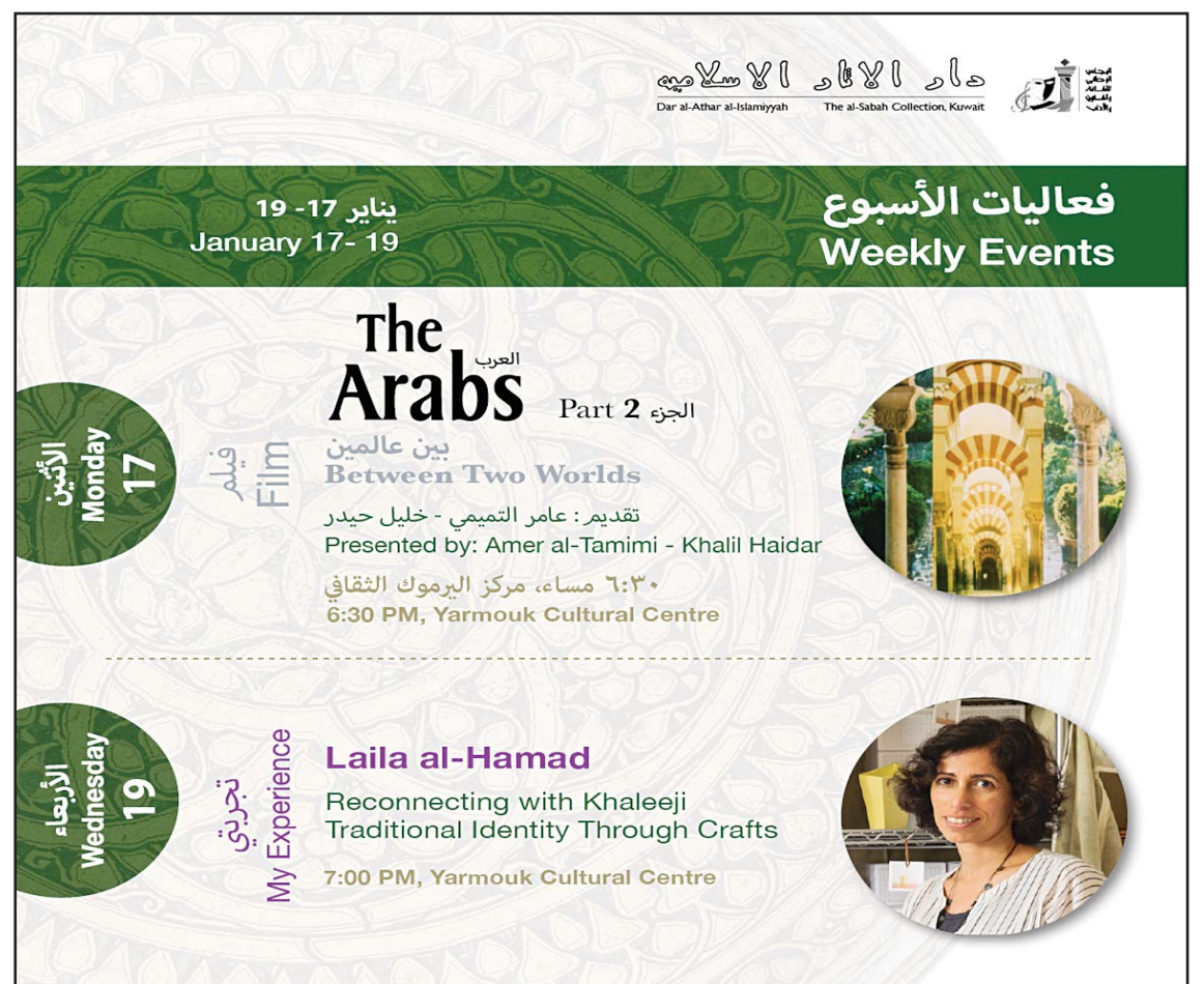
DAI flyer of the weekly events.

At its first commencement ceremony in June 2007, GUST conferred diplomas on approximately four hundred graduates.