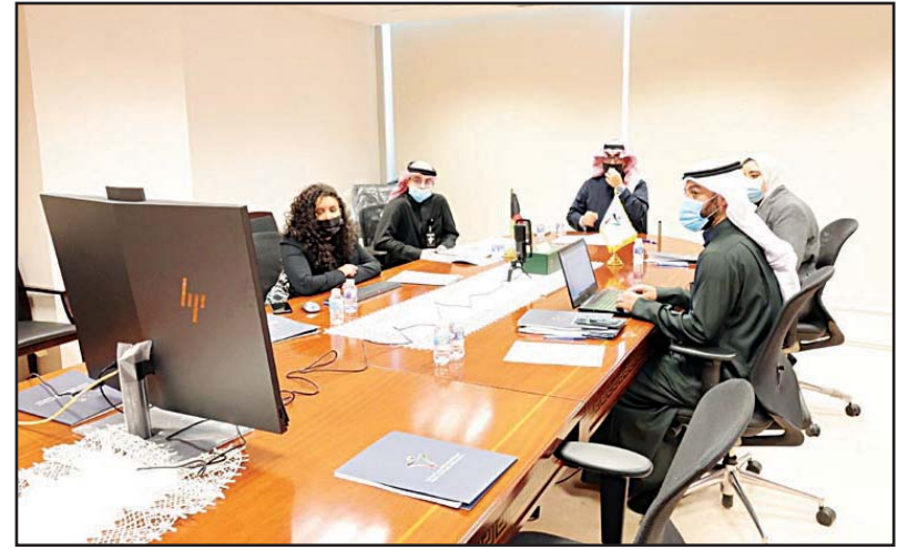
Kuwaiti PAM delegation in the presence of a representative of the Legal Department at the Ministry of Foreign Affairs and Labor.

The agency indicated that the liquid assets of the sovereign wealth fund in Kuwait amount to about 364 percent of the gross domestic product.