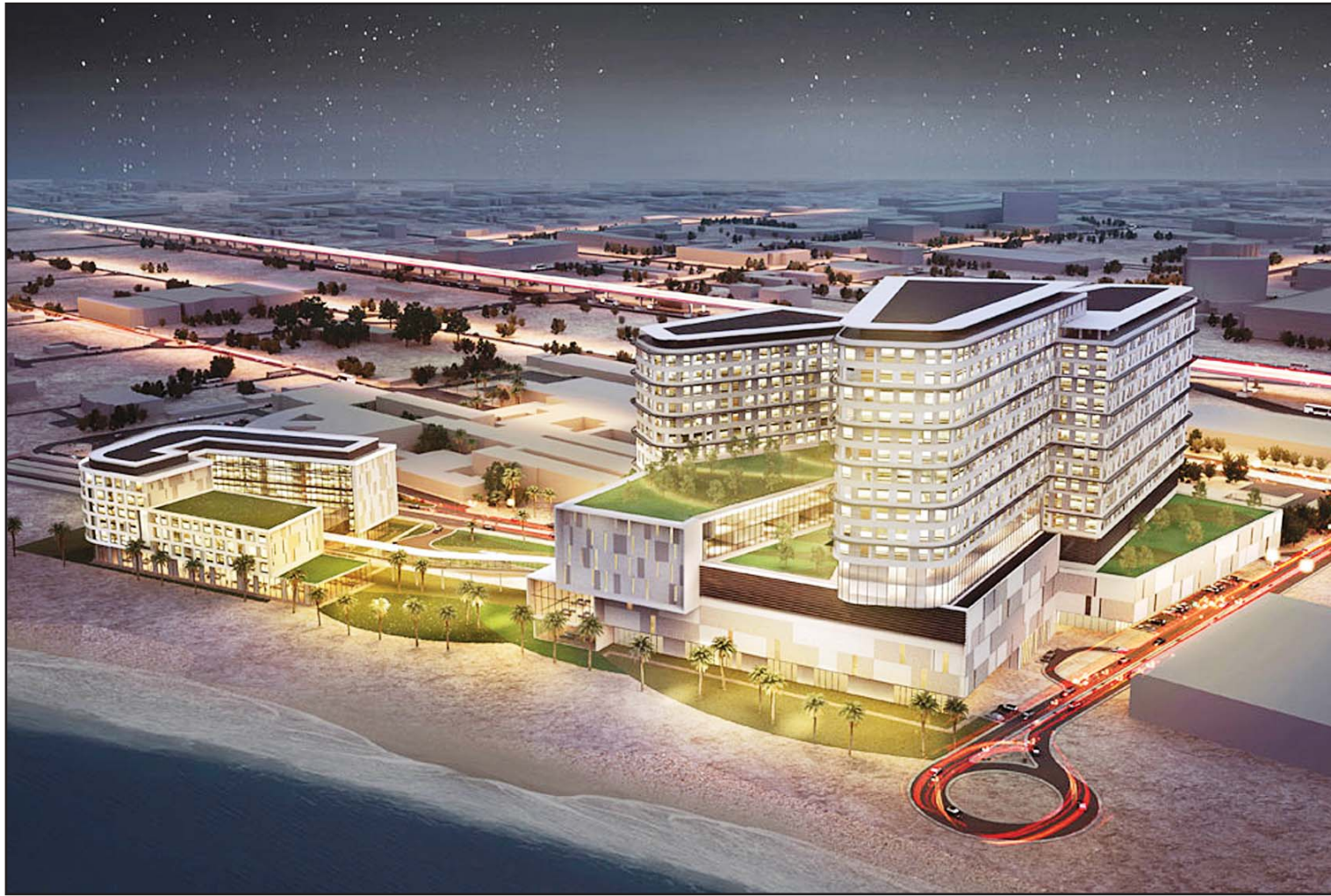
New Sabah Maternity Hospital