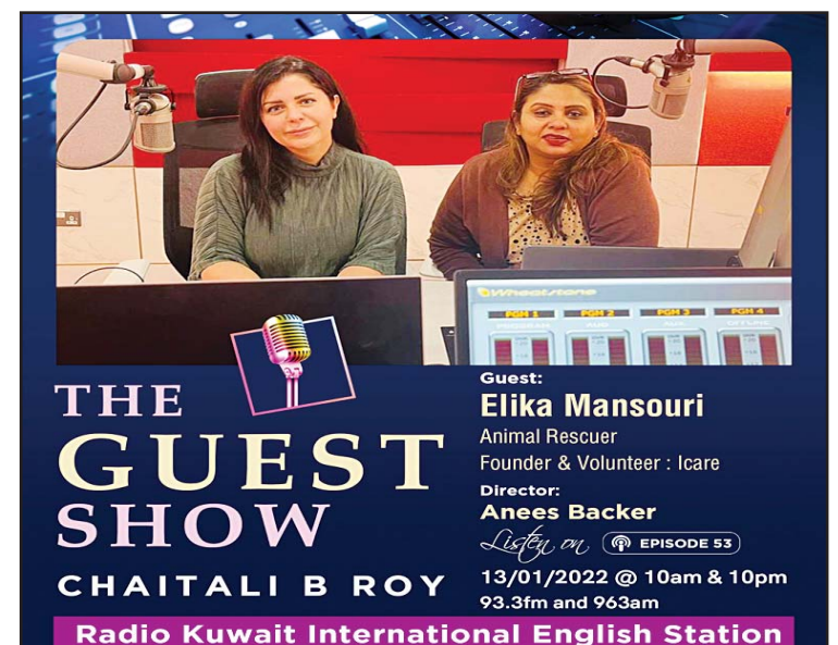
The Guest Show poster

This episode of The Guest Show (TGS) is a tribute to her and other animal rescuers in Kuwait who despite the odds refuse to give up and fight a daily battle to help animals in distress. Tune in this Thursday.