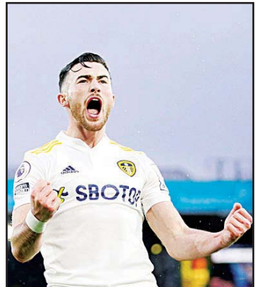
Leeds United's Jack Harrison celebrates scoring his side's first goal of the game, during the English Premier League soccer match between Leeds United and Burnley, at Elland Road, in Leeds, England.

Frustratingly for the Gunners, they had been denied a first-half penalty before Saka swept in the 31st-minute opener after Martin Odegaard fell when caught by Ederson's left boot but the goalkeeper did appear to get the ball first.