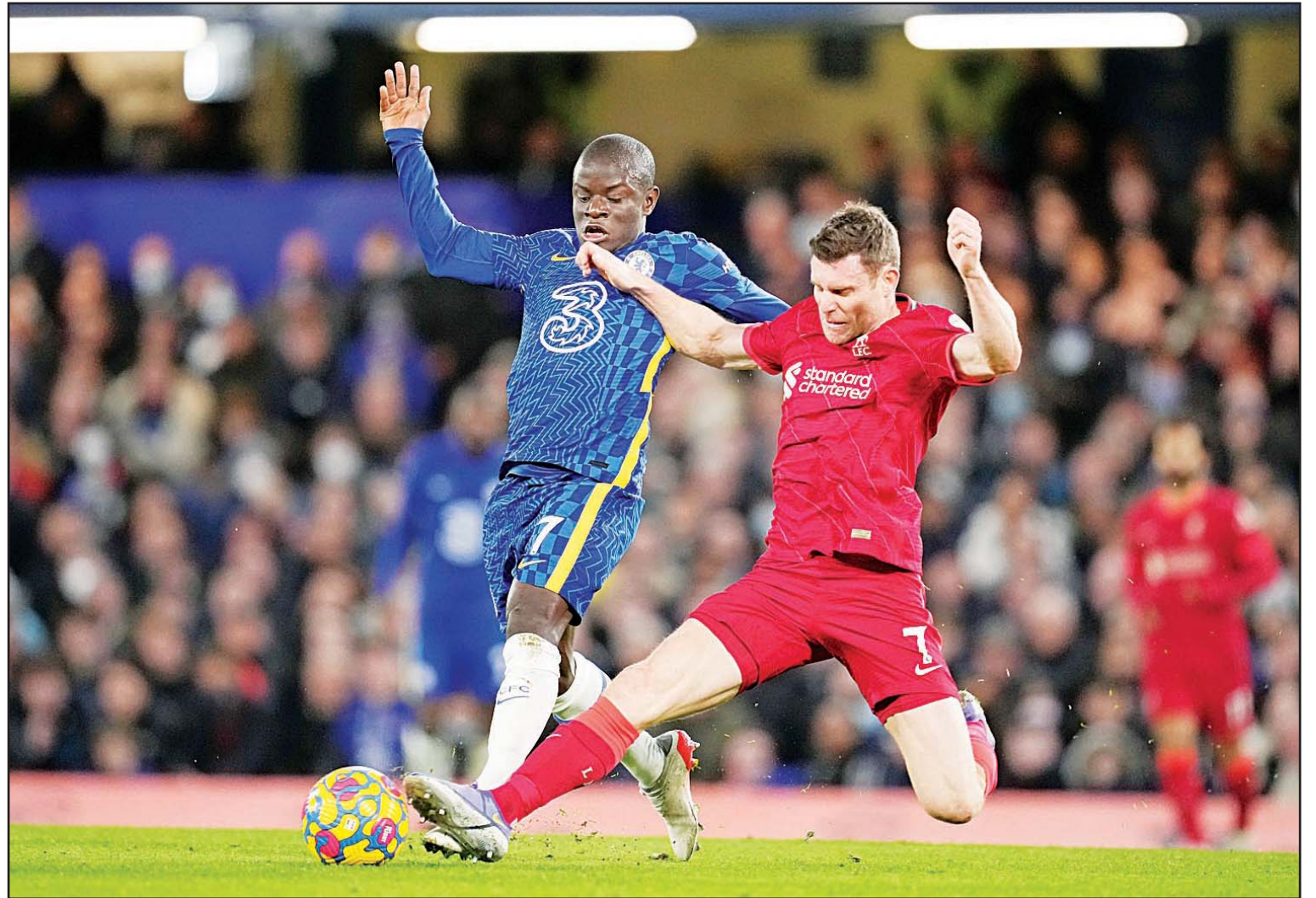
Liverpool's James Milner (right), tackles Chelsea's N'Golo Kante during the English Premier League soccer match between Chelsea and Liverpool at Stamford Bridge in London.