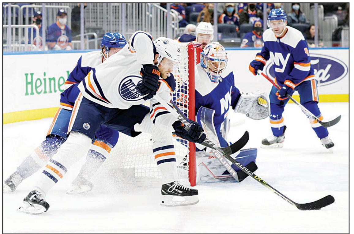
Edmonton Oilers center Leon Draisaitl (29) shoots on New York Islanders goaltender Ilya Sorokin (30) during the first period of an NHL hockey game, on Jan. 1, in Elmont, N.Y.

In Nashville, Tenn., Tanner Jeannot scored twice, Filip Forsberg and Ryan Johansen each had a goal and assist in