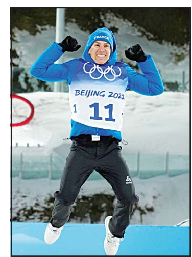
Quentin Fillon Maillet of France leaps on the podium after winning the men's 20-kilometer individual race at the 2022 Winter Olympics in Zhangjiakou, China.

American-born Eileen Gu of China cranked out the first 1620 of her career on her final jump, stunning France's Tess Ledeux and earning the first of what she hopes will be three gold medals in women's freestyle big air.