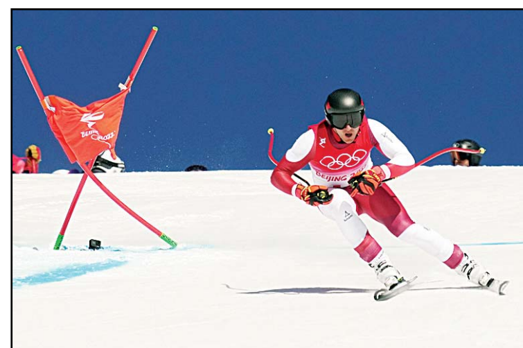
Matthias Mayer of Austria makes a turn during the men's super-G at the 2022 Winter Olympics in the Yanqing district of Beijing.

Athletic Bilbao host Valencia in the first leg of the other semifinal, with the Basque Country team trying to reach their third straight final.