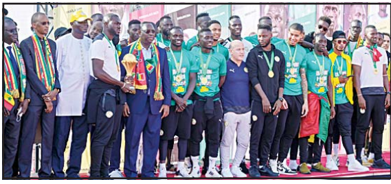
Senegal's President Macky Sall, 5th left, poses with the national football team after they arrived back at the airport in Dakar, Senegal. Senegal won their first African Cup Sunday by beating Egypt 4-2 in a penalty shootout with Sadio Mane scoring the decisive penalty.