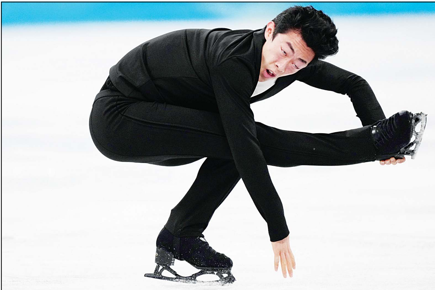
Nathan Chen of the United States, competes during the men's short program figure skating competition at the 2022 Winter Olympics in Beijing.

Latest sports scores at — http://sports.arabtimesonline.com