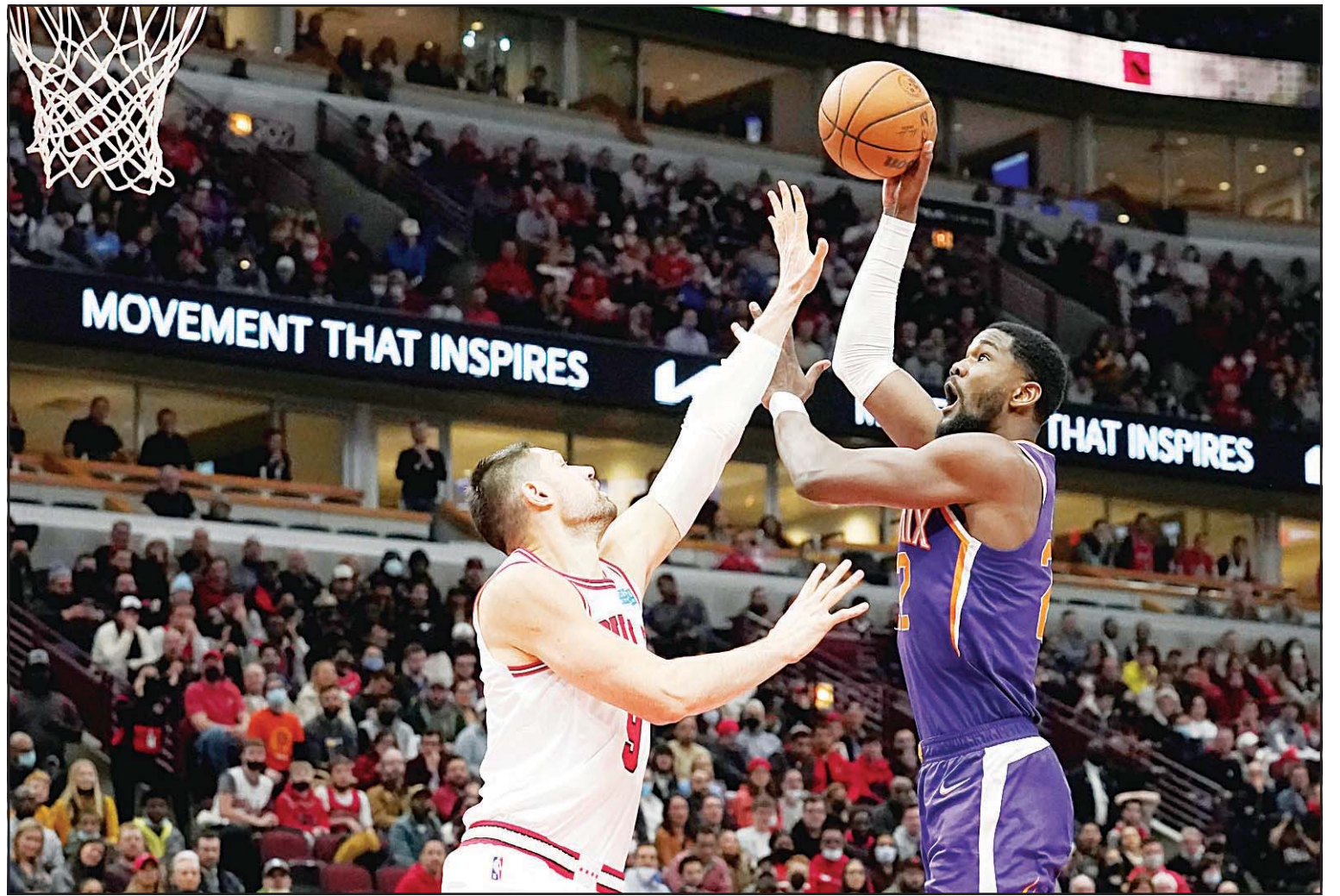
Phoenix Suns' Deandre Ayton shoots over Chicago Bulls' Nikola Vucevic during the second half of an NBA basketball game on Feb 7, in Chicago.

After the Thunder rallied late in the fourth quarter to cut their deficit to five, Thompson hit two 3-pointers - including one with just over a minute remaining - to put the Warriors up nine. Stephen Curry added 18 points, 10