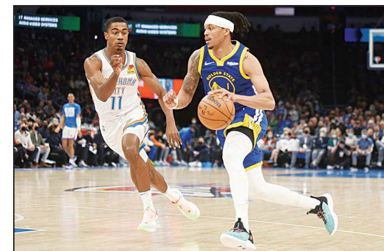
Golden State Warriors guard Damian Lee (1) pushes past Oklahoma City Thunder guard Theo Maledon (11) in the first half of an NBA basketball game, on Feb 7, in Oklahoma City.

Julius Randle scored 30 points to pace the Knicks. Mitchell Robinson added a season-high 19 points and a career-best 21 rebounds. R.J. Barrett had 23 points, seven rebounds and six assists, but New York lost its third straight.