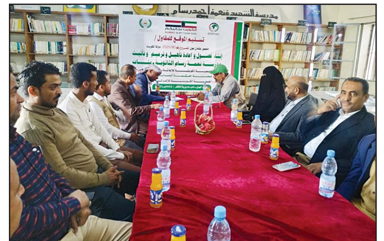
Part of the inauguration ceremony of a secondary school restoration project in the Yemeni city of Taiz as part of the 'Kuwait by your side' campaign.

He added that these measures will reduce the impact of harmful human and natural activities that lead to expanding arid areas in the country.