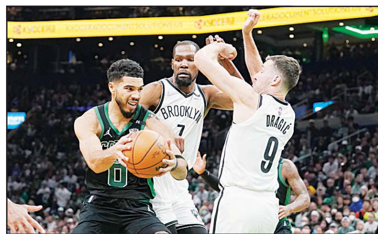
Boston Celtics forward Jayson Tatum (0) drives toward the basket past Brooklyn Nets forward Kevin Durant (7) and guard Goran Dragic, of Slovenia (9), in the first half of Game 1 of an NBA basketball first-round Eastern Conference playoff series in Boston. The Celtics won 115-114.