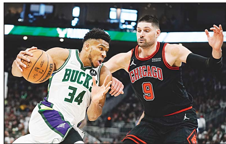
Milwaukee Bucks' Giannis Antetokounmpo tries to get past Chicago Bulls' Nikola Vucevic during the first half of Game 1 of their first round NBA playoff basketball game in Milwaukee.