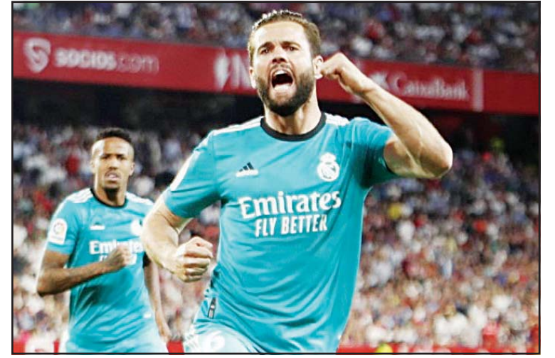
Real Madrid's Nacho celebrates after scoring his side's second goal during a Spanish La Liga soccer match between Sevilla and Real Madrid at the Ramon Sanchez Pizjuan stadium, in Seville, Spain.

Athletic Bilbao lost 2-0 at home to Celta Vigo to lose ground in the fight for a place in a European competition next season.