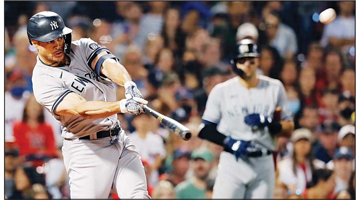
New York Yankees' Giancarlo Stanton hits a grand slam during the eighth inning of a baseball game against the Boston Red Sox, on Sept 25, in Boston.

Gallen (3-10), who hadn't won since Aug. 26 against Philadelphia, struck out