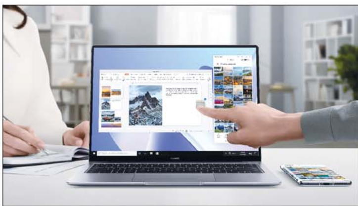
HUAWEI MateBook 14