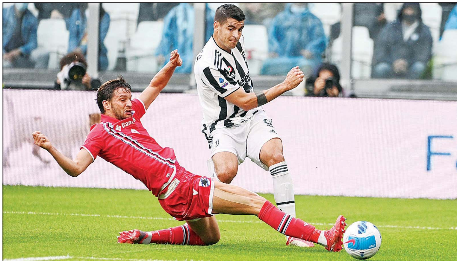
Juventus' Alvaro Morata, right, and Sampdoria's Bartosz Bereszynski fight for the ball during the Italian Serie A soccer match between Juventus and Sampdoria, in Turin, Italy, on Sept. 26.