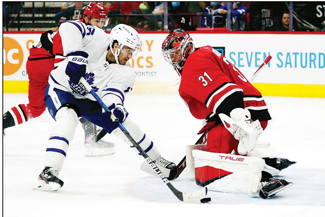
Toronto Maple Leafs' Alexander Kerfoot (15) has his shot blocked by Carolina Hurricanes goaltender Frederik Andersen (31) during the third period of an NHL hockey game in Raleigh, N.C., on Oct. 25.

Backlund each had a goal and an assist, and Christopher Tanev also scored for Calgary. Johnny Gaudreau got his seventh assist of the season, and Jacob Markstrom stopped 28 shots.