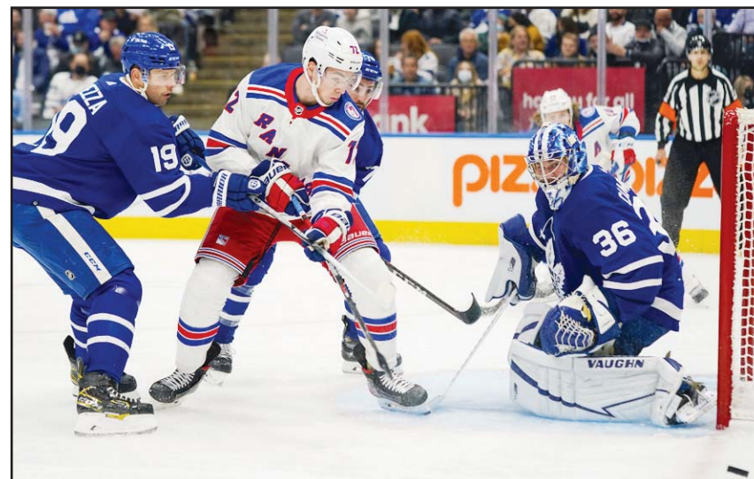
New York Rangers forward Filip Chytil (72) is tied up by Toronto Maple Leafs forward Jason Spezza (19) and TJ Brodie (78) as Maple Leafs goaltender Jack Campbell (36) makes a save during first-period NHL hockey game action in Toronto, on Oct 18.

Hakstol was hired by the Flyers in 2015 out of a college job at North Dakota. He was fired in December 2018 after he went 134-101-42, coaching the third-most games in franchise history behind Fred Shero and Mike Keenan - and the most for the Flyers without winning a playoff series.