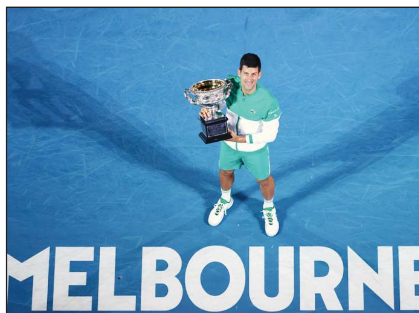
In this, Feb 21, 2021, file photo Serbia's Novak Djokovic holds the Norman Brookes Challenge Cup after defeating Russia's Daniil Medvedev in the men's singles final at the Australian Open tennis championship in Melbourne, Australia.

But the league did determine that Kane violated the COVID-19 protocols. A person familiar with the investigation said earlier this month that the league was looking into allegations that Kane submitted a fake vaccination card.