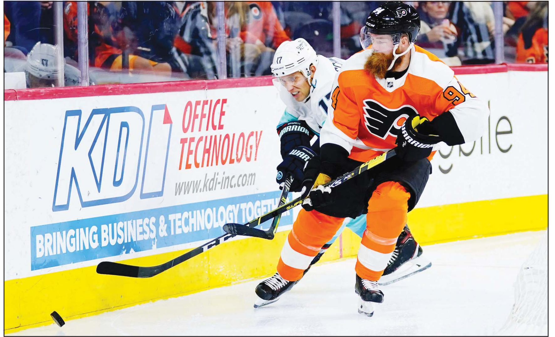
Seattle Kraken's Jaden Schwartz, (left), and Philadelphia Flyers' Ryan Ellis battle for the puck during the third period of an NHL hockey game, on Oct. 18, in Philadelphia.