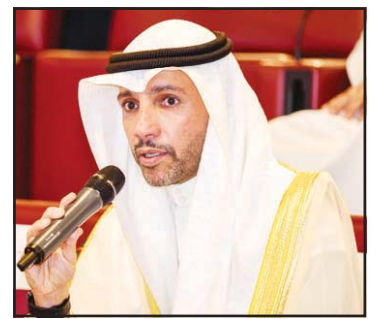
National Assembly Speaker Marzouq Ali Al-Ghanim during his speech at the conference.

Participants will compete in 15 competitions, he said in statements to