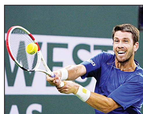
Cameron Norrie of Britain returns to Nikoloz Basilashvili of Georgia in the singles final at the BNP Paribas Open tennis tournament, on Oct. 17, in Indian Wells, Calif.

Norrie, Ivan Ljubicic in 2019, Alex Corretja in 2000 and Jim Courier in 1991 - all were ranked 26th - won the title while ranked outside the Top 25 since