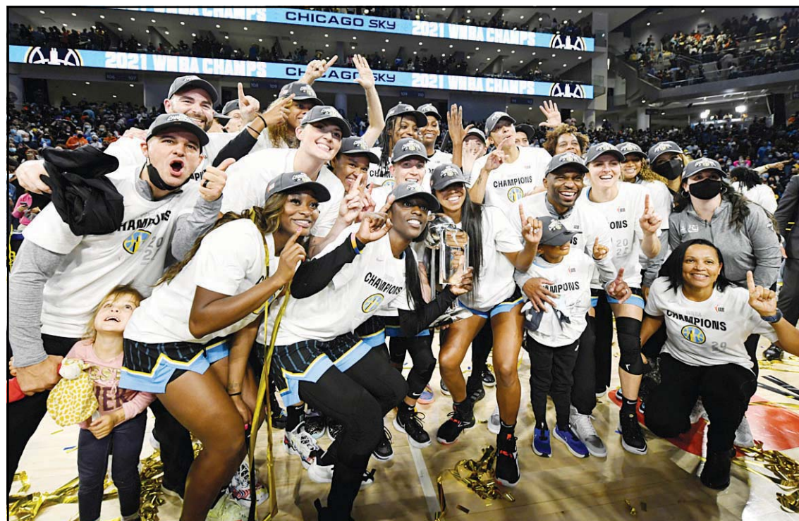
Members of the Chicago Sky pose for a photo after defeating the Phoenix Mercury in Game 4 of the WNBA Finals, on Oct. 17, in Chicago.