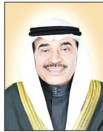
HH PM Sheikh Sabah Al-Khaled