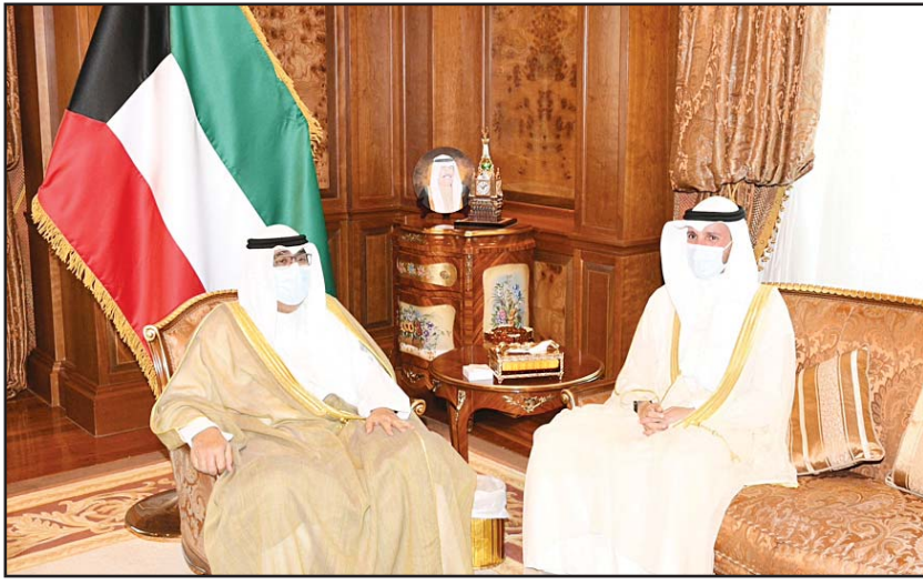
HH the Crown Prince receives Speaker Al-Ghanim.

Cooperation with health sectors vital: Lieut-Gen Al-Nawaf