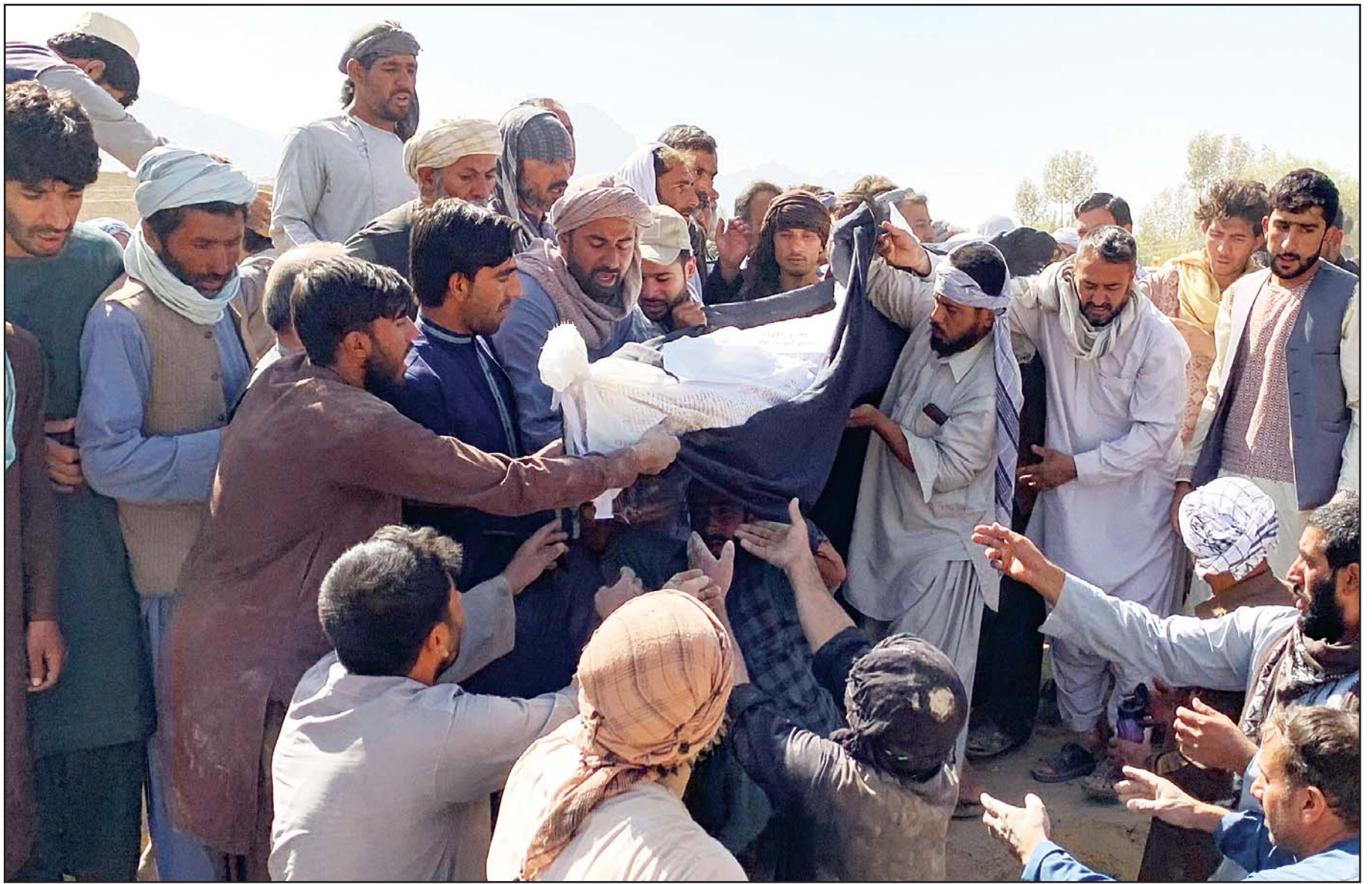
Relatives carry the body of a victim of Friday's suicide attack during a mass funeral in Kandahar, Afghanistan, Saturday, Oct. 16. The Islamic State group claimed responsibility for a deadly suicide bombing on a Shiite mosque that killed dozens of people and wounded scores more.