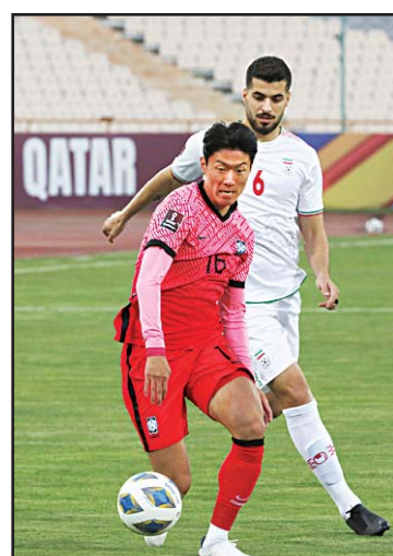
South Korea's Hwang Ui Jo, left, plays the ball followed by Iran's Saeid Ezatolahi during the final round of the Asian zone qualifying soccer match for the FIFA World Cup Qatar 2022 at Azadi Stadium in Tehran, Iran, on Oct. 12.

Bull," Hwang scored that superb individual goal and then set up one for Minamino - now a Liverpool player - to leave Jurgen Klopp awestruck with his energy and direct running. According to Hwang, Liverpool's manager came up to him after the match and called him a "machine."