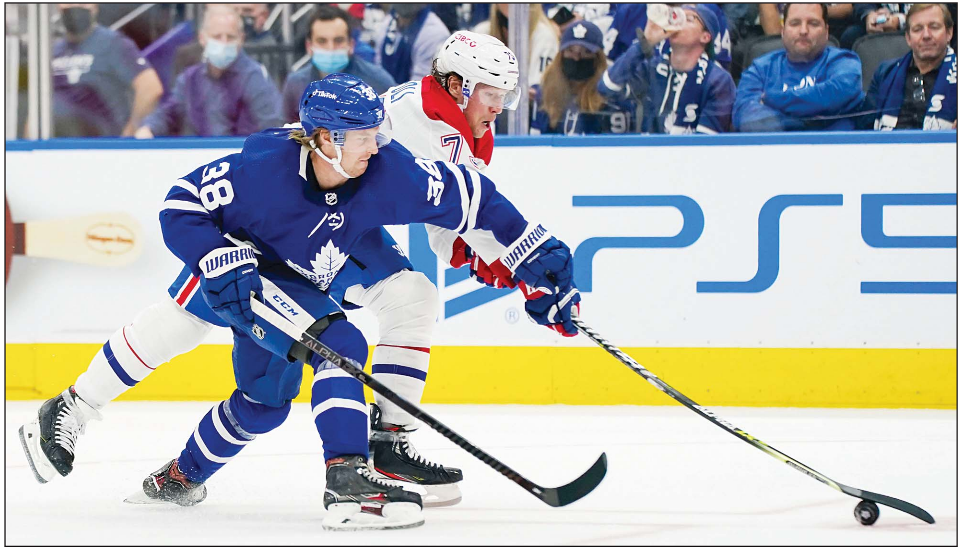
Toronto Maple Leafs defenseman Rasmus Sandin (38) holds on to Montreal Canadiens forward Tyler Toffoli's (73) stick during the third period of an NHL hockey game in Toronto on Oct. 13.

Nylander breaks 3rd-period tie, Leafs beat Canadiens