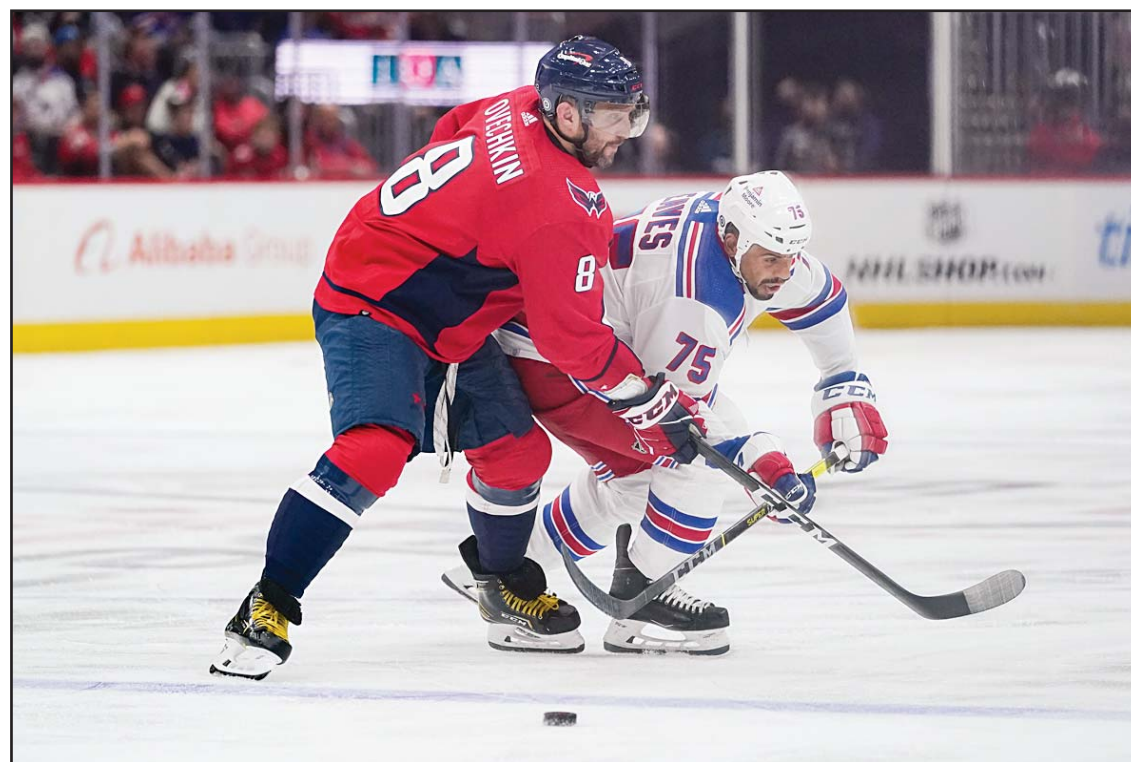
Washington Capitals left wing Alex Ovechkin (8) and New York Rangers right wing Ryan Reaves (75) can't get to the puck during the second period of an NHL hockey game on Oct. 13, in Washington.

Oliver Ekman-Larsson and Quinn Hughes scored for the Canucks. Thatcher Demko made 32 saves.