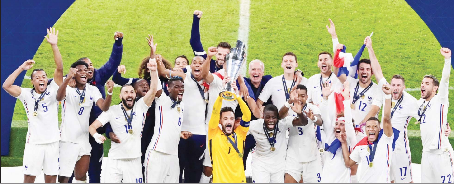
French players react with their trophy after defeating Spain to win the UEFA Nations League final soccer match at the San Siro stadium, in Milan, Italy. (AP)

SAO PAULO, Oct 11, (AP) — Lionel Messi was among the scorers as Argentina beat rivals Uruguay 3-0 on Sunday, hours after Brazil's run of consecutive wins in South American World Cup qualifying ended in a 0-0 draw with Colombia.