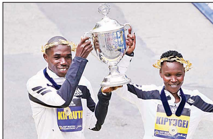
Benson Kipruto, (left) and Diana Kipyogei, (right), both of Kenya, celebrate at the finish line after winning the men's and women's division of the Boston Marathon in Boston.