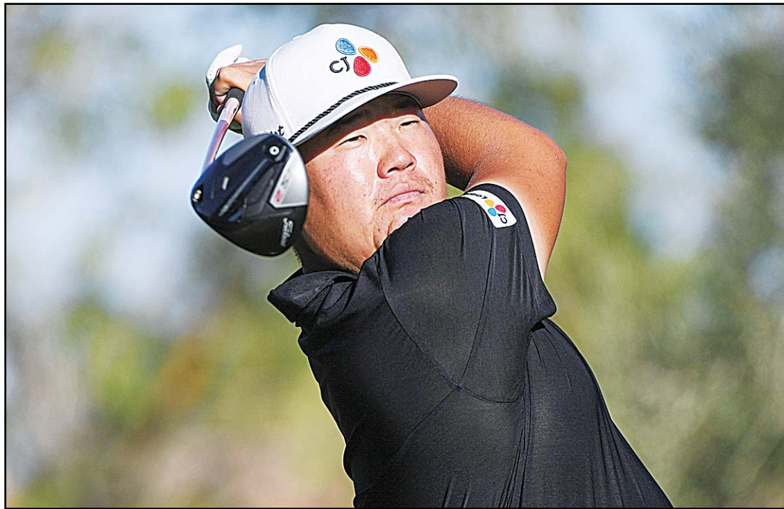
Sungjae Im watches his drive during the Shriners Children's Open golf tournament on Oct. 10 at TPC Summerlin in Las Vegas.

In Las Vegas, Sungjae Im turned a shootout into a one-man show in Las Vegas, running the tables with seven birdies in eight holes around the turn for a 9-under 62 and a four-shot victory in the Shriners Children's Open.