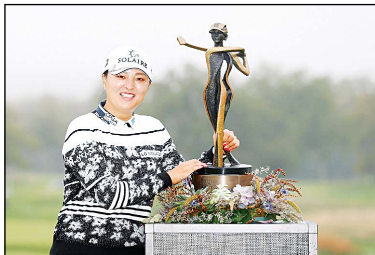
Jin Young Ko of Korea with the trophy after winning the Cognizant Founders Cup, on Oct. 10, in West Caldwell, N.J.