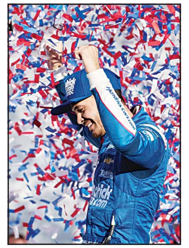
Kyle Larson celebrates in Victory Lane after winning a NASCAR Cup Series auto racing race at Charlotte Motor Speedway, on Oct. 10, in Concord, N.C.

when he began to lose power in his Chevrolet and had to make multiple pit stops to address the electrical issues. A lengthy change of his alternator belt saved his race and staved off his own startling flirtation with an early playoff exit.