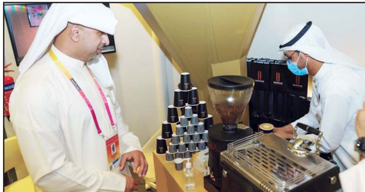
One of the food projects participating in Expo Dubai 2020.

and achieve the required diversity of cultural exchange.