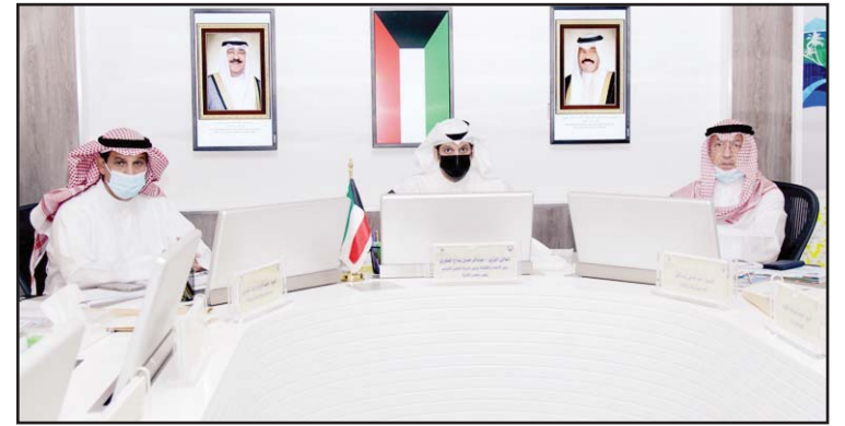
Minister of Information and Culture and Minister of State for Youth Affairs Abdul Rahman Al-Mutairi chairs the 17th meeting of the Board of Directors of the Public Authority for Sports.

The foods doled out range from entrees like Machboos, a rice-based dish, to a variety of famous Kuwaiti desserts.